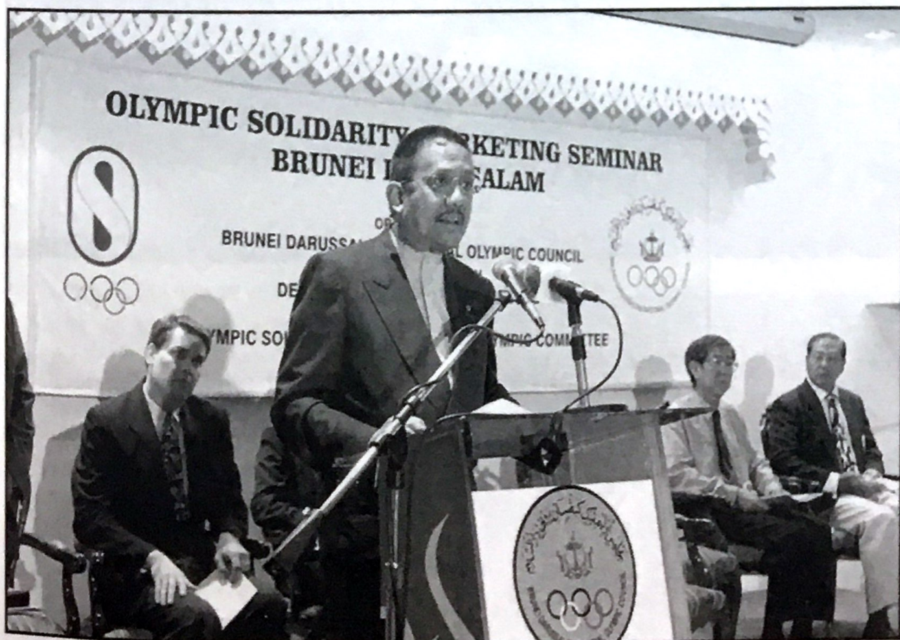
The President of Brunei Darussalam's National Olympic Council, His Royal Highness Prince Haji Sufri Bolkiah speaking on the importance of sports marketing towards elevating sporting standards.