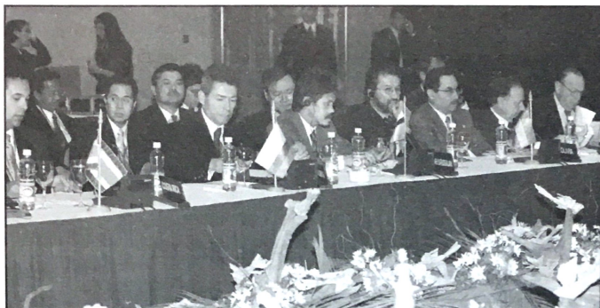
Above, The Minister of Foreign Affairs, His Royal Highness Prince Mohamed Bolkiah, second from left front row, at the final plenary session of the first meeting of FEALAC held in the Chilean capital, Santiago. Ministers and heads of delegation attending the FEALAC Meeting in a group photograph, below.