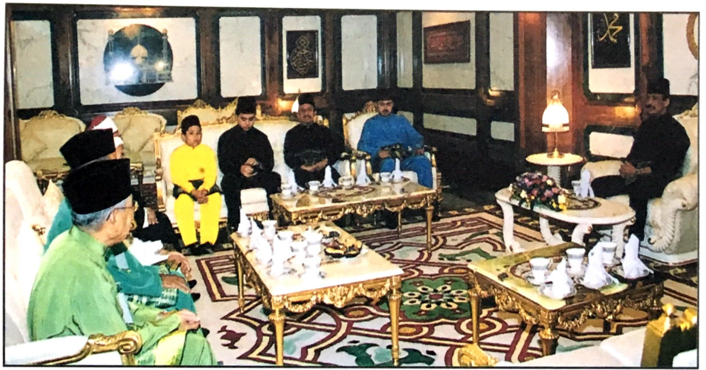
His Majesty The Sultan and Yang Di-Pertuan of Brunei Darussalam along with, right to left facing the camera, Their Royal Highnesses Crown Prince Haji Al-Muhtadee Billah, Prince Haji Sufri Bolkiah, Prince 'Abdul Malik and Prince 'Abdul Mateen having an informal conversation with the three recipients of the tokoh Hijrah award.

The celebration marking the new year Hijrah took place at the Jame' 'Asr Hassanil Bolkiah mosque the next day at Kiulap just outside the capital, Bandar Seri Begawan, and was highlighted with the presentation of awards by the ruler to three people who had contributed much to the development of Islam in the country over the years.