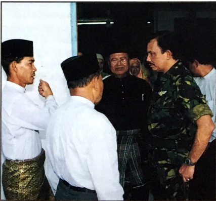
His Majesty chats with the pengulu of Mukim Pengkalan Batu and those of villagers under the mukim, above. Right: The ruler watches pupils at work during a computer class at the Penglima Barudin Primary School.