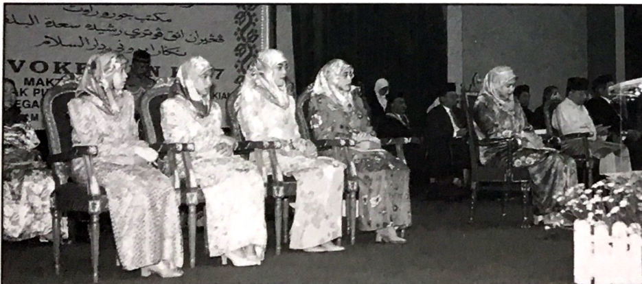
Her Royal Highness Princess Hajjah Rashidah Sa'adatul Bolkiah presents certificate to one of the graduates during the Princess Rashidah Sa'adatul Bolkiah College of Nursing's seventh graduation ceremony, above, which was also attended by other members of the royal family, left.