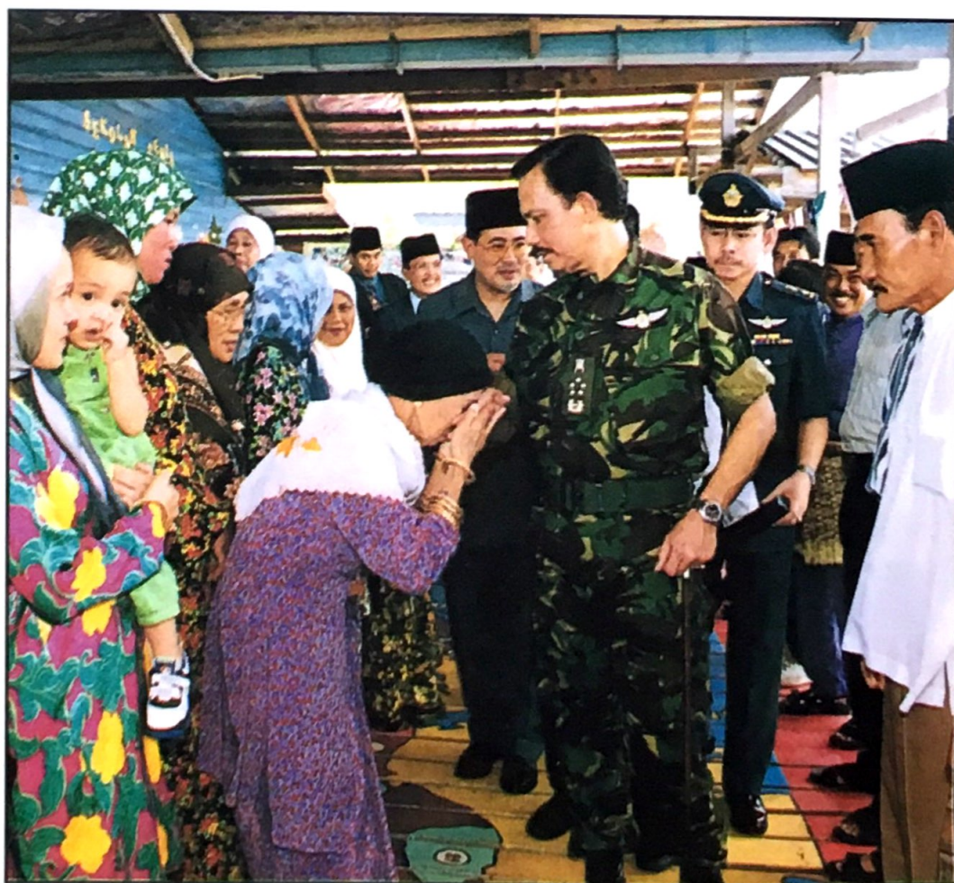
His Majesty giving a quick test to a pupil as he went from one classroom to another while on a tour of the Kampong Batu Marang Primary School, left, while above shows the ruler chatting informally with residents who had turned up in large numbers to greet him.