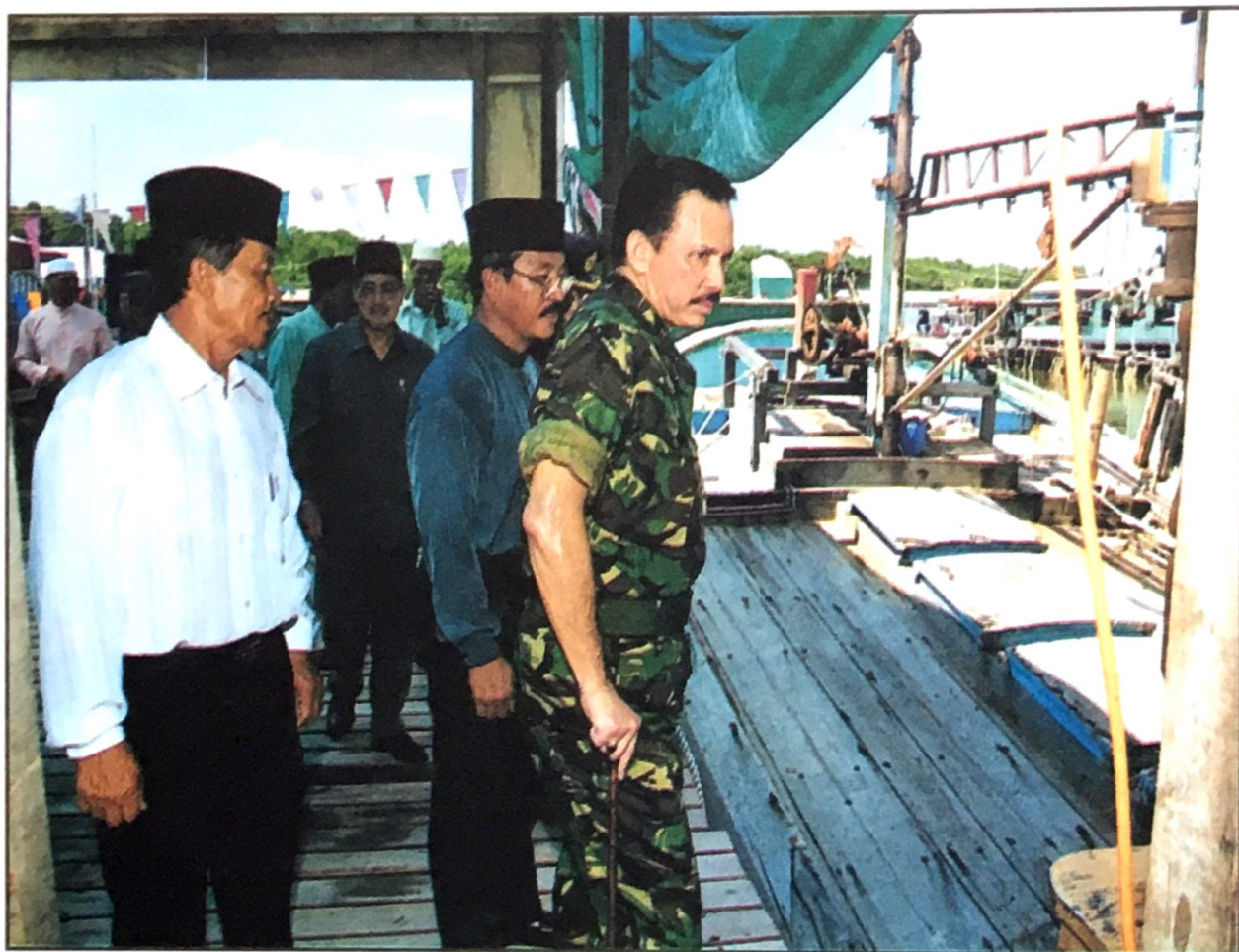
Above, The Sultan and Yang Di-Pertuan of Brunei Darussalam takes a close look at some of the fishing facilities and equipment used by the Kampong Batu Marang residents, many of whom are fishermen by tradition.