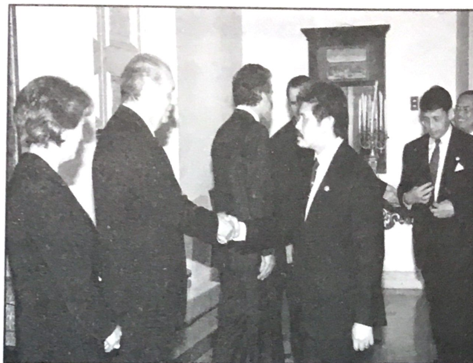
The Chilean President, His Excellency Ricardo Lagos and his wife greeting His Royal Highness Prince Mohamed Bolkiah on arrival at the Presidential Palace in Santiago for luncheon they hosted in honour of ministers and delegates attending the first FEALAC Meeting.

Brunei Darussalam and Chile established diplomatic relations in 1984. Trade cooperation between the two countries began in 1977 when Chile exported its goods such as, foodstuffs, manufactured goods and tobacco to Brunei Darussalam. Besides being a member of FEALAC, Chile, Peru and Mexico are also members of Asia-Pacific Eco-