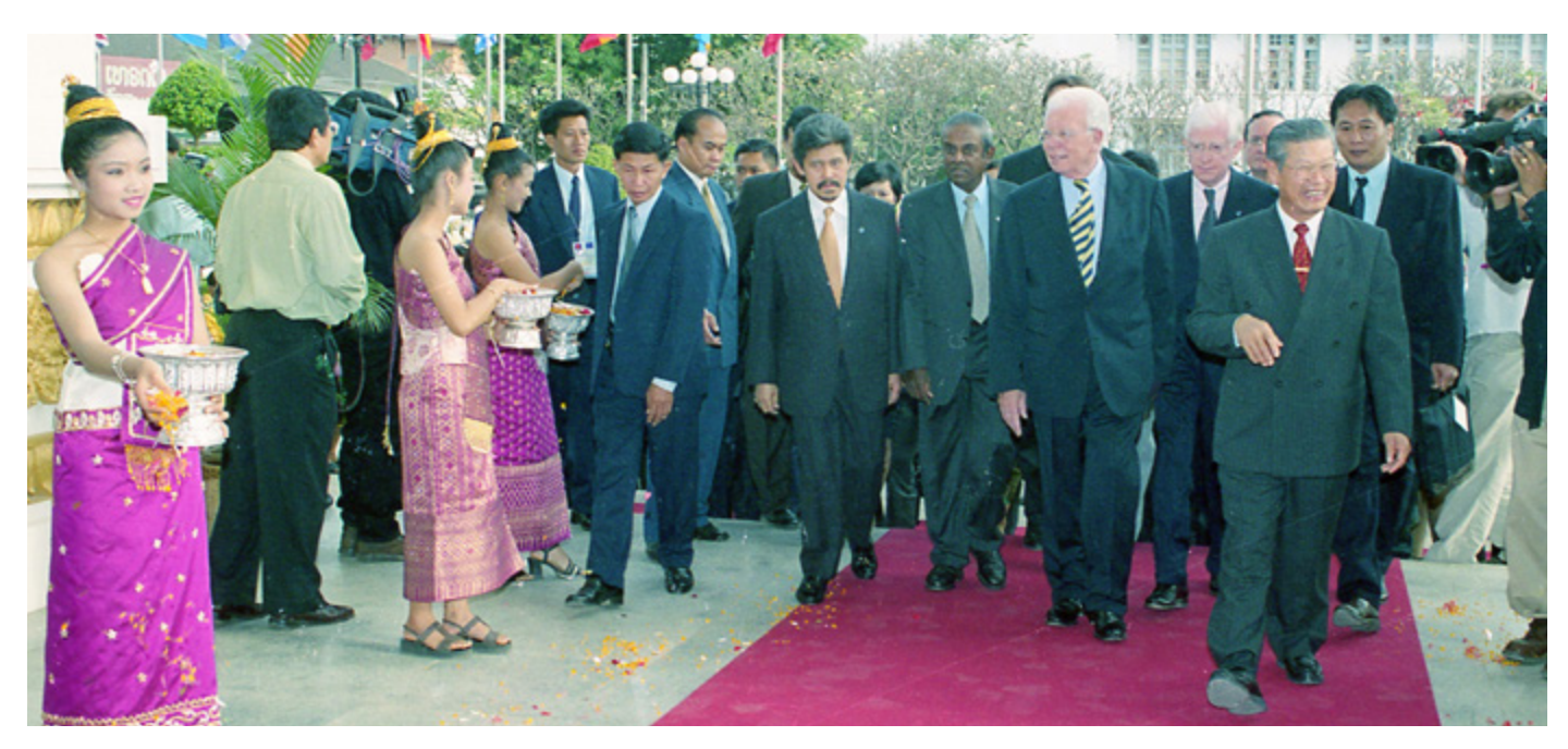
His Royal Highness Prince Mohamed Bolkiah ibni Al-Marhum Sultan Haji Omar 'Ali Saifuddien Sa'adul Khairi Waddien, Minister of Foreign Affairs with other Foreign Ministers of ASEAN and the European Union (EU) during their arrival at the Official Opening Ceremony of the 13th ASEAN-EU Ministerial Meeting.

VIENTIANE, December 11 - His Royal Highness Prince Mohamed Bolkiah ibni Al-Marhum Sultan Haji Omar 'Ali Saifuddien Sa'adul Khairi Waddien, Minister of Foreign Affairs attended the Official Opening Ceremony of the 13th ASEAN-European Union (EU) Ministerial Meeting (AEMM) at the National Culture Hall.