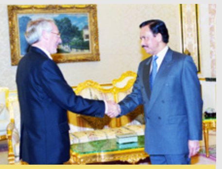
3 His Majesty receives audience

Facebook - Jabatan Penerangan Jabatan Perdana Menteri Brunei Darussalam