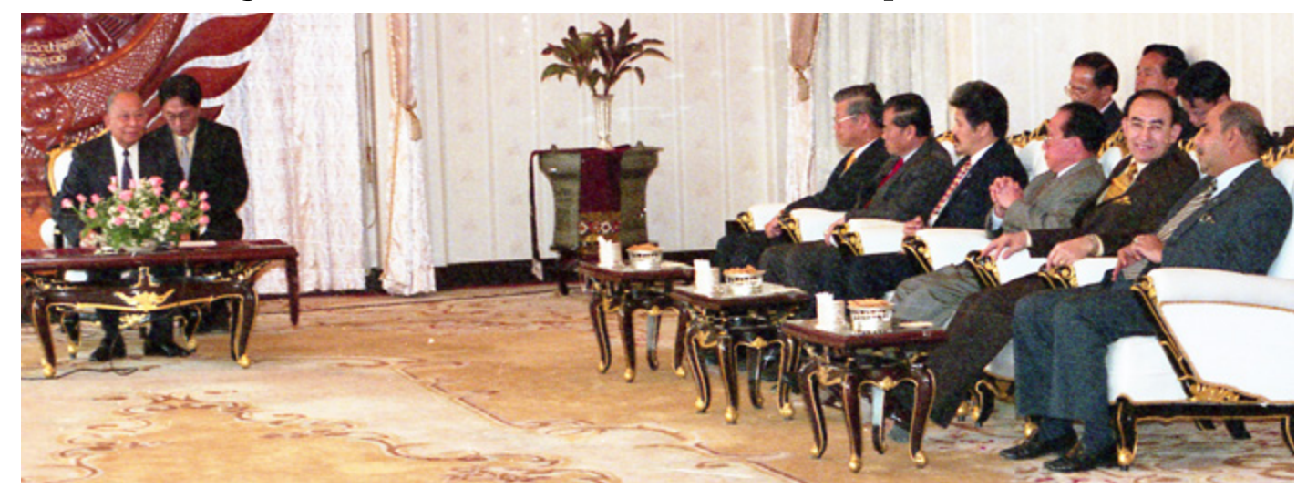
His Royal Highness Prince Mohamed Bolkiah ibni Al-Marhum Sultan Haji Omar 'Ali Saifuddien Sa'adul Khairi Waddien, Minister of Foreign Affairs together with ASEAN Foreign Ministers during the courtesy call to His Excellency Khamtay Siphandone, President of the People's Democratic Republic of Lao.

VIENTIANE, December 12 - His Royal Highness Prince Mohamed Bolkiah ibni Al-Marhum Sultan Haji Omar 'Ali Saifuddien Sa'adul Khairi Waddien, Minister of Foreign Affairs and Her Royal Highness Pengiran Anak Isteri Anak Hajah Zariah, along Foreign Ministers of ASEAN and European Union (EU) made a courtesy call to His Excellency Khamtay Siphandone, President of the People's Democratic Republic Lao and spouse at the Presidential (Hor' Kham).