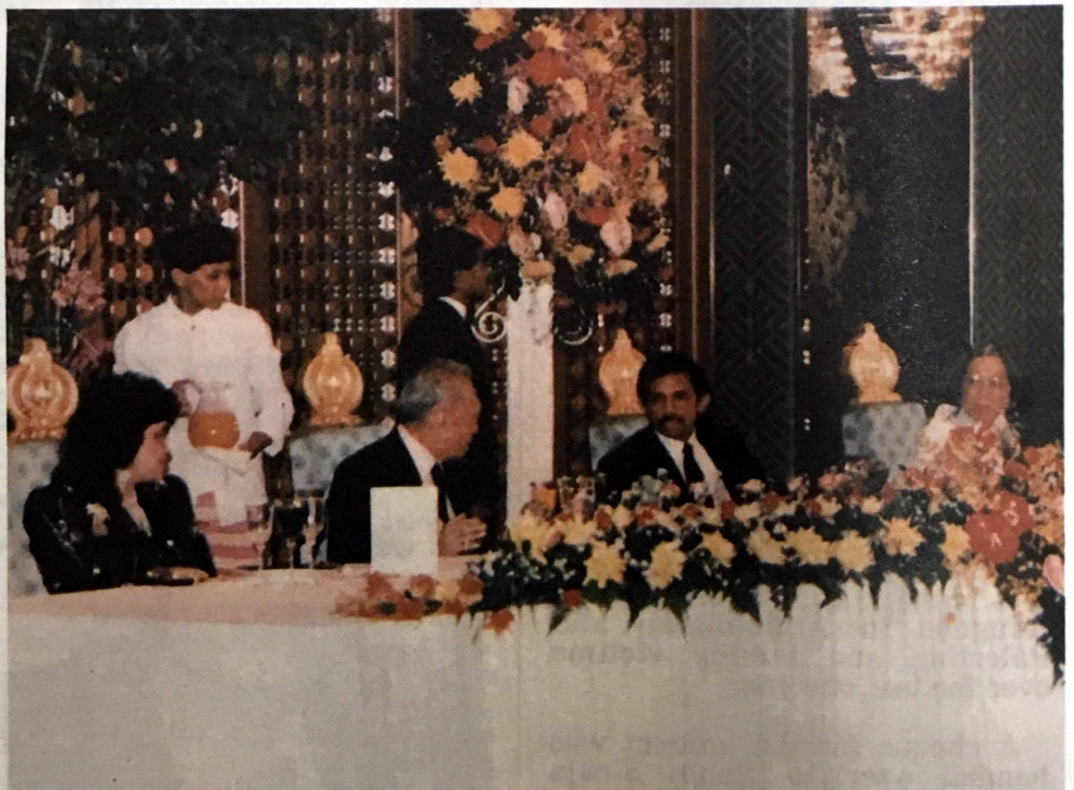
His Excellency Prime Minister Lee and his wife were guests of honour at a private dinner hosted at the Nurul Iman Palace. L to R: Her Majesty Raja Isteri Pengiran Anak Saleha, His Excellency Mr Lee Kuan Yew, His Majesty Sultan Hassanal Bolkiah Mu'izzaddin Waddaulah and Mrs Lee.