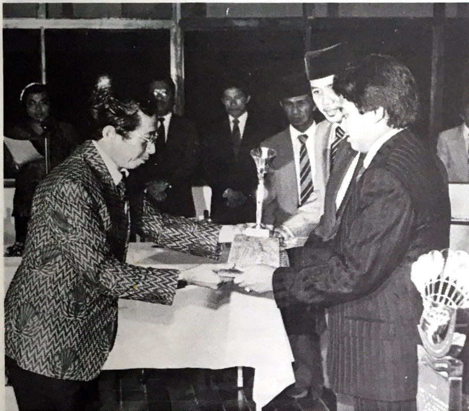
HRH Prince Al-Muhtadee Billah (right) presents a replica of the Sultan Hassanal Bolkiah trophy to an Indonesian representative.

T he 24k gold-plated Sultan Hassanal Bolkiah trophy worth $25,000 went to Indonesia after defeating Malaysia 3-2 in the finals of the ASEAN Invitational Badminton Championship, held in the capital Bandar Seri Begawan on August 20, 1986.