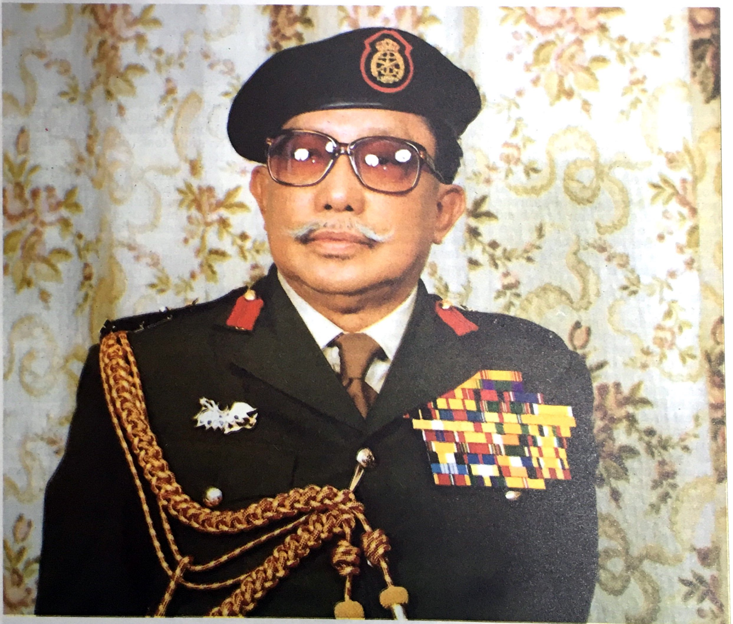
The late Sultan Haji Omar Ali Saifuddien Saadul Khairi Waddien ibni Almarhum Sultan Mohammad Jamalul Alam. D.K.M.B., D.K., G.C.V.O., K.C.M.G., P.S.S.U.B., P.H.B.S., P.B.L.I.

• see story and pictures on pages 2 and 3