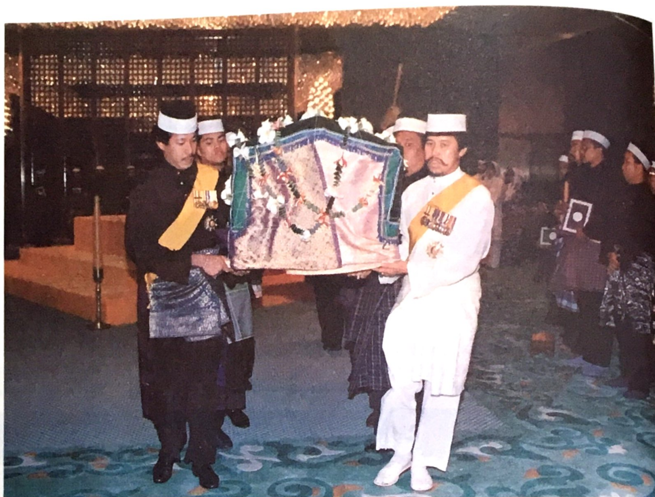
The late Sultan's sons bear their father from the lying-in-state at the Nurul Iman Palace to the hearse

Truly the nation does mourn, and will much longer than, the official forty days.