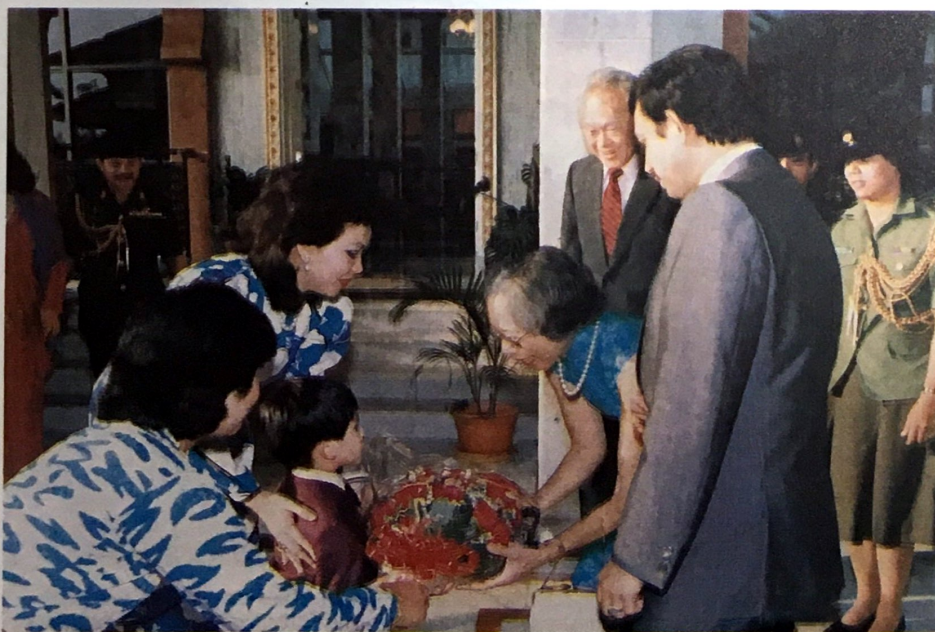
Mr and Mrs Lee Kuan Yew were received at the Nurul Izzah Palace. Second from left is Her Royal Highness Pengiran Isteri Hajjah Mariam.