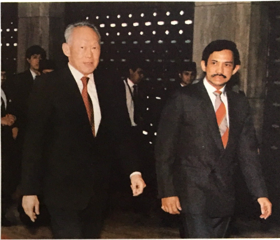
His Majesty Sultan Hassanal Bolkiah Mu'izzaddin Waddaulah, Sultan and Yang Di-Pertuan Negara Brunei Darussalam (right) with His Excellency Prime Minister Lee Kuan Yew of the Republic of Singapore (left) during the latter's visit to Brunei Darussalam.