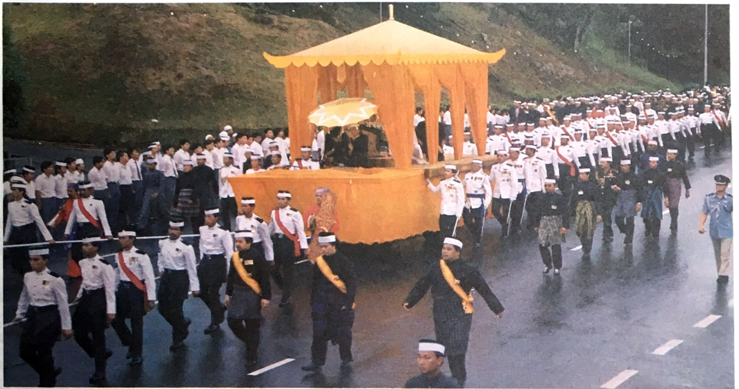
The hand-drawn carriage bearing the late Sultan Haji Omar Ali Saifuddien Saadul Khairi Waddien heads towards the royal mausoleum.

T he passing of the late Sultan Haji Omar Ali Saifuddien Saadul Khairi Waddien was announced to the nation shortly after midnight on September 8, 1986.