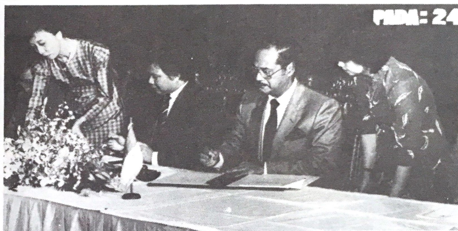
Pengiran Laila Kanun Diraja Pengiran Bahrin bin Pengiran Haji Abbas, the Law cum Communications Minister (second left) and His Excellency Bapak Roesmin Nurjadin, the Indonesian Communications Minister (third left) represented their respective governments at the signing ceremony.

Royal Brunei Airlines has been operating a twice weekly service to Jakarta since early 1984 based on a temporary permit issued by the Indonesian government.