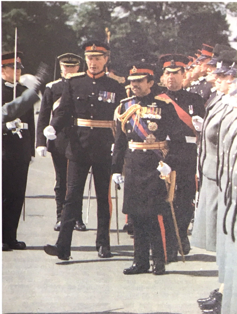
His Majesty Sultan Hassanal Bolkiah Mu'izzaddin Waddaulah, Sultan and Yang Di-Pertuan Negara Brunei Darussalam inspects women officer cadets at the Royal Military College, Sandhurst.

Among the notable Sandhurst graduates were Sir Winston Churchill and Field Marshall Lord Montgomery.