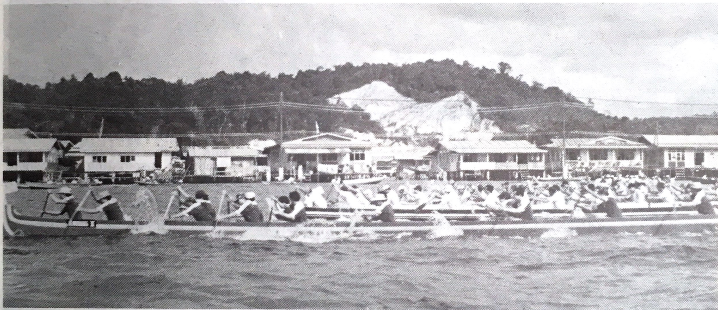
A flurry of paddles throw up a spray during a main regatta event.