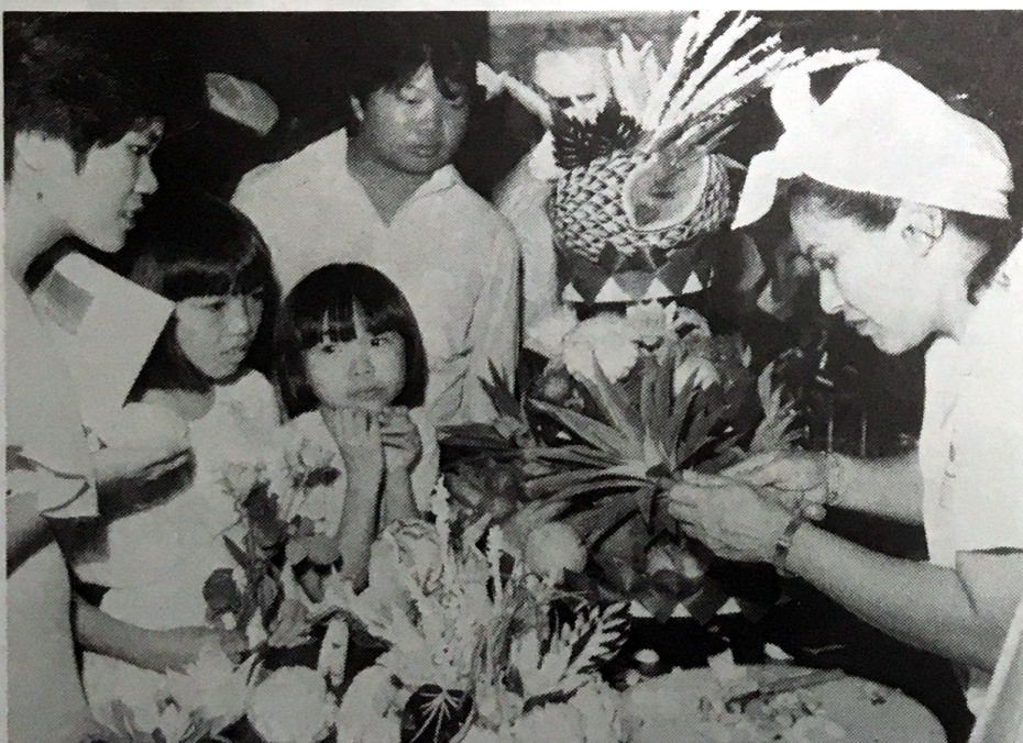
A Thai fruit-carving artist gives out a few pointers.

Fruit carving and decoration experts from the Hotel Caterers Association in Thailand gave demonstrations using many of the fruit, giving hostesses novel ideas on presentation. A similar fair held three years ago was completely sold out within hours.