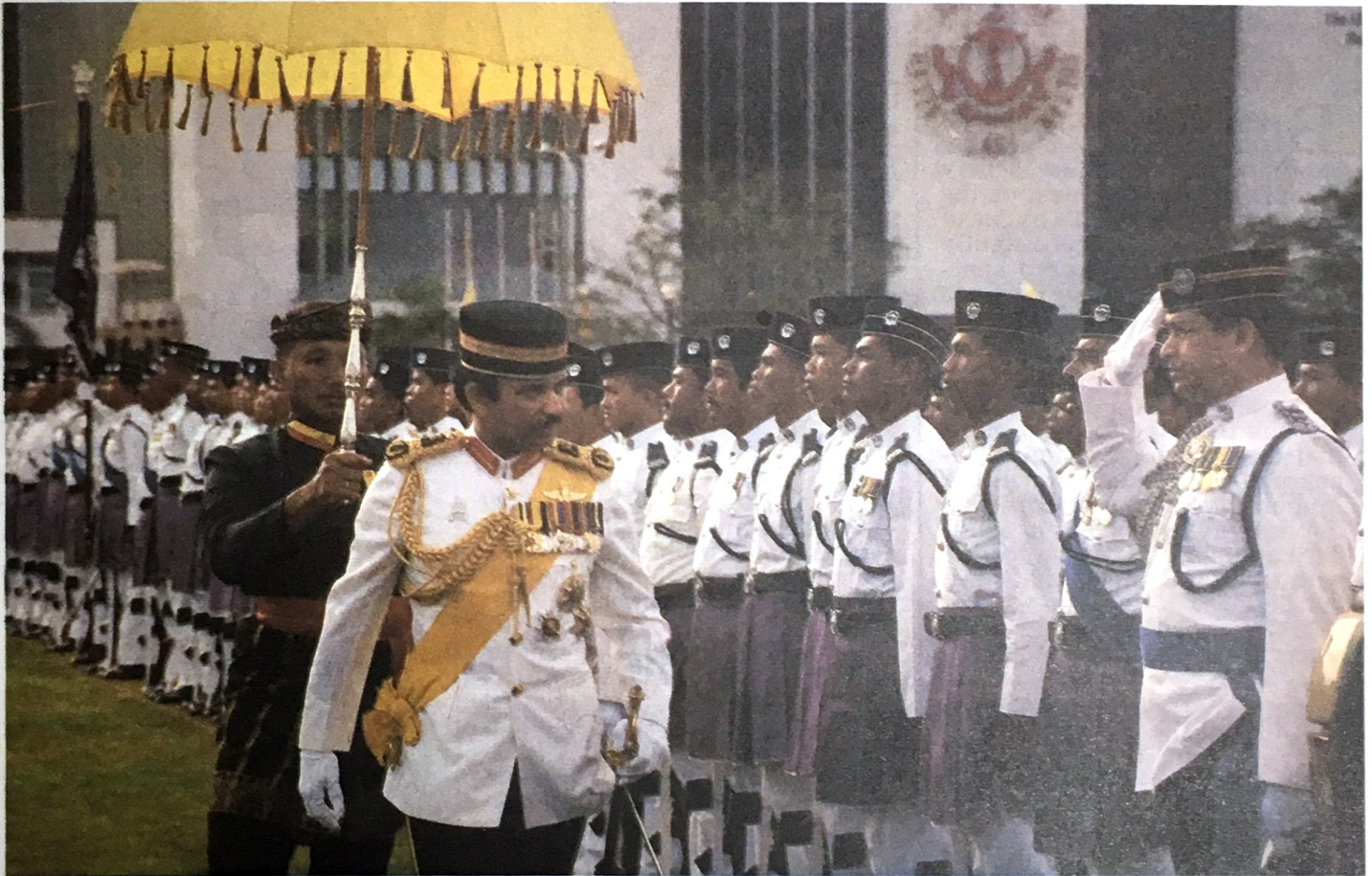
His Majesty Sultan Hassanal Bolkiah Mu'izzaddin Waddaulah, Sultan dan Yang Di-Pertuan Negara Brunei Darussalam inspects parade mounted to mark his 40th birthday celebrations.