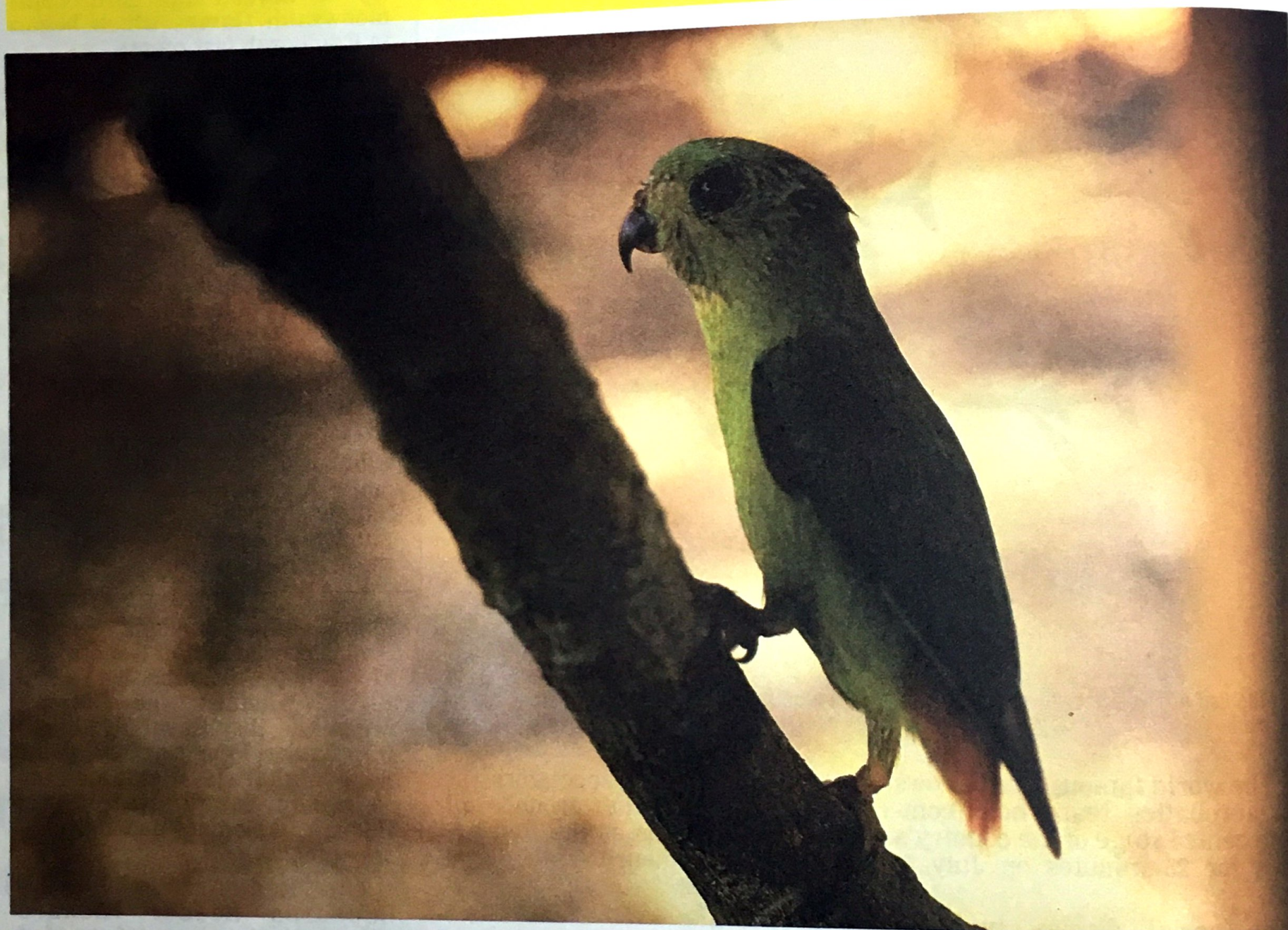
hj. Kamaluddin bin pdp. hj. abu bakar

They feed on flowers and the caged birds love honey and sweet food. They also thrive on padi or dry seed, picking at items delicately and with sensitive beakwork. Teripas are found in the lowlands and elsewhere on Borneo.