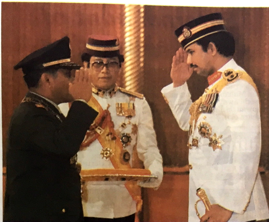
General L. Benny Moerdani Commander of the Indonesian Armed Forces (left) at the Lapau after receiving the Darjah Paduka Keberanian Laila Terbilang Yang Amat Gemilang, First Class from His Majesty Sultan Hassanal Bolkiah Mu'izzaddin Waddaulah, Sultan and Yang Di-Pertuan Negara Brunei Darussalam.

His Majesty Sultan Hassanal Bolkiah Mu'izzaddin Waddaulah, Sultan and Yang Di-Pertuan Negara Brunei Darussalam celebrated his 40th birthday on July 15, 1986. Traditionally His Majesty has on this occasion addressed his subjects advising them and reminding them of the national aspirations. We reproduce below the full text of his message translated from Malay.