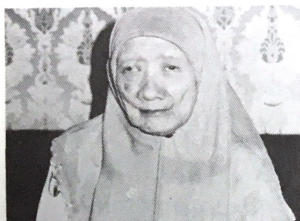
Yang Teramat Mulia Paduka Seri Pengiran Anak Puteri Hajjah Besar

Y ang Teramat Mulia Paduka Seri Pengiran Anak Puteri Hajjah Besar binti Almarhum Sultan Muhammad Jamalul Alam passed away in Bandar Seri Begawan on July 11, 1986. She was 85 years old.