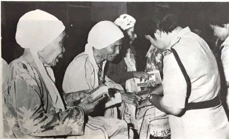
Intending pilgrims are checked by security personnel before boarding for Jeddah.