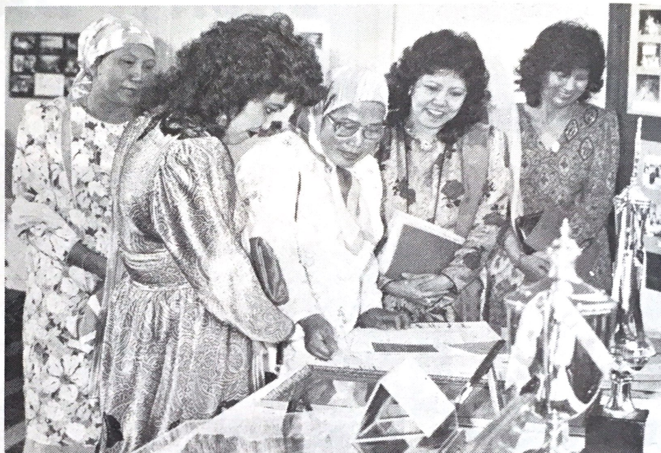
Her Majesty Raja Isteri Pengiran Anak Saleha views an exhibition featuring activities of the various organisations that are under the National Women's Council.

H er Majesty Raja Isteri Pengiran Anak Saleha has congratulated women in the country on the formation of the National Women's Council.