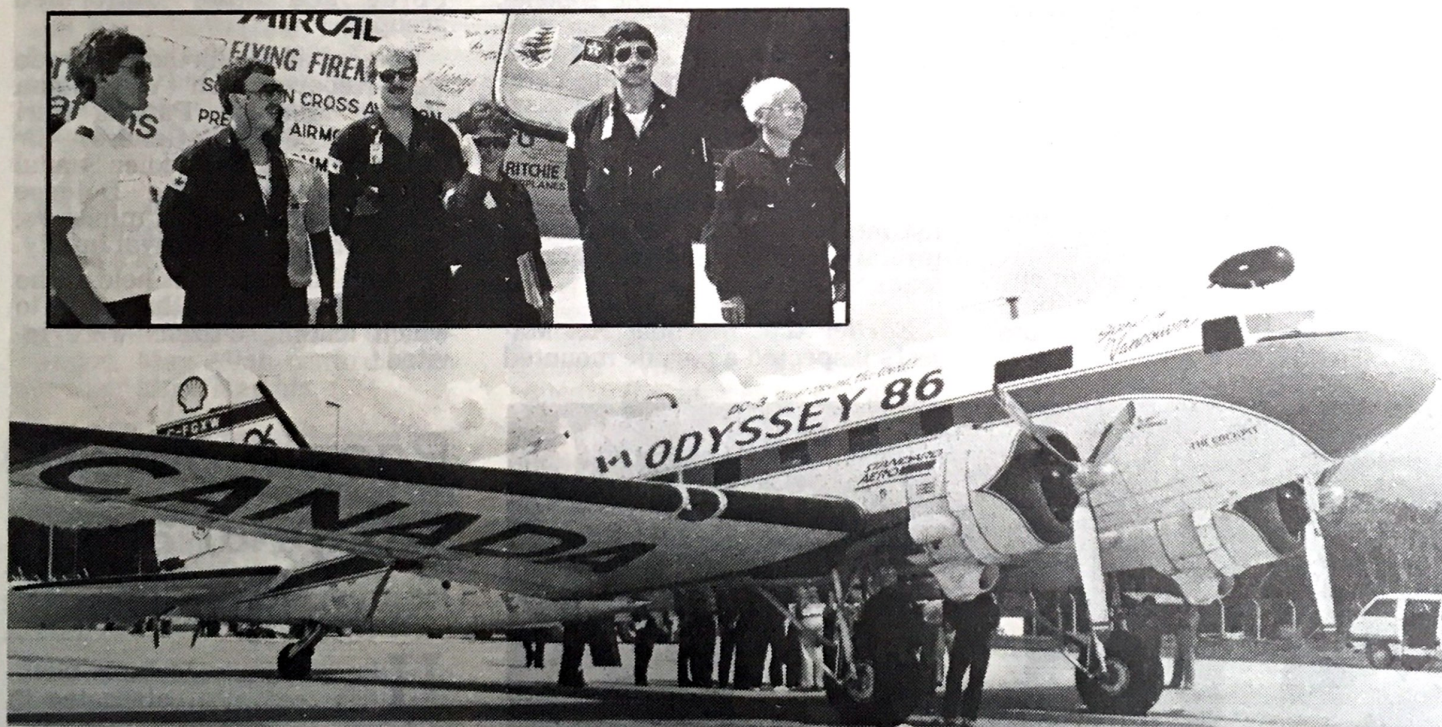
The Odyssey at Brunei International Airport. Inset: Crew of the Odyssey.

B andar Seri Begawan was among 57 cities that a 50-year-old Douglas DC-3 aircraft stopped over to promote the World Exposition being held in Vancouver, Canada.