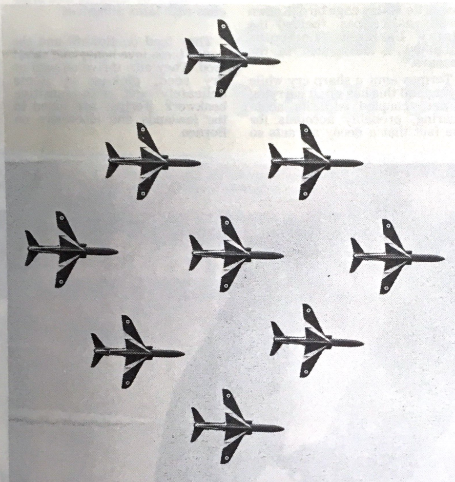
The Red Arrows aerobatic team fly past in the Diamond Nine formation-its recognised trade mark.

T he world famous Red Arrows aerobatics team held complete centre stage of the country's skies for 25 minutes on July 3, 1986.