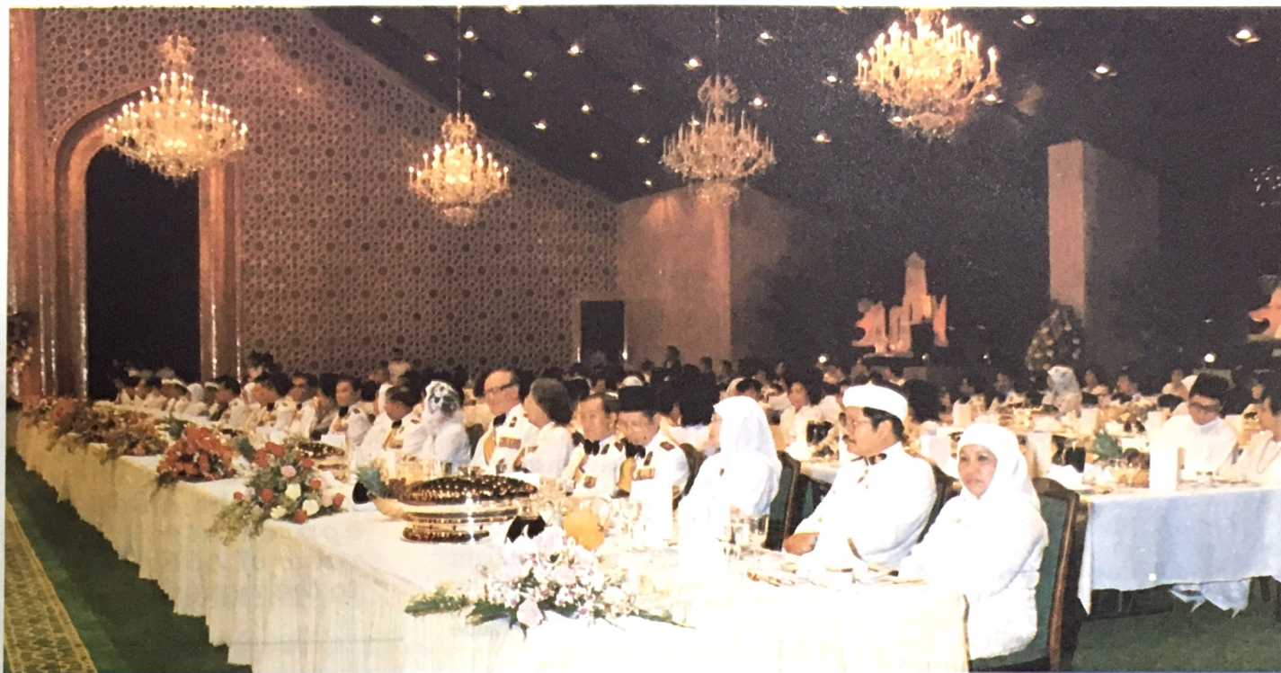
Guests at the royal birthday banquet held at the Nurul Iman Palace.

amounting to about $1 billion had been allocated to housing, education, medical and health and other social services.