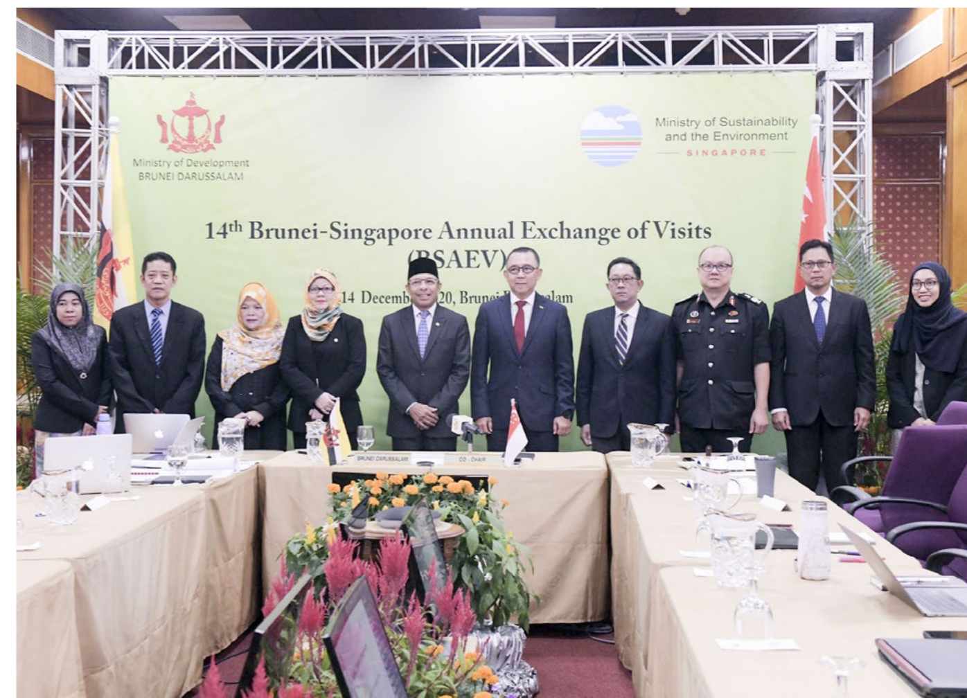
Yang Berhormat Minister of Development in a group photo during the 14 th Brunei-Singapore Annual Exchange of Visits (14 th BSAEV) on Environment.

BANDAR SERI BEGAWAN, December 14 – The 14 th Brunei-Singapore Annual Exchange of Visits (14 th BSAEV) on Environment is an activity under a memorandum of understanding in 2015, on the cooperation in the field of environment was held virtually.