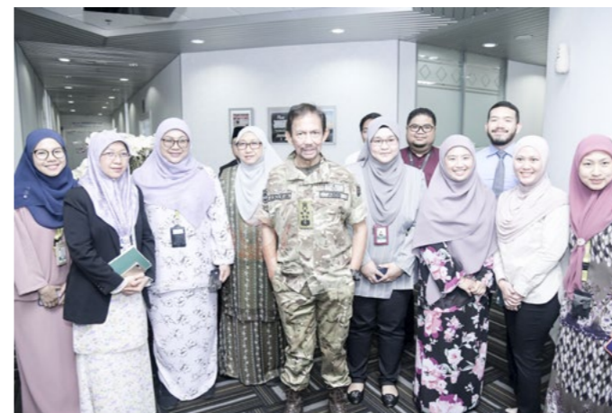
His Majesty in a group photo with Ministry of Finance and Economy's staff.