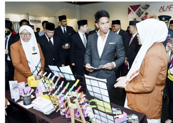
His Royal Highness viewing showcases by students.

Her Royal Highness Princess Hajah Masna binti Al-Marhum Sultan Haji Omar 'Ali Saifuddin Sa'adul Khairi Waddien, Ambassador-at-Large at the Ministry of Foreign Affairs, launched