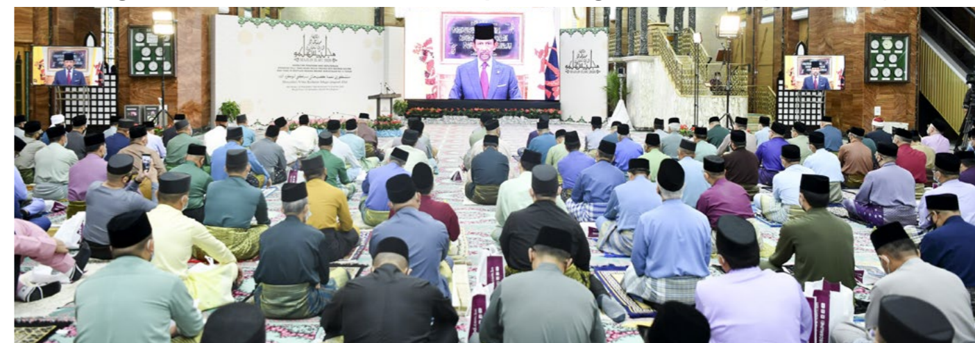
His Majesty Sultan Haji Hassanal Bolkiah Mu'izzaddin Waddaulah ibni Al-Marhum Sultan Haji Omar 'Ali Saifuddien Sa'adul Khairi Waddien, Sultan and Yang Di-Pertuan of Brunei Darussalam in the pre-recorded titah during the Knowledge Convention 2020 at the Omar 'Ali Saifuddien Mosque.