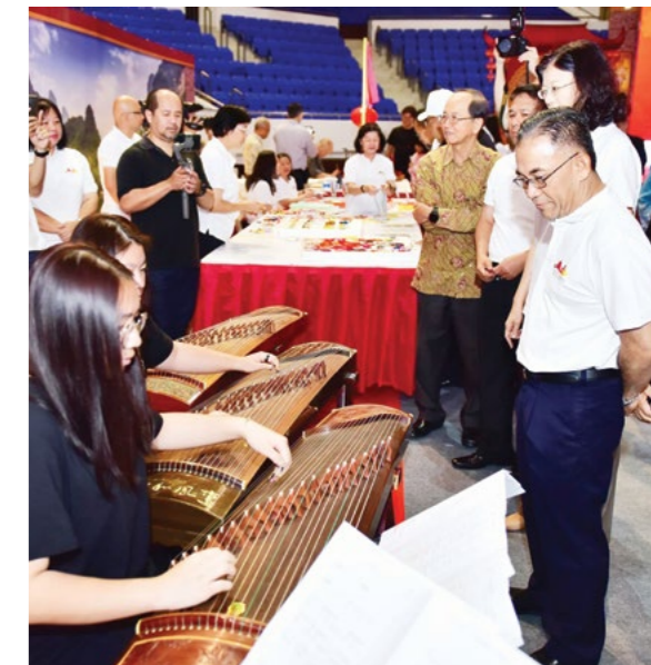
Yang Berhormat Minister of Primary Resources and Tourism and Yang Berhormat Minister of Culture, Youth and Sports touring the exhibit, accompanied by Her Excellency Yu Hong, Ambassador of the People’s Republic of China to Brunei Darussalam.

China stands ready to work together with Brunei to strengthen cooperation and join hands on the road to achieve the Long-Range Objectives through the Year 2035 and Brunei Vision 2035.