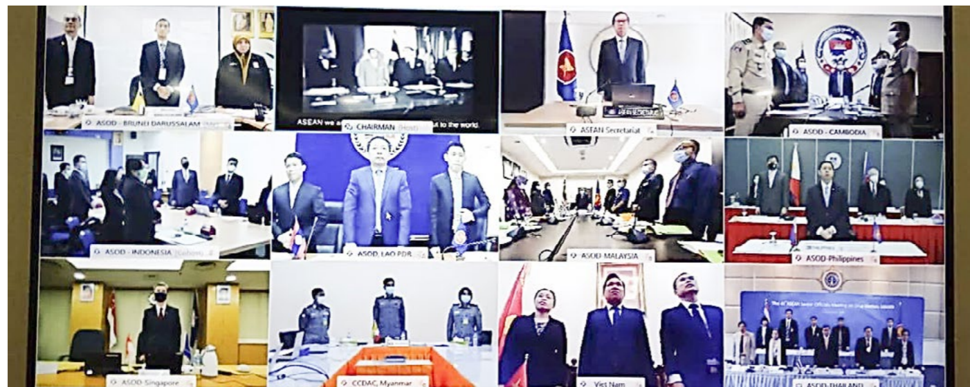
The 41 st ASEAN Senior Officials on Drug Matters (ASOD) Meeting held virtually.