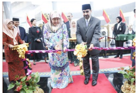
9. "Brunei Darussalam from the Eyes of Foreign Diplomats and Families" Photography Exhibition