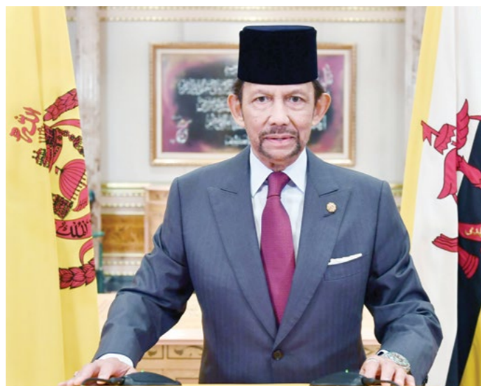
His Majesty Sultan Haji Hassanal Bolkiah Mu'izzaddin Waddaulah ibni Al-Marhum Sultan Haji Omar 'Ali Saifuddien Sa'adul Khairi Waddien, Sultan and Yang Di-Pertuan of Brunei Darussalam delivering a titah (royal speech).

This is, without question, a platform for the spread of knowledge and propagation. His Majesty is optimistic that the Knowledge Convention is capable of creating a vision and mission that is advantageous for the country. Thus, it is befitting that it should be