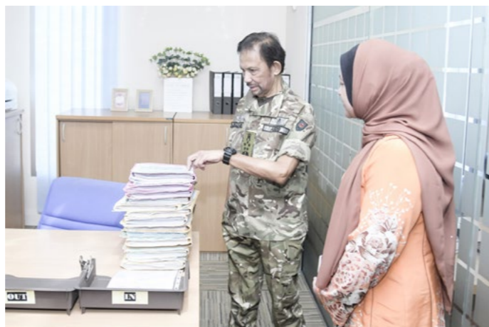
His Majesty the Sultan and Yang Di-Pertuan of Brunei Darussalam touring the Ministry of Finance and Economy (above & below).