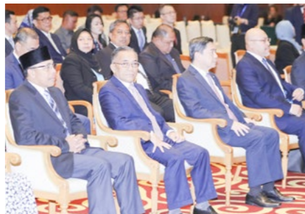
10. Boosting fisheries industry