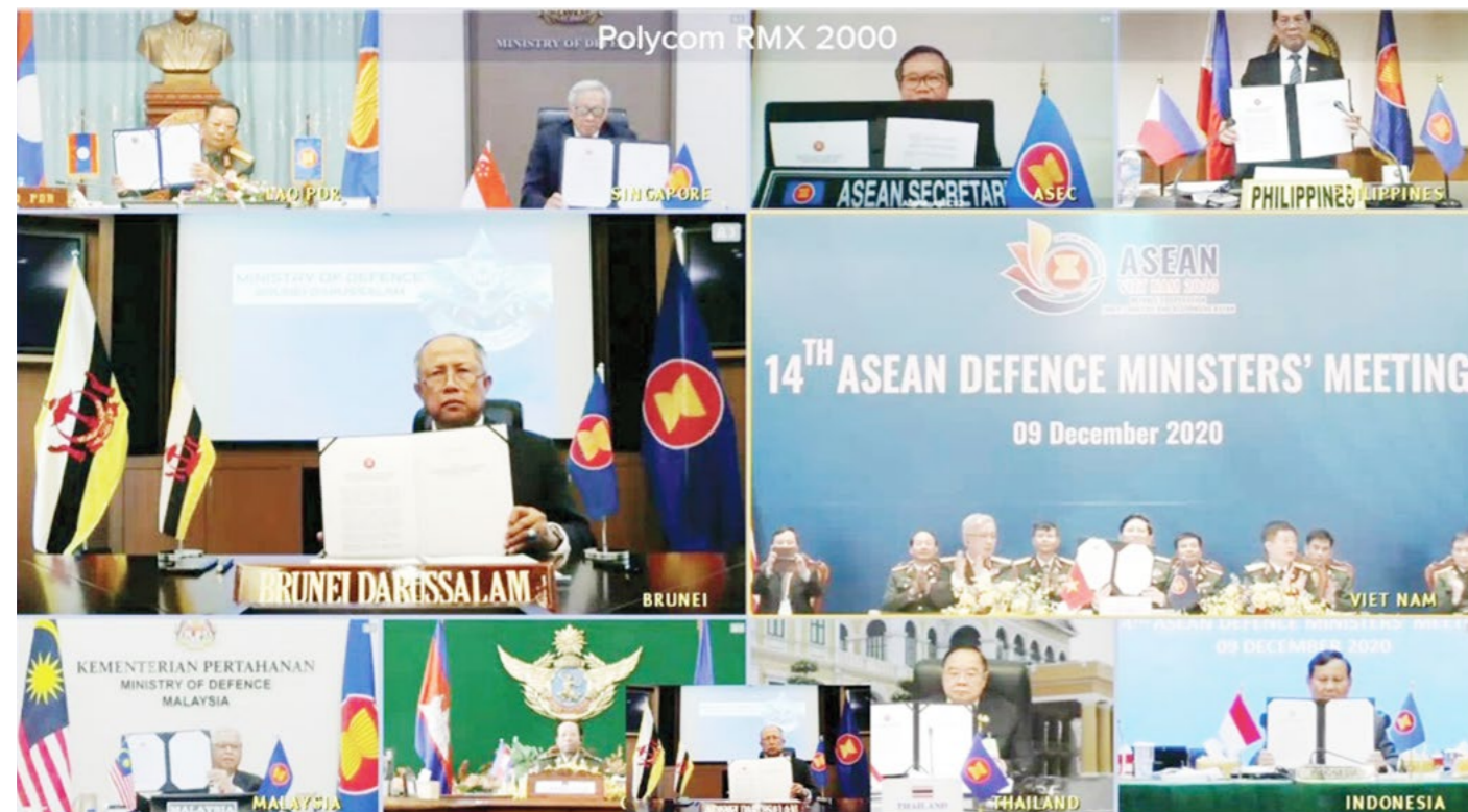
Yang Berhormat Second Minister of Defence during the 14th ASEAN Defence Ministers' Meeting (ADMM) held virtually.

BOLKIAH GARRISON, December 9 – The 14th ASEAN Defence Ministers' Meeting (ADMM) convened virtually concluded on a high note today. The 14th ADMM was chaired by His Excellency Ngo Xuan Lich, Minister of National Defence, Socialist Republic of Vietnam, in his capacity as Vietnam ADMM Leader.