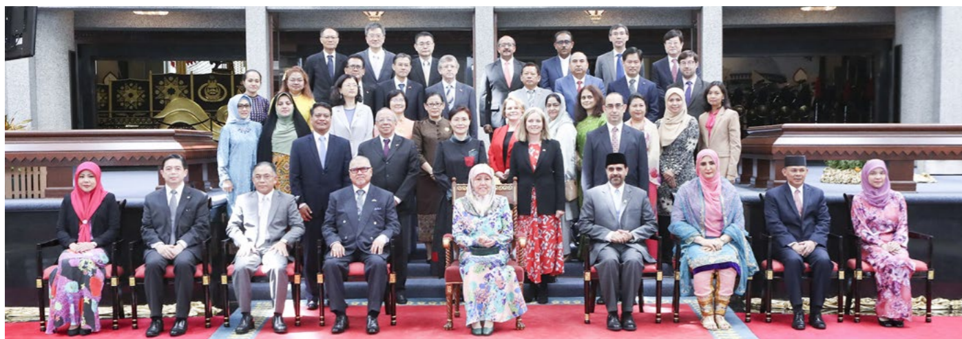
Her Royal Highness Princess Hajah Masna, Ambassador-at-Large at the Ministry of Foreign Affairs; Yang Amat Mulia Pengiran Lela Cheteria Sahibun Najabah Pengiran Anak Haji Abdul Aziz bin Pengiran Jaya Negara Pengiran Haji Abu Bakar; Yang Berhormat Minister of Primary Resources and Tourism; Yang Berhormat Minister at the Prime Minister’s Office and Second Minister of Finance and Economy; Yang Berhormat Minister of Culture, Youth and Sports, and His Excellency Sheikh Ahmed bin Hashil Al-Maskari, Ambassador of the Sultanate of Oman to Brunei Darussalam in a group photo.

The exhibition is open for the public at the Royal Regalia Museum until December 26. The exhibition will tour the four districts, spending 10 days at each district beginning with the Brunei-Muara District.