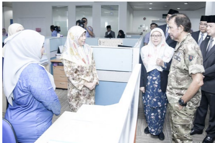
His Majesty Sultan Haji Hassanal Bolkiah Mu'izzaddin Waddaulah ibni Al-Marhum Sultan Haji Omar 'Ali Saifuddin Sa'adul Khairi Waddien, Sultan and Yang Di-Pertuan of Brunei Darussalam during the visit to the Ministry of Finance and Economy.

"I am aware that the absorption of a number of departments