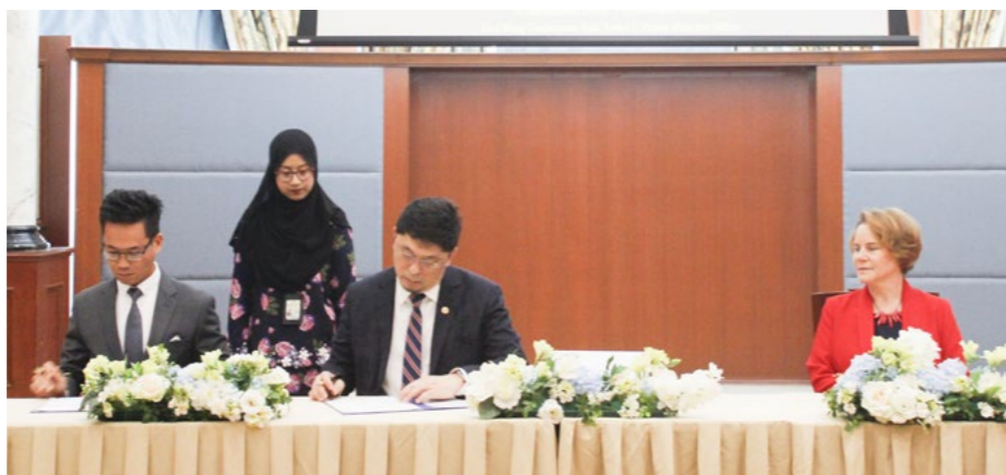
The Signing Ceremony for the National Coastal Surveillance System (NCSS) Project Contract between the National Maritime Coordination Center (NMCC), Prime Minister's Office (PMO) and the General Dynamics Mission Systems-Canada.

BANDAR SERI BEGAWAN, December 31 —As a way of showing the Government of His Majesty the Sultan and Yang Di-Pertuan of Brunei Darussalam's continuous commitment in maintaining the well-being and interests of the people of the country, the signing ceremony for the National Coastal Surveillance System (NCSS) Project Contract took place this morning, at the Conference Room East Wing 1, Prime Minister's Office headquarters.