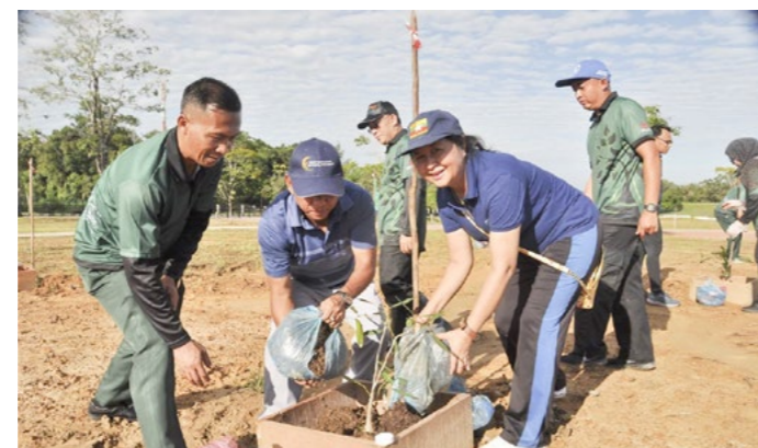
The Tree Planting Activity was also carried out by the special guests who were present at the event.