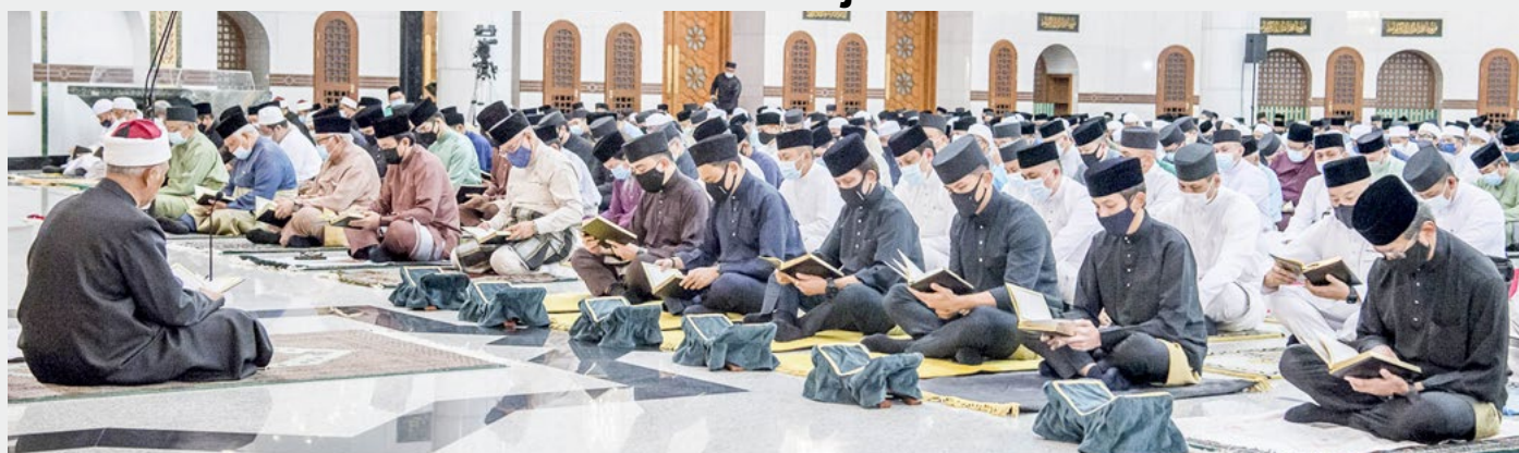
His Majesty Sultan Haji Hassanal Bolkiah Mu'izzaddin Waddaulah ibni Al-Marhum Sultan Haji Omar 'Ali Saifuddien Sa'adul Khairi Waddien, Sultan and Yang Di-Pertuan of Brunei Darussalam; His Royal Highness Prince Haji Al-Muhtadee Billah, the Crown Prince and Senior Minister at the Prime Minister's Office; His Royal Highness Prince 'Abdul Malik; His Royal Highness Prince 'Abdul Mateen; His Royal Highness Prince 'Abdul Wakeel and His Royal Highness Prince Haji Jefri Bolkiah during the Recitation of Surah Yaa Siin and 40 Days Tahliil Ceremony for Al-Marhum His Royal Highness Prince Haji 'Abdul 'Azim.

BANDAR SERI BEGAWAN, December 2 - His Majesty Sultan Haji Hassanal Bolkiah Mu'izzaddin Waddaulah ibni Al-Marhum Sultan Haji Omar 'Ali Saifuddien Sa'adul Khairi Waddien, Sultan and Yang Di-Pertuan of Brunei Darussalam attended the Recitation of Surah Yaa Siin and 40 Days Tahliil Ceremony for Al-Marhum His Royal Highness Prince Haji 'Abdul 'Azim at Jame' 'Asr Hassanil Bolkiah in Kampung Kiarong.