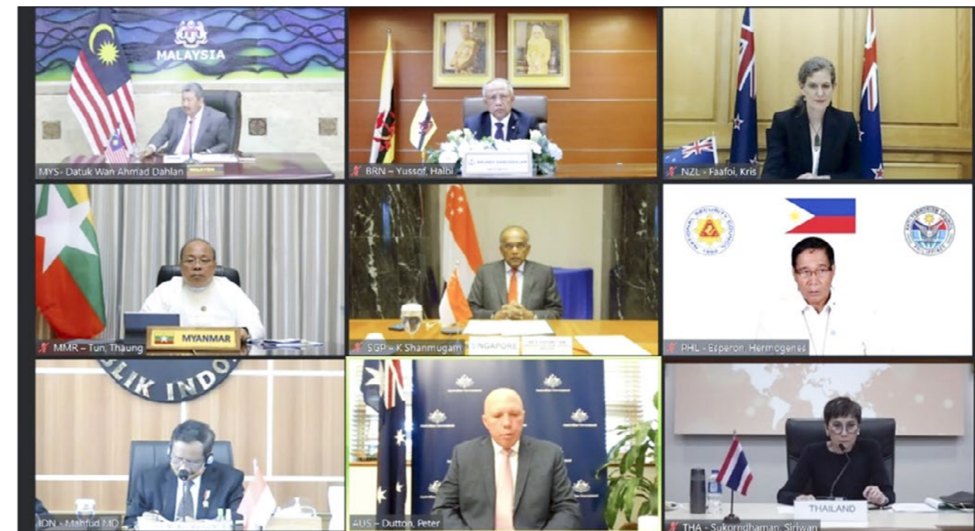
Yang Berhormat Second Minister of Defence leading Brunei Darussalam's delegation at the 3 rd Sub-Regional Meeting on Counter Terrorism and Transnational Security which was held virtually via video conferencing.

BANDAR SERI BEGAWAN, December 1 - The 3 rd Sub-Regional Meeting on Counter Terrorism and Transnational Security was held virtually via video conferencing. The meeting was co-hosted by His Excellency Mohammad Mahfud MD, Coordinating Minister for Political, Legal and Security Affairs, Republic of Indonesia and the Honourable Peter Dutton MP, Minister for Home Affairs, Australia.