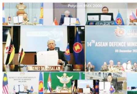
14. Second Minister of Defence attends 14 th ADMM