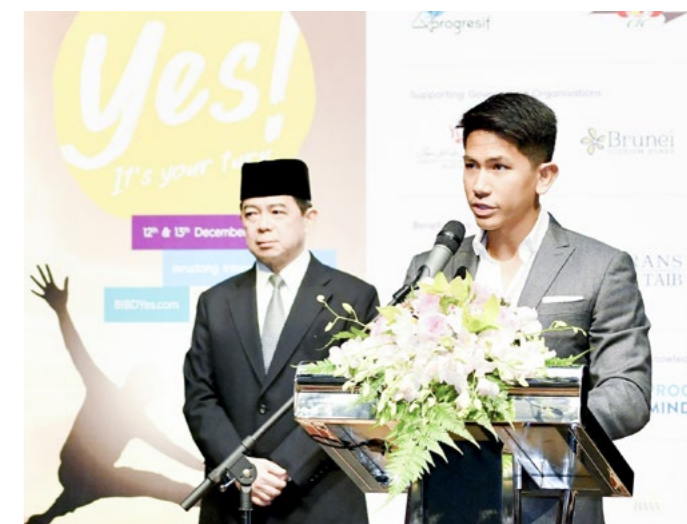
His Royal Highness Prince 'Abdul Mateen ibni His Majesty Sultan Haji Hassanal Bolkiah Mu'izzaddin Waddaulah delivering a sabda (royal speech) at the BIBD Youth Empowerment Summit.

His Royal Highness recalls one very formative experience when he had to complete a 73-kilometre group race in the