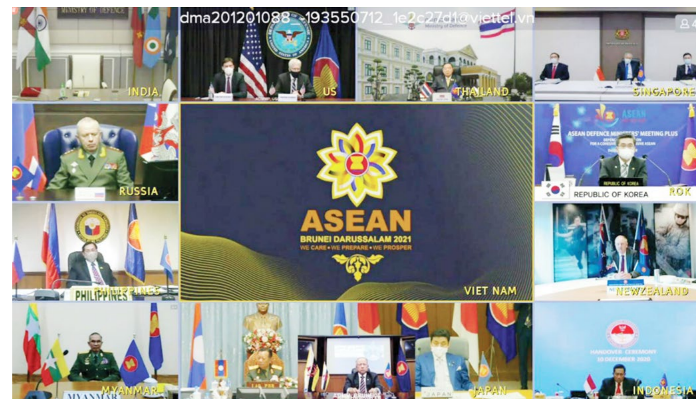
The 7th ASEAN Defence Ministers' Meeting Plus (ADMM-Plus) held virtually which oversaw the official handover to Brunei Darussalam as Chairman of the ADMM in 2021.