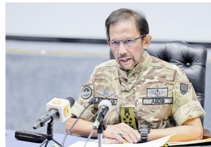
His Majesty Sultan Haji Hassanal Bolkiah Mu'izzaddin Waddaulah ibni Al-Marhum Sultan Haji Omar 'Ali Saifuddien Sa'adul Khairi Waddien, Sultan and Yang Di-Pertuan of Brunei Darussalam delivering a titah (royal speech).

"They need to monitor and take the ongoing situation into account and at the same time need to address the situation by preventing one side from earning profits at the expense of another. If there are sufficient supplies that are easy to procure, then let everyone have access to them. If they are limited or scarce, then sell them in limited amounts, without any adverse effects on anyone. This means that no goods should be sold or purchased, except at normal prices – not by raising prices to the detriment of consumers," said His Majesty.