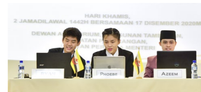
Representatives for Brunei Darussalam during the 9 th Regional ASEAN Quiz 2020.

The quiz is held once every two years and is one of the projects of the ASEAN Committee on ASEAN Culture and Information (ASEAN-COCI) launched in 2002 and ASEAN member states organise the quiz on a rotational basis.