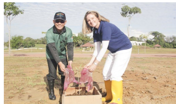
Yang Berhormat Minister of Primary Resources and Tourism planting a tree at the event.