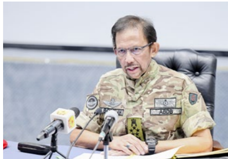
5. Unscheduled visit to MoFE: consistently monitor price hikes