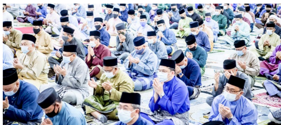
Congregants at the Recitation of Surah Yaa Siin and Tahliil Ceremony.

Al-Marhum His Royal Highness was known as a virtuous person who was actively involved in various charities such as the arts, youth and welfare, especially in assisting the differently abled.