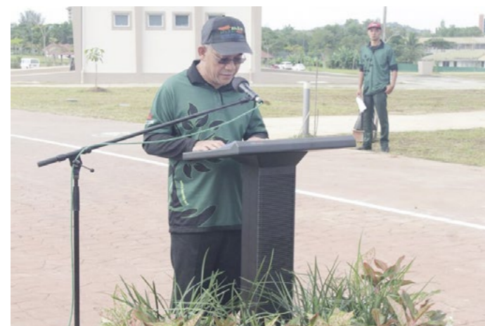
Yang Berhormat Minister of Primary Resources and Tourism as a Member of the Brunei Darussalam National Climate Change on Climate Change (BNCCC) presenting his welcoming remarks at the Tree Planting Event.