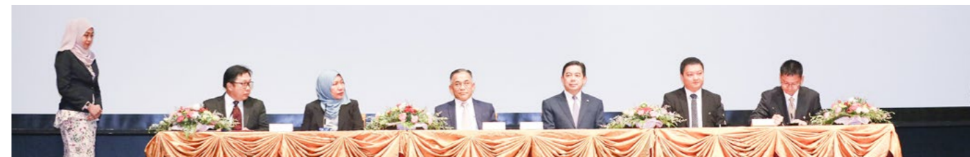
Yang Berhormat Minister of Primary Resources and Tourism; Yang Berhormat Minister at Prime Minister’s Office and Second Minister of Finance and Economy witnessing the signing of agreement between the Department of fisheries under the Ministry of Primary Resources and Tourism (MPRT) and Muara Port Company Sdn. Bhd. (MPC)