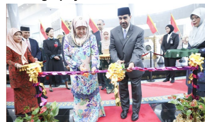
Her Royal Highness Princess Hajah Masna binti Al-Marhum Sultan Haji Omar 'Ali Saifuddin Sa'adul Khairi Waddien, Ambassador-at-Large at the Ministry of Foreign Affairs; His Excellency Ambassador of the Sultanate of Oman to Brunei Darussalam, Dean of the Diplomatic Corps in Brunei Darussalam and launching the exhibition.

BANDAR SERI BEGAWAN, December 16 - In appreciation of the development in bilateral relations between the Sultanate and the diplomatic missions in the country as well as gratitude to the government and people of Brunei Darussalam for the hospitality, the Diplomatic Corps in Brunei Darussalam organised a photography exhibition: 'Brunei Darussalam from the Eyes of Foreign Diplomats and their Families'.