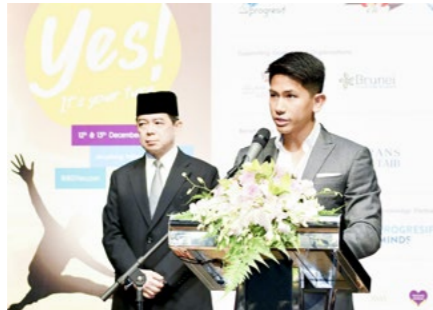
7. BIBD Yes!: Create different set of opportunities