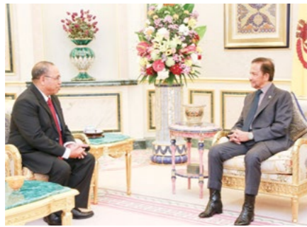
3. His Majesty receives audiences