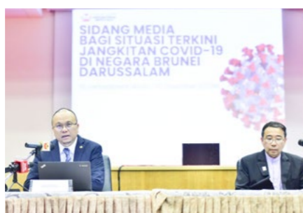
16. COVID-19: Seven new cases recorded in December