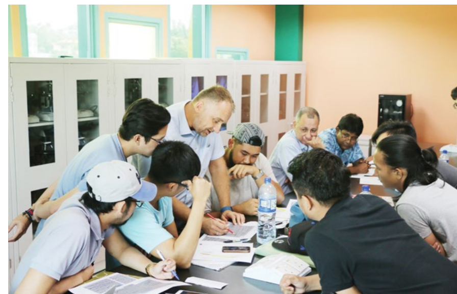
Geosciences programme of the Faculty of Science (FOS) is the first in Brunei Darussalam to achieve ASEAN University Network Quality Assurance (AUN-QA) programme-level certification.

The AUN-QA certification was awarded for the undergraduate Bachelor of Science (BSc) in Geology programme, a popular option for students in the Faculty of Science. After completion of the BSc in Geology, students have the option of proceeding to Master of Science (MSc) and PhD degrees. Brunei Darussalam is a petroleum-producing country and several leading companies are located here, hence Geology graduates are often recruited by oil and gas companies or associated service companies. Geology graduates can also find attractive careers in other industries related to mineral resources, groundwater exploration, environmental issues and construction, both at home and abroad.