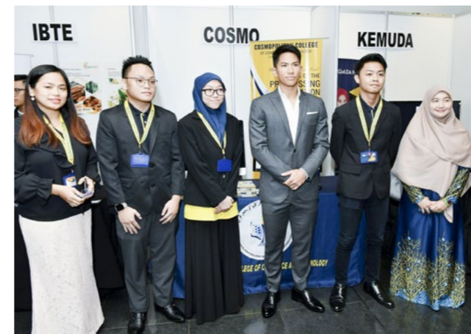
His Royal Highness with students.