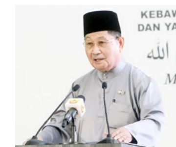
Yang Berhormat Minister of Religious Affairs delivering a special talk.