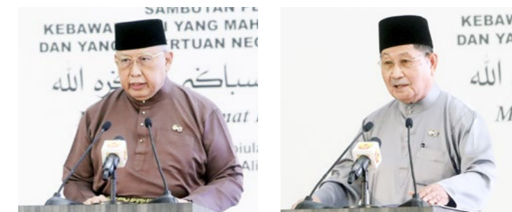
Yang Berhormat Minister at the Prime Minister's Office as the Co-Chairman of the Knowledge Convention Steering Committee 2020 delivering welcoming speech.

The Knowledge Convention was jointly organised by the Prime Minister's Office, the Ministry of Religious Affairs and the Ministry of Health with the aim of providing knowledge that explains the role and impact of His Majesty's leadership in applying main values related to the importance of health and cleanliness including its impact on spiritual strengthening and faith in the national development agenda.