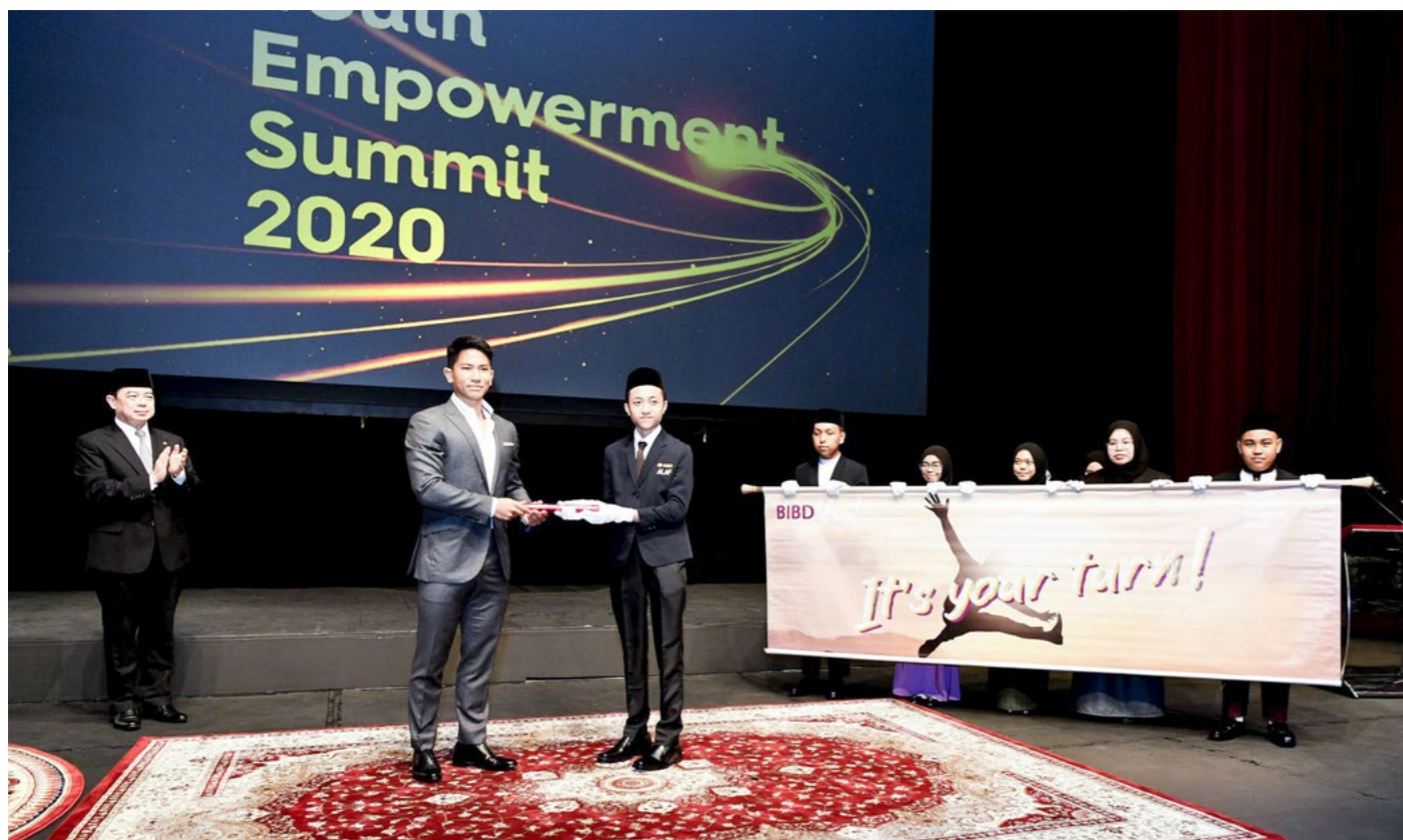
His Royal Highness Prince 'Abdul Mateen ibni His Majesty Sultan Haji Hassanal Bolkiah Mu'izzaddin Waddaulah officiating the 'Passing of the Baton' to a BIBD ALAF student.