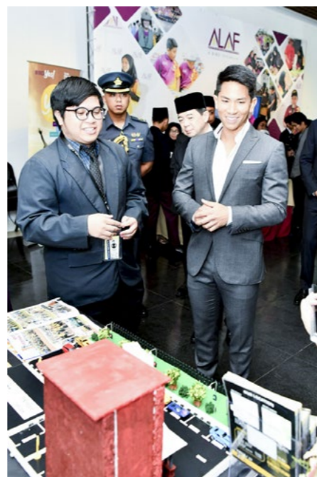
His Royal Highness Prince 'Abdul Mateen viewing the BIBD ALAF students' showcase.

"We want to develop new industries that will future-proof our economy. One example is investing in our creative industries. This was an issue close to my late brother's heart," said His Royal Highness.