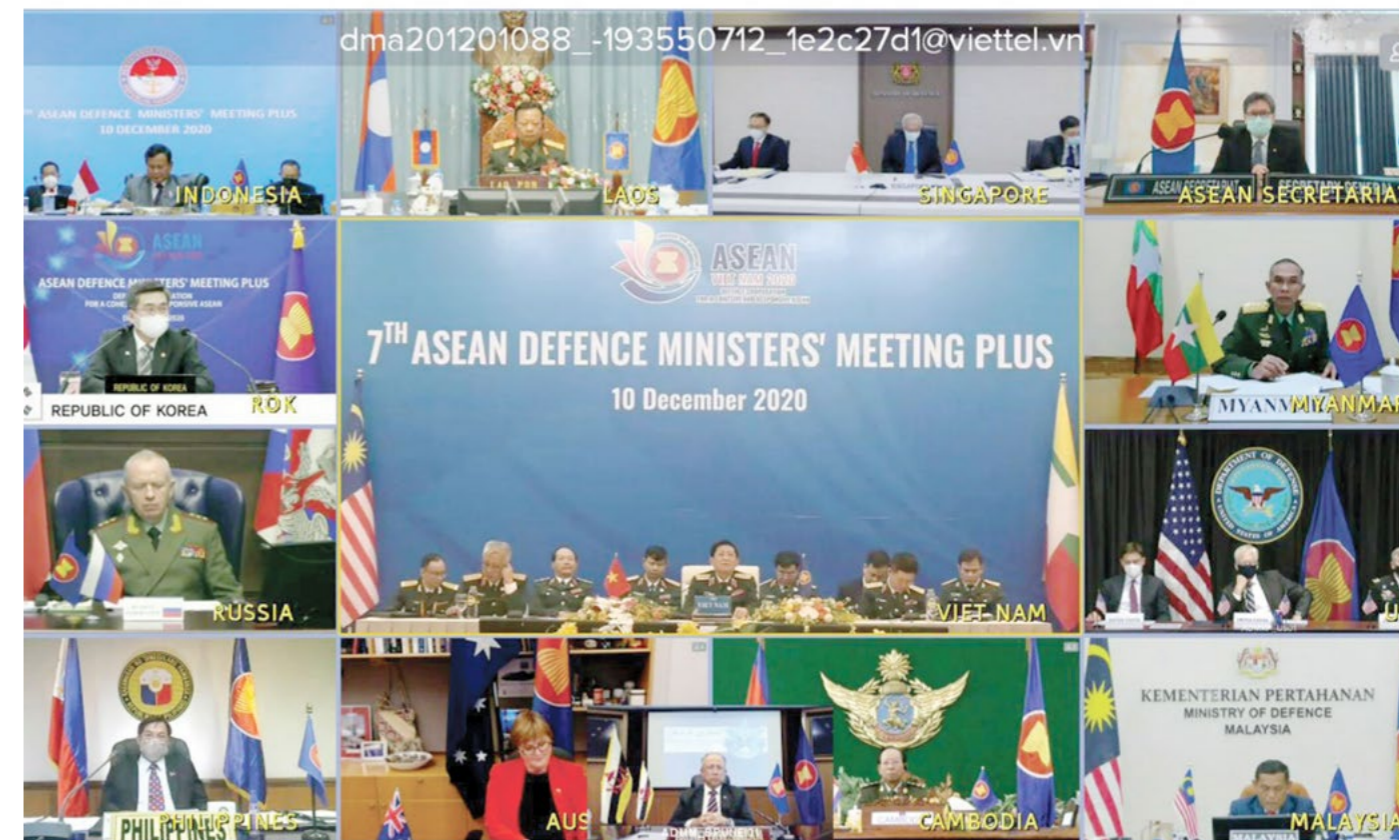
His Excellency General Ngo Xuan Lich, Minister of National Defence, Socialist Republic of Viet Nam, in his capacity as Viet Nam ADMM-Plus Leader chairing the 7th ASEAN Defence Ministers' Meeting Plus (ADMM-Plus) which was held virtually.

The 7th ADMM-Plus began with a commemoration of the 10th