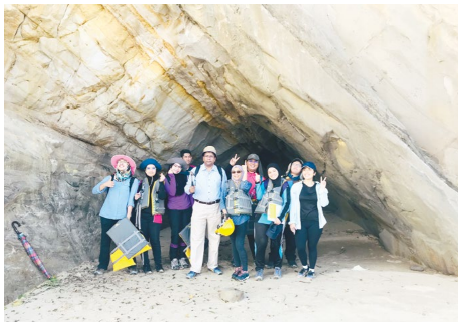
Master of Science in Geology students during the fieldwork as part of their research.

The AUN-QA network is the established quality assurance network for higher education institutions in ASEAN, with the responsibility to promote quality assurance in higher education institutions, raise the quality of higher education, and to collaborate with both regional and international bodies for the benefit of the ASEAN community. The remarkable achievement of the Geosciences programme demonstrates UBD's commitment to implementing quality assurance processes to ensure continued excellence in teaching and research.