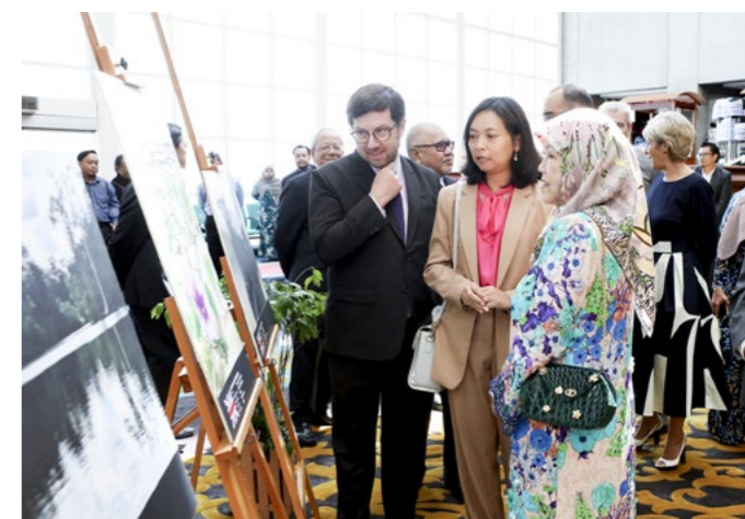
Her Royal Highness Princess Hajah Masna touring the exhibition.

The two-day summit consisted of plenary sessions with 50 different speakers, ranging from Brunei-based speakers and international speakers, who spoke about topics highlighting the power that the youth holds, further strengthening the need to empower the youth's mindset.