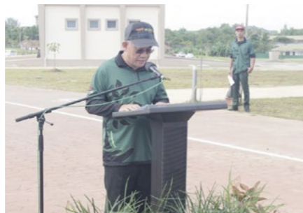
12. Commitment towards tree planting continues