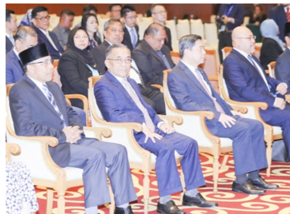
Yang Berhormat Minister of Primary Resources and Tourism; Yang Berhormat Minister at Prime Minister’s Office and Second Minister of Finance and Economy; Yang Berhormat Minister of Development and Yang Berhormat Minister of Transport and Infocommunications during the agreement signing ceremony for Designing, Developing, Operating and Preserving, Muara Fish Landing Complex Project.

MPC is a government-linked company owned by Beibu Gulf Holding (Hong Kong) Co. Limited, from the People’s Republic of China and Darussalam