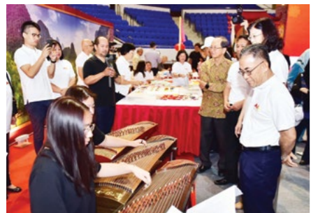
11. China day - Carnival full of culture