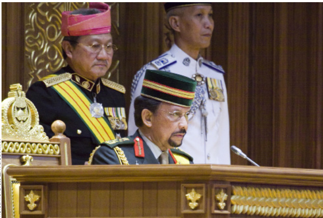
His Majesty The Sultan and Yang Di-Pertuan of Brunei Darussalam delivers a titah at the official opening of the First Meeting of the Seventh Session of the State Legislative Council.