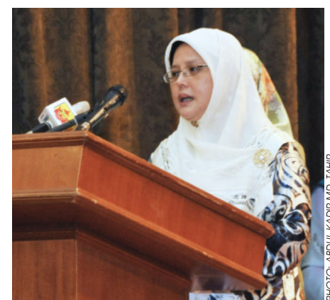
The Deputy Minister of Culture, Youth and Sports highlights the many commendable achievements by Brunei's Women at International Women's Day celebration.

Brunei Darussalam joined other nations in celebrating International Women's Day. This year celebrates the 100 th anniversary since International Women's Day was first declared on March 8, 1911. The celebration shows the commitment of the Government of His Majesty The Sultan and Yang Di-Pertuan of Brunei Darussalam on the rights, role and contribution of women