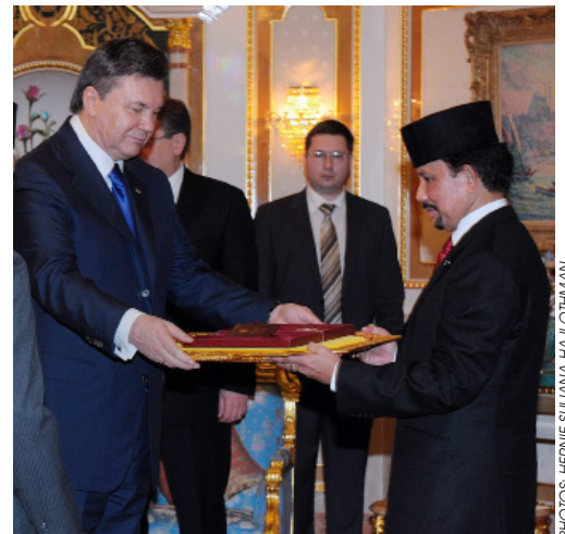
His Majesty The Sultan and Yang Di-Pertuan of Brunei Darussalam receives Ukraine's honorary medal – 'Order of Merit, 1 st Class' from His Excellency.