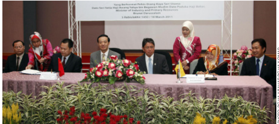
A contract signing ceremony witnessed by the Minister of Industry and Primary Resources.

BANDAR SERI BEGAWAN, March 10 - Cooperation has been agreed in the fisheries sector between Brunei Darussalam and the People's Republic of China. Some of the cooperation agreed is oyster rearing in waters of Brunei Darussalam where a company from Guangxi Zhuang Autonomous Region will carry out research and trial farming before operating commercially. This will open more opportunities for companies from Guangxi Zhuang to invest in Brunei's fisheries sector through strategic alliance and cooperation between companies of both parties.