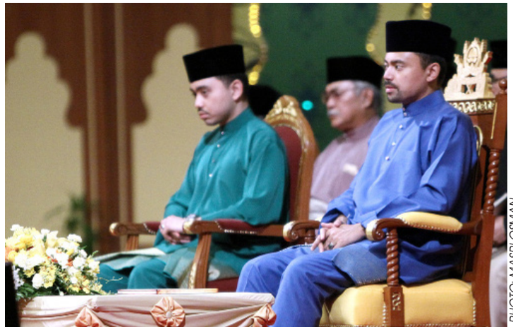
His Royal Highness Crown Prince and His Royal Highness Prince 'Abdul Malik at the seminar.

Also present at the seminar was His Royal Highness Prince 'Abdul Malik.