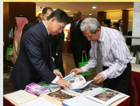
18 Government committed to sustain nation's forestry