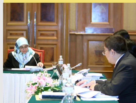
14 Brunei hosts AWGIPC