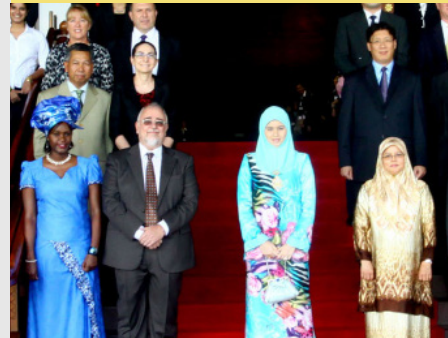
13 Equal opportunities for all youths