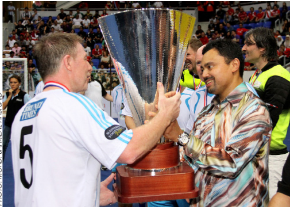
His Royal Highness presents a trophy to the winner of EPL Masters Football Brunei Cup 2011.