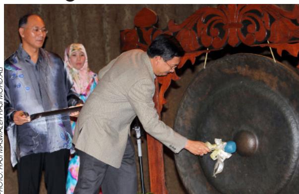
The Minister of Culture, Youth and Sports launches the course in conservation of collections and intangible heritage.

BANDAR SERI BEGAWAN, March 14 - Brunei Darussalam hosted a two-week international course on 'Conservation of Collections and Intangible Heritage' where it enables professionals involved in conservation, particularly on Asian and intangible cultural heritage to share knowledge and methods.