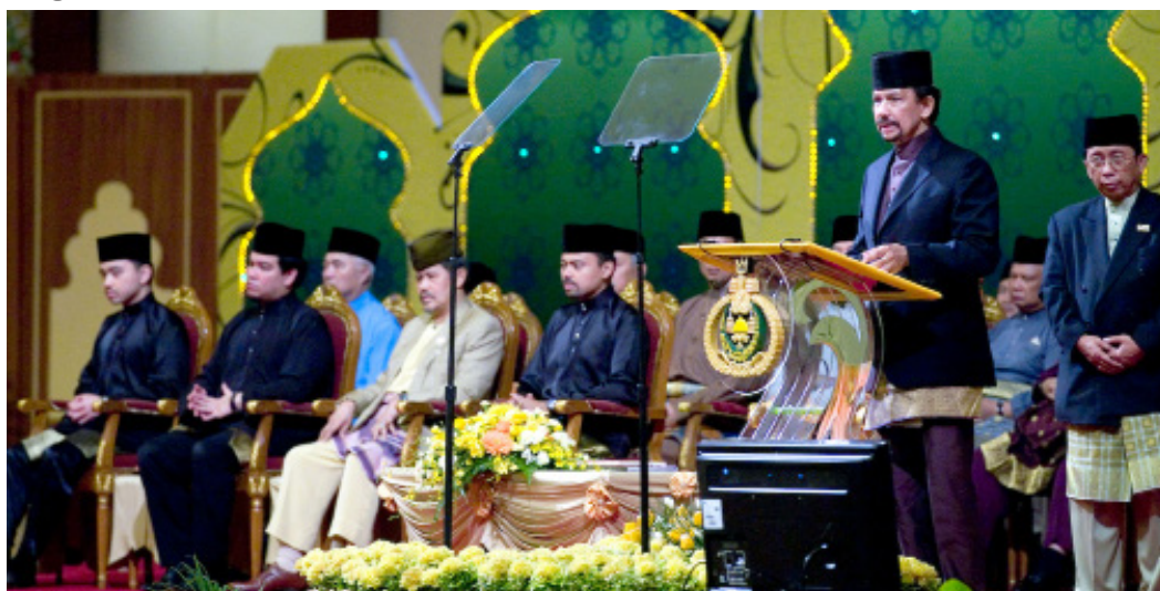
His Majesty announces for the establishment of Ahli Sunnah Waljamaah Study Centre in his titah (royal speech).