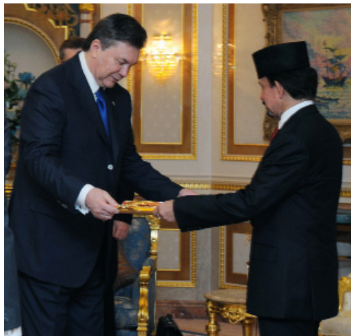
His Majesty awarded a state honorary medal to His Excellency Viktor Yanukovych, the President of Ukraine, – the Darjah Kerabat Laila Utama Yang Amat Dihormati (D.K.) or the Most Esteemed Family Order Laila Utama, which brings the title Dato Laila Utama .