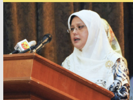
16 Commendable achievements by Brunelan women