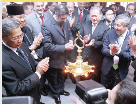
15 Call to strengthen ASEAN - India bilateral cooperation