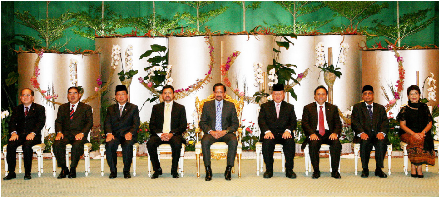
His Majesty The Sultan and Yang Di-Pertuan of Brunei Darussalam in a group photo with ministers responsible for Brunei-Indonesia-Malaysia-Philippines East ASEAN Growth Area, (BIMP-EAGA) and ministers responsible for Forestry and Coral Reefs.