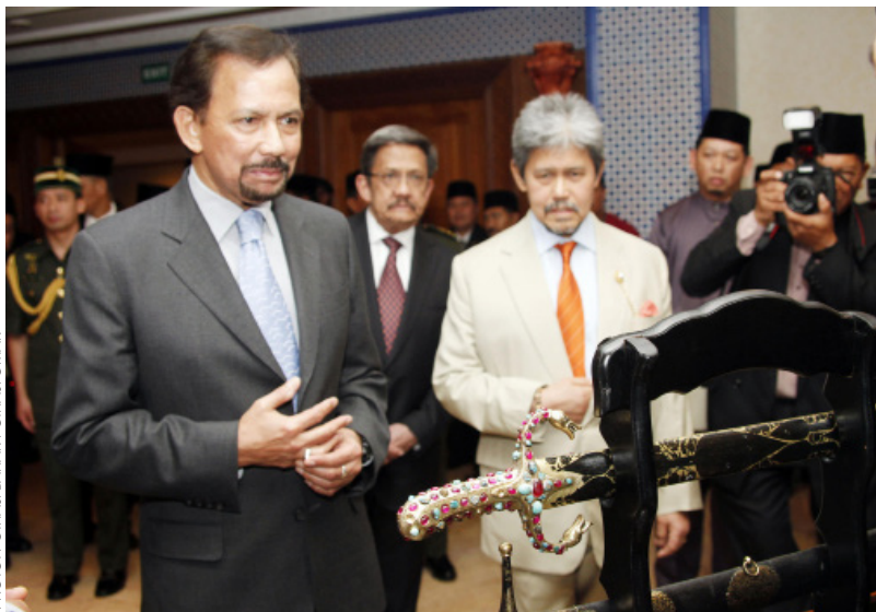
His Majesty The Sultan and Yang Di-Pertuan of Brunei Darussalam at the Islamic Tourism Exhibition held at Darulifta Exhibition Hall.