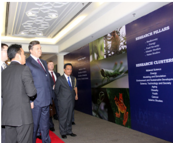
The nation's first university, Universiti Brunei Darussalam (UBD) is among the places visited by His Excellency Viktor Yanukovych.