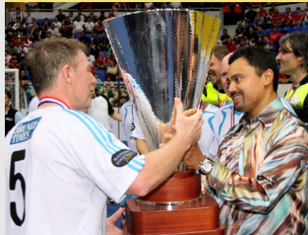
12 EPL Masters Football Brunei Cup 2011