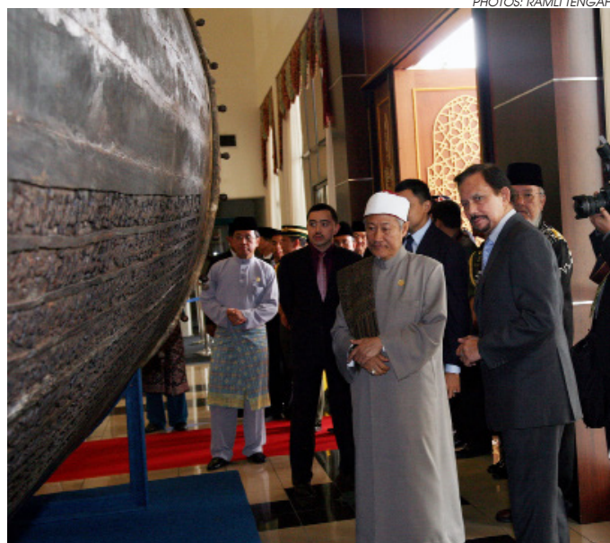
A huge Beduk (drum) is also exhibited at the Islamic Tourism Exhibition.