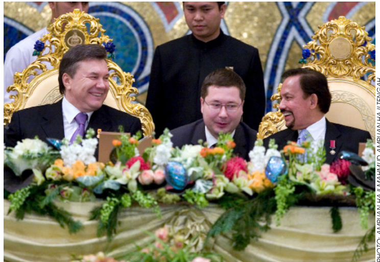
His Majesty and His Excellency at a state banquet in honour of the state visit of His Excellency to the sultanate.