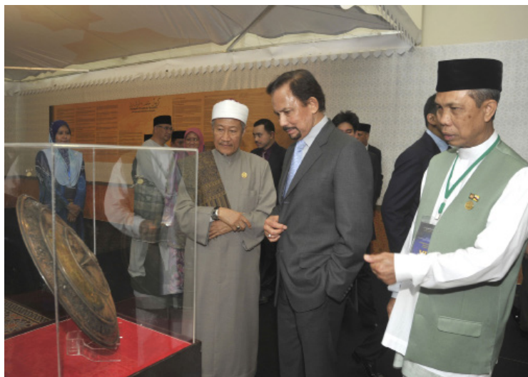
His Majesty looks on one of the exhibited items.

The Islamic Tourism Exhibition is jointly organised by the Sultan Haji Hassanal Bolkiah Islamic Exhibition Gallery and the Tourism Development Department held from March 16 to April 5.