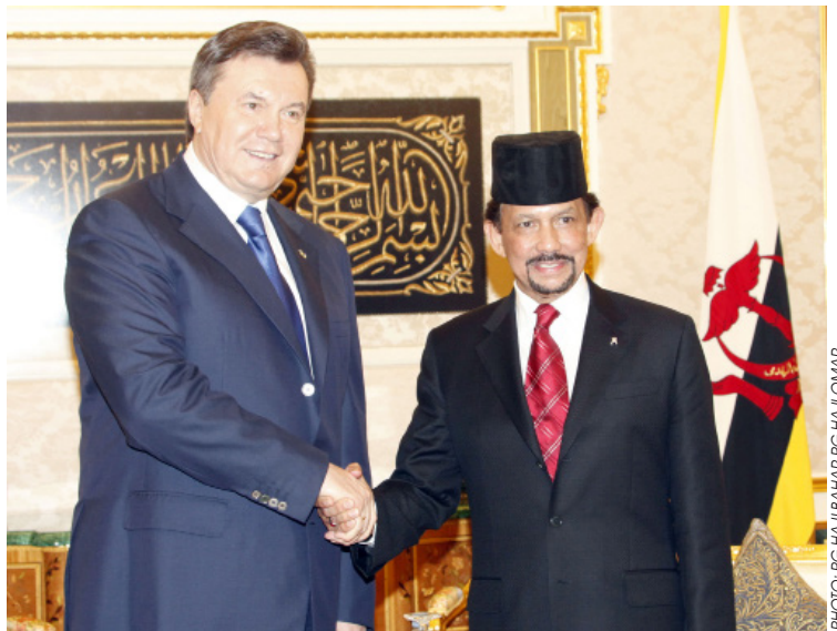
His Majesty The Sultan and Yang Di-Pertuan of Brunei Darussalam with His Excellency Viktor Yanukovych.

In this and in all your country's undertakings, Mr. President, we wish you and the people of Ukraine continuous achievements, happiness and prosperity," said His Majesty.