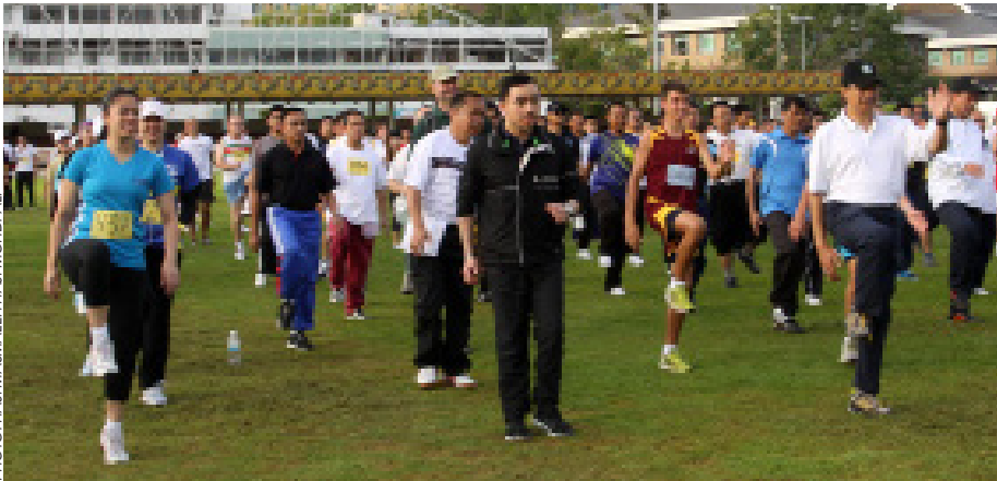
His Royal Highness participates in the National Day Run 2011.

In Belait District, the run was held at Sungai Liang Forest Reserve and attracted participation of more than 300 people. Meanwhile, more than 200 people joined the run held at Pengkalan Pinang Penanjong Recreation Beach in Tutong District; and more than 100 people joined the run held at Bukit Patoi Recreational Park in Temburong.