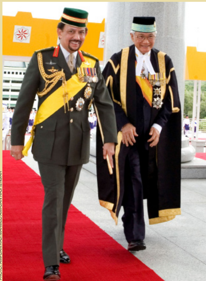
His Majesty The Sultan and Yang Di-Pertuan of Brunei Darussalam at the official opening of the First Meeting of the Seventh Session of the State Legislative Council.