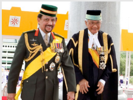
1 HM: Be more progressive in diversifying economy