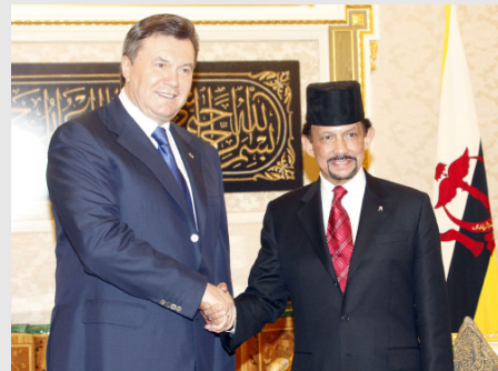
5 Brunei-Ukraine strengthen bilateral relation and cooperation