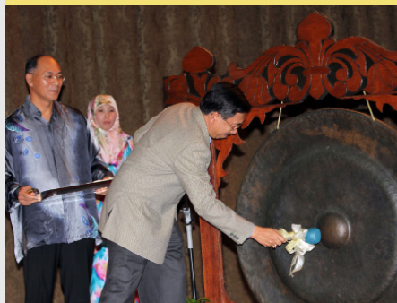
17 Course on conservation of collections and intangible heritage