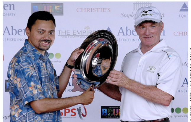
His Royal Highness presents a trophy to the winner of Aberdeen Brunei Senior Masters 2011 Golf Championship.

More than 70 golf masters from Argentina, Australia, Canada, France, Italy, Korea, Malaysia, New Zealand, Portugal, Scotland, Spain, South Africa, Sweden, Taipei, United Kingdom and United States of America participated in this three-day tournament.