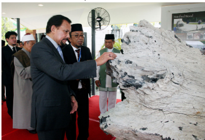
The large wood fossil is among the items displayed at the exhibition.