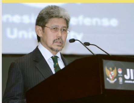
13 HRH attends Jakarta International Defence Dialogue