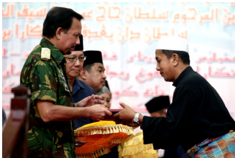
His Majesty The Sultan and Yang Di-Pertuan of Brunei Darussalam presents the key to one of the recipients under the National Housing Scheme.