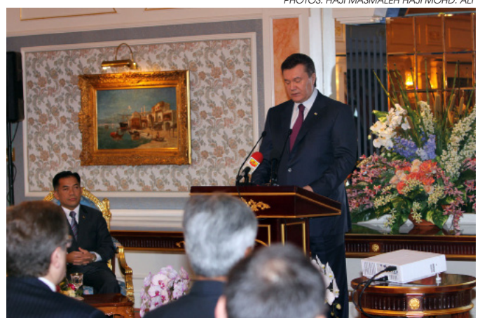
His Excellency delivers a speech at the Brunei-Ukraine Business Conference.