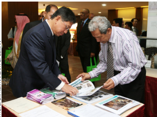
Minister of Industry and Primary Resources takes a closer look at the exhibited items.

and Agriculture Nation while Brunei Darussalam first celebrated the day about 29 years ago.