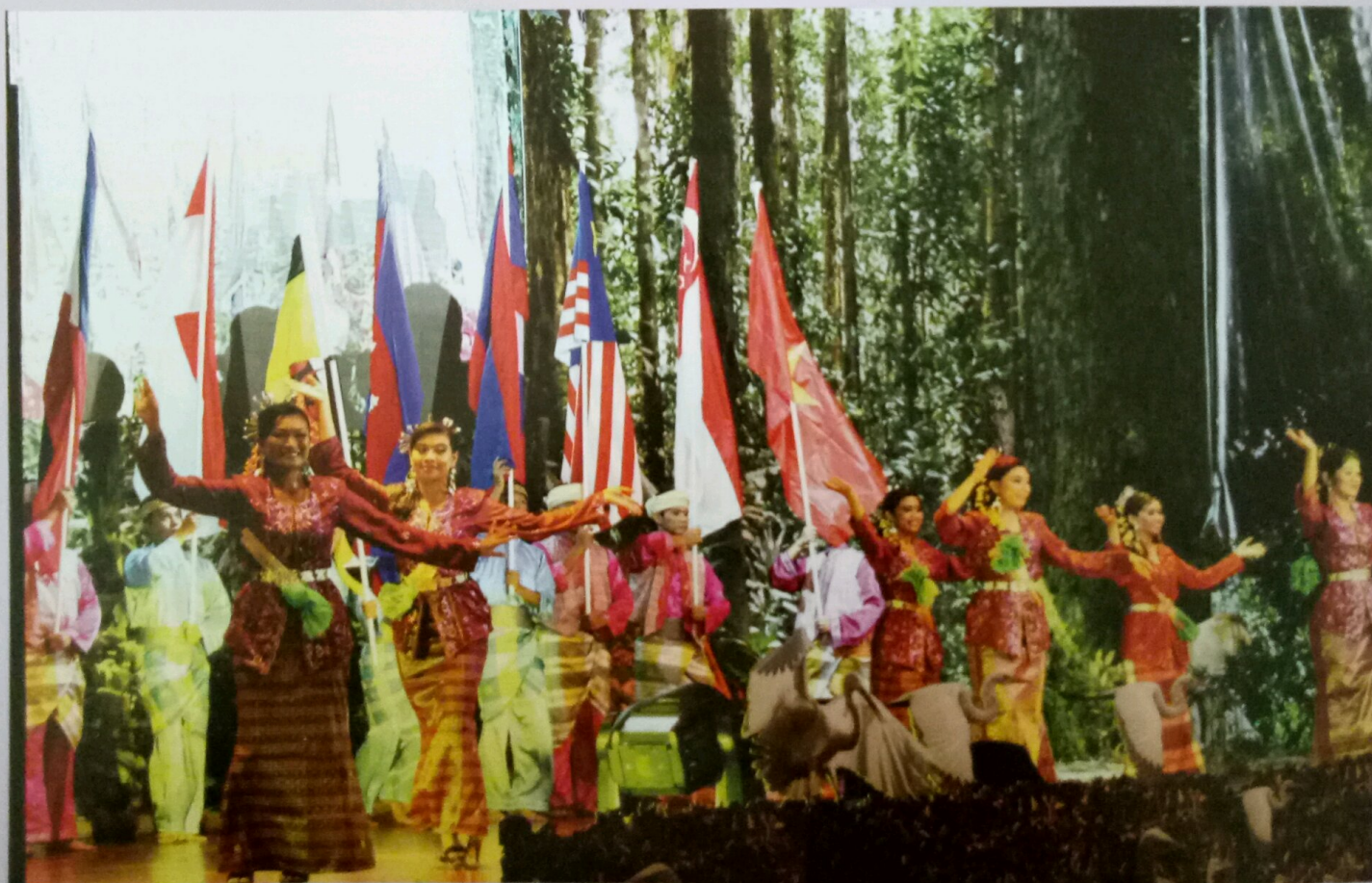
Photo shows a cultural performance by ASEAN countries at the opening ceremony of ASEAN Tourism Forum 2010.