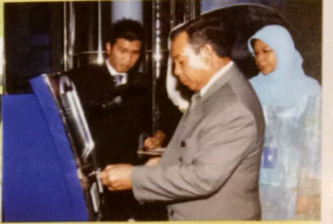
13 SCP operation officially launched