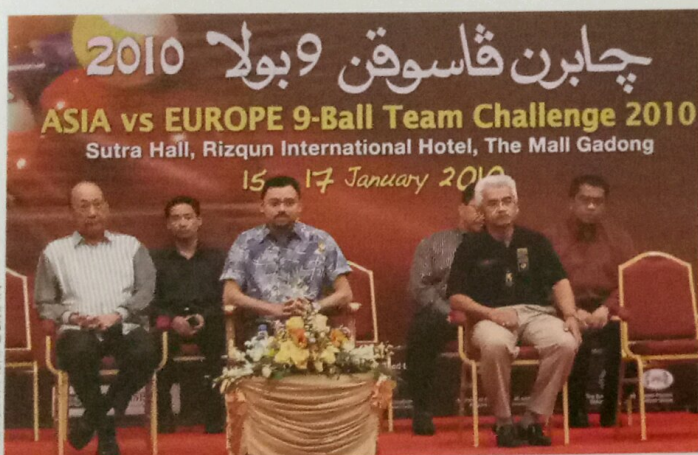
His Royal Highness witnesses the 9-Ball Team Challenge 2010.