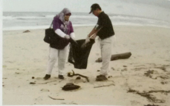
Cleaning campaign by MIPR. Picture shows Minister of MIPR taking part in the activity.

More details on the upcoming ATF 2010 is available at www.atfbrunei.com