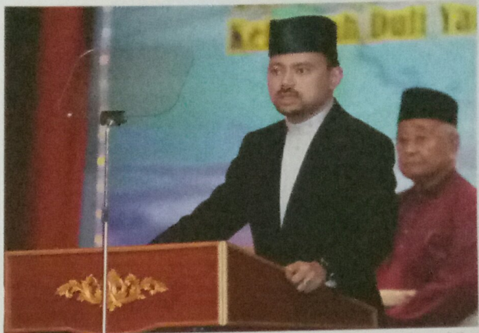
His Royal Highness delivers a sabda at the official opening of the Southeast Asia Islamic Youth Conference.

The conference is part of the Brunei Darussalam's Silver Jubilee National Day celebration where it is held from January 12 to 14. The theme of the conference is 'Perpaduan Belia Islam Menjana Kecemerlangan' (Unification of Islamic Youths Generates Excellence). About 368 participants from Brunei Darussalam, the Republic of Indonesia, Malaysia, the Republic of Singapore, Thailand, Myanmar, the Philippines, Viet Nam and Laos are taking part in the conference where