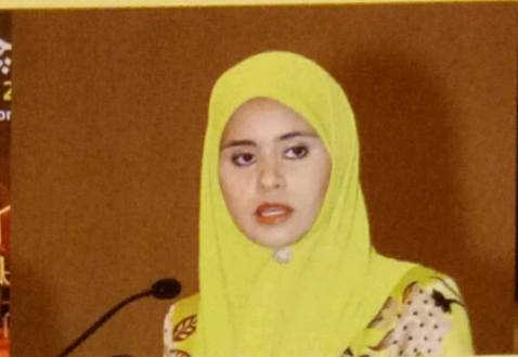
8 Stop global warming and decelerate climate change