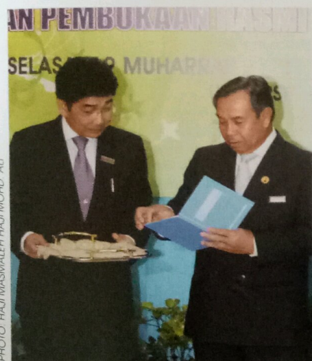
Book on Energy Management Guide launched.

TUNGKU, January 5 – For a better management of energy usage, government agencies are urged to follow the Energy Management Guide book besides taking quick responsible actions in the bid to become a role model to the private sector and members of the public.