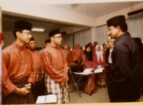
5 HM. Carry out research and statistics on why compulsory religious education not imposed