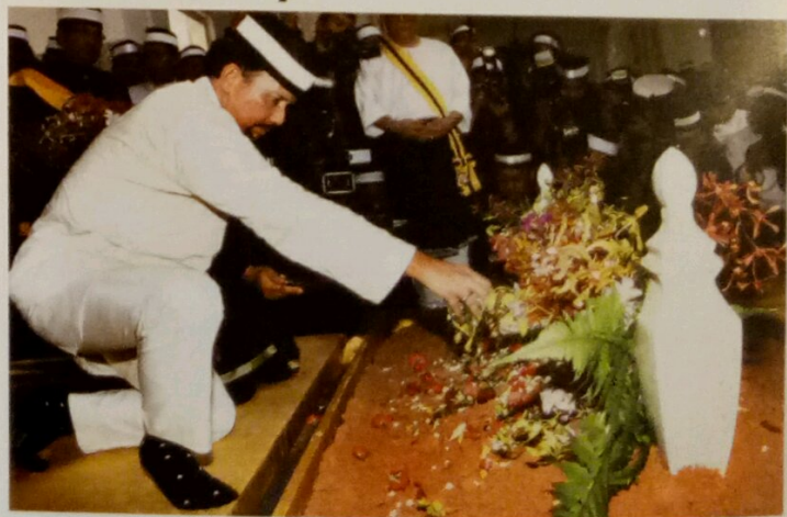
His Majesty sprinkles flower petals over the mausoleum.

Later, His Majesty attended the funeral ceremony at the Mahmoodiah Royal Mausoleum.