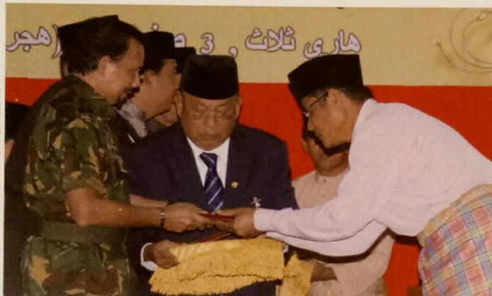
His Majesty presents a land grant to one of the recipients.

LUMUT, January 19 – As one of its continuous effort to provide shelter and comfort to its citizens, the Government of His Majesty The Sultan and Yang Di-Pertuan of Brunei Darussalam through its National Housing Programmes have awarded 65 more people with land grants and keys to their new homes held at the Liang Lumut Recreational Club.