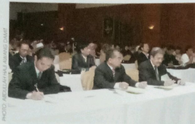
The President of BDNOOC at a session of the course.

BERAKAS, January 18 – The Department of Youth and Sports in cooperation with Brunei Darussalam National Olympic Committee (BDNOC) is organising the 2 nd International Olympic Committee (IOC) Sports Medicine Course at the Orchid Garden Hotel in Berakas.