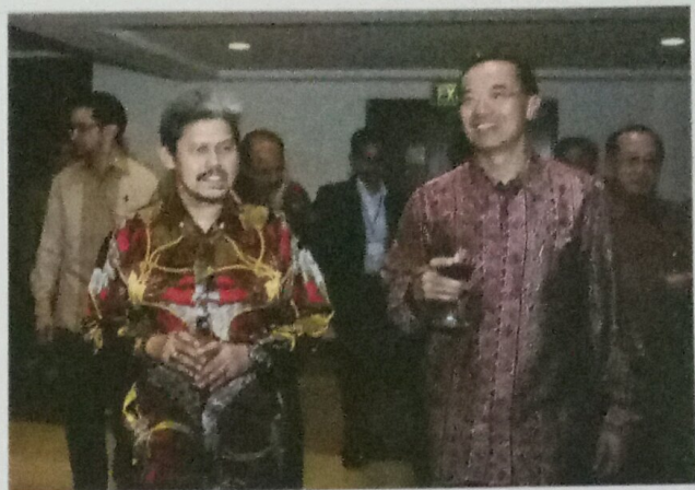
HRH at the Informal Working Dinner.

The ASEAN Foreign Ministers' Retreat is held in Da Nang, Viet Nam from January 13 to 14.