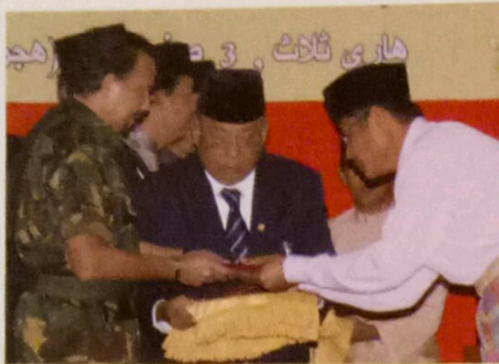
4 More houses and land lots for citizens