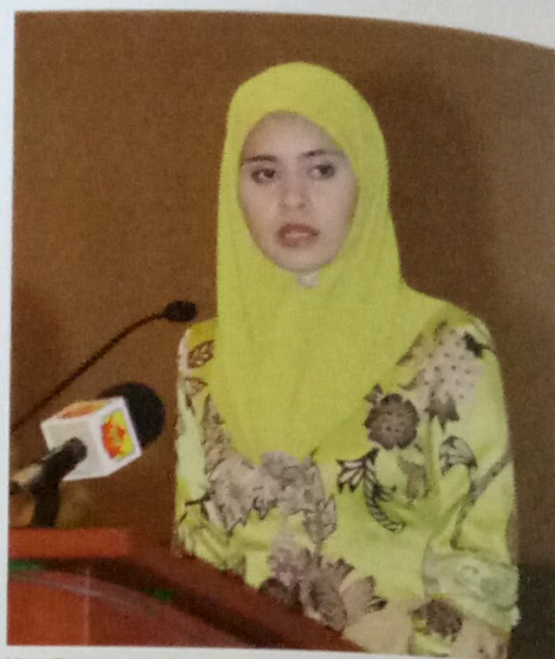
Her Royal Highness delivers a sabda at the official closing of the ASEM Workshop 2010.

Her Royal Highness was also pleased to see that the workshop exemplifies this interest by bringing together young scientists from Asia and Europe to Brunei Darussalam to learn more on climate change and to gain a deeper