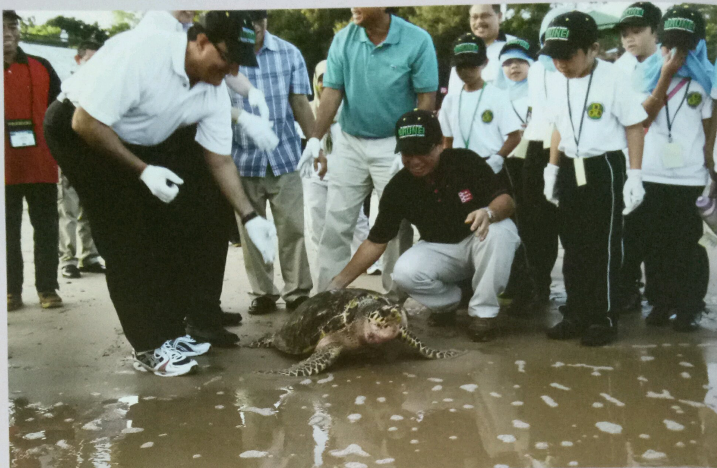
Photo shows an event to release a turtle by the Minister of Industry and Primary Resources, Pehin Dato Haji Awang Yahya on January 25, 2010 with the ministers from ASEAN members countries, India, China, Japan and Korea. The event was held in conjunction with the ASEAN Tourism Minister (ATF) 2010 meeting which was held in Brunei Darussalam from January 21 to 28.