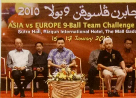
7 9-Ball Team Challenge 2010