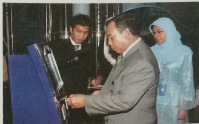
Minister of Energy launching the operation of SCP.

The official website for SCP was also launched which is available through