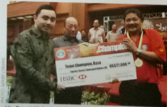
His Royal Highness presents a prize to the winner of 9-Ball Team Challenge 2010.

GADONG, January 17 – Team Asia won the Asia vs Europe 9-Ball Team Challenge 2010 by defeating Team Europe with 8-7.