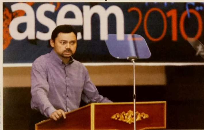
His Royal Highness delivers a sabda at the opening of ASEM workshop.

TUNKU LINK, January 4 – Brunei Darussalam must strive towards developing a culture of recognition of the importance of environmental conservation and protection.