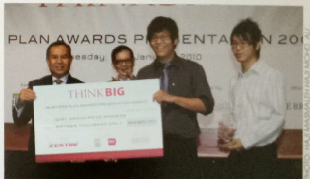
The Minister of Energy at the Prime Minister's Office presents a prize to the winner of the THiNK BIG Business Plan Competition Awards 2009/2010.

in the ICT field with the opportunity to develop their business ideas and enhance creativity.