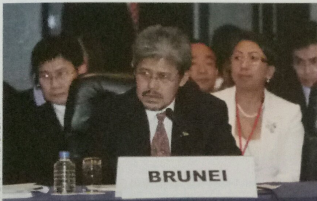
His Royal Highness Prince Mohamed Bolkiah, Minister of Foreign Affairs and Trade represents Brunei Darussalam to FEALAC.

TOKYO, JAPAN, January 17 - The 4 th Forum for East Asia-Latin America Cooperation (FEALAC) ended with the adopting of the Tokyo Declaration.