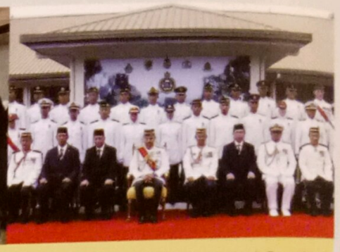
6 2 nd Intake Officer Cadets Sovereign's Parade