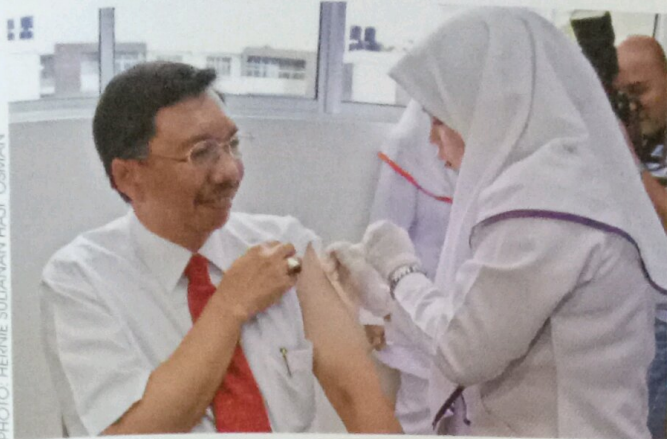
The Acting Minister of Health gets a vaccination at Berakas 'A' Health Centre.

BERAKAS, January 21 – Members of the public are advised to get their Influenza A (H1N1) vaccination as a precautionary measure against getting infected from the influenza.