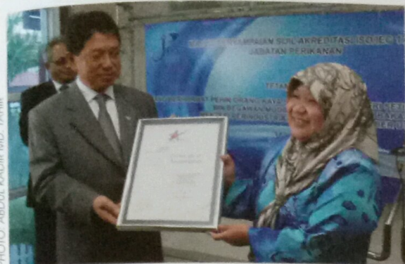
The Minister of Industry and Primary Resources at the ISO/IEC 17025 Accreditation Certificate presentation held at the Fisheries Department in Fish Landing Complex, Muara.

MUARA, January 14 – Fisheries Department achieved a historic milestone in its establishment as it has been accredited with ISO/IEC 17025 for the department's Fish Inspection and Quality Control laboratories.