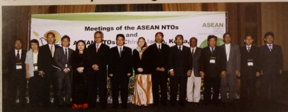
The Minister of Industry and Primary Resources in a group photo with the delegates of the National Tourism Organisations Meeting.

JERUDONG, January, 22 – ASEAN can expect 2010 to be a much better year for global tourism activities as the threat of global financial crisis is recovering. The view was endorsed by United Nations World Tourism Organisation (UNWTO) on their latest report on world tourism trend that 2010 shall be a positive growth for world tourism especially in the ASEAN region.