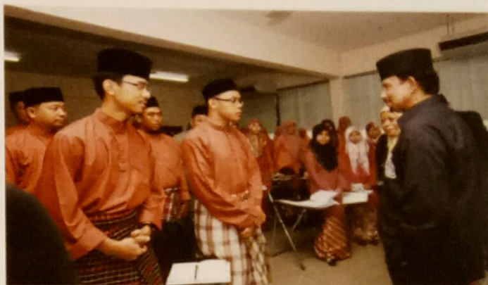
His Majesty The Sultan and Yang Di-Pertuan of Brunei Darussalam at the Seri Begawan Religious Teachers University College.