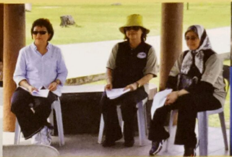
11 Attorney General's Chamber celebrates Golden Jubilee