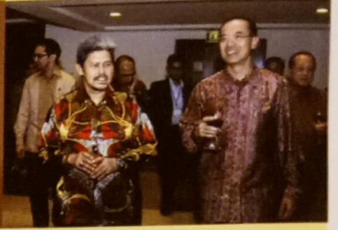
9 HRH attends ASEAN Foreign Ministers' Retreat