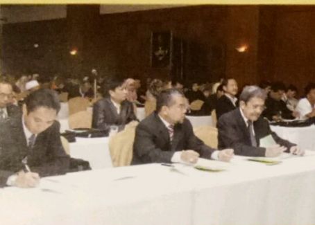
10 2 nd IOC Sports Medicine Course