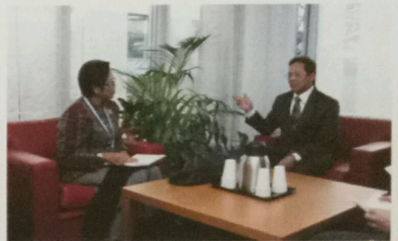
The Minister of Health at a bilateral meeting with his counterpart from the Republic of Indonesia, Her Excellency Dr. E.R Sedyaningih.

One of the vital agendas for Brunei Darussalam is the 'Prevention and Control of Communicable Diseases: