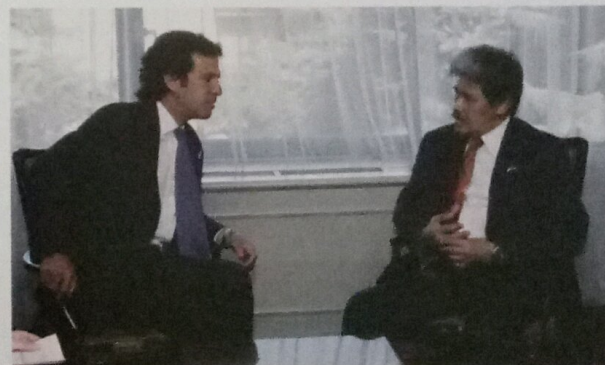
His Royal Highness held a bilateral meeting with the Minister of Foreign Affairs of Columbia at the Grand Prince Hotel Akasaka.

His Royal Highness is in Japan to attend the 4 th Forum for East Asia-Latin America Cooperation (FEALAC).