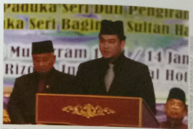
His Royal Highness delivers a sabda (royal speech) at the Official Closing Ceremony of the Southeast Asia Islamic Youth Conference.