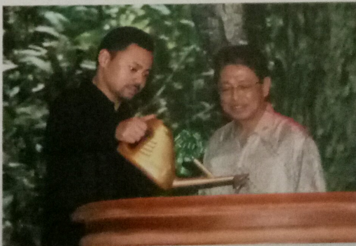
His Royal Highness officiates the ASEAN Tourism Forum (ATF) 2010.

The forum is held from January 21 to 28.