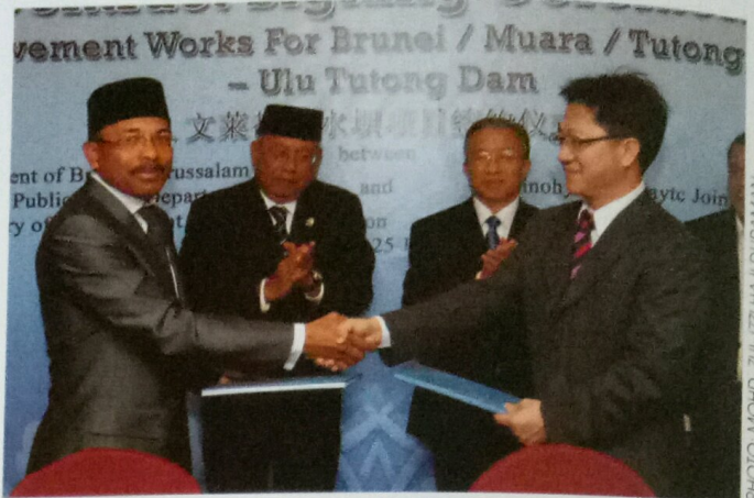
The signing ceremony witnessed by the Minister of Development and the State Councillor of the People's Republic of China.

ceremony was the Minister of Development, Pehin Dato Haji Awang Abdullah; and the State Councillor of the People's Republic of China, His Excellency Dai Bingguo.