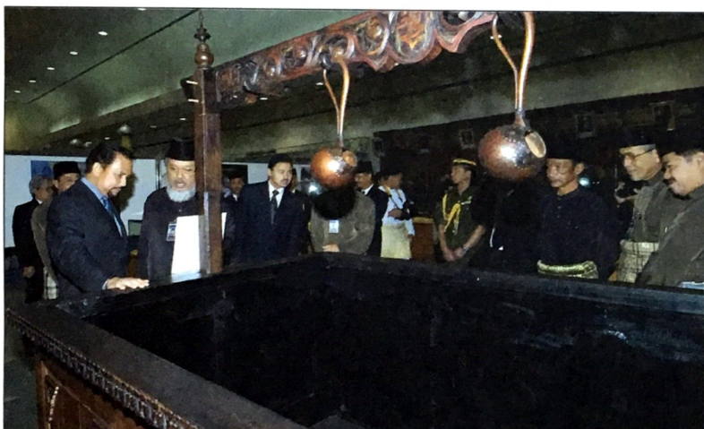
His Majesty looks at an old tub where Muslims use the water to perform ablutions before prayer

Seminar on mosque institution was a three-day event commencing from 19 – 21 July. A number of 14 working papers were presented which focused on the roles of mosque towards the development of the nation-state. Besides the seminar, an exhibition was also held where artefacts and products for mosque were showcased. The seminar and exhibition was also participated by few ASEAN member-states.