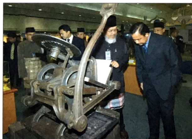
An old printing machine used to print Quranic verses was also exhibited