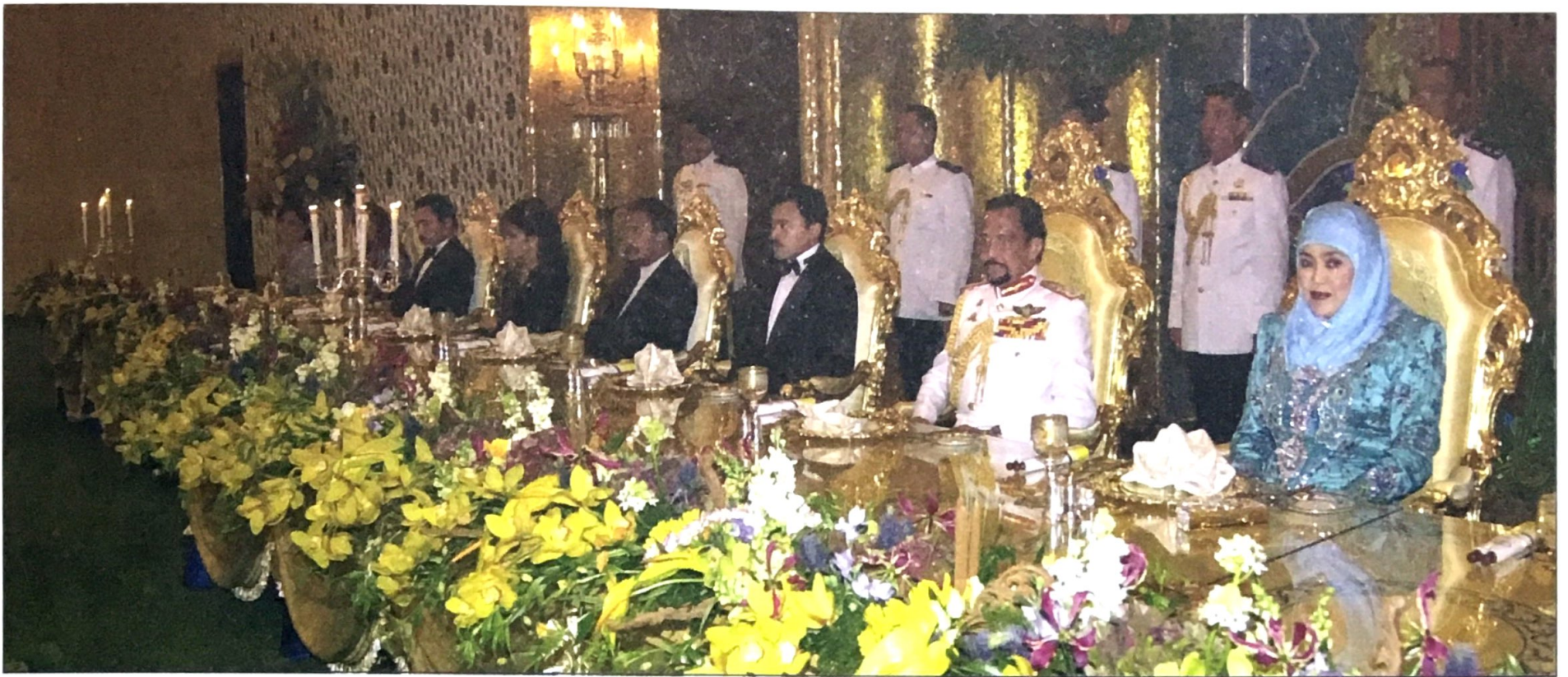
Royal entourage at the dinner for uniformed personnel