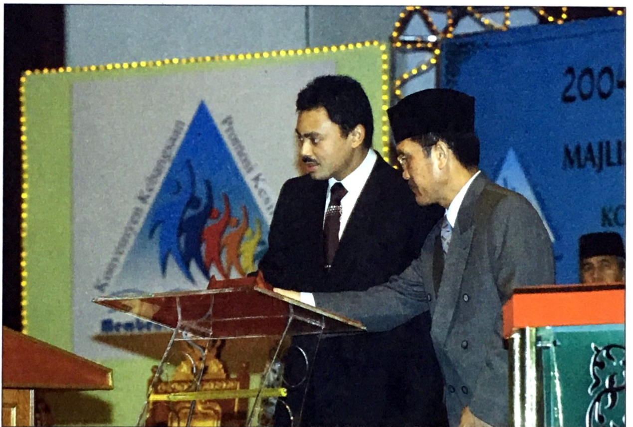
His Royal Highness launches the Seminar on Health Promotion

According to His Royal Highness, the effects of cigarette and smoking are no longer seen as an individual problem. However, it is now a national and state problem. The government of His Majesty The Sultan and Yang Di-Pertuan of Brunei Darussalam had spent a large amount for the provision of medication to patients who suffered