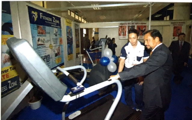
An exercising machine showcased at the Health Expo