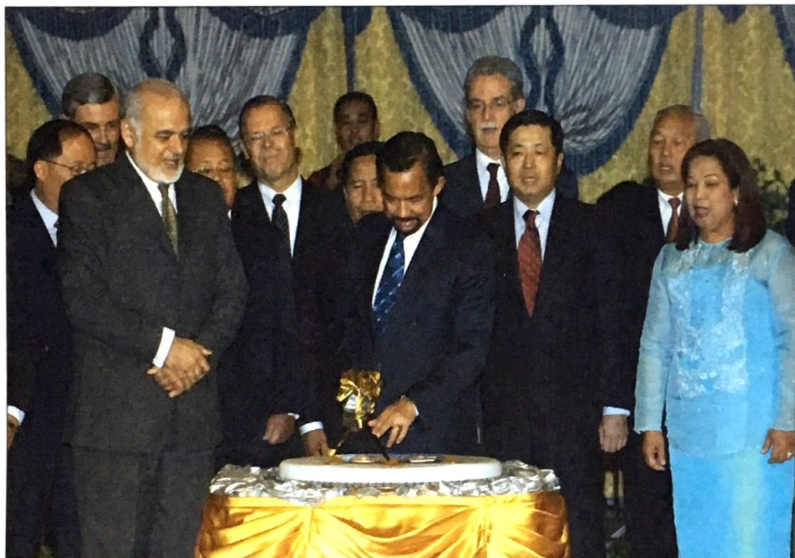
Foreign envoys celebrate the 58 th birthday anniversary of His Majesty The Sultan and Yang Di-Pertuan of Brunei Darussalam