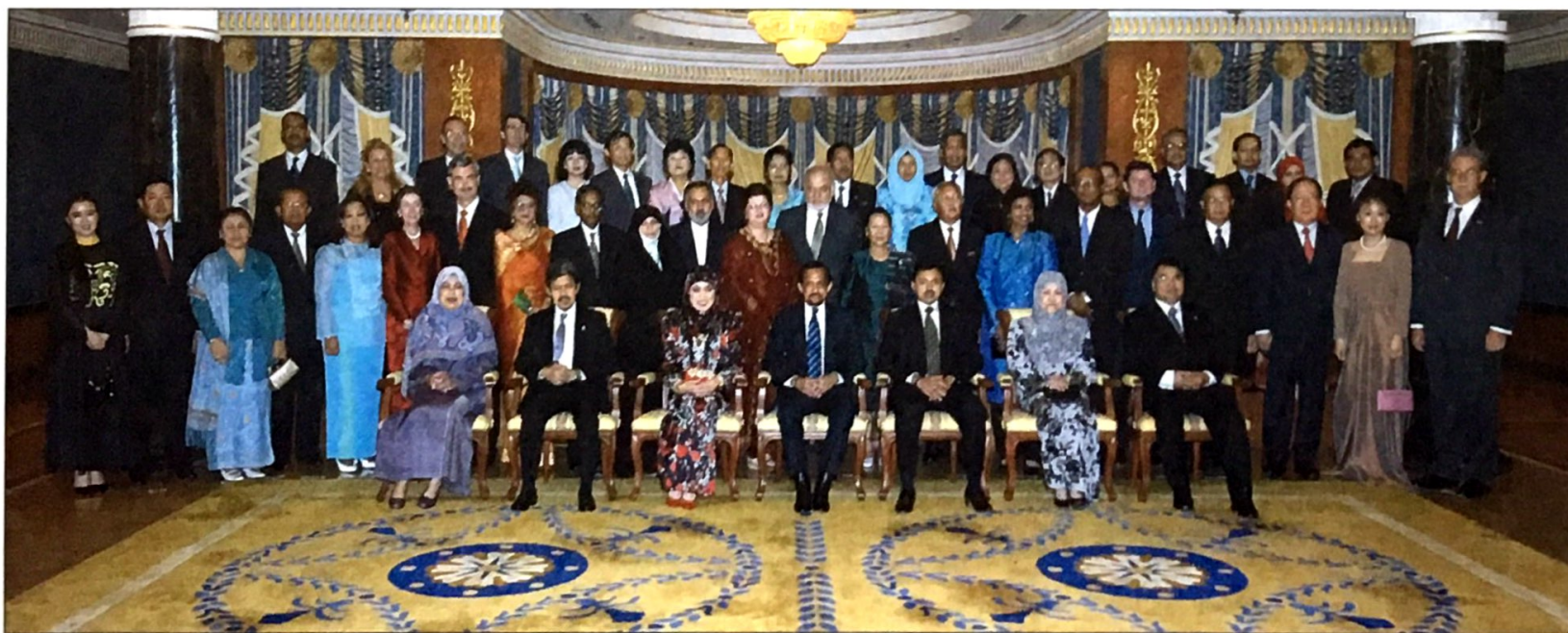
Their Majesties in a group photo with Brunei-based heads of diplomatic missions