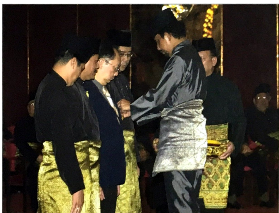
Eighty four people received the fourth class category of 'The Most Blessed Order of Setia Negara Brunei' award