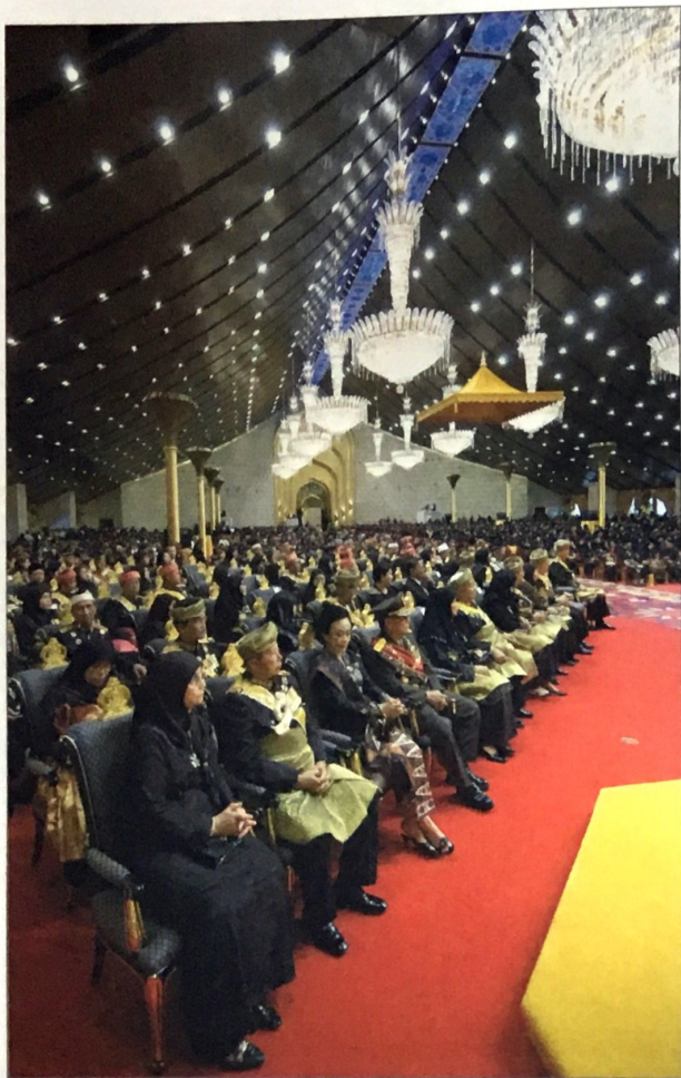
Nobilities and head of foreign diplomats are among the guests present at Balai Singghasana Indera Buana (throne chamber)

* from page one (HM's birthday anniversary speech)