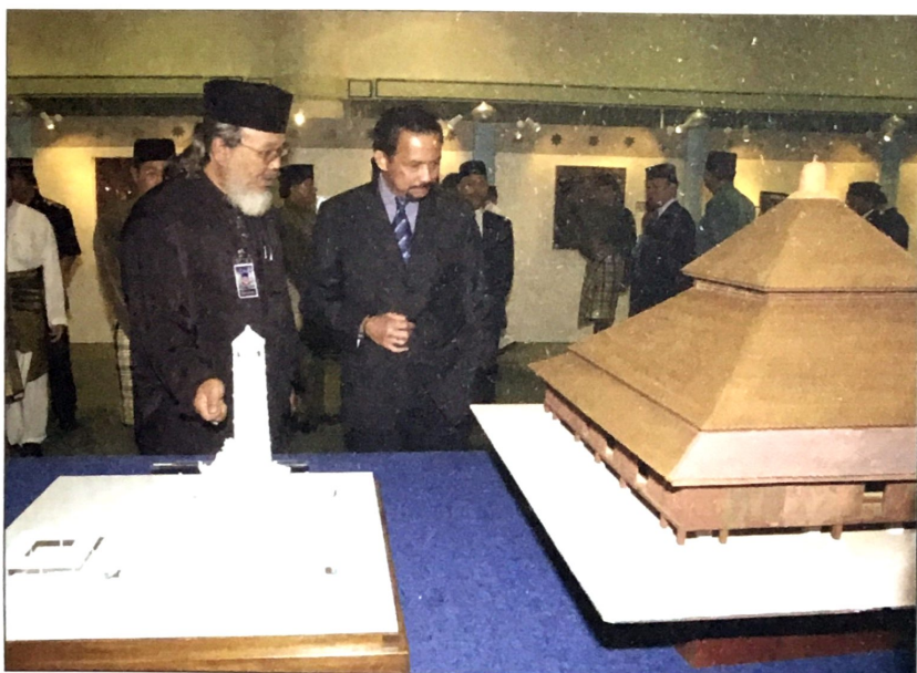
Models of various mosques exhibited at the seminar

His Majesty The Sultan and Yang Di-Pertuan of Brunei Darussalam said that knowledge oriented events are essential to be included in national celebrations.