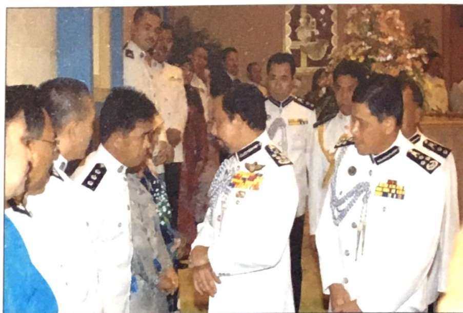
His Majesty receives greeting by a member of the Royal Brunei Police Force