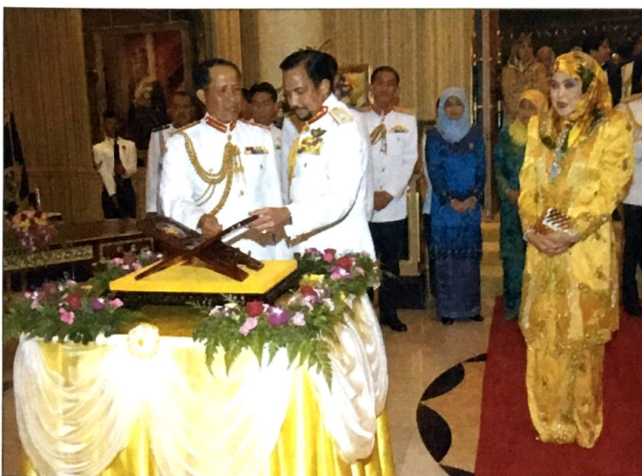
His Majesty receives a 'pesambah' (token of appreciation) from the Royal Brunei Armed Forces

H is Majesty Sultan Haji Hassanal Bolkiah Mu'izzaddin Waddaulah and Her Majesty Raja Isteri Pengiran Anak Hajah Saleha attended a banquet for uniformed personnel of government departments and civilian organisations on July 17. It was held at the Istana Nurul Iman in conjunction with the sovereign's 58 th birthday anniversary.