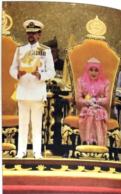
His Majesty delivers a royal speech at the Royal dais of the Balai Singghasana (throne chamber) Indera Buana at Istana Nurul Iman

tangible progress should be employed to make Brunei Darussalam more developed and competitive. For this purpose, the Long-term National Development Planning Board had been established. This board is to prepare a vision which is clear, open and easily understood by all citizens in this nation-state. The board is also given the responsibility to prepare development plans to succeed the 8 th National Development Plan.