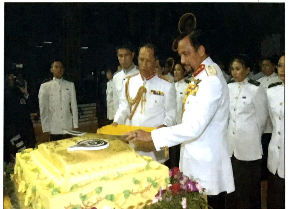
Cake-cutting ceremony as the highlight of the evening