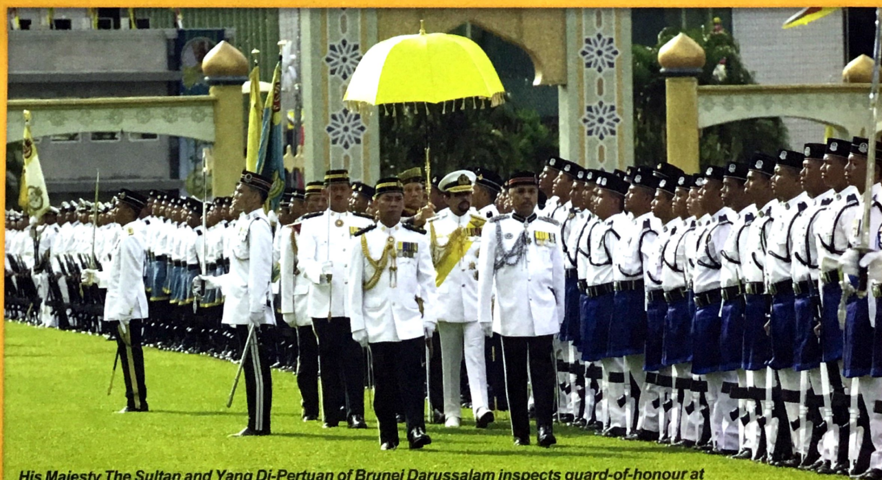
His Majesty The Sultan and Yang Di-Pertuan of Brunei Darussalam inspects guard-of-honour at Taman Sir Muda Omar Ali Saifuddien in Bandar Seri Begawan.