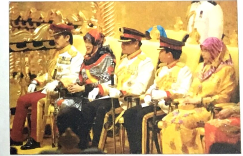
Members of the royal family at Balai Singghasana (throne chamber) Indera Buana