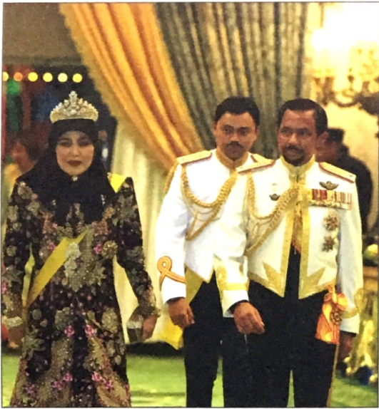
His Majesty The Sultan and Yang Di-Pertuan of Brunei Darussalam, Her Majesty The Raja Isteri and His Royal Highness Crown Prince arrive for the State Banquet