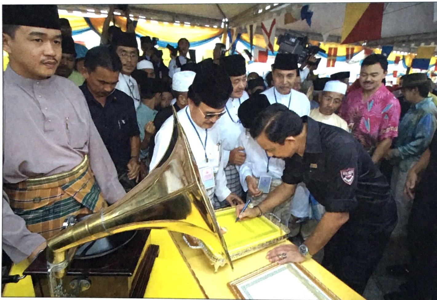
Brunei Muara District