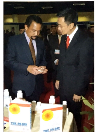
His Majesty tours the Health Expo where various health products are exhibited