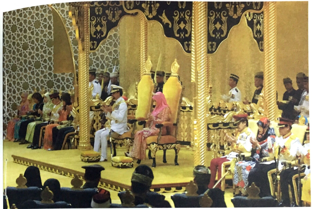
Prayer to mark His Majesty's 58 th birthday anniversary

The sovereign also expressed his hope that this Committee would try its best to remind all members of the public service of their role in fulfilling the national development ambitions. The Committee is also expected to encourage the private sector to sense their involvement as partner to the dynamic nation building.