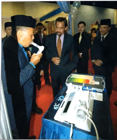
A health officer demonstrates how one of the health screening machine works

The National Health Promotion Convention is hosted by the Ministry of Health. One of the main objectives of the convention is to promote health awareness among members of the public.