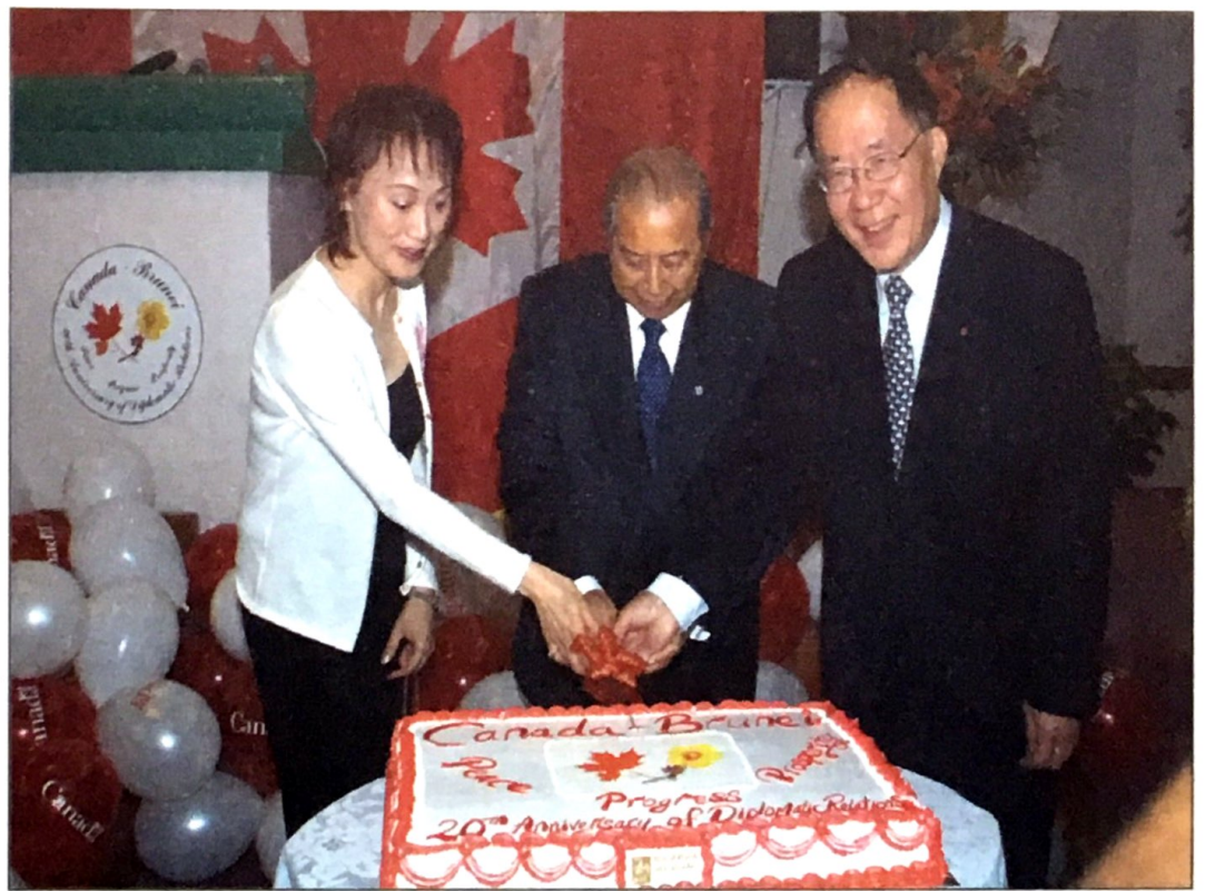
Brunei-Canada shares strong bilateral relationship