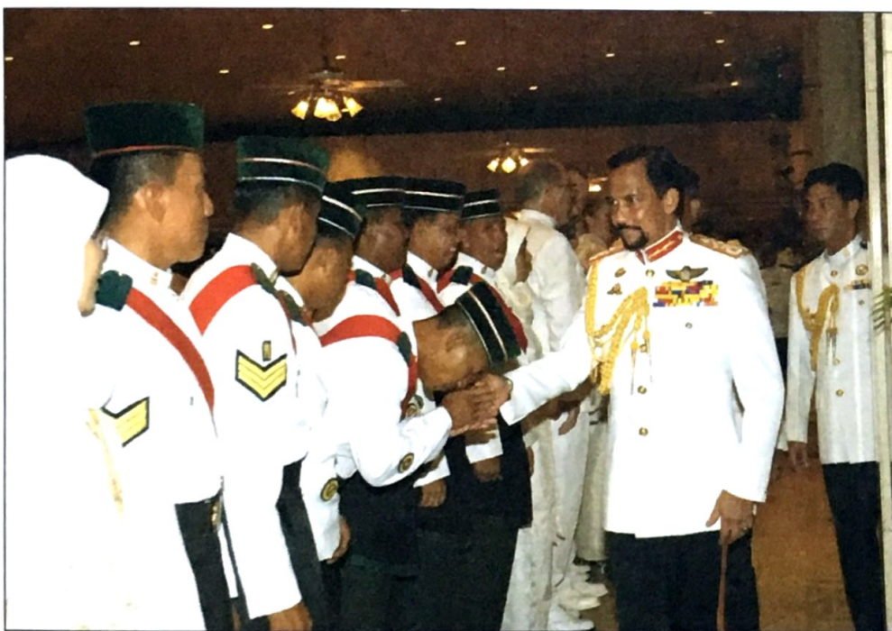
His Majesty greets members of the uniformed organisations