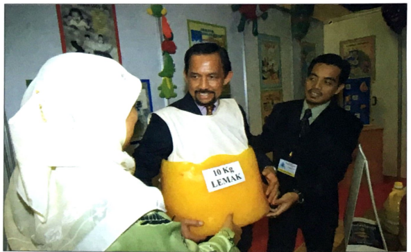
A health officer explains issues on obesity