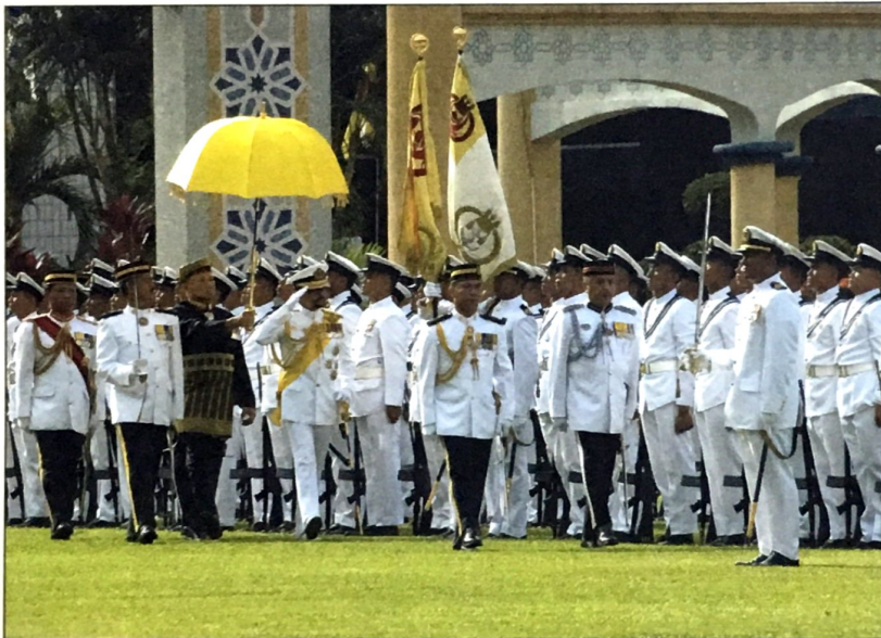
His Majesty inspects guard-of-honour at the capital, Bandar Seri Begawan

H is Majesty The Sultan and Yang Di-Pertuan of Brunei Darussalam on July 15 attended honour parade in conjunction with his 58 th birthday anniversary at the Taman Sir Muda Omar 'Ali Saifuddien in the capital.