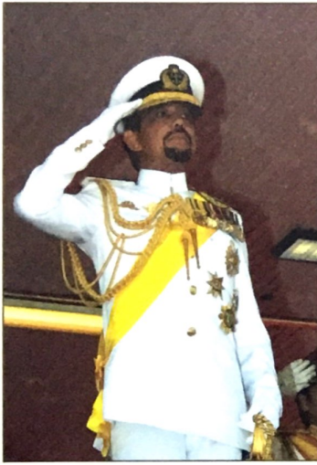
His Majesty upon arrival at Taman Sir Muda Omar Ali Saifuddien