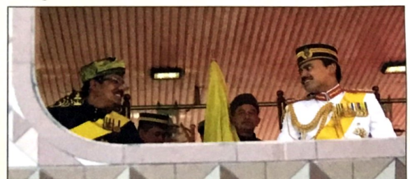
His Royal Highness Crown Prince Pengiran Muda Haji Al-Muhtadee Billah and His Royal Highness Prince Sufri Bolkiah among members of royal family present at the honour parade