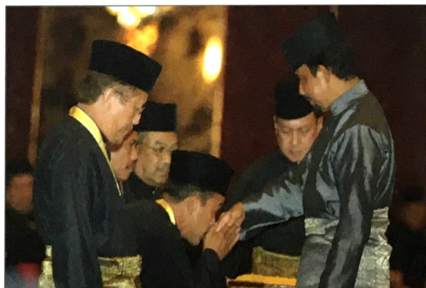
A number of 129 recipients receive their Order or medals on a separate day. Thirty one people received the third class category of 'The Most Honourable Order of Seri Paduka Mahkota Brunei' award