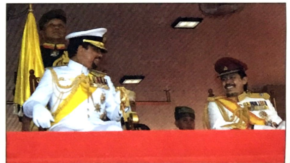
His Majesty shares a light moment with His Royal Highness Prince Mohamed Bolkiah