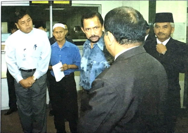
His Majesty listens to a briefing by one of the officers