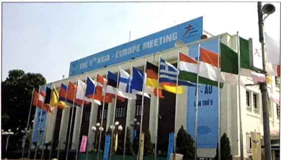
National flags of each state-members of ASEM