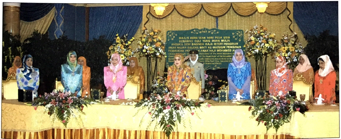
Her Majesty and members of the royal family at a ceremony marking Her Majesty's birthday