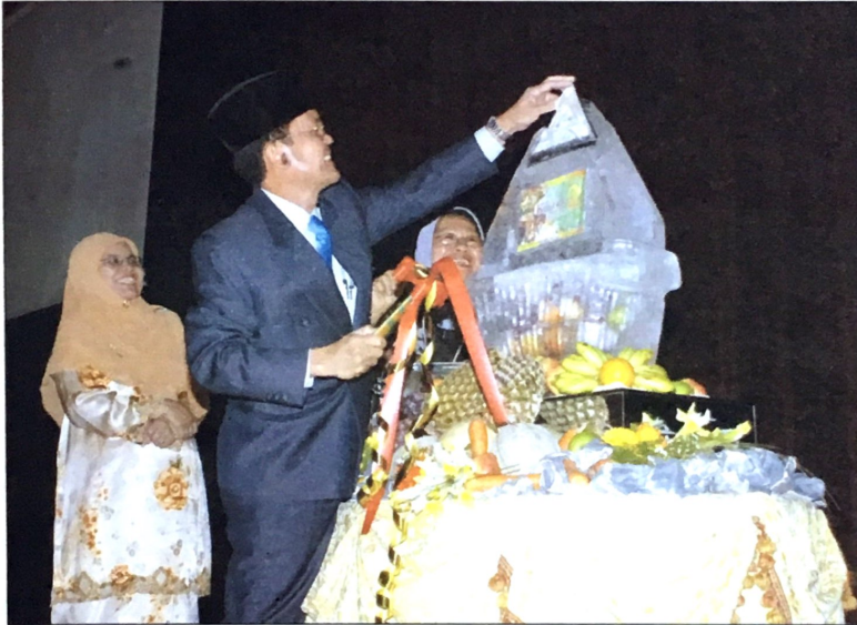
Minister of Health launching the logo and book

The launching of the "Healthy Recipes Collection 2" book is aimed to provide consumers with a healthier style of cooking.