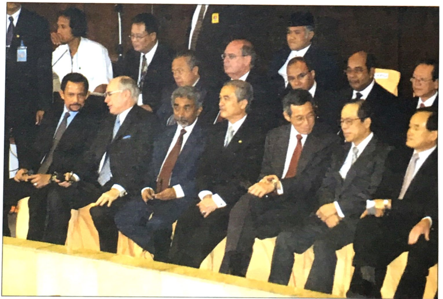
His Majesty with heads of state and government at the inauguration ceremony