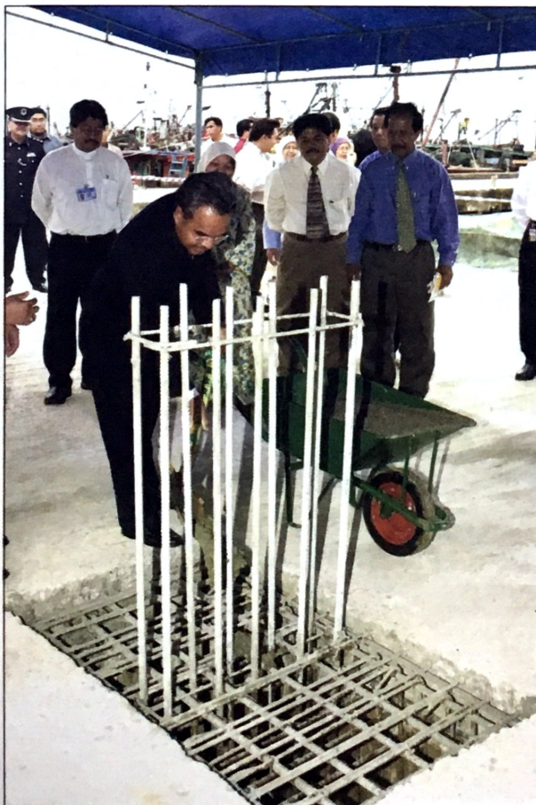
A foundation laying ceremony for the extended complex to accommodate more fishing ships

The current fish landing complex could no longer accommodate the growing amount of fishing ships. It was built in 1988 costing more than B$5.4 million.