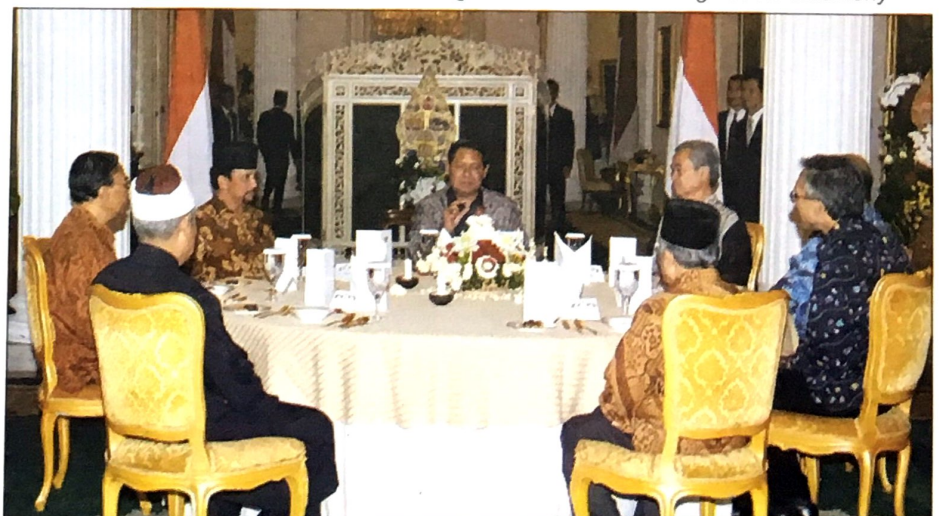
President Dr. Haji Susilo Bambang Yudhoyono and Muslim heads of state and government break fast at the Istana Negara