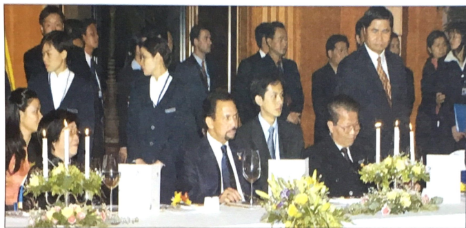
His Majesty at the Gala Dinner held at Melia Hotel (left)