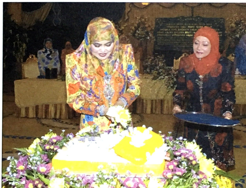
Her Majesty at a birthday celebration hosted by the spouses of Cabinet Ministers, Deputy Ministers and senior government officials