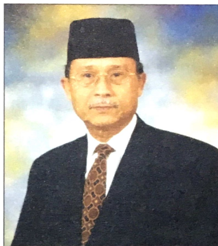
Pehin Dato Awang Haji Zakaria, Minister of Communications leading Brunei's delegation to 8th AMRI

5. A 30 minute segment would be dedicated for ASEAN news every week and to enhance the quality of the news by providing training to news producers.