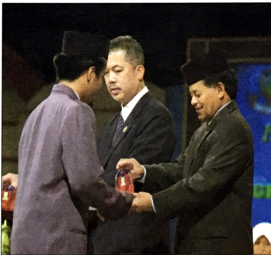
A winner of the Inforama Quiz 2004 receives his award

Inforama Quiz is held annually in its bid to promote the importance of information technology among members of the public.