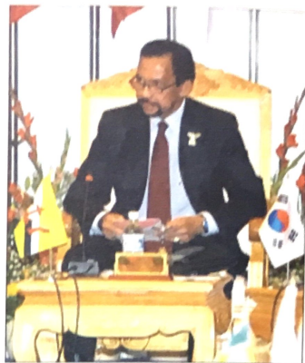
His Majesty delivers a speech at the First Closed Session