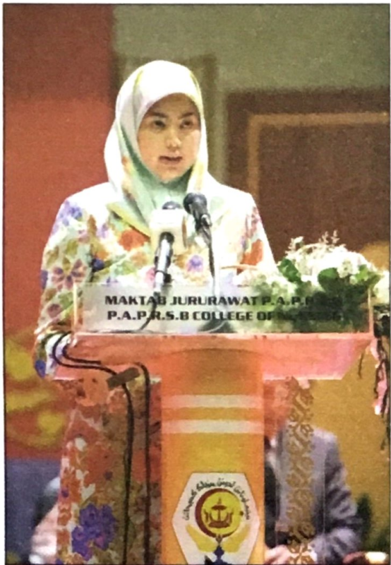
Her Royal Highness delivers a speech