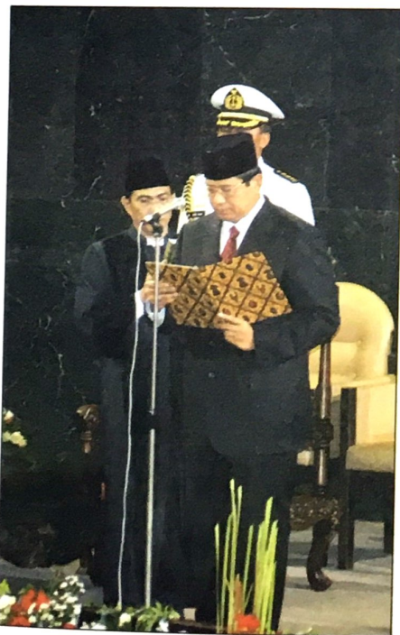
Sixth President of Indonesia sworn in