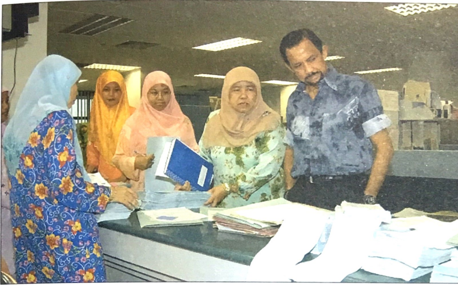
His Majesty at one of the divisions at the Ministry of Culture, Youth and Sports