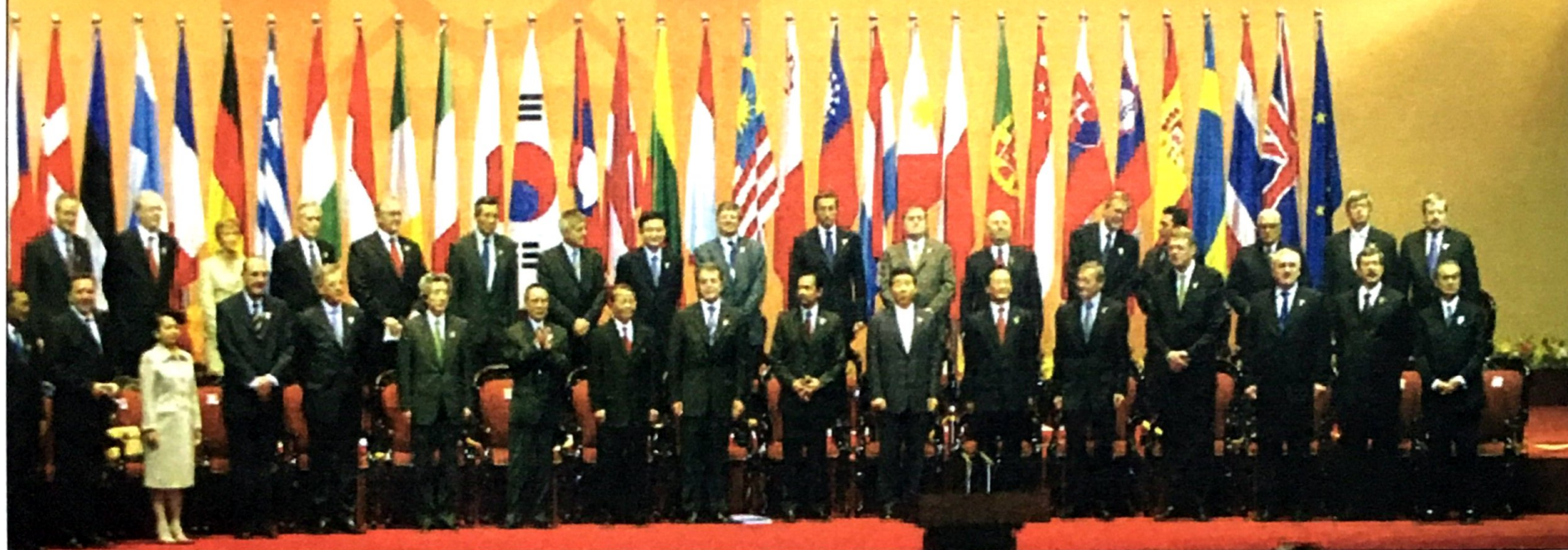
Heads of state and government from the Asia and Europe region at the 5th Asia-Europe Meeting