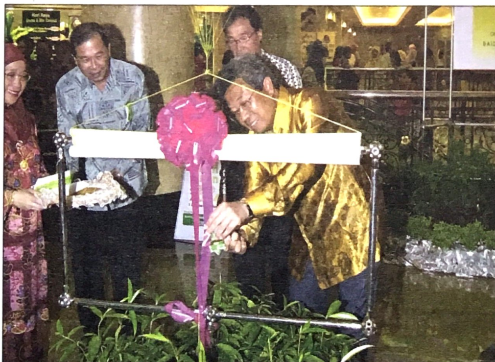
Brunei Grand Sale runs from October 1 to November 21

said that it was carried out with cooperation from more than 400 outlets in Brunei. Participating outlets are giving discounts 20 per