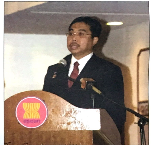
Deputy Minister of Home Affairs said immigration authorities should enhance and develop techniques to prevent crime

The three-day meeting was attended by ASEAN representatives. Various issues were discussed ranging from consular affairs and ASEAN's Plan of Action related to immigration matters.