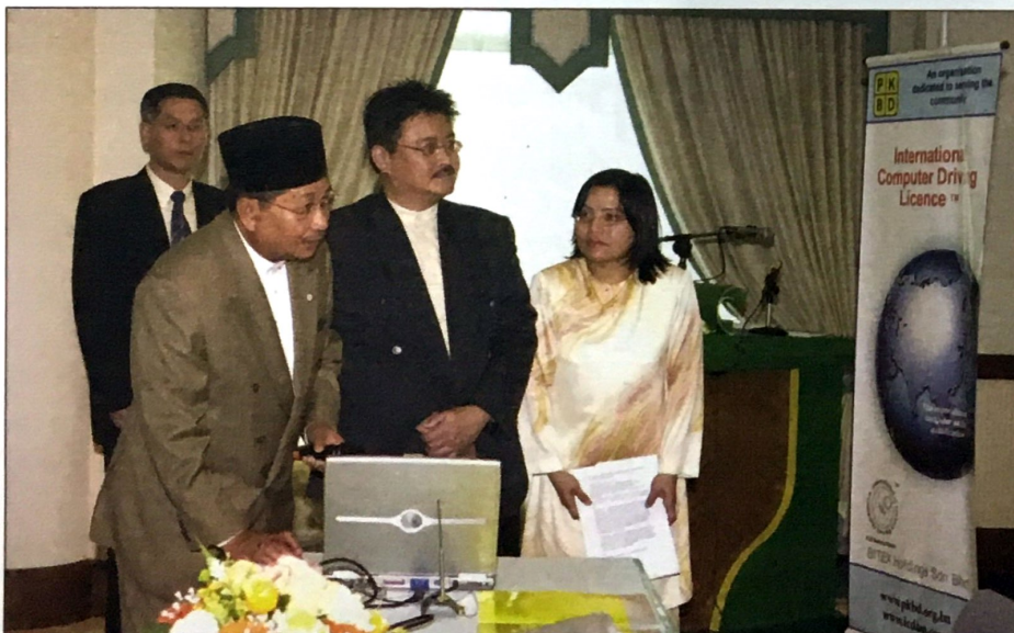
Pehin Dato Haji Awang Badaruddin officially opens BITEK 2004