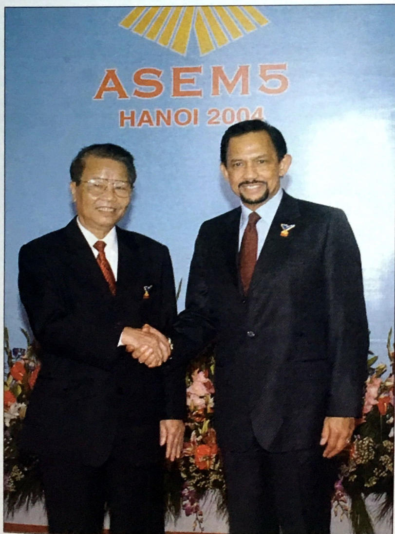
His Majesty greets the President of Viet Nam, His Excellency Tran Duc Luong at the 5th Asia-Europe Meeting

His Majesty The Sultan and Yang Di-Pertuan of Brunei Darussalam was in Hanoi to attend the 5 th Asia-Europe Meeting (ASEM 5) from October 8 to 9.