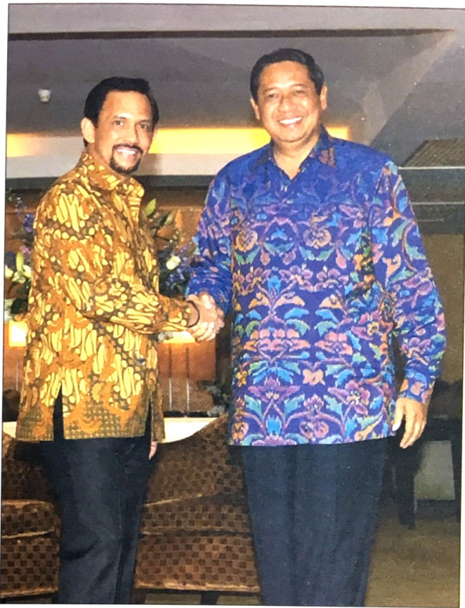
His Majesty greets the new President of Indonesia

His Majesty's itinerary was concluded with the breaking of fast with the newly elected president at the Istana Negara.