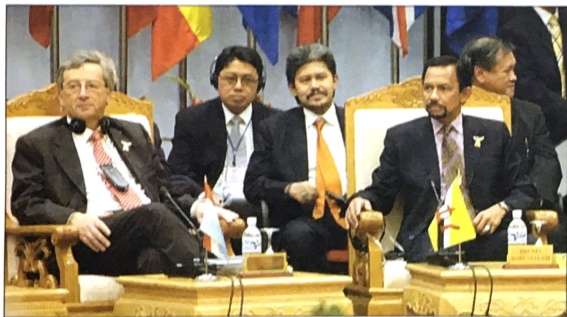
His Majesty and His Royal Highness Prince Mohamed Bolkiah at the closing session