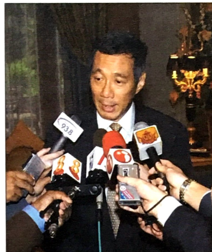
His Excellency at a press conference

Brunei and Singapore established its diplomatic relation on January 1, 1984. However, bilateral relation between both countries has existed since the 1970's where Brunei set up its government agency in Singapore on February 1, 1975. The status of the agency was upgraded to Commissioner on September 1, 1982 and a High Commissioner on January 1, 1984.