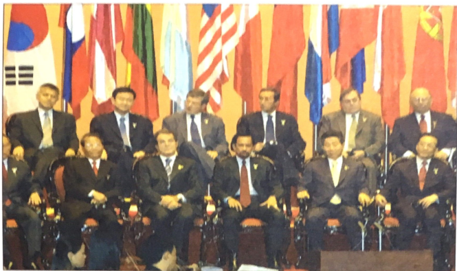
Heads of state and government at the 5th ASEM