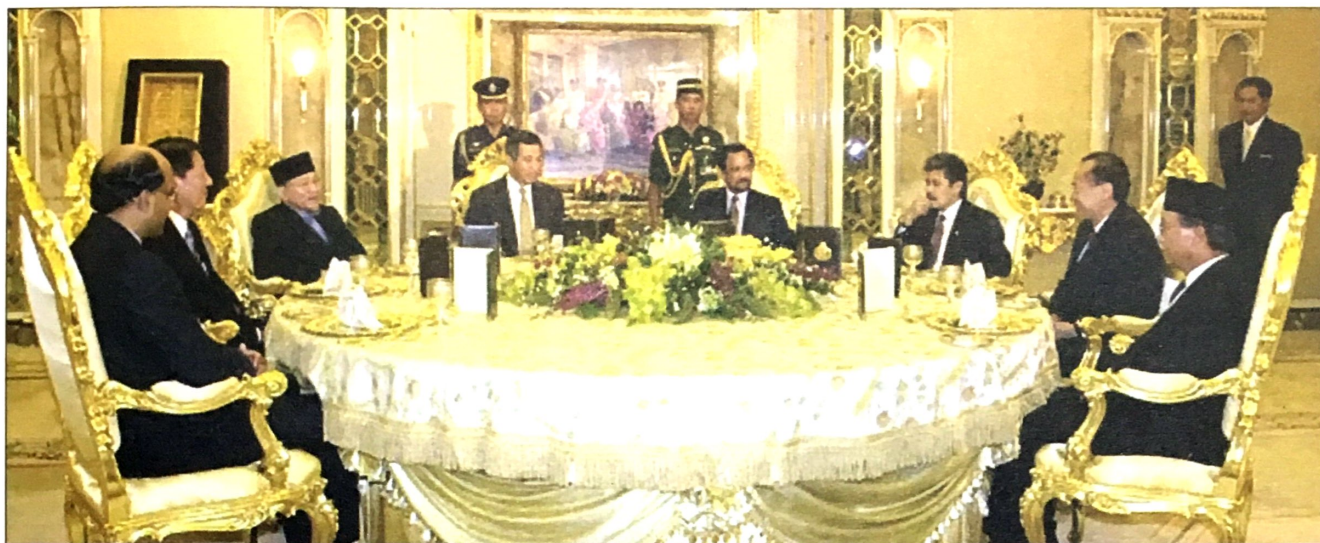
His Majesty hosts luncheon for the Prime Minister of Singapore at the Istana Nurul Iman