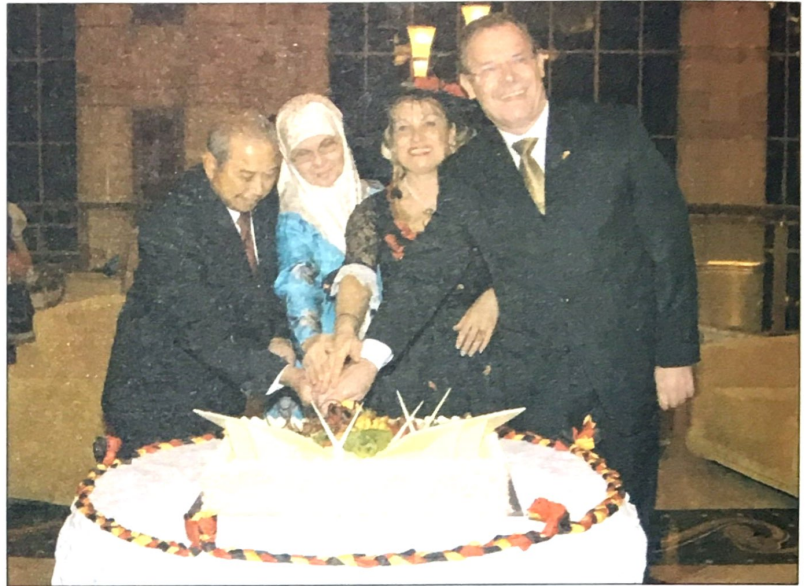
Cake-cutting ceremony as the highlight of the reception

Brunei and Germany bilateral relation were established on May 1, 1984.