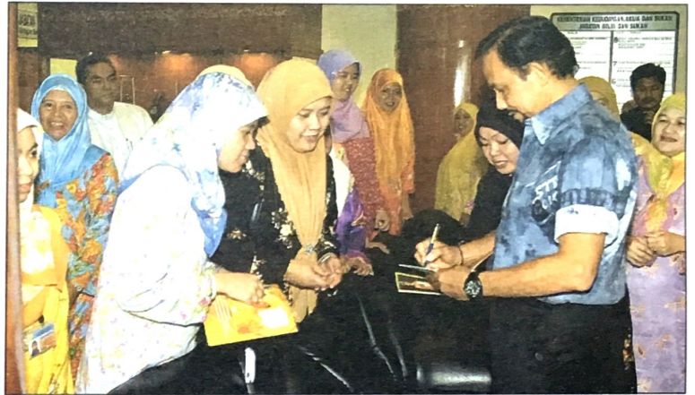
Officers and staff members taking the opportunity for an autograph from His Majesty as a memento