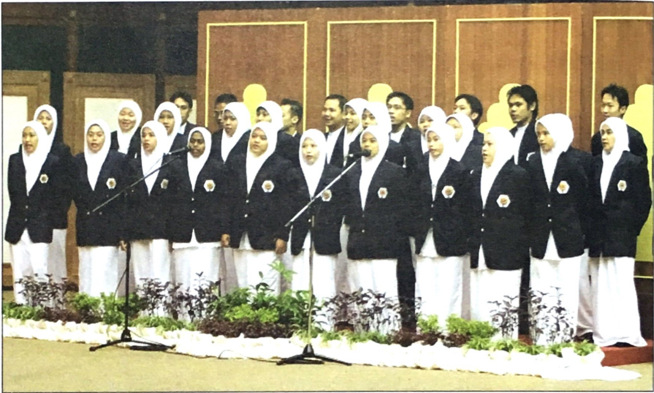
A choir performance by nursing students at the conference