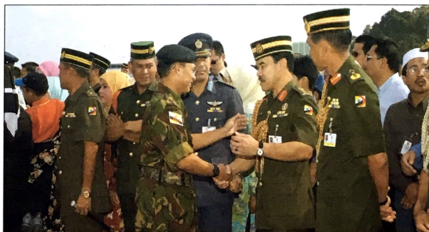
Personel from RBAF bids goodbye before departing for Mindanao

Brunei's desire to contribute towards peace. This is aligned with one of the priorities stated in the Defence White Paper 2004, where it supports stability