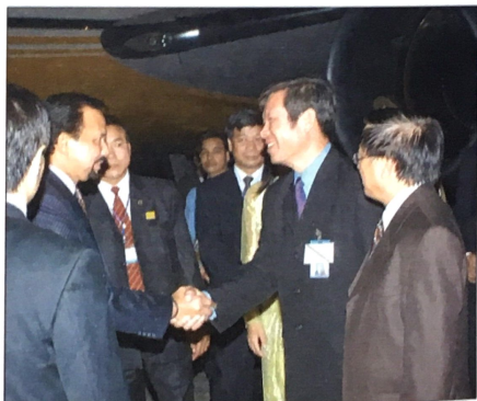
His Majesty upon arrival at Noi Bai International Airport