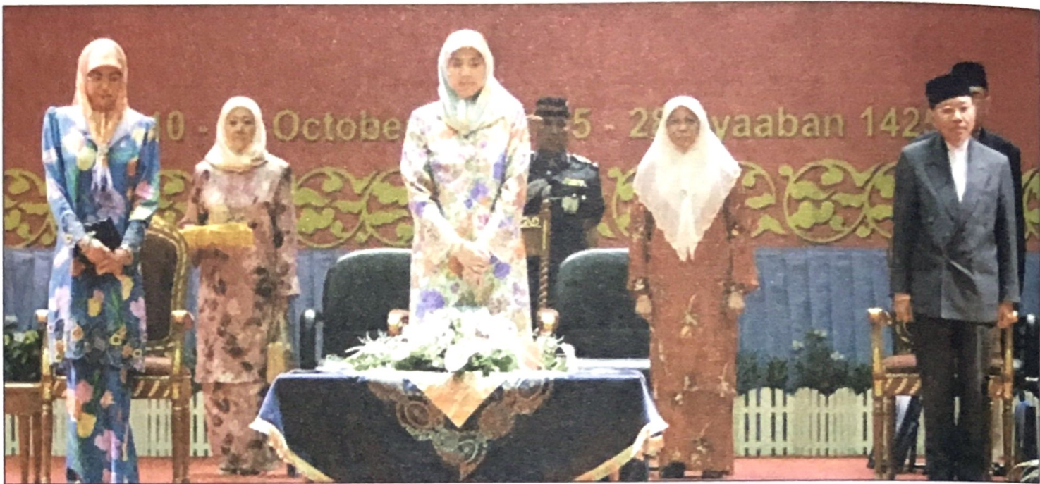
Her Royal Highness at the 6th International Nursing Conference