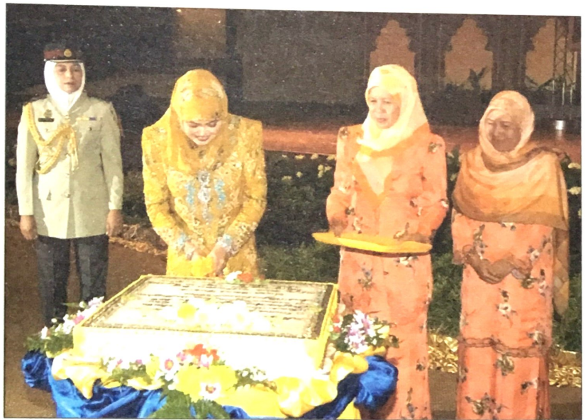
Her Majesty cutting her birthday cake during a celebration presented by Women Council of Brunei

While on October 10, Her Majesty attended another birthday celebration at the Royal Berkshire hall in Jerudong Park Polo Club. The ceremony was held by the spouses of Cabinet Ministers, Deputy Ministers and senior government officials.