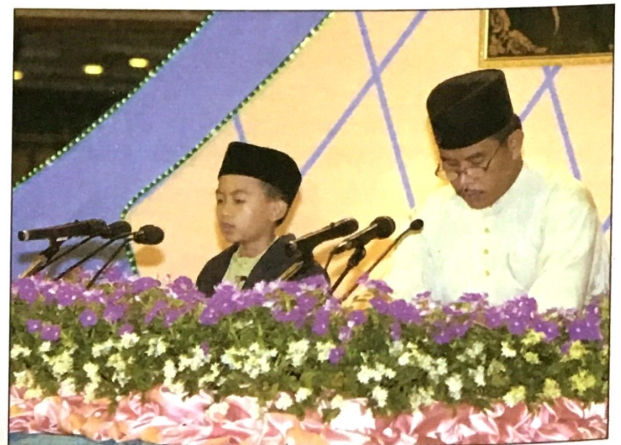
Winner of Category A (above left) reciting a surah from Al-Quran