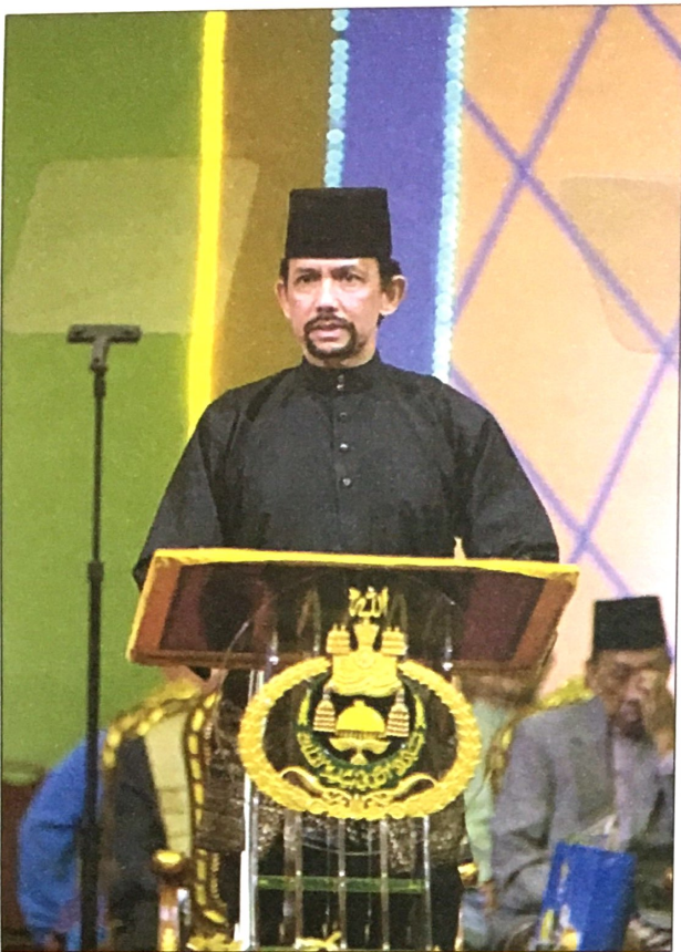
His Majesty delivers a royal speech at the Nuzul Al-Quran celebration