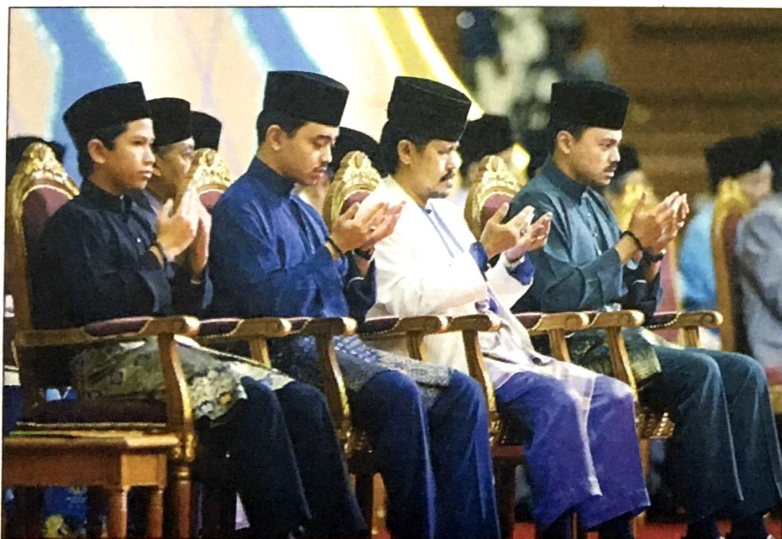
Royal entourage at the Nuzul Al-Quran celebration