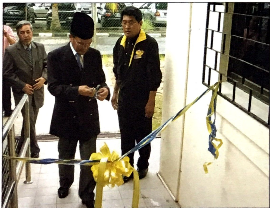
Minister of Health officially opens the building for SMARTER

International Nursing Conference is held annually and hosted by the Pengiran Anak Puteri Rashidah Sa'adatul Bolkiah College of Nursing.