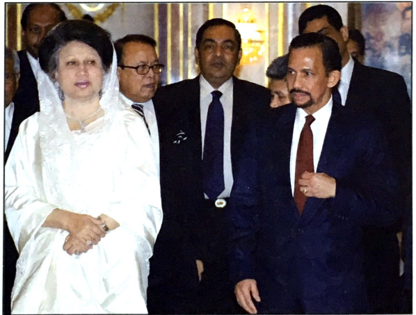
His Majesty Sultan Haji Hassanal Bolkiah Mu'izzaddin Waddaulah welcomes Her Excellency Prime Minister Begum Khaleda Zia of Bangladesh to a banquet to commemorate her two-day state visit to Brunei

His Majesty Sultan Haji Hassanal Bolkiah Mu'izzaddin Waddaulah, The Sultan and Yang Di-Pertuan of Brunei Darussalam remarked on January 25. His Majesty was hosting a banquet for Her Excellency Prime Minister Begum Khaleda Zia of Bangladesh who was in Brunei for a two-day state visit.