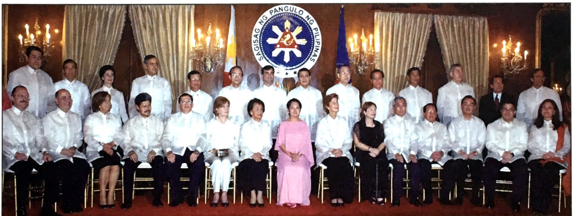
His Royal Highness with his East Asian and Latin American counterparts at a banquet hosted by Her Excellency the President of the Philippines