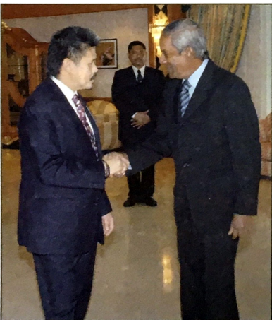
His Royal Highness Prince Mohamed Bolkiah welcomes His Excellency Professor S. Jayakumar, Singapore's Minister of Foreign Affairs and Law

His Royal Highness hosted a dinner for the Singapore entourage the same day. Both events were held at the Balai Penghadapan of Bukit Kayangan.