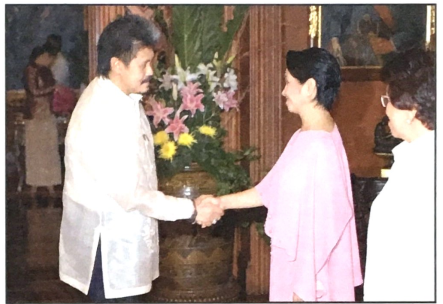
His Royal Highness meets Her Excellency President Gloria Macapagal Arroyo of the Philippines