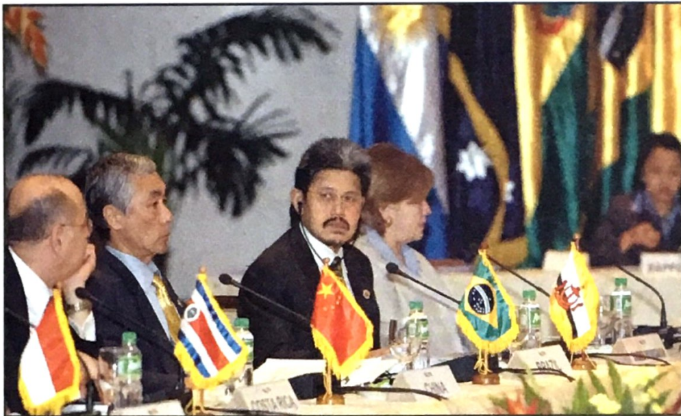
His Royal Highness Prince Mohamed Bolkiah, the Minister of Foreign Affairs at FEALAC's 2 nd Ministerial Meeting

Guatemala and Nicaragua joined FEALAC this year.