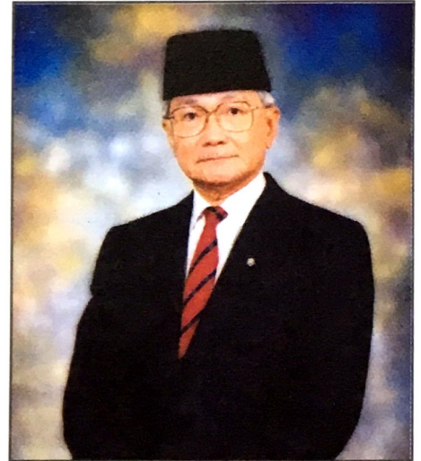
Pehin Dato Haji Isa, the Minister of Home Affairs reminds top management of each agency of his ministry to be responsive to customer demands

All personnel are expected to practice the ethical standards as required by the Public Service Ethical Standard guidelines.