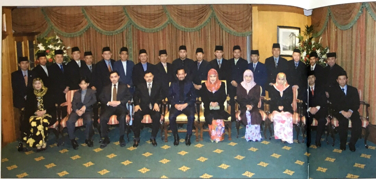
Members of royal family with the London-based personnel of the Brunei High Commission