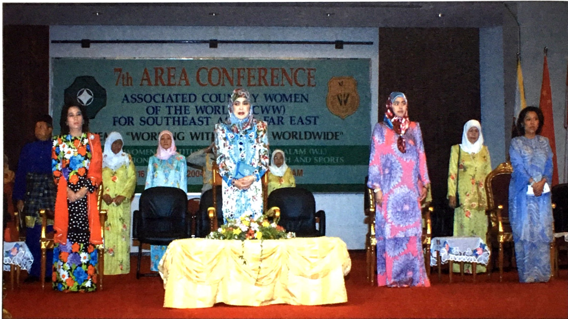
Her Majesty Raja Isteri Pengiran Anak Hajah Saleha at the opening ceremony for the 7 th ACWW Area Conference for South East Asia and the Far East

H er Majesty Raja Isteri Pengiran Anak Hajah Saleha urged states and non-state actors to exercise multifaceted approach to improve women's socio-economic conditions worldwide.