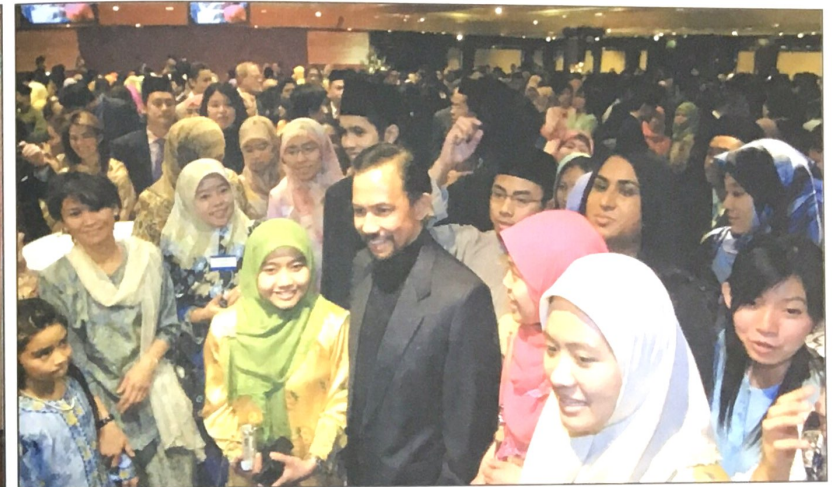
The sovereign meets Brunei students