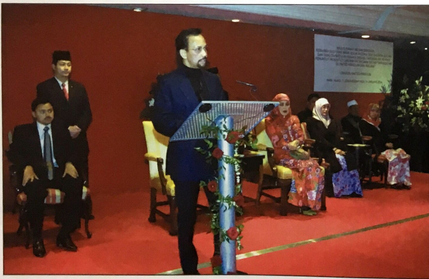
His Majesty The Sultan delivers a royal speech to Brunei students studying in United Kingdom and Republic of Ireland

Brunei expects its students at foreign educational institutions bring great visions and ideas when they return home. As a dynamic-minded generation, capable of viewing development with a discerning eye, they are the foundation of Brunei's continuous prosperity.