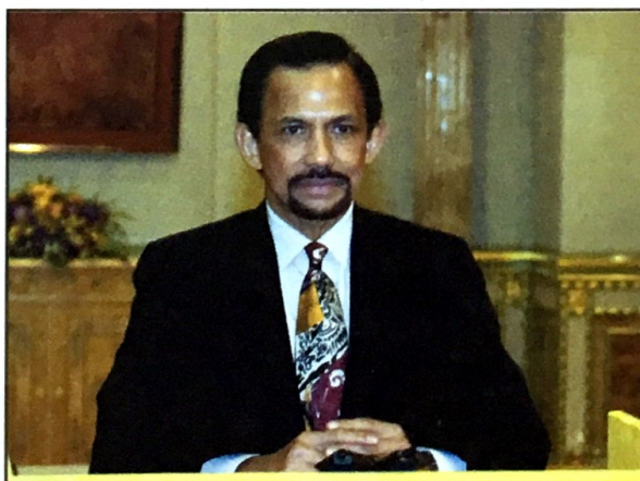
His Majesty Sultan Haji Hassanal Bolkiah Mu'izzaddin Waddaulah, The Sultan and Yang Di-Pertuan of Brunei Darussalam delivers a speech on the eve of New Year 2004

crime such as drug abuse, and actions that contravene the law and religion, which had surfaced at home. "These are causes of social ills that could eventually jeopardise peace and security," he said.