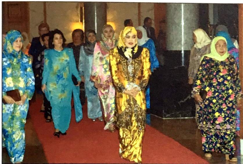
Her Majesty attends a dinner in conjunction with the 7 th ACWW's conference