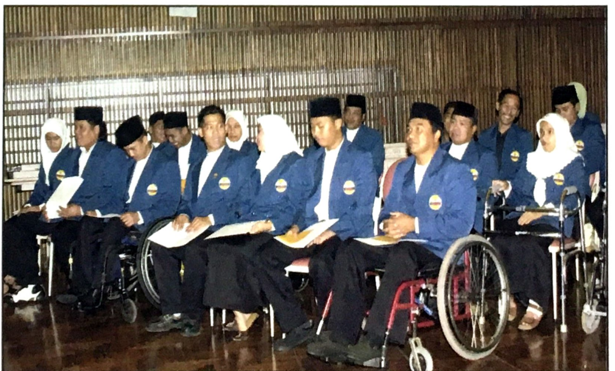
Brunei's athletes for the ASEAN Para Games return home with gold, silver and bronze medals