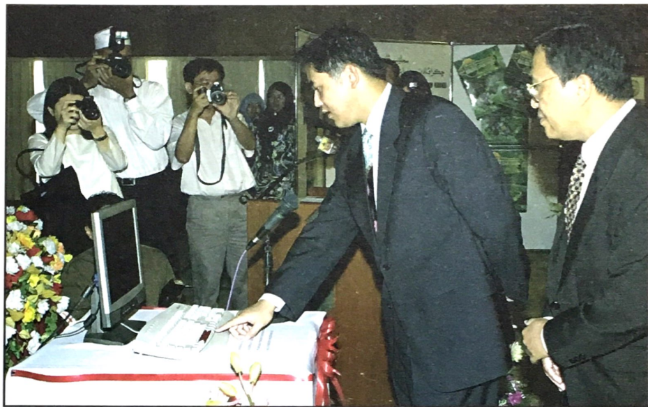
Yang Amat Mulia Pengiran Muda Abdul Qawi (centre), the guest of honour, officially launches the Museums Department CDs.