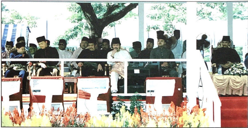
His Majesty Sultan Haji Hassanal Bolkiah Mu'izzaddin Waddaulah and members of the royal family at the Jame' Asr Hassanil Bolkiah mosque compound prior to the sacrificial slaughtering of animals ceremony.