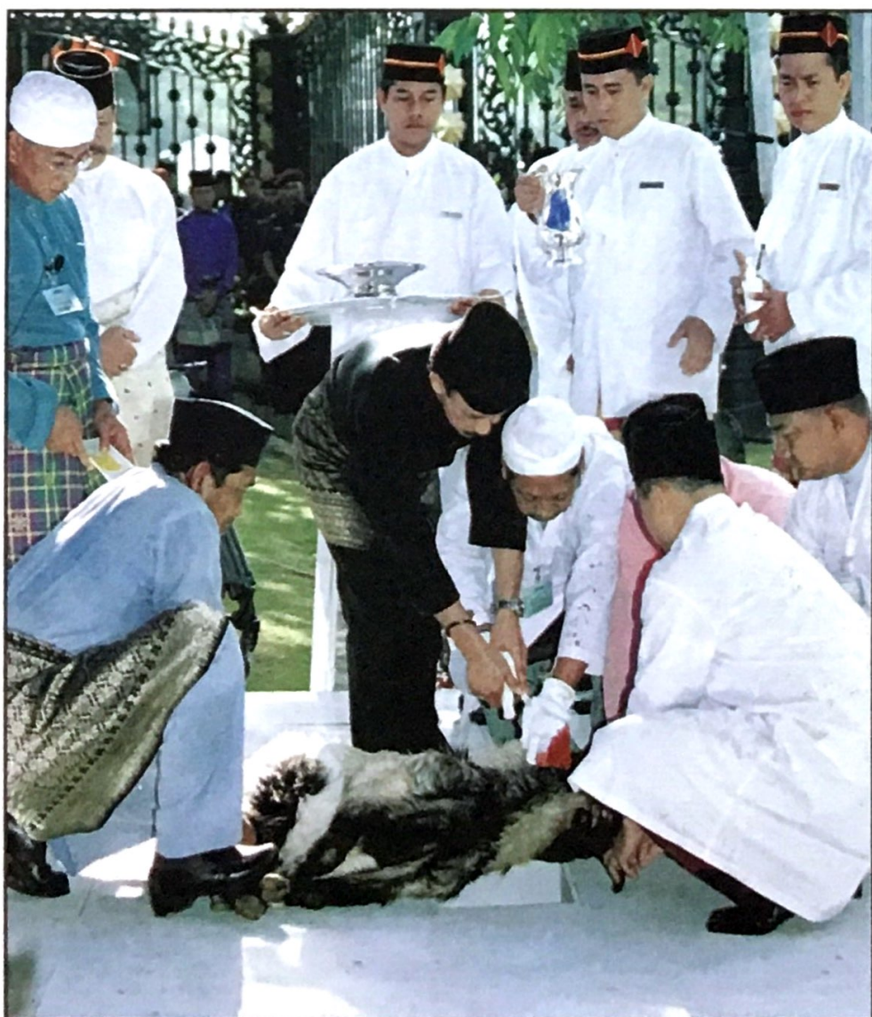
His Majesty The Sultan and Yang Di-Pertuan of Brunei Darussalam consents to lead the itinerary of the sacrificial slaughtering of animals ceremony.

His Majesty had consented to be the first participant, followed by members of the royal entourage. The morning's itinerary ended with the sovereign presenting the meat to 20 recipients from the Brunei-Muara district. The remainder of the meat were donated to 3,016 people nationwide.