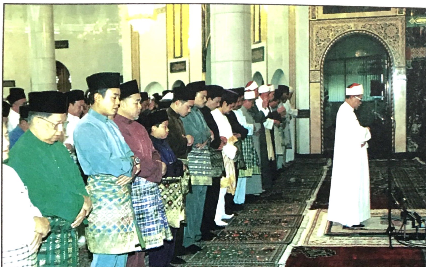
His Majesty Sultan Haji Hassanal Bolkiah Mu'izzaddin Waddaulah, the immediate members of the royal family and local dignitaries (front row) at the Jame' 'Asr Hassanil Bolkiah mosque for the aidil adha thanksgiving prayer.