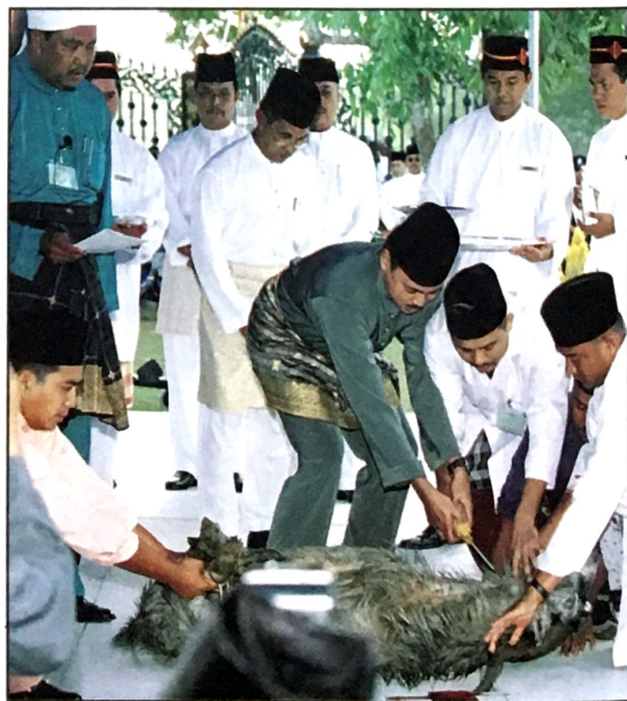
His Royal Highness The Crown Prince is the second participant.