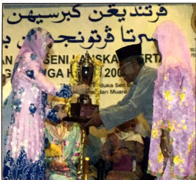
Her Majesty presents a trophy to one of the winners of the Cleanliness and Landscape competition