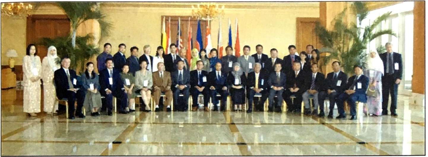
Delegates from ASEAN members at the Asean Social Security Association meeting