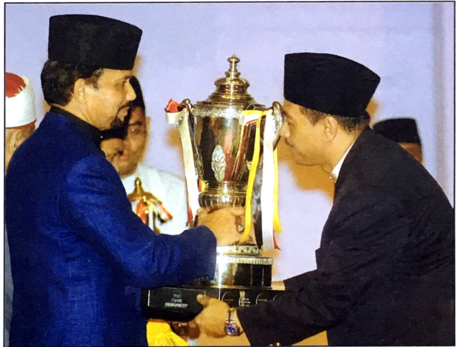
His Majesty Sultan Haji Hassanal Bolkiah Mu'izzaddin Waddaulah, The Sultan and Yang Di-Pertuan of Brunei Darussalam awards the winner of the Quran Reading Contest

H is Majesty Sultan Haji Hassanal Bolkiah Mu'izzaddin Waddaulah urged Muslims to reflect and find out where they stand today: either in support of civilisation or jahiliyya (ignorance that prevailed in the pre-Islamic era).