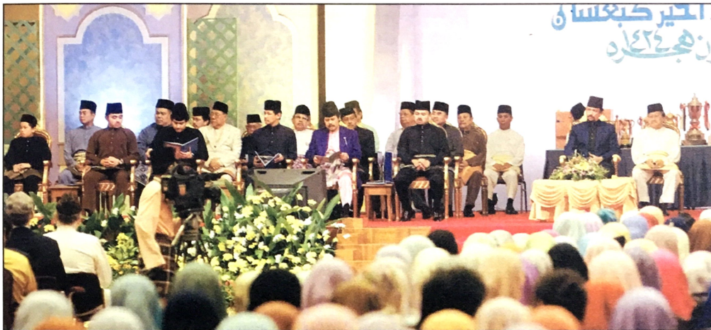
Members of royal family and guest at the National Quran Reading Contest