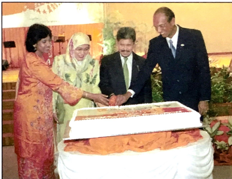
Brunei Darussalam and Singapore share strong bilateral cooperation