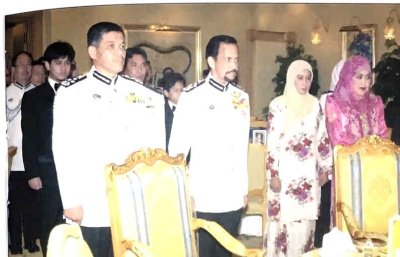
His Majesty and Her Majesty at a dinner hosted by the Royal Brunei Police Forces