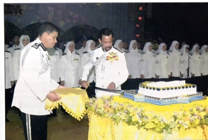
Cake cutting ceremony as the highlight of the evening