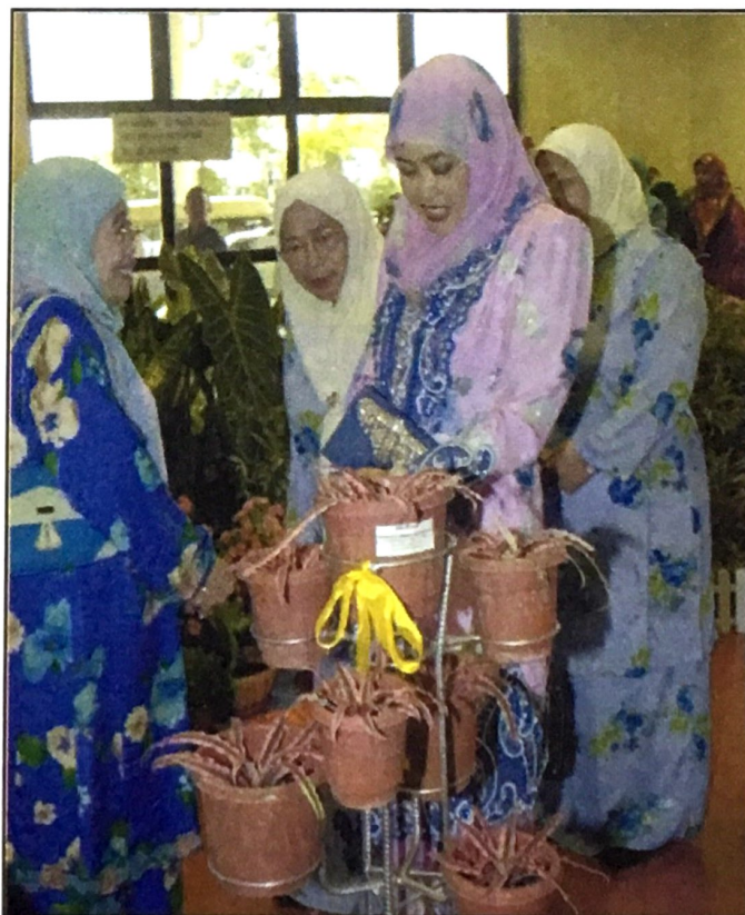
Her Majesty at the Live Flower Exhibition held at the International Convention Centre

The ceremony was organised by Brunei Darussalam Women's Institute (WI) and the Department of Environment, Parks and Recreation of the Ministry of Development in conjunction with His Majesty's 57 th Birthday.