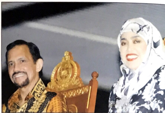
His Majesty The Sultan and Her Majesty The Raja Isteri at the 'Malam Serumpun' held at the Taman Haji Sir Omar Ali Saifuddin

Among the itineraries for 'Malam Serumpun' were Borneo tug-of-war competition; fireworks display; cultural performances and floats procession.