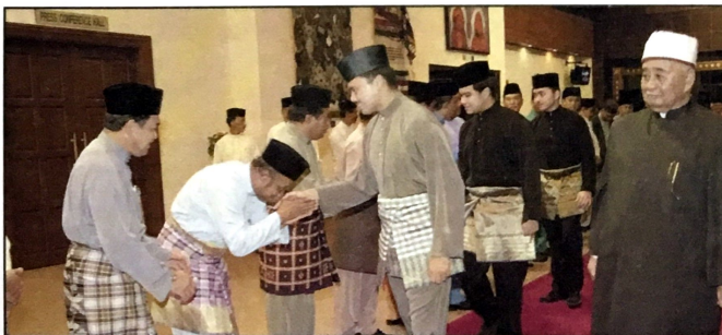
Arrival of royal entourage at the National Quran Reading Contest