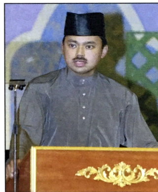
His Royal Highness Crown Prince Pengiran Muda Haji Al-Muhtadee Billah at the opening ceremony of the National Quran Reading Contest

"Same with the heart; if forsaken it will meet similar fate because the heart is susceptible to negligence that leads one astray and to self-destruction," he said.