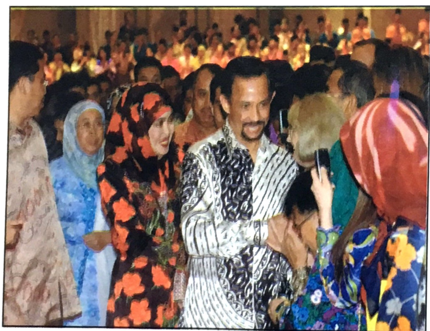
His Majesty and Her Majesty greet invited guests at the gala night