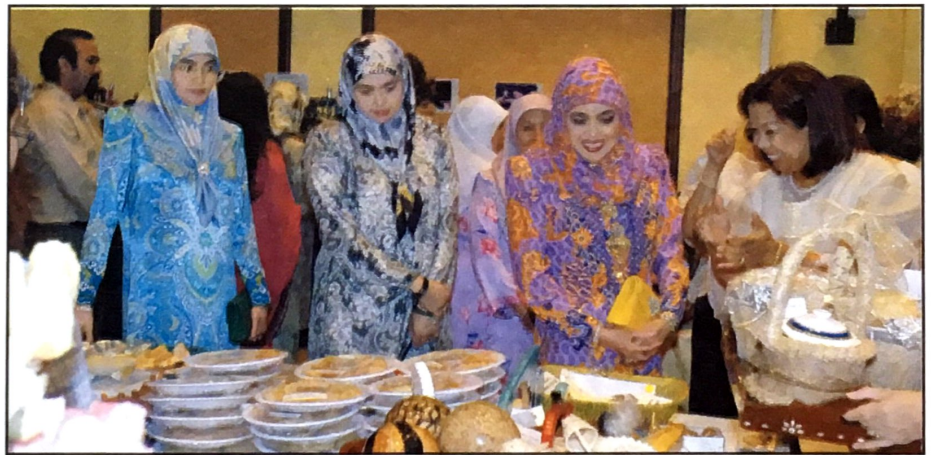
Her Majesty The Raja Isteri and royal entourage at the Philippine's booth at the domestic science exhibition

As a member of the community, everyone plays a significant role in giving attention and priority to family and home.