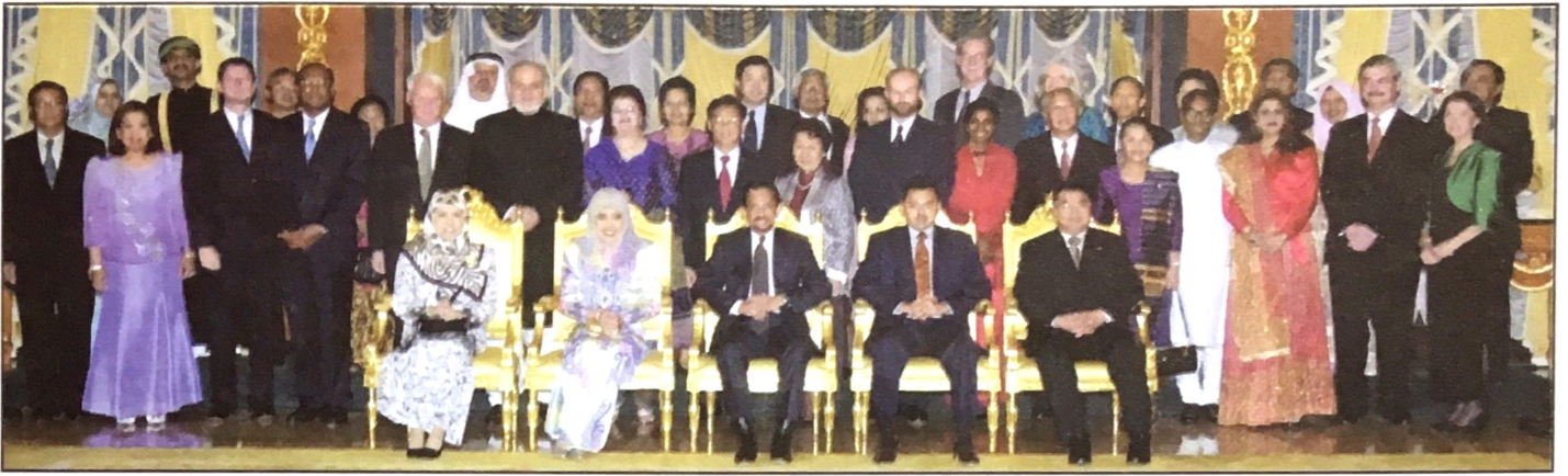
Foreign envoys celebrate His Majesty's 57 th birthday