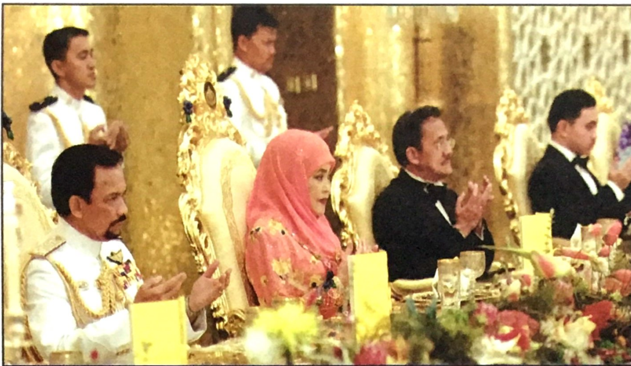
Royal entourage at the dinner for uniformed personnel