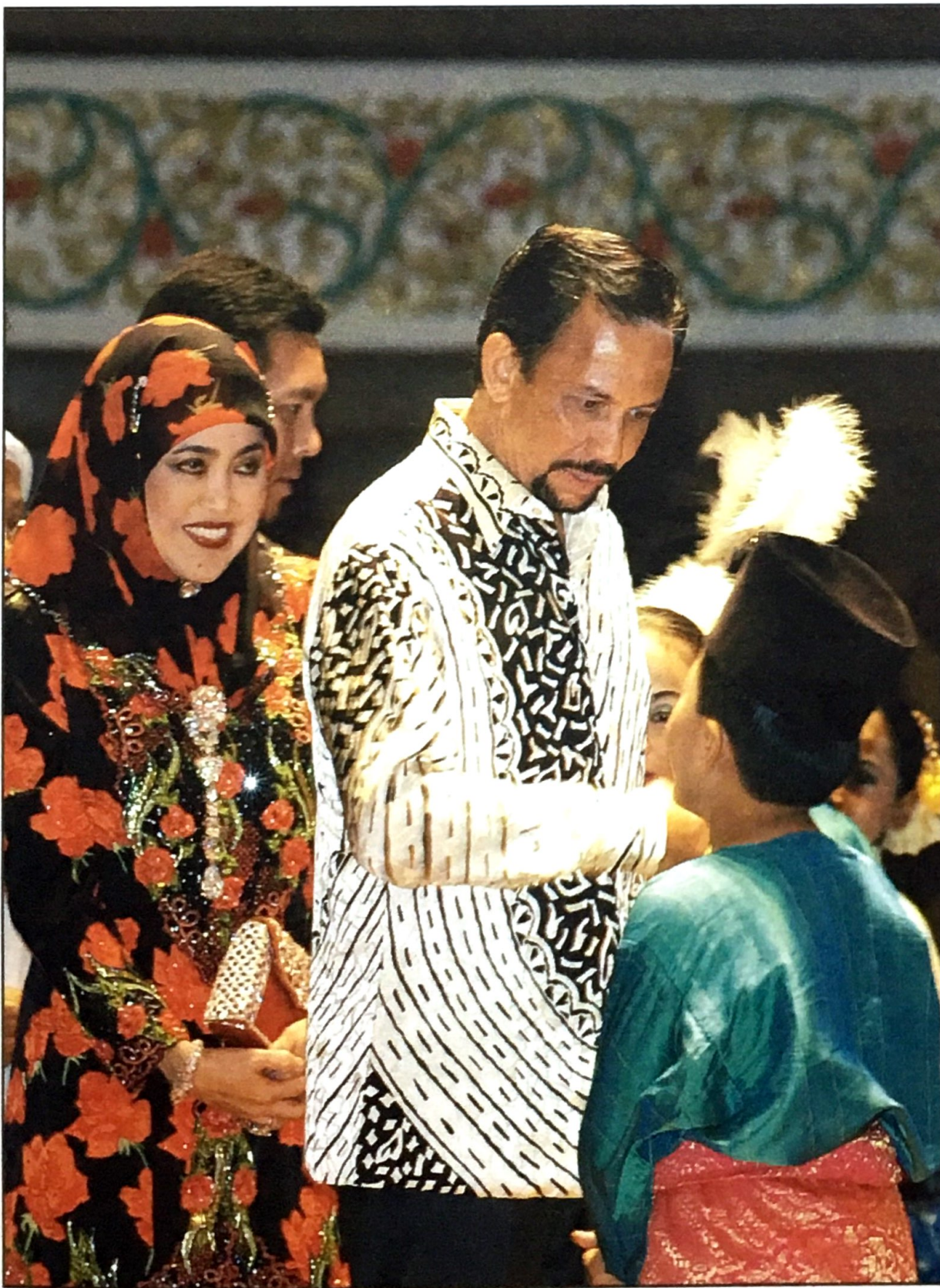
His Majesty Sultan Haji Hassanal Bolkiah Mu'izzaddin Waddaulah, The Sultan and Yang Di-Pertuan of Negara Brunei Darussalam and Her Majesty Raja Isteri Pengiran Anak Hajah Saleha at the gala night to celebrate His Majesty's 57 th birthday