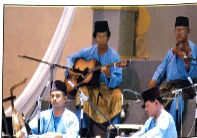
Musicians of the Johor Heritage Foundation