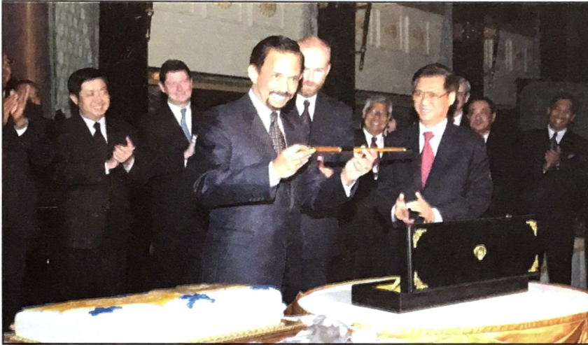
His Majesty receives a 'pesambah' (token of appreciation) from foreign envoys