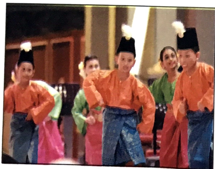
Talented youngsters performing a Malay cultural dance