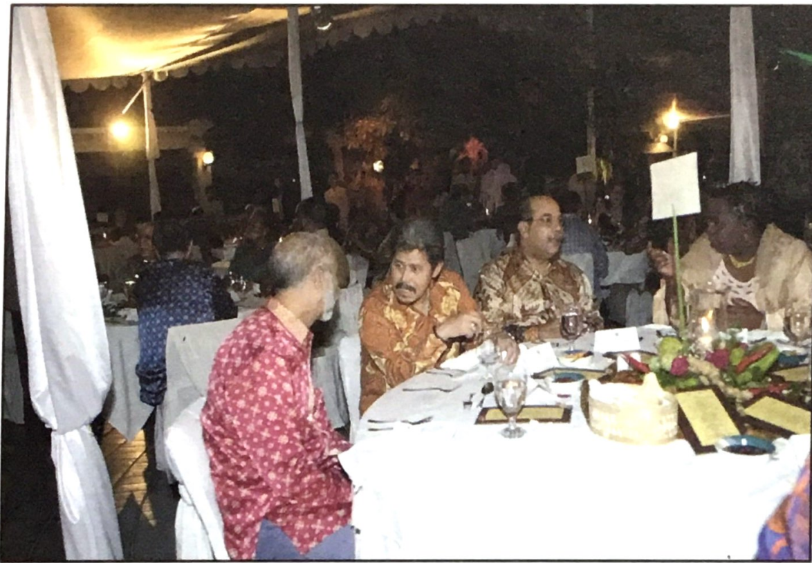
His Royal Highness Prince Mohamed Bolkiah at the first Asian-African Sub-Regional Organisations Conference in Bandung, Indonesia

His Royal Highness Prince Mohamed Bolkiah, Minister of Foreign Affairs attended the first Asian-African Sub-Regional Organisations Conference (AASROC) on July 29 in Bandung, Indonesia.