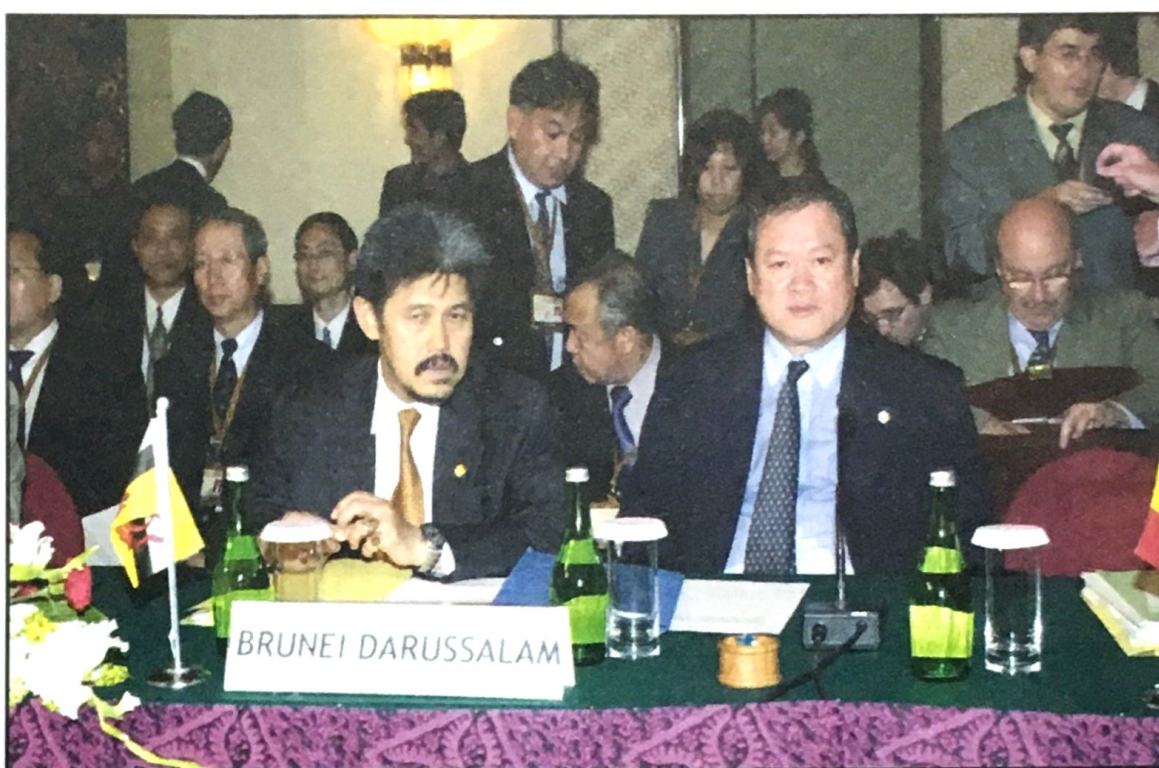
His Royal Highness Prince Mohamed Bolkiah at the 5 th Asia-Europe Meeting for Foreign Ministers in Bali, Indonesia

H is Royal Highness Prince Mohamed Bolkiah, the Minister of Foreign Affairs attended the 5 th Asia-Europe Meeting for Foreign Ministers (ASEM-FFM5) on July 23 in Bali, Indonesia.