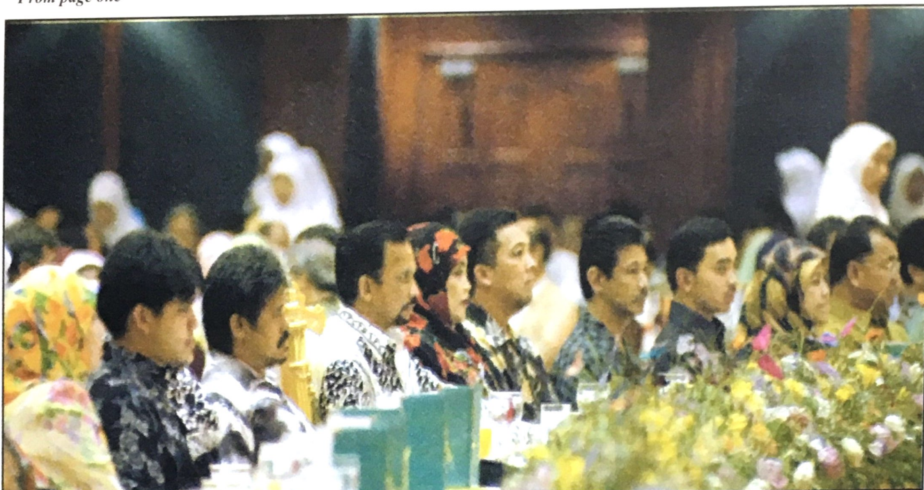
Royal entourage at the gala night where performances are presented by the Johor Heritage Foundation