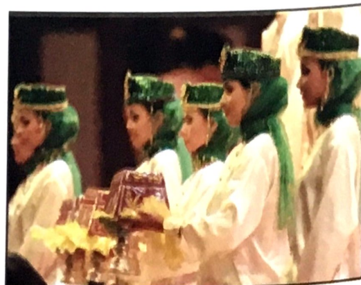
Traditional Malay cultural performance to celebrate His Majesty's 57 th birthday