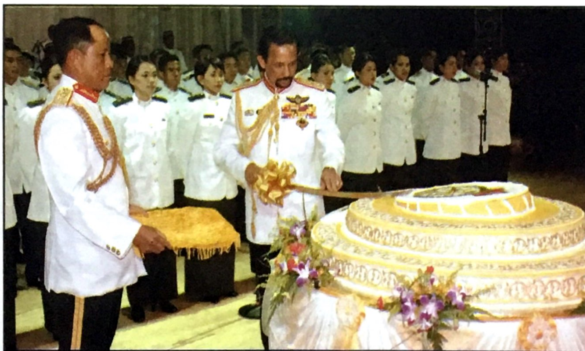
Cake cutting ceremony as the highlight of the evening