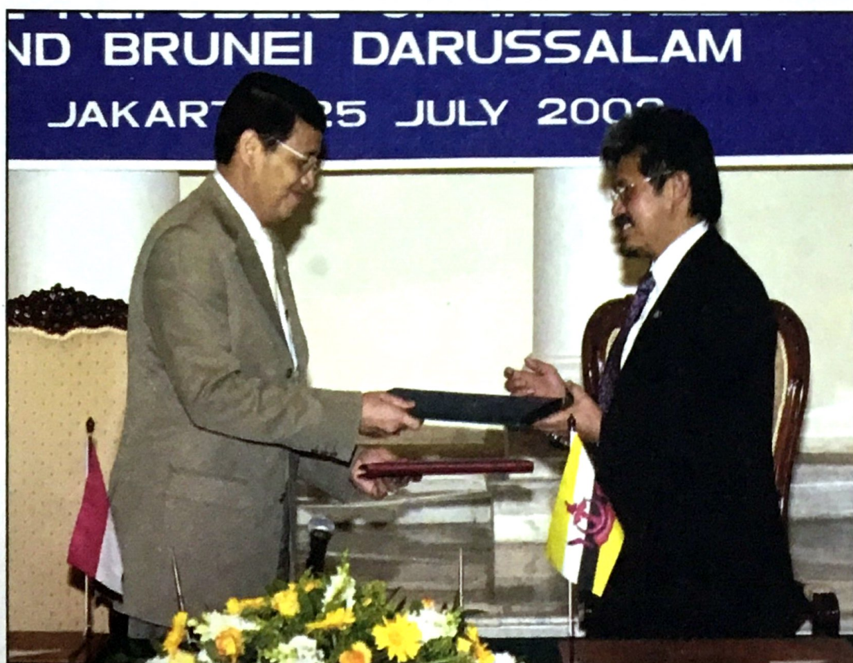
His Royal Highness Prince Mohamed Bolkiah at the first Brunei-Indonesia Joint Commission Meeting in Jakarta, Indonesia

T he first Brunei-Indonesia Joint Commission Meeting was held in Jakarta on July 25.