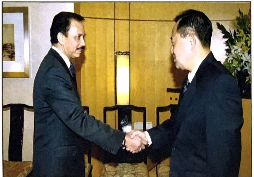
His Majesty also receives a courtesy visit by the speaker of the House of Representatives, the Honourable Jose De Venecia Jr.