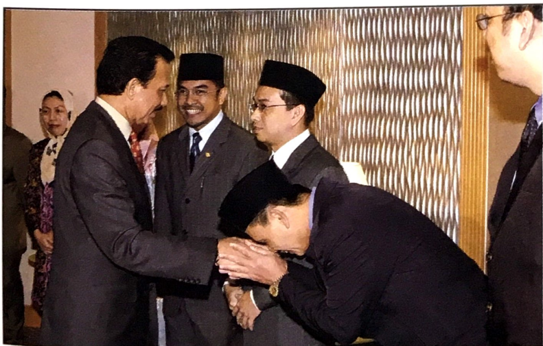
His Majesty receives greetings from the diplomatic staff of the Manila-based Brunei embassy, and ones comprising the advance party from the Brunei foreign ministry.