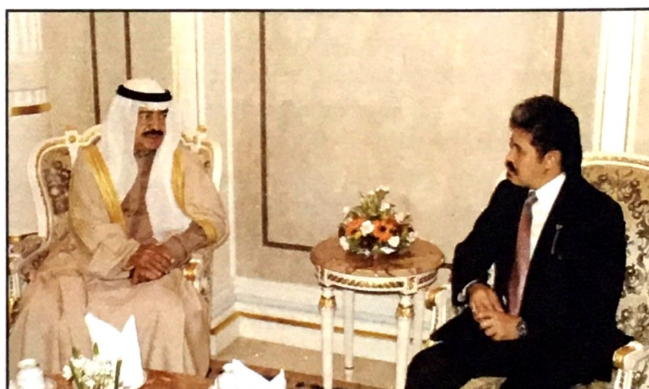
His Royal Highness Prince Mohamed Bolkiah, the Minister of Foreign Affairs (right) receives the Bahraini Prime Minister and entourage upon arrival at Brunei airport on January 24.

Brunei Darussalam established diplomatic relations with Bahrain on September 24, 1988.