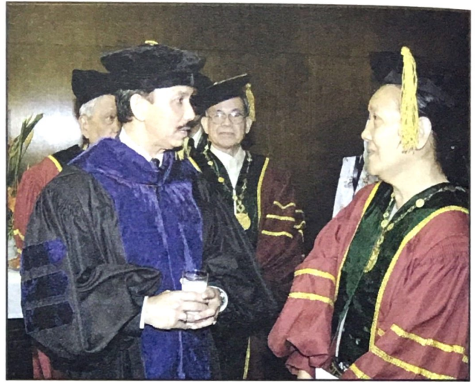
His Majesty The Sultan and Yang Di-Pertuan of Brunei Darussalam socialises with UP academic staff.