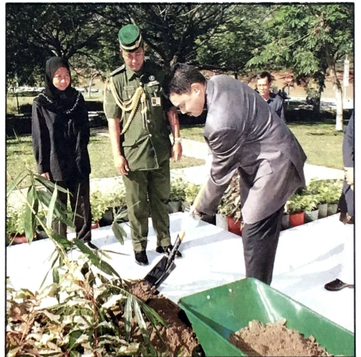
His Royal Highness plants a bamboo seedling to commemorate his visit to the park.