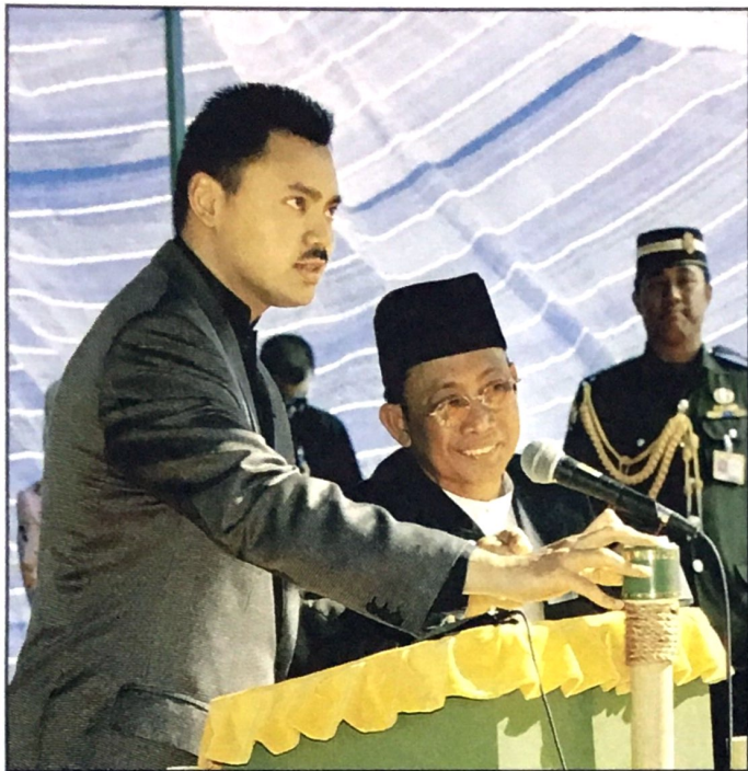
His Royal Highness Crown Prince Pengiran Muda Haji Al-Muhtadee Billah officially opens the UBD Bamboo Park.