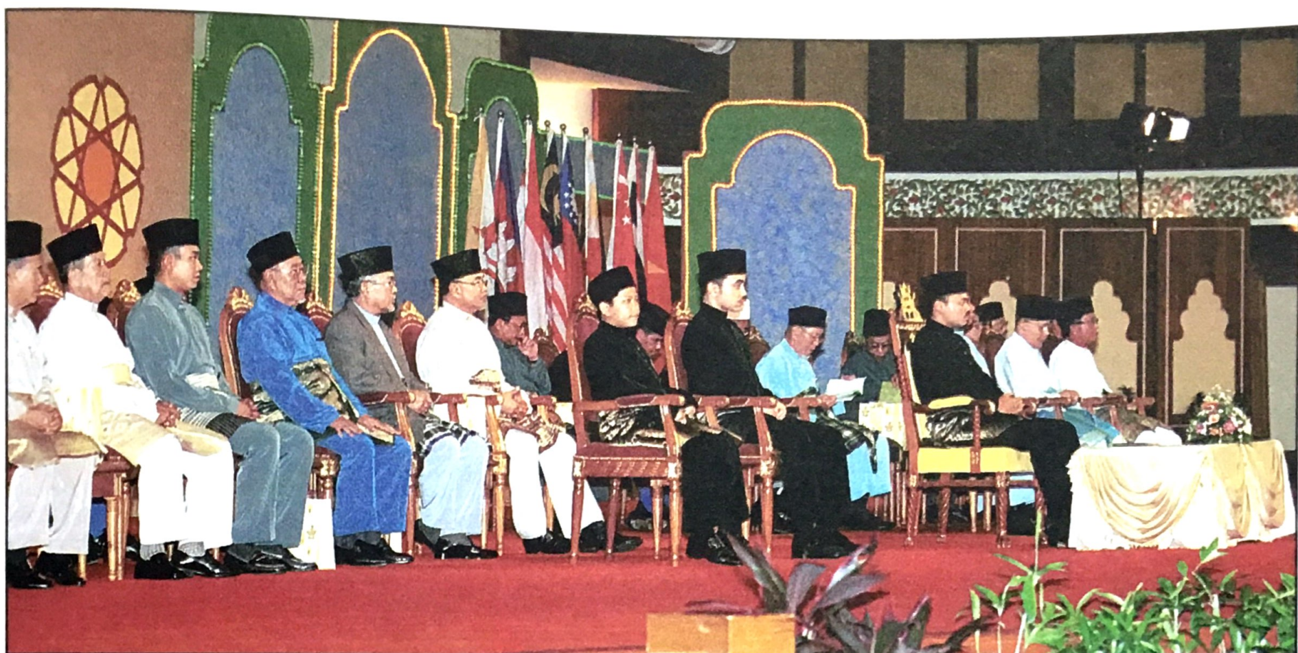
His Royal Highness Crown Prince Pengiran Muda Haji Al-Muhtadee Billah officially opens the 2 nd Quran Reading Contest for Southeast Asian Youths on January 17.