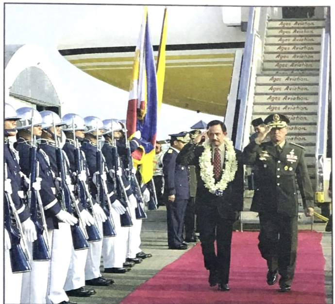
His Majesty The Sultan and Yang Di-Pertuan of Brunei Darussalam inspects the guard of honour.