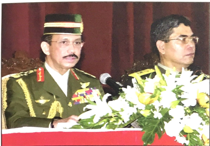
His Majesty The Sultan and Yang Di-Pertuan of Brunei Darussalam announces his speech during his visit to the Philippine Military Academy (PMA) on January 28. His Majesty is the first foreign head of state to visit PMA in 15 years.