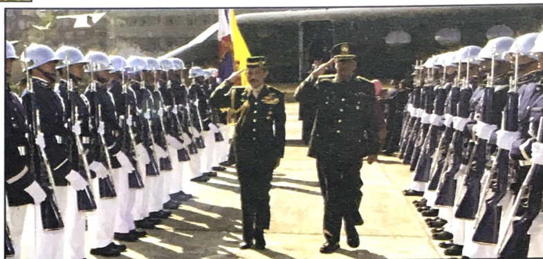
His Majesty inspects the guard of honour upon his arrival at the Baguio City airport.