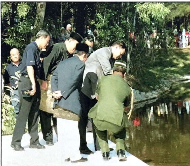
His Royal Highness releases a fish into the man-made pond.