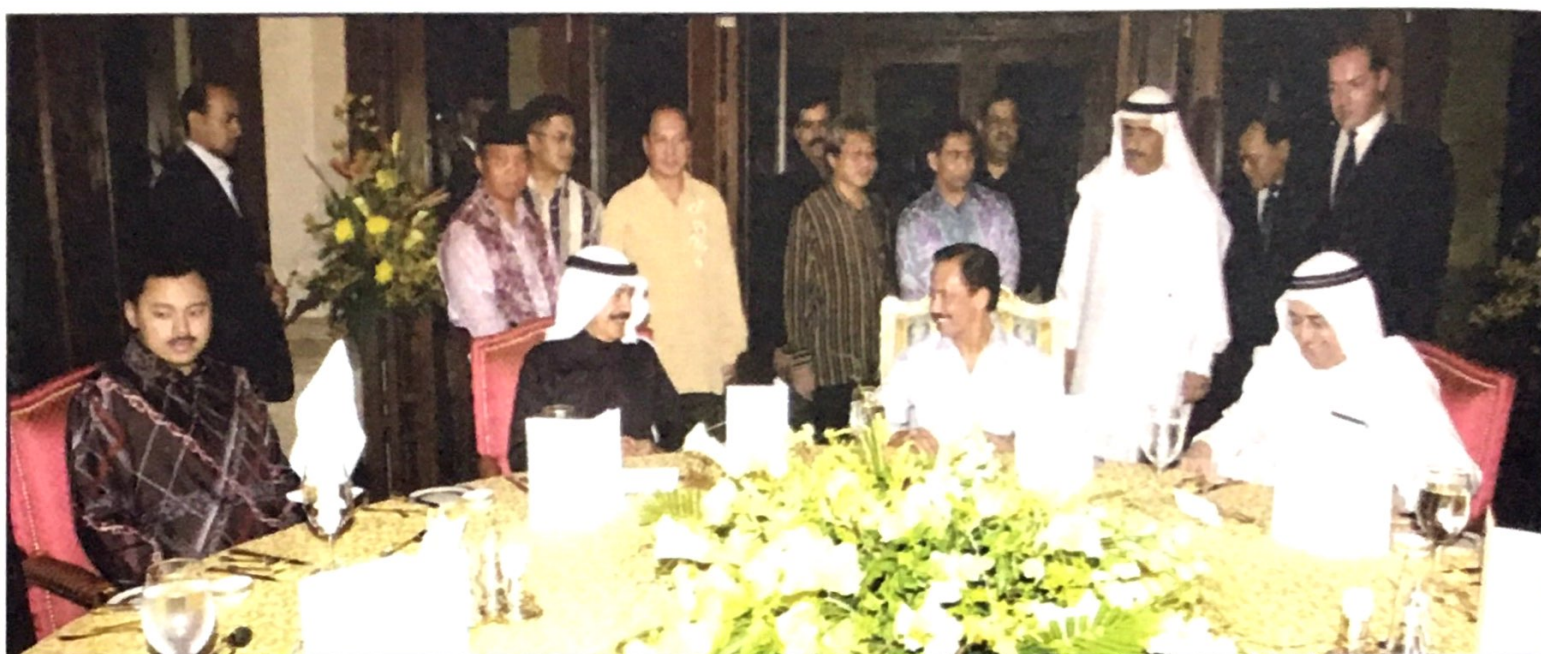
His Majesty Sultan Haji Hassanal Bolkiah Mu'izzaddin Waddaulah hosts a dinner for the Bahraini Prime Minister, His Royal Highness Shaikh Khalifa bin Salman Al-Khalifa (left). Brunei's entourage comprises His Royal Highness The Crown Prince (far left), His Royal Highness Prince Mohamed Bolkiah, and His Royal Highness Prince Haji Sufri Bolkiah.