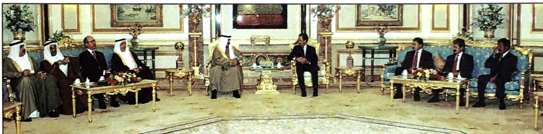
His Majesty and members of the Brunei royal family receive the Bahraini entourage for a farewell audience on January 25 at the Istana Nurul Iman.

Bahrain's Prime Minister, His Royal Highness Shaikh Khalifa bin Salman Al-Khalifa was in Brunei on January 24 for a two-day working visit. The Bahraini suite comprised the Deputy Prime Minister, Cabinet Affairs Minister, and Finance and Economy Minister.