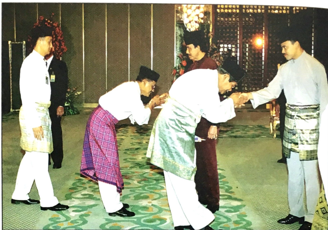
His Majesty The Sultan and Yang Di-Pertuan of Brunei Darussalam and His Royal Highness The Crown Prince receive visit from male pilgrims prior to leaving for the holy city of Mecca. Such visit that displays reverence for the royal family is locally known as junjung ziarah.

H is Majesty Sultan Haji Hassanal Bolkiah Mu'izzaddin Waddaulah had consented to grant an audience to 542 male pilgrims prior to their travel to the holy city of Mecca to perform the haj. The audience was held at the Istana Nurul Iman on January 18.