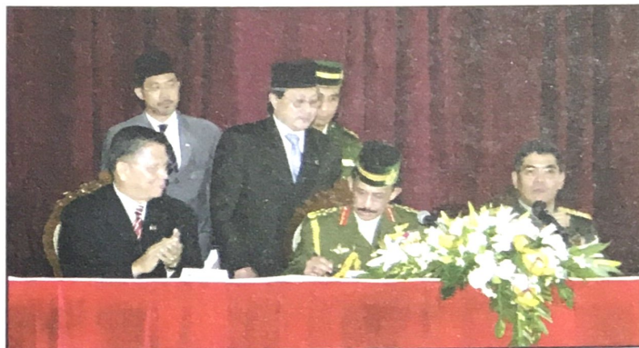
The sovereign signs the granting of pardons for 146 cadets who had committed disciplinary offences throughout their stay at the Academy.