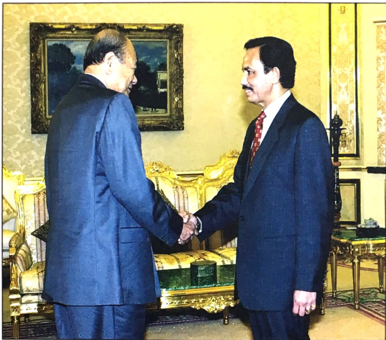
His Majesty Sultan Haji Hassanal Bolkiah Mu'izzaddin Waddaulah receives a courtesy visit from His Excellency Mr Blas Ople, the Foreign Secretary of the Philippines.