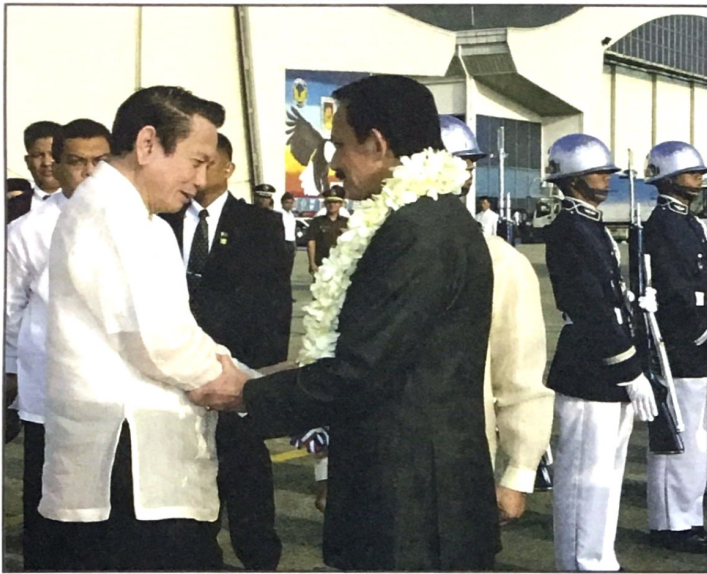
His Excellency Teofisto T. Guingona Jr, the Philippines' vice-president (left) greets His Majesty The Sultan and Yang Di-Pertuan of Brunei Darussalam upon arrival at the Villamor Air Force Base on January 26.