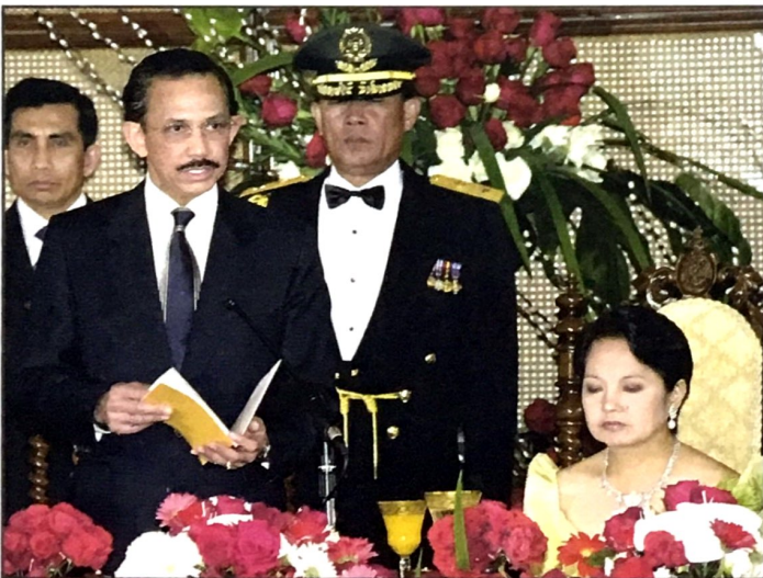
His Majesty The Sultan and Yang Di-Pertuan of Brunei Darussalam announces his speech during a banquet hosted by Her Excellency President Gloria Macapagal Arroyo of the Philippines.