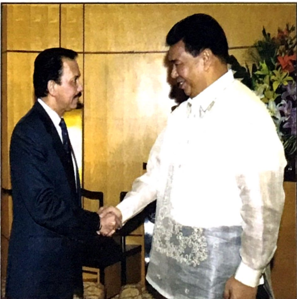
His Majesty receives a courtesy visit by the president of the Philippine Senate, the Honourable Franklin M. Drilon on January 27.

Both countries expressed the importance of regional and international cooperation in the combat against terrorism. As such the Philippine president welcomed Brunei to join the Agreement on Information Exchange and the Establishment of Communication Procedures this year.