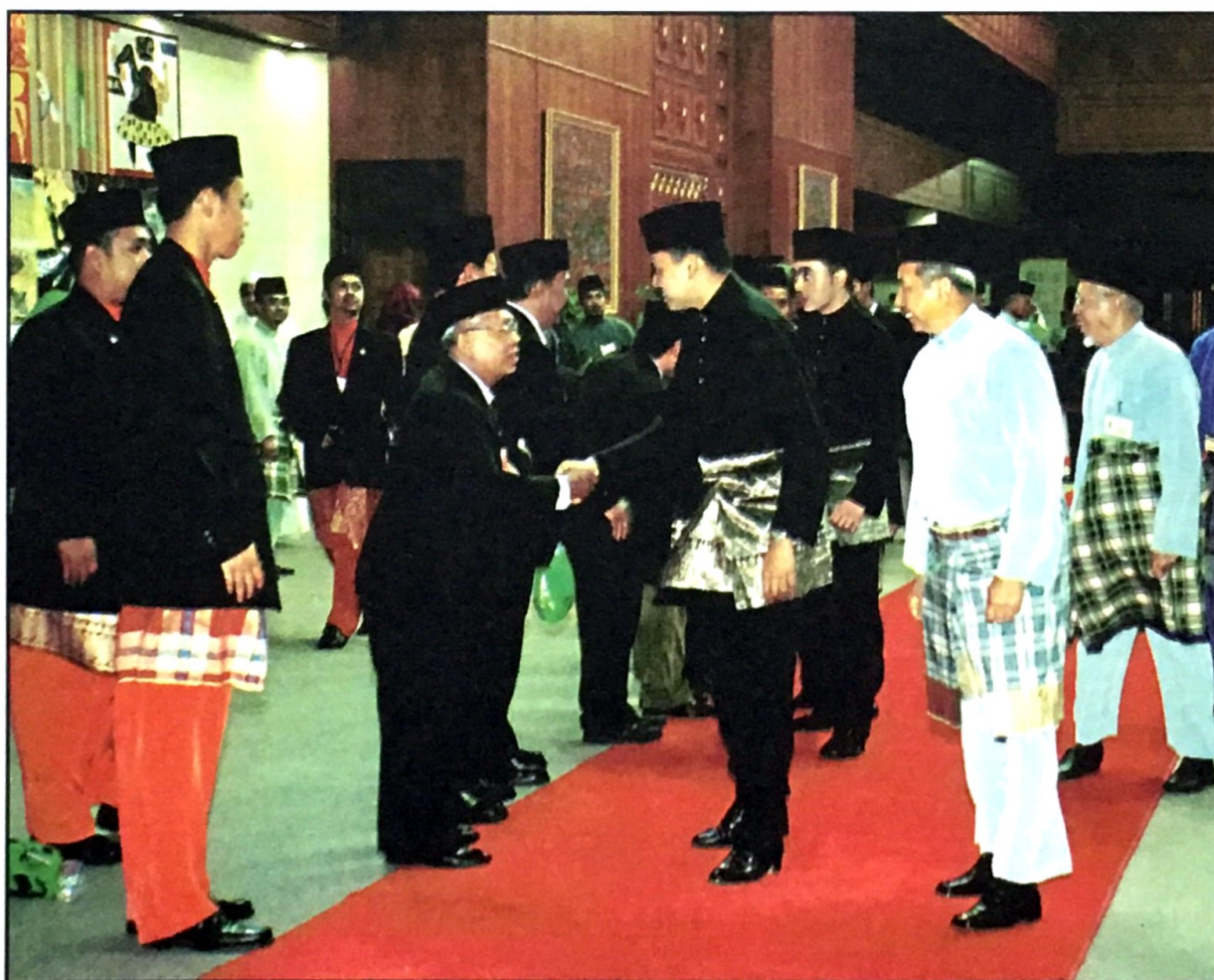
His Royal Highness The Crown Prince and entourage arrive at the International Convention Centre that hosts the contest.