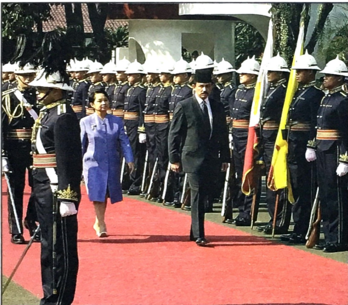
His Majesty The Sultan and Yang Di-Pertuan of Brunei Darussalam inspects the guard of honour upon his arrival at the Malacañang Palace.