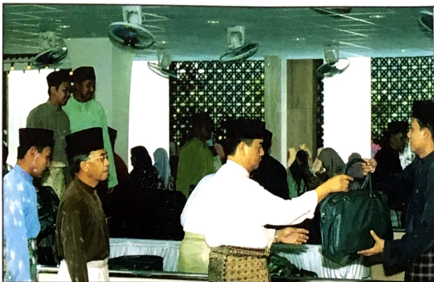
All pilgrims receive the haj attire called ihram donated by His Majesty The Sultan and Yang Di-Pertuan of Brunei Darussalam.