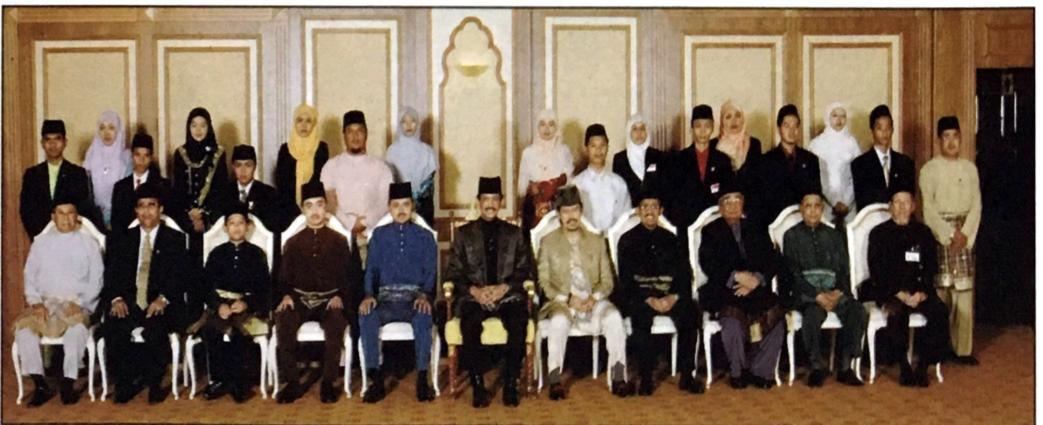
His Majesty consents to a group photo session with members of the royal family, the organising committee, and all the contestants from the nine participating ASEAN member-states.

His Majesty concluded with optimistic advice for the participants: "Be proud of Islam, with the Quran, and do become model Muslims who are pursuing goodness and prohibiting sins."