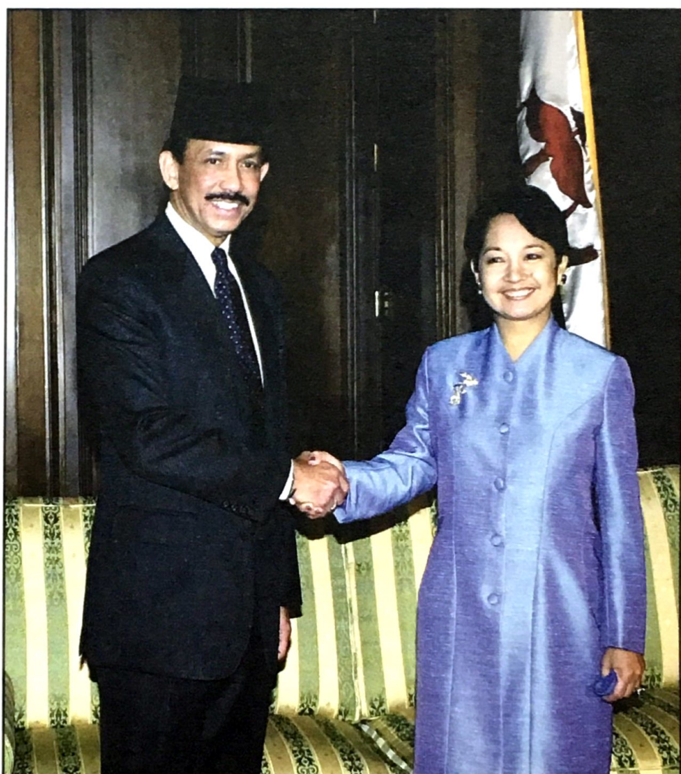
His Majesty Sultan Haji Hassanal Bolkiah Mu'izzaddin Waddaulah meets Her Excellency President Gloria Macapagal-Arroyo of the Philippines for a one-to-one audience at the Malacañang Palace on January 27.

HM: Interdependence between neighbouring states vital