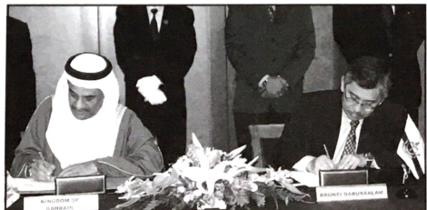
Milestone date for the Brunei-Bahrain relations: Brunei signs cooperation agreement in areas of banking and investment. His Excellency Abdullah Hassan Saif, the Minister of Finance and Economy represents Bahrain (left), and Dato Haji Yakub bin Haji Abu Bakar, the deputy Finance Minister represents Brunei.

Brunei Darussalam was represented by the deputy Finance Minister, Dato Haji Yakub bin Haji Abu Bakar. His Bahraini counterpart was Abdullah Hassan Saif, the Minister of Finance and Economy.