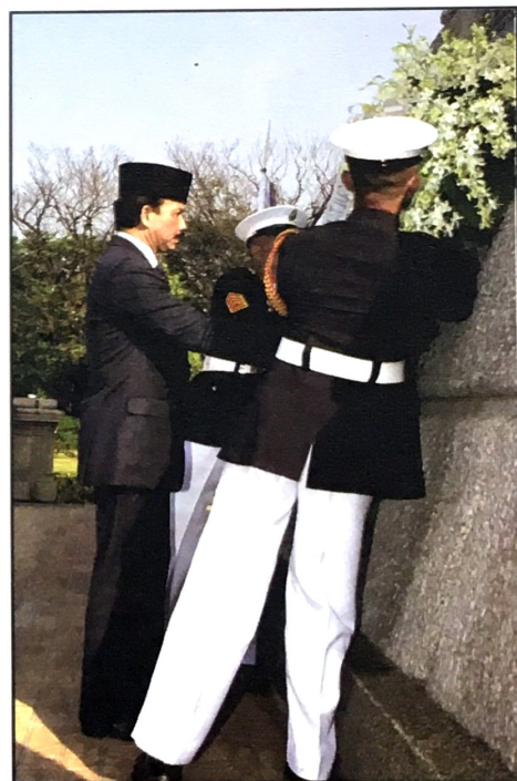
His Majesty lays a wreath at the Rizal Memorial Park.