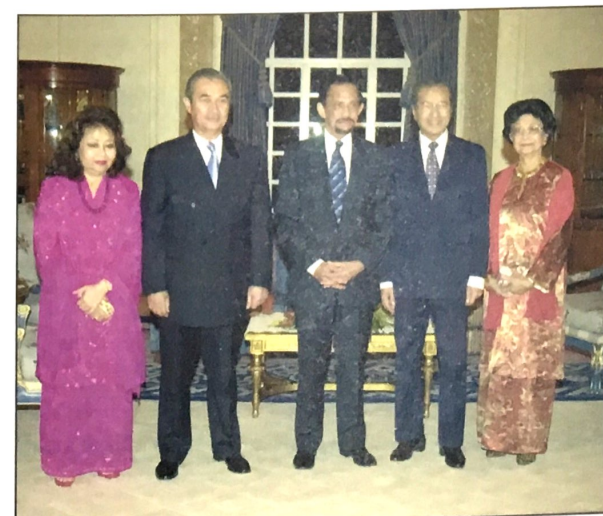
Prominent figures took a group photo prior to the dinner banquet

His Majesty and entourage left for Brunei on August 24.