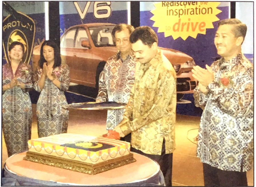
His Royal Highness Crown Prince at the 'Gala Dinner' for Malaysia's independence day

The Crown Prince also received the contribution for the Pengiran Muda Al-Muhtadee Billah Fund for Orphans from the Association of Malaysian Society and Malaysian companies operating in Brunei.