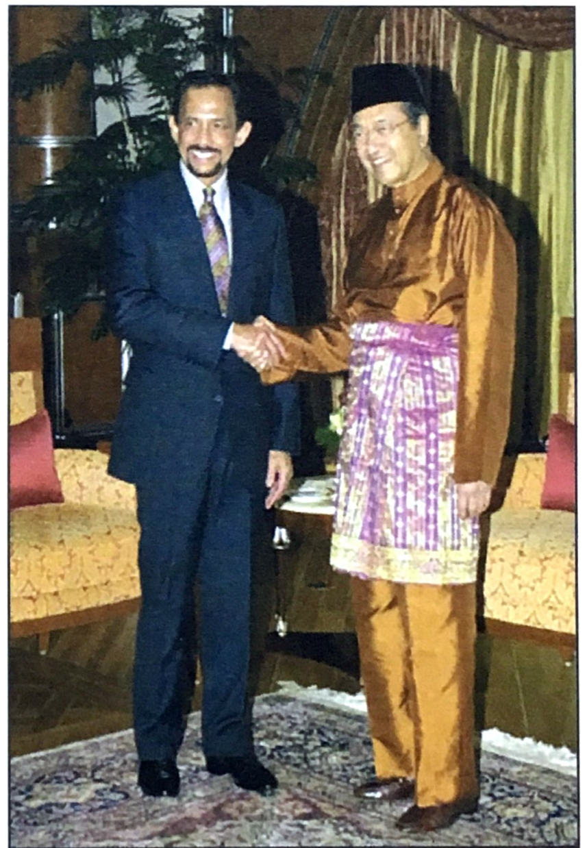
His Majesty Sultan Haji Hassanal Bolkiah Mu'izzaddin Waddaulah, The Sultan and Yang Di-Pertuan of Brunei Darussalam with Datuk Seri Dr. Mahathir, the Prime Minister of Malaysia at a recent working visit to Kuala Lumpur.