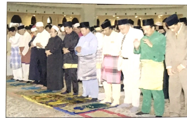
His Majesty performs Friday prayers with Malaysian citizens

The opening of the Brunei Government Agency in Kuala Lumpur in January 8, 1982 marked the beginning of Brunei Darussalam's modern diplomatic history with Malaysia. The office was upgraded to Commission-level in November 4, 1982, and upgraded to High Commission-level in January 1, 1984.