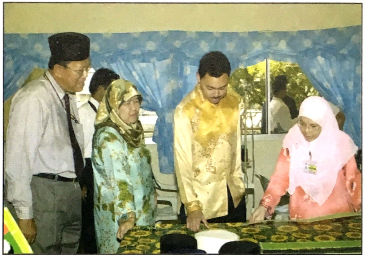
A staff member explains the process of making a 'songkok'

The Crown Prince's itinerary began with briefings by the permanent secretary and the director of Community Development