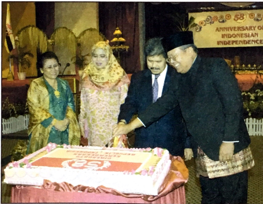
HRH Prince Mohamed Bolkiah and HRH Pengiran Anak Isteri Pengiran Anak Hajah Zariah at the reception for Republic of Indonesia's independence day

His Royal Highness Prince Mohamed Bolkiah and Her Royal Highness Pengiran Anak Isteri Pengiran Anak Hajah Zariah attended a reception held in conjunction with the independence day of Republic of Indonesia on August 19.