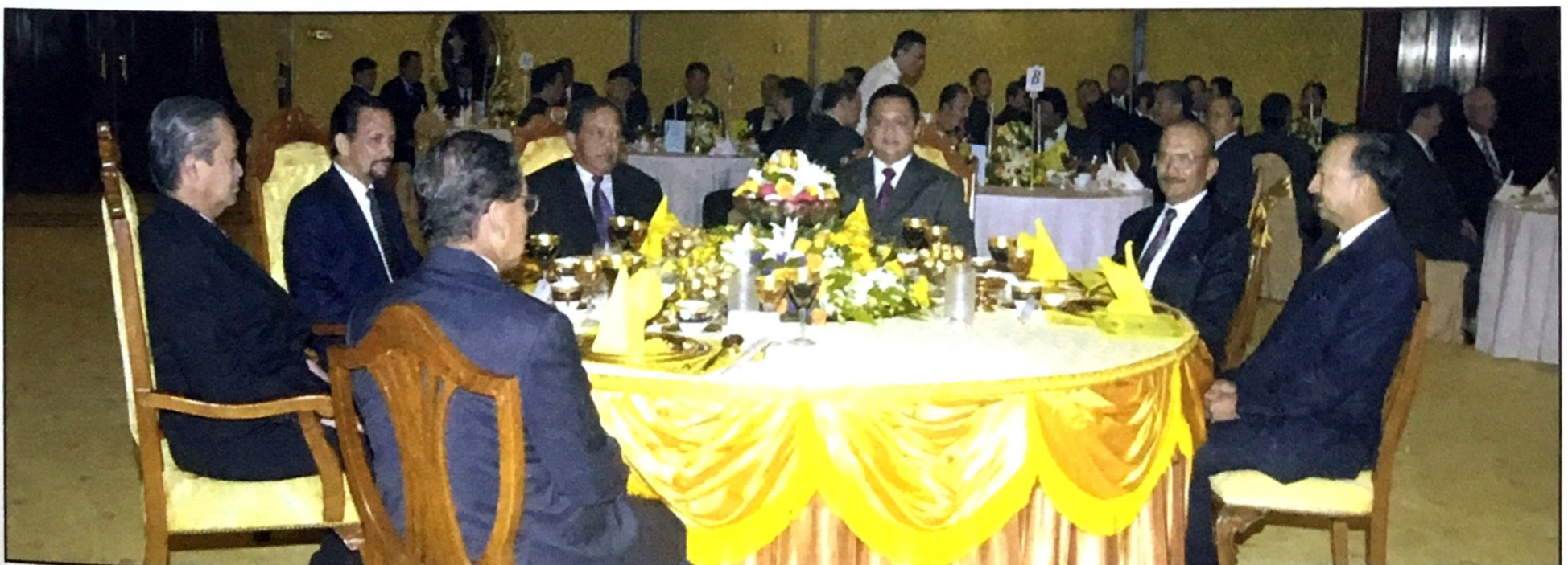
His Majesty The Sultan and Yang Di-Pertuan of Brunei Darussalam at a banquet hosted by the Malaysian sovereign