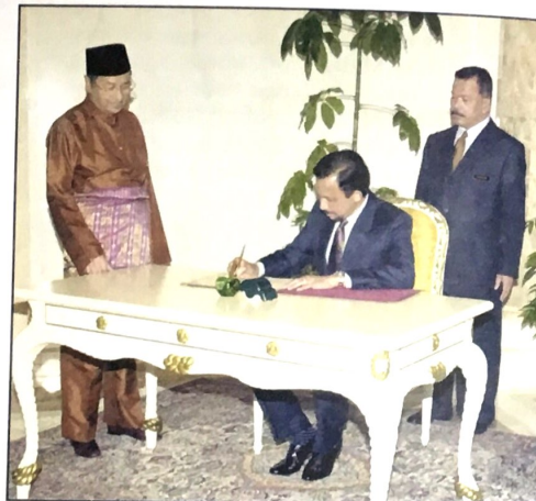
His Majesty signs the guest book at Wisma Putra