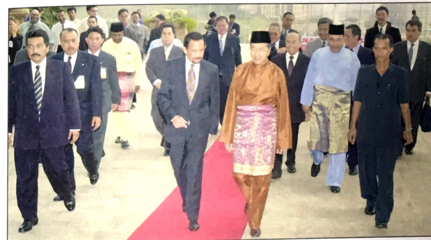
His Majesty with The Right Honourable at Wisma Putra