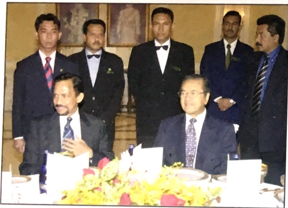
His Majesty at a banquet hosted by the Malaysian Prime Minister