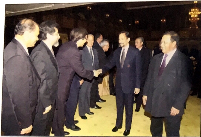
His Majesty greets Malaysian officials