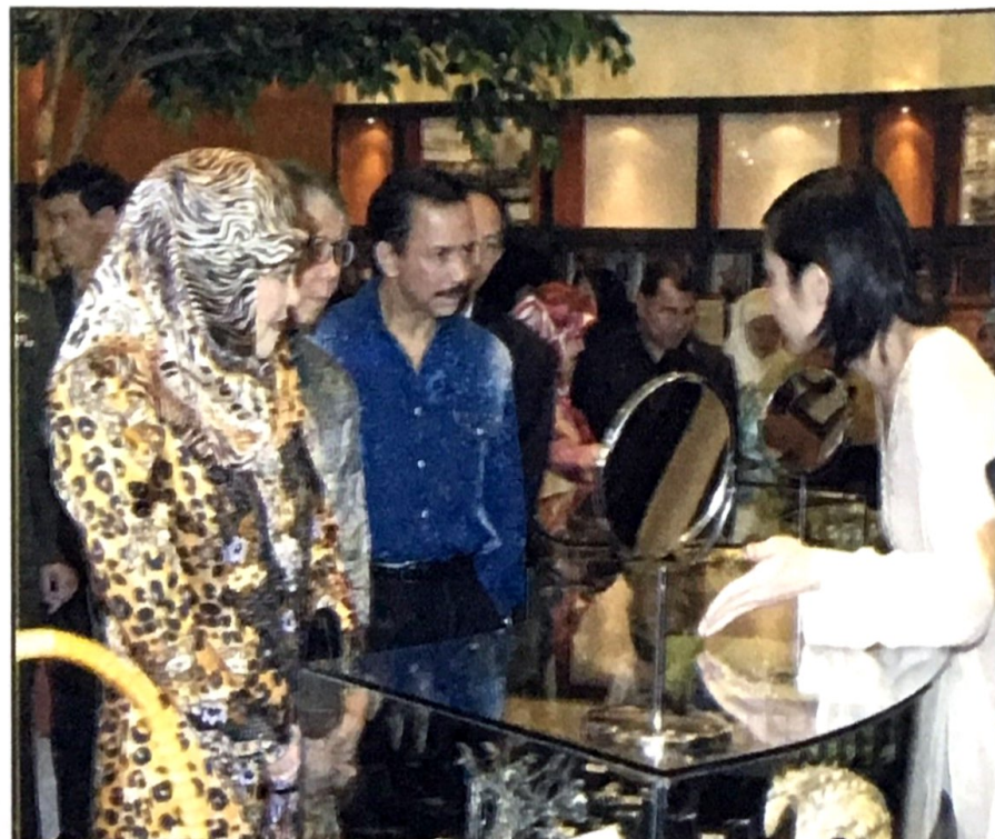
His Majesty The Sultan and Yang Di-Pertuan of Brunei Darussalam and Her Majesty The Raja Isteri at Asian Civilisations Museum at Empress Place.