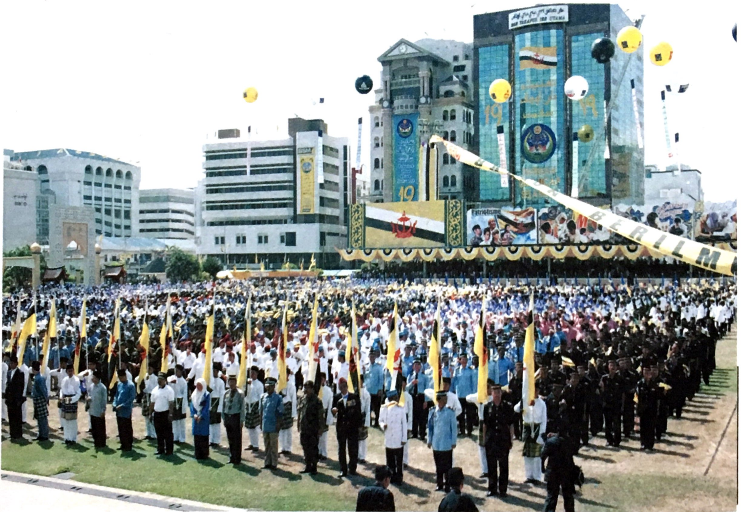
Standing proud as Brunei Darussalam celebrates its 19 th National Day at Taman Sir Muda Omar Ali Saifuddien in Bandar Seri Begawan.

He emphasised the country's stand regarding threats to national integrity: Brunei does not give blessing or support to any action that could jeopardise peace.