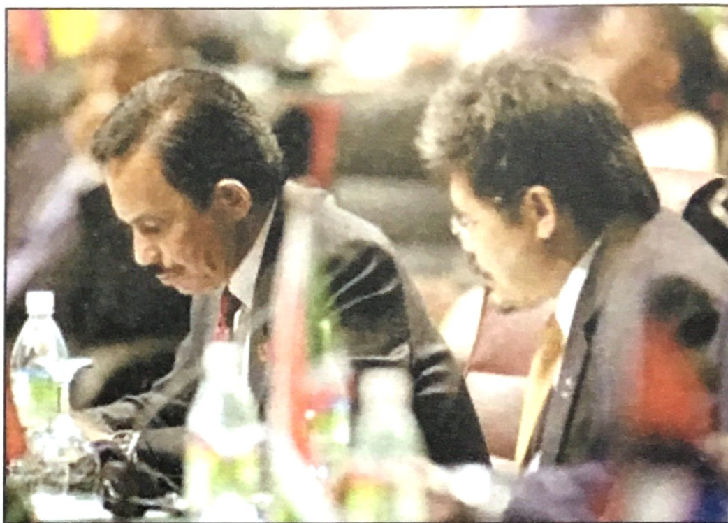
His Majesty The Sultan and Yang Di-Pertuan of Brunei Darussalam and His Royal Highness Prince Mohamed Bolkiah at Non-Aligned Movement (NAM) Leaders' Summit in Kuala Lumpur, Malaysia.