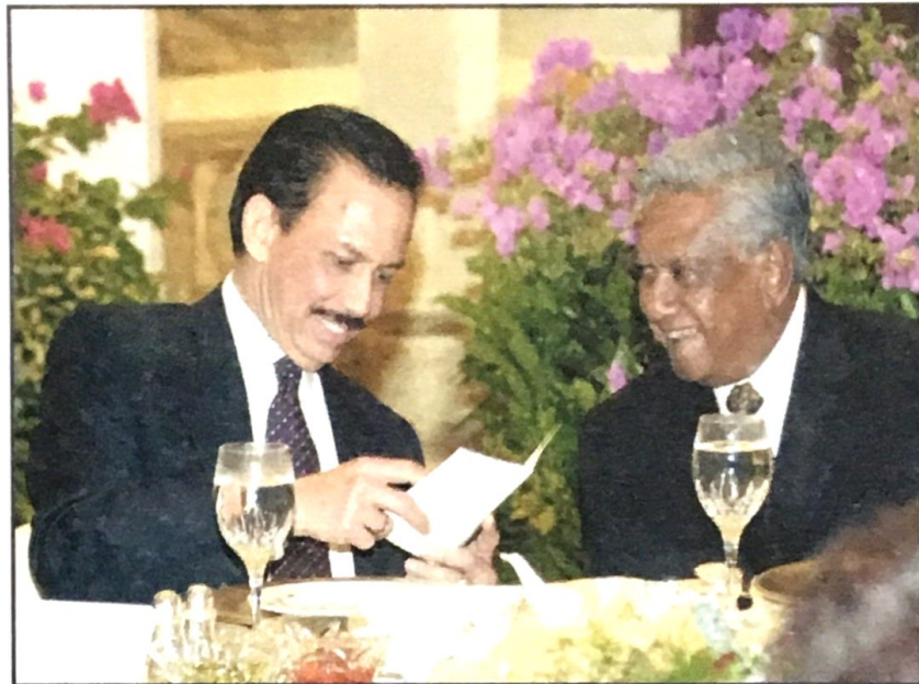
His Majesty The Sultan and Yang Di-Pertuan of Brunei Darussalam with Singapore's president, His Excellency S.R. Nathan at a state banquet held at the Istana (national palace).