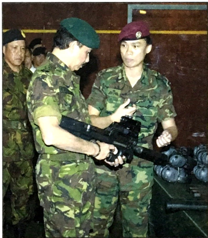
His Majesty The Sultan and Yang Di-Pertuan of Brunei Darussalam at Camp Hendon, the commando headquarters of the Republic of Singapore Armed Forces.

His Majesty also called on ASEAN 'to be strong, positive and optimistic' if it is to achieve its ambition of becoming a region where 'millions of people for whom it is home, will live in peace and stability'.