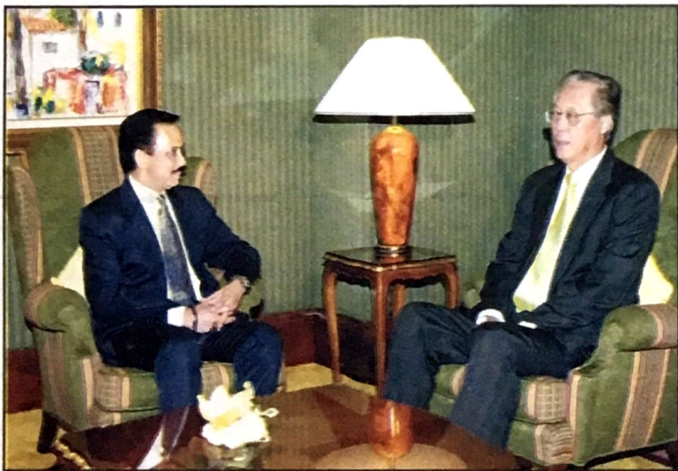
His Majesty The Sultan and Yang Di-Pertuan of Brunei Darussalam at a one-to-one meeting with Singapore's Prime Minister, His Excellency Goh Chock Tong.

This was His Majesty’s second state visit to Singapore; the first one was in 1990. Brunei’s modern diplomatic history with Singapore began with the setting up of a Brunei Government Agency on February 1, 1975. The Singapore-based office was upgraded to Commission-level in September 1, 1982, and later upgraded to High Commission-level in January 1, 1984 when Brunei resumed its status as an independent sovereign nation-state.