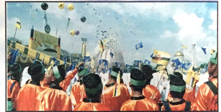
A kaleidoscope of colours. The national day celebration itinerary comprises acrobatics, cultural performances, declaration of citizen loyalty, and the obligatory military parade.