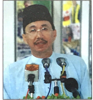
Dato Haji Hazair, permanent secretary at Prime Minister's Office urges citizens not to get easily influenced by what they read in the Internet.

Dato Haji Hazair said that in 1991 the sovereign reminded citizens to practise community life based on consultation and goodwill as stipulated by the teachings of Islam. His Majesty also said that citizen disunity afflicted some states with instability: the problem happened because of self-serving motives pursued by some quarters at the expense of national interest.