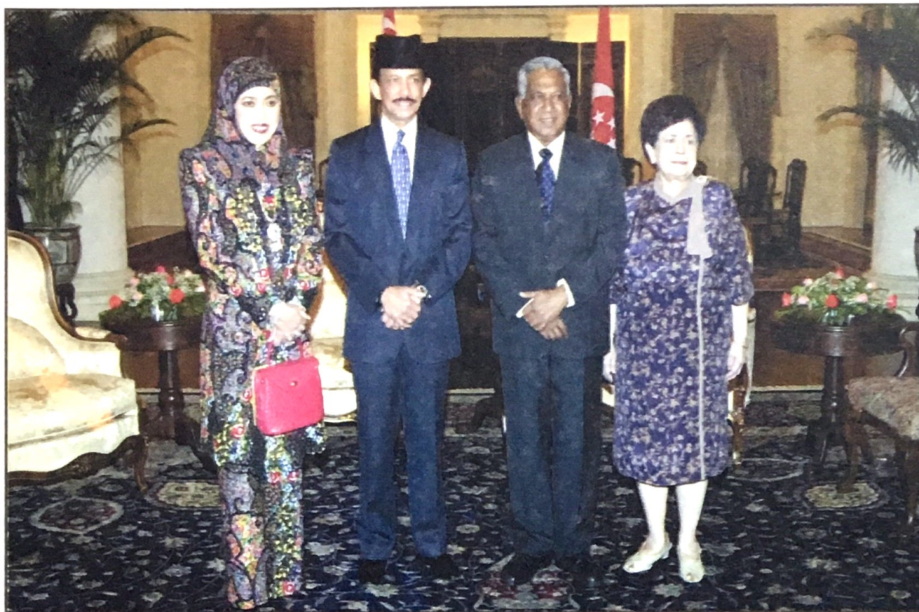
A gesture of close friendship between Brunei Darussalam and Singapore. Singapore's President, His Excellency S.R Nathan and wife welcomes His Majesty The Sultan and Yang Di-Pertuan of Brunei Darussalam and Her Majesty The Raja Isteri.