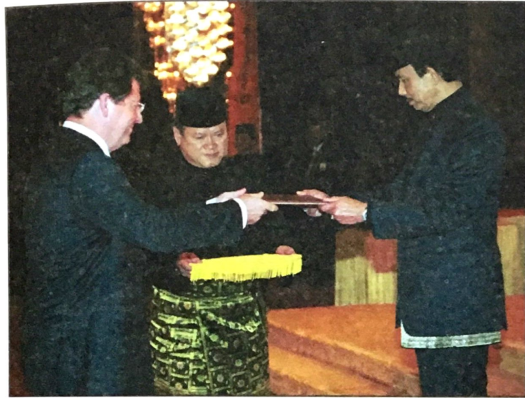
* From page 2 (diplomatic appointment)

He was formerly the Qatari ambassador to Sudan from 1993 to 1999.