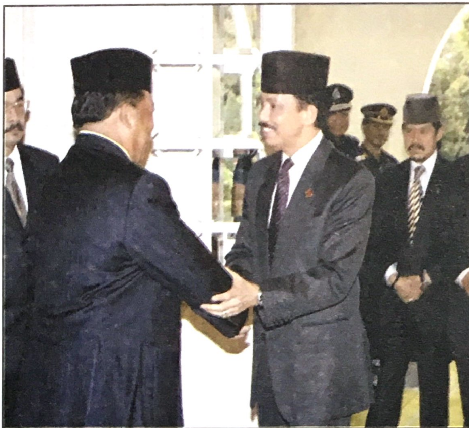
His Majesty The Sultan and Yang Di-Pertuan of Brunei Darussalam on a courtesy visit to His Majesty Tuanku Syed Sirajuddin, the Yang Di-Pertuan Agong of Malaysia.

The Brunei royal entourage also attended the non-official consultation with the leaders of member-states of the Organisation of Islamic Conference (OIC) the following day. Much of the discussion revolved around Iraq, the Middle East, and the role of the United Nations in settling disputes among nation-states.