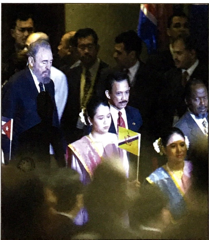
His Majesty joins the leaders of the NAM member states into the plenary session.

The 2003 Summit was concluded with a six-point statement called the Kuala Lumpur Declaration. Among other things, the Declaration stressed the primacy of state-to-state dialogues, diplomacy, and multilateral process as the means to attain world peace.