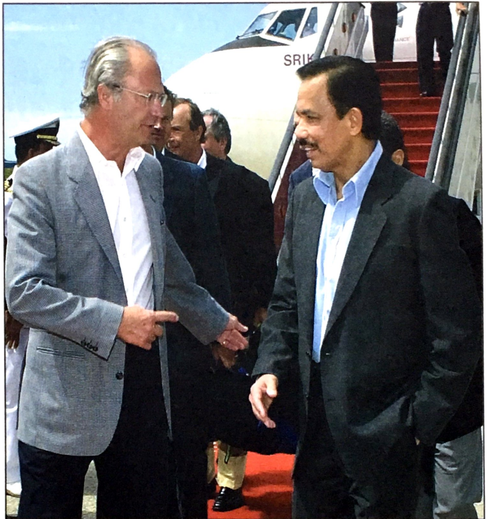
His Majesty Sultan Haji Hassanal Bolkiah Mu'izzaddin Waddaulah consents to receive the arrival of His Majesty King Carl XVI Gustaf of Sweden (left) at Brunei International Airport.

The next issue of the Brunei Darussalam newsletter will appear on 31 January 2003. If there are events relating to our country you would like featured in this newsletter please call us on Tel: 02-383400/ext.BDN Division or better still, send us a report with a picture, if possible. All editorial rights reserved.