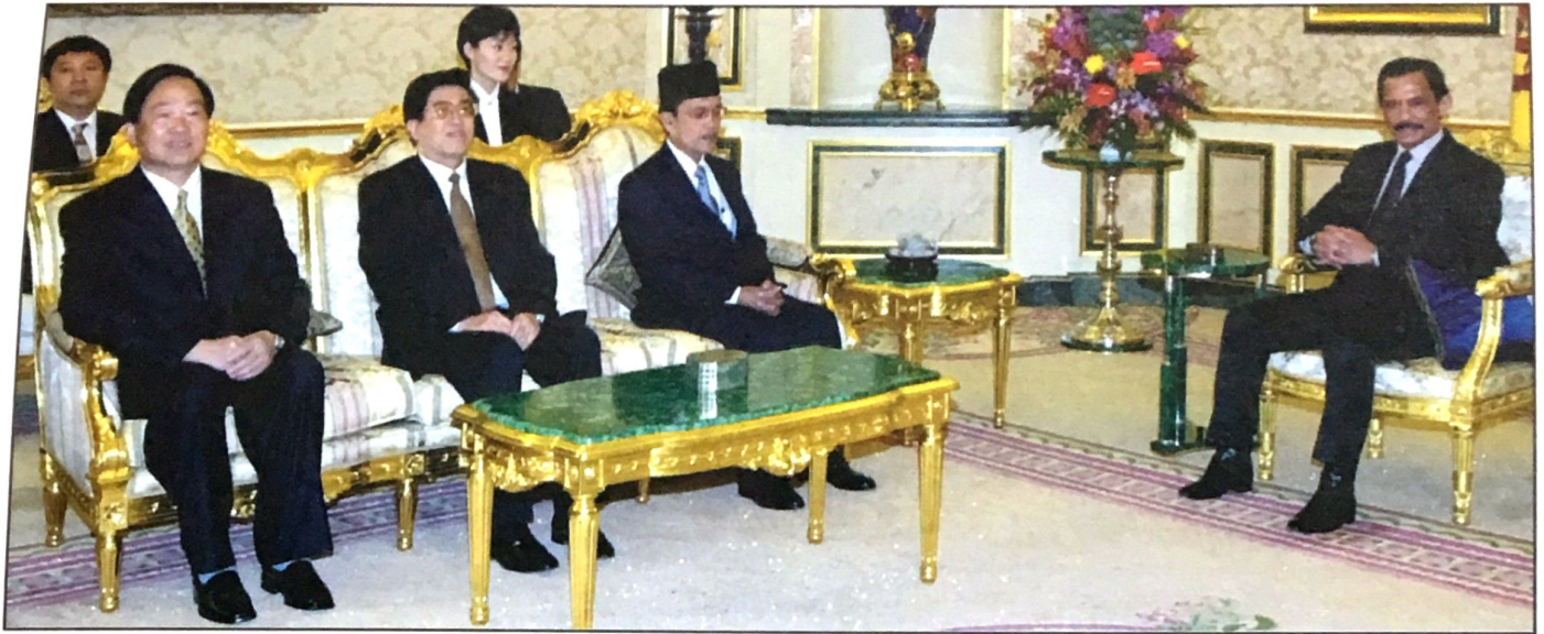
His Majesty The Sultan and Yang Di-Pertuan of Brunei Darussalam consents to grant an audience to the visiting Prosecutor General of the Supreme Court Prosecution Service of the People's Republic of China (second left).