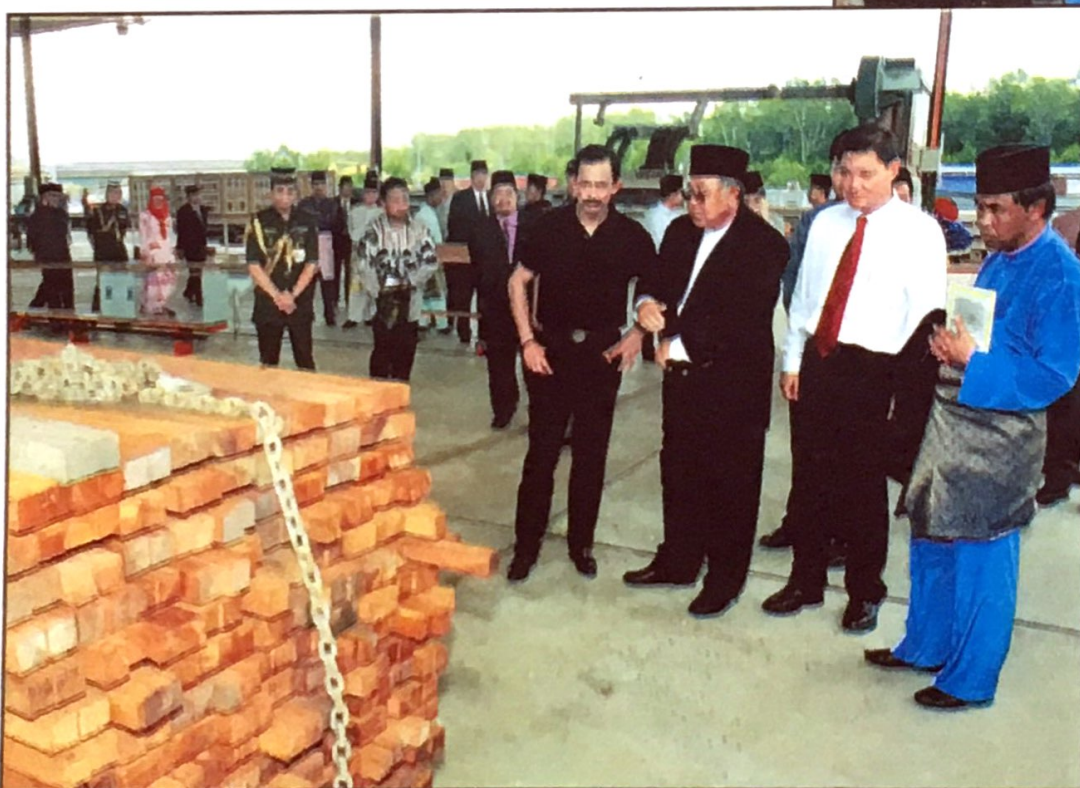
His Majesty next inspects the type of wood produced by the timber company that is also based at the Kampong Salar Light Industrial Zone.