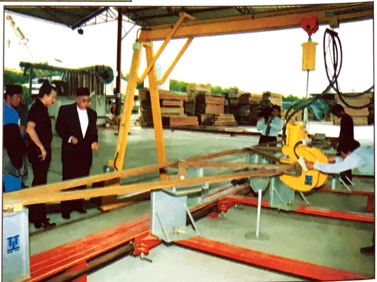
His Majesty witnesses the use of relevant machinery found in the timber company.