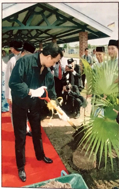
His Majesty The Sultan and Yang Di-Pertuan of Brunei Darussalam consents to plant a commemorative tree following the key and land grants issuing ceremony.