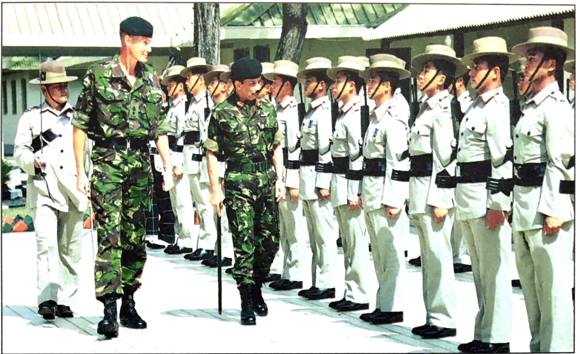
His Majesty The Sultan and Yang Di-Pertuan of Brunei Darussalam inspects the Brunei-based Gurkha battalion last year.