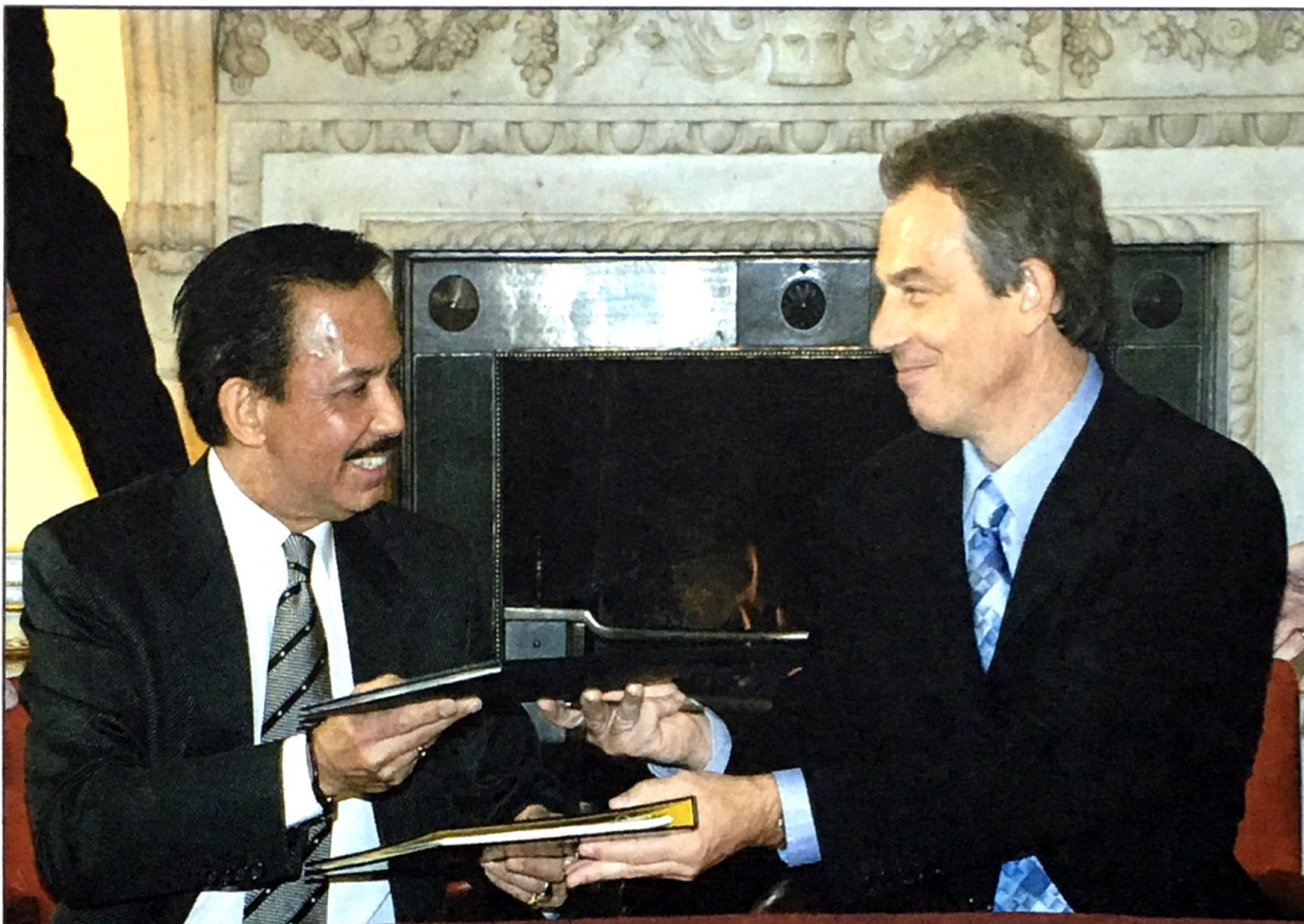
A successful working visit to Britain. His Majesty The Sultan and Yang Di-Pertuan of Brunei Darussalam shares a light moment with the British Prime Minister (right) during the Exchange of Notes signing ceremony at No.10 Downing Street.