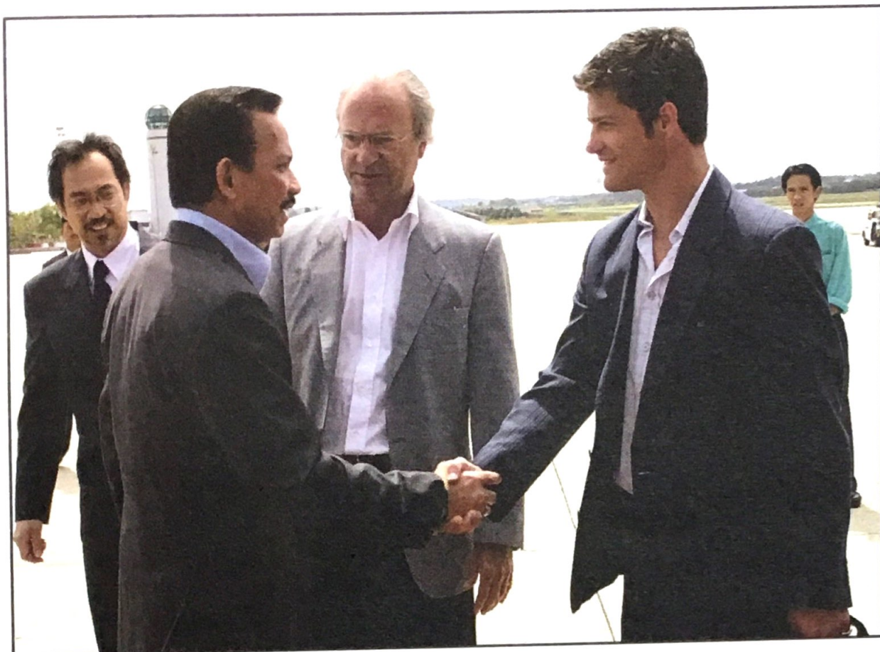
His Majesty The Sultan and Yang Di-Pertuan of Brunei Darussalam next consents to receive His Royal Highness Prince Carl Philip (right).