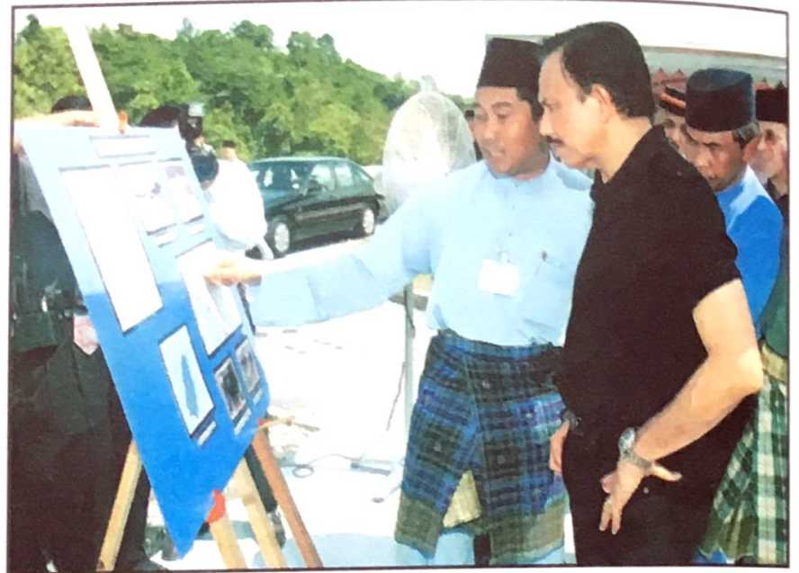
His Majesty consents to receive briefing from one of the officers of the Water Department. Built in 1997 at the cost of B$28.7 million, the Mengkabau Dam has a water capacity of 9.6 million cubic metres.