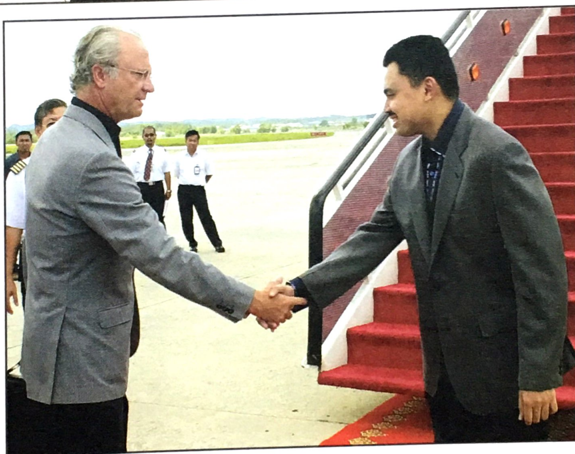
His Royal Highness Crown Prince Pengiran Muda Haji Al-Muhtadee Billah bids farewell to the Swedish sovereign. The Swedish royal entourage was in Brunei Darussalam for a three-day visit.