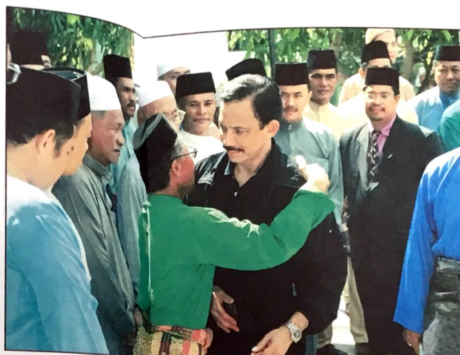
His Majesty The Sultan and Yang Di-Pertuan consents to receive heart-felt welcoming from one of the locals.