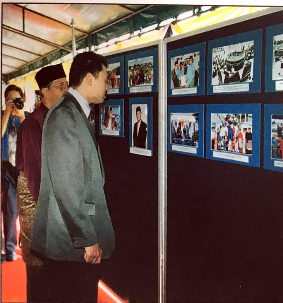
His Royal Highness witnesses the displays showing the development of the village since its founding in 1952.

His Royal Highness Crown Prince Pengiran Muda Haji Al-Muhtadee Billah had consented to attend the golden jubilee celebration for the Kampong (village) Bunut Perpindahan on December 23. The event also coincided with the official opening of the village's Golden Jubilee Health Clinic.