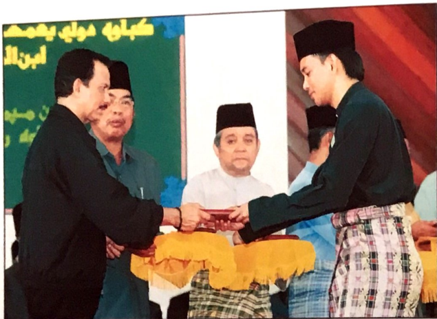
His Majesty The Sultan and Yang Di-Pertuan of Brunei Darussalam issues the key to a new home to one of the recipients.