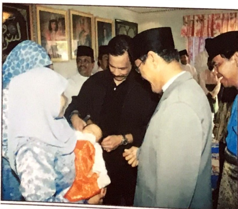
His Majesty The Sultan and Yang Di-Pertuan arrives at the home of the Ketua Kampong of Area I of the Kampong Mentiri National Housing Scheme and consents to witness a religious ceremony blessing a newly-born.