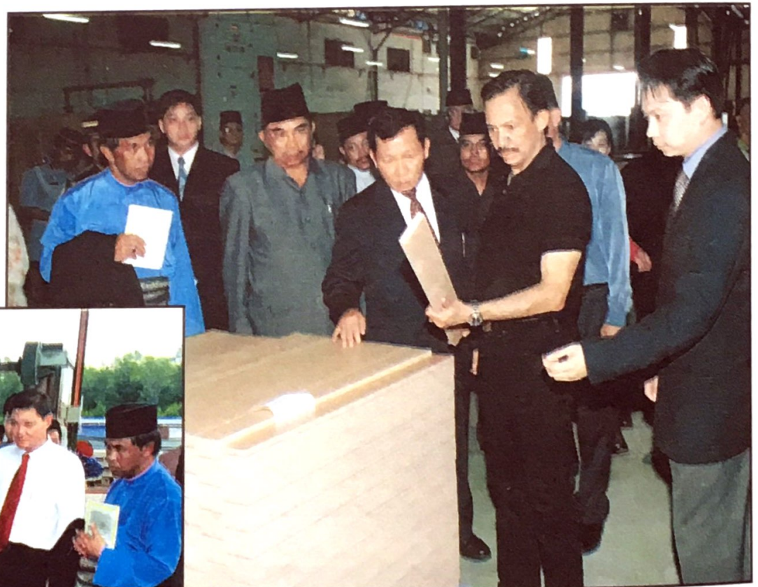
His Majesty inspects the material quality of wood used in the manufacturing of furniture by a private company operating at the Kampong Salar Light Industrial Zone.