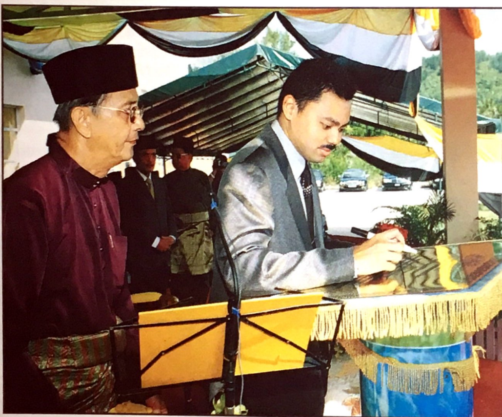
His Royal Highness The Crown Prince signs the commemorative plaque marking the 50 th anniversary of the founding of the Kampong Bunut Perpindahan.