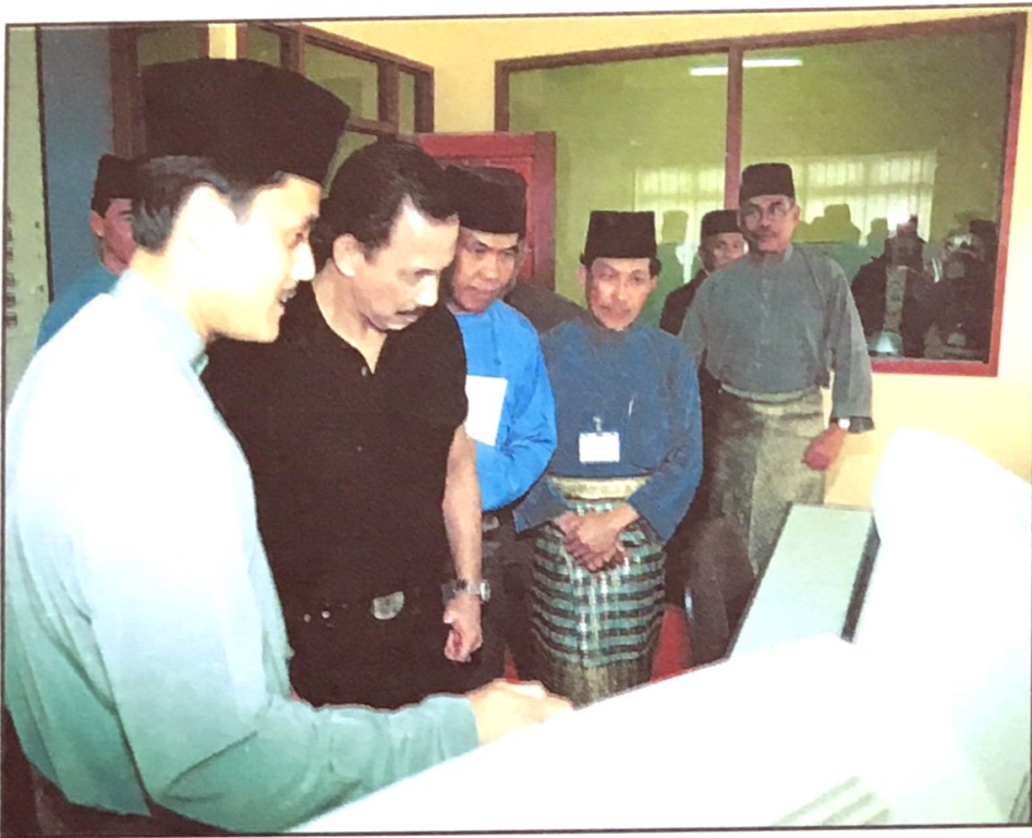
His Majesty's itinerary for the day also covers visit to the nearby Mengkabau Dam and its water filtering plant.