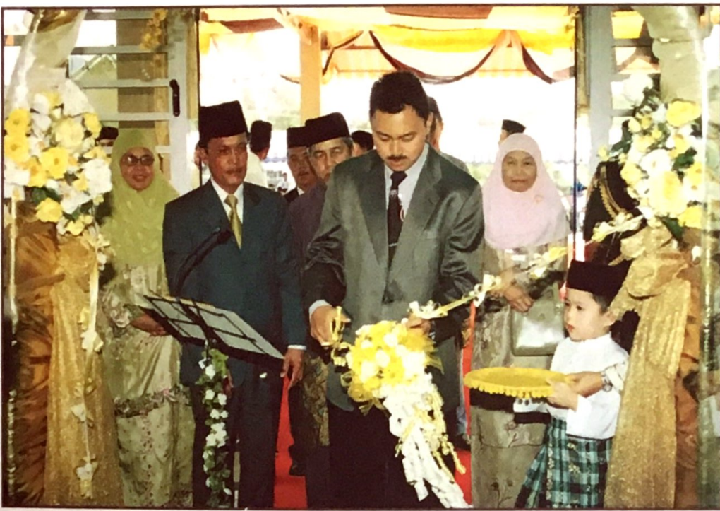
His Royal Highness The Crown Prince graces the opening of Kampong Bunut Perpindahan's Golden Jubilee Health Clinic. The Minister of Health, Pehin Dato Haji Abu Bakar bin Haji Apong (left) looks on.