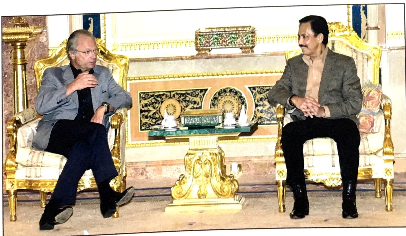
His Majesty The Sultan and Yang Di-Pertuan of Brunei Darussalam consents to receive His Majesty the King of Sweden for a farewell audience at the Istana Nurul Iman.