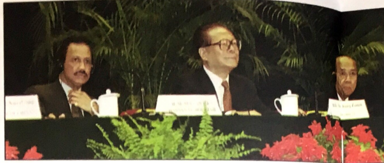
Left: His Majesty The Sultan and Yang Di-Pertuan of Brunei Darussalam outlined some of the challenges that have to be overcome, in his speech at the opening of APEC high-level meeting on human capacity building, in Beijing. Above: His Majesty and His Excellency President Jiang Zemin of the People's Republic of China at the opening ceremony of the meeting which took place in the Great Hall of the Peoples.