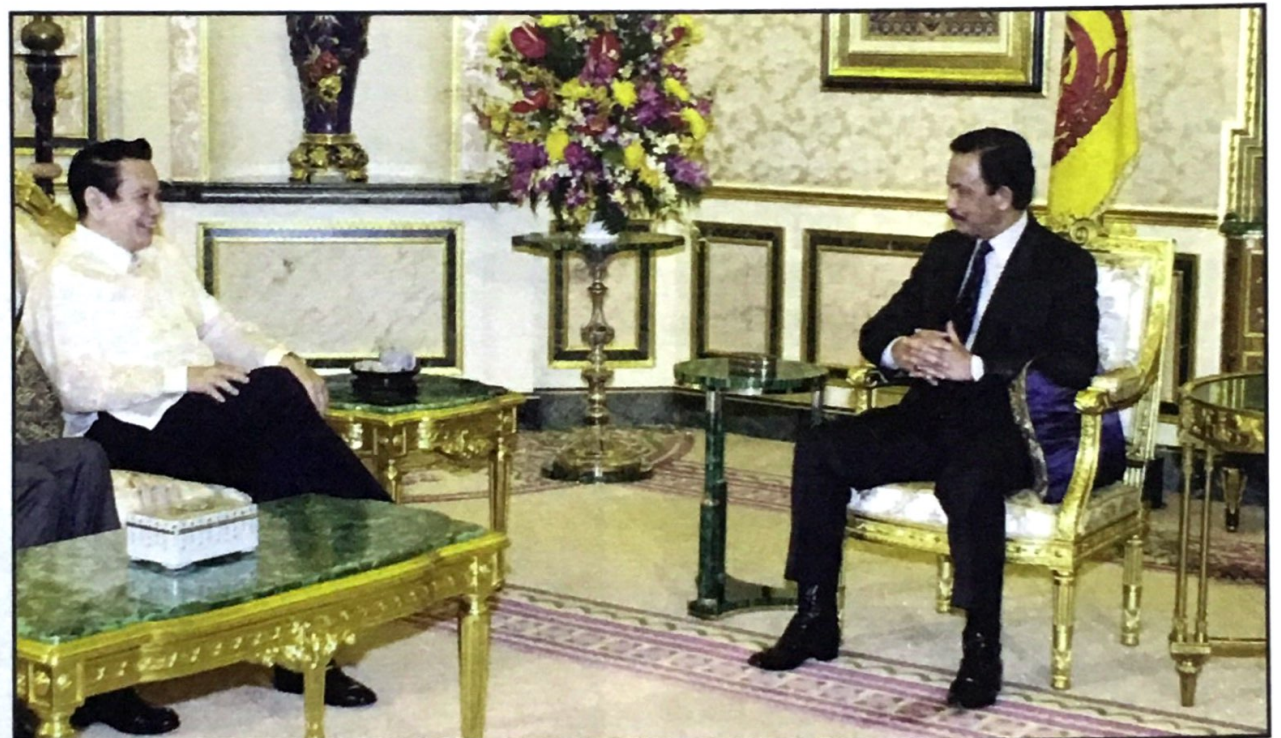
Above: The ruler granting an audience to the Philippines' Vice President and Foreign Secretary, His Excellency Teofisto T. Guingona Jr., and bottom of page, Her Majesty Raja Isteri Pengiran Anak Hajjah Saleha and Her Royal Highness Pengiran Isteri Hajjah Mariam granting an audience to Mrs. Diane Blair.