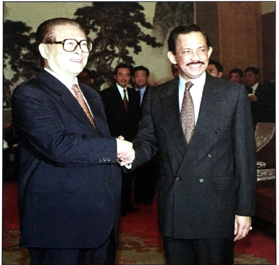
His Majesty Sultan Haji Hassanal Bolkiah Mu'izzaddin Waddaulah, The Sultan and Yang Di-Pertuan of Brunei Darussalam and His Excellency President Jiang Zemin of the People's Republic of China greet each other as they were about to hold a meeting at Zhong Nan Hai in Beijing. The two leaders jointly chaired this month's APEC high-level meeting on human capacity building.

15 – 16 May at the Great Hall of the People, at which both His Majesty and the Chinese leader made key-note addresses (See page 2 'Keeping abreast with technological developments in order to benefit from the New Economy').