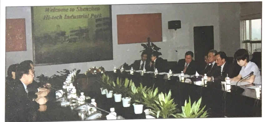
Above: His Majesty and some members of the Brunei delegation being briefed on Shenzhen Hi Tech Industrial Park, prior to their touring the site and its activities. Below left: His Majesty taking a close look at a communication equipment produced at the Shenzhen Hi Tech Industrial Park, and below right, the ruler while touring ZTE Telecom's component manufacturing section.