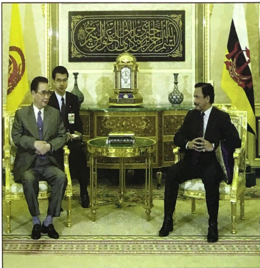
His Majesty The Sultan and Yang Di-Pertuan of Brunei Darussalam and the Chairman of the PRC's Standing Committee of the National People's Congress, His Excellency Li Peng having a meeting at Istana Nurul Iman, left, and below, a banquet, also at Istana Nurul Iman, given by His Majesty in honour of His Excellency Li Peng and his wife, Madam Zhu Lin. Present were Her Majesty Raja Isteri Pengiran Anak Hajjah Saleha, far left, and Her Royal Highness Pengiran Isteri Hajjah Mariam, extreme right, as well as other members of the royal family, state dignitaries, foreign diplomats and members of the visiting delegation.