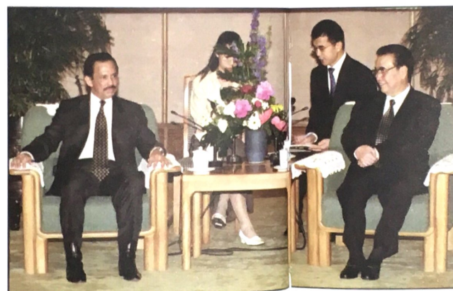
Above left: His Majesty and the Chinese President during their meeting at Zhong Nan Hai, and above right shows the Brunei monarch at yet another meeting, this time with His Excellency Mr. Li Peng, Chairman of the Standing Committee of the National People's Congress. The latter meeting took place at the Great Hall of the Peoples. Below: His Majesty and the PRC's President with heads of delegation from 21 member-economies of APEC attending the high-level meeting on human capacity building.