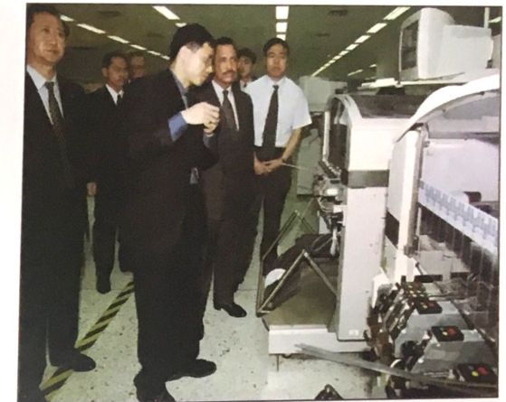
Above: His Majesty gets a briefing on the ZTE Telecom industry while on a tour of its facilities.