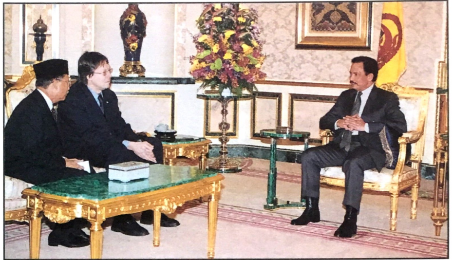
Above: His Majesty The Sultan and Yang Di-Pertuan of Brunei Darussalam receives the Honourable Dr. Ludger Volmer, State Minister at the Federal Foreign Office of the Federated Republic of Germany at Istana Nurul Iman.

His Royal Highness earlier received in audience His Excellency Dr. Ludger Volmer, the State Minister at the Federal Foreign Office of the Federated Republic of Germany, during which the ministers exchanged views on several regional and international issues.