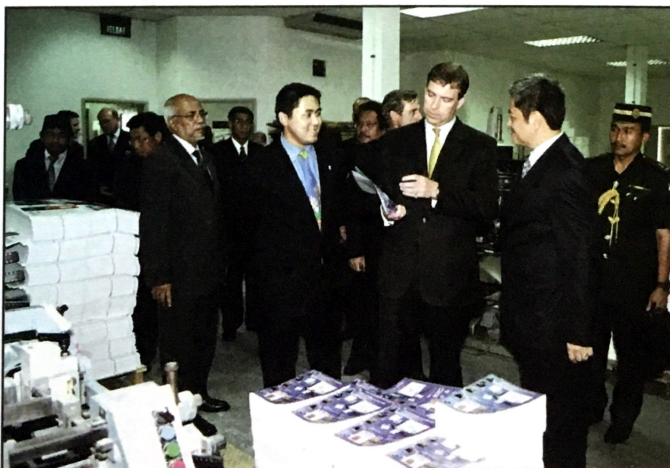
His Royal Highness Prince Andrew making a visit to QAF Brunei, including the company's newspaper production site at the Beribi Industrial complex.