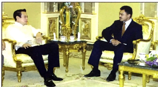
Picture left, the Philippines' Vice President and Foreign Secretary, His Excellency Teofisto T. Guingona Jr. in discussion with His Royal Highness Crown Prince Haji Al-Muhtadee Billah, while picture below shows His Excellency being entertained to a luncheon by His Royal Highness Prince Mohamed Bolkiah, Minister of Foreign Affairs and his wife, Her Royal Highness Pengiran Anak Isteri Pengiran Anak Hajjah Zariah.