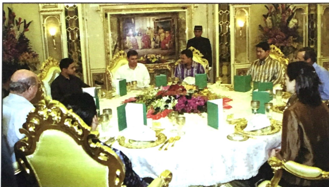
His Royal Highness Prince Andrew at a dinner at Istana Nurul Iman given in his honour by His Royal Highness Crown Prince Haji Al-Muhtadee Billah, above, and below, the prince shares a light moment with His Royal Highness Prince Mohamed Bolkiah who hosted a luncheon.