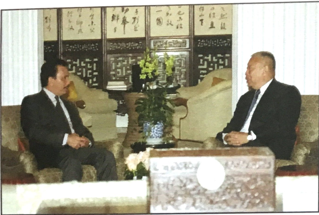
Above: His Majesty The Sultan and Yang Di-Pertuan of Brunei Darussalam at a meeting with Hong Kong's Chief Executive, His Excellency Tung Chee Hwa, who had earlier warmly greeted the Brunei ruler on arrival at Government House, right.