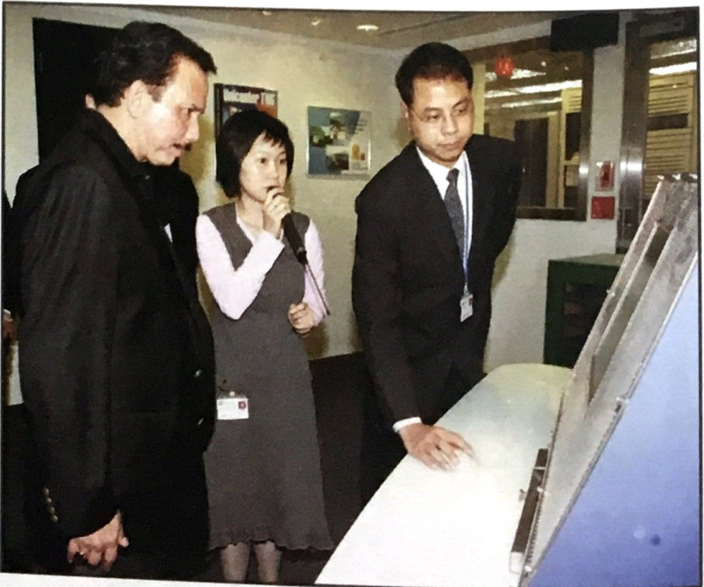
His Majesty looking at some of the state-of-the-art equipment being employed by the Hong Kong port in its operations, above.