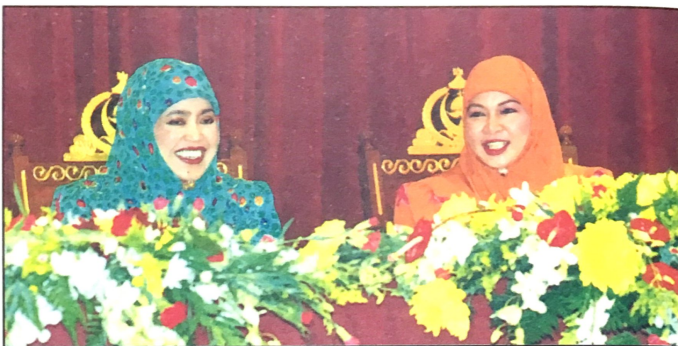
Her Majesty Raja Isteri Pengiran Anak Hajjah Saleha and Her Royal Highness Pengiran Isteri Hajjah Mariam in humorous mood while attending a Hari Raya Aidilfitri celebration, above, and below, a dance performance presented by members of various women's associations affiliated to the Brunei Women's Council at the function.

Before leaving the ceremony, Her Majesty and Her Royal Highness mingled and received hari raya greetings from members of women associations which come under the umbrella of the Women's Council.