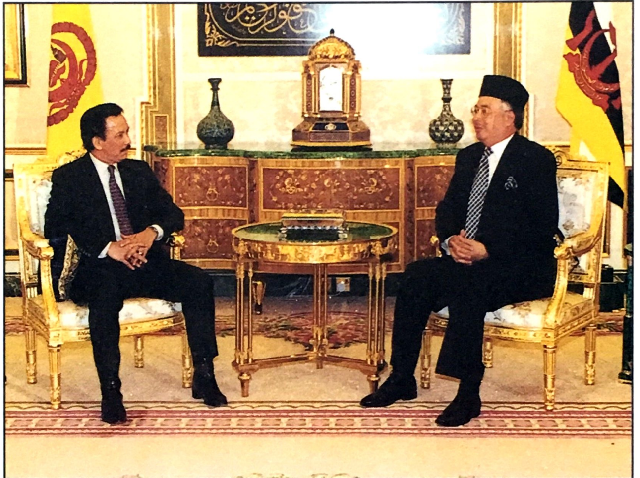
His Majesty The Sultan and Yang Di-Pertuan of Brunei Darussalam and Dato Seri Mohammad Najib in discussion during their meeting on January 29, at Istana Nurul Iman in the Brunei capital, Bandar Seri Begawan.

H is Majesty Sultan Haji Hassanal Bolkiah Mu'izzaddin Waddaulah, The Sultan and Yang Di-Pertuan of Brunei Darussalam granted an audience to the visiting Malaysian Minister of Defence, Dato Seri Mohammad Najib at Istana Nurul Iman, on 29 January. The Minister, accompanied by his wife, was on a three-day official visit.