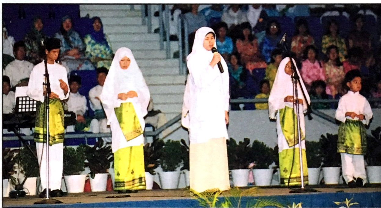
Left: Some of the handicapped children making a singing presentation at the ceremony, while an orchestra from a private school entertained those present with a few renditions.