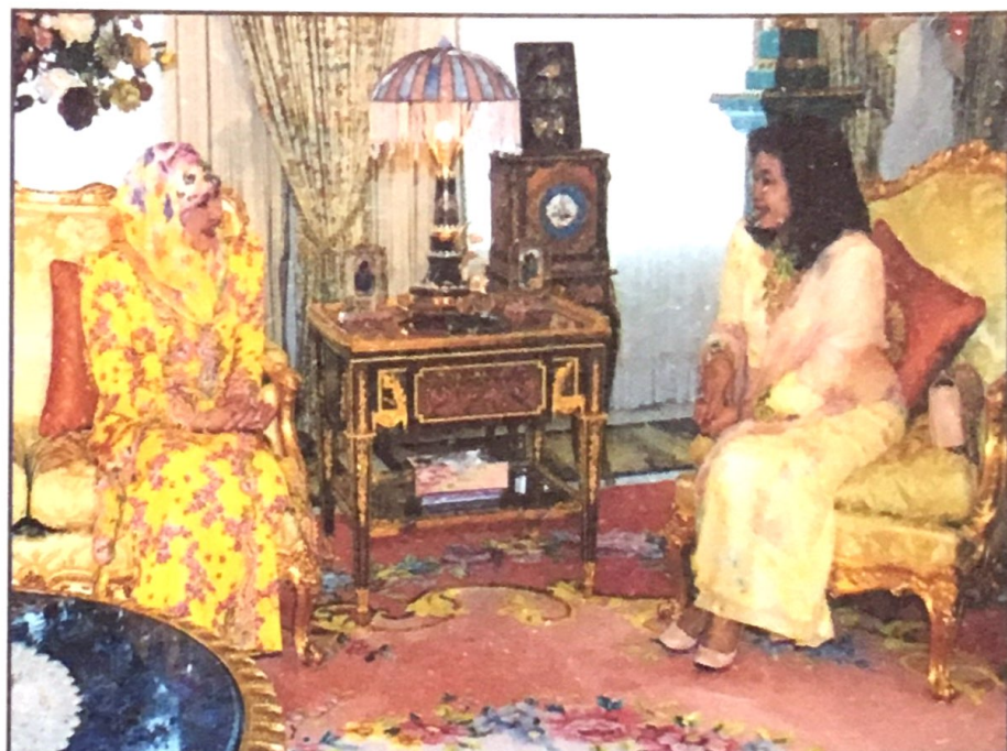
Above left, Her Majesty Raja Isteri Pengiran Anak Hajjah Saleha granting an audience at Istana Nurul Iman to Datin Sri Rosmah, who also had an audience with Her Royal Highness Pengiran Isteri Hajjah Mariam, above right, at Istana Nurul Izzah.