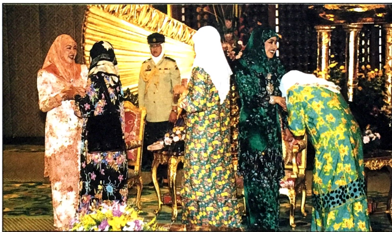
Her Majesty Raja Isteri Pengiran Anak Hajjah Saleha and Her Royal Highness Pengiran Isteri Hajjah Mariam granted an audience to female haj pilgrims before the pilgrims left for the holy land.

Visit www.visitbrunei.com or email bruneitourism@brunet.bn for more details.