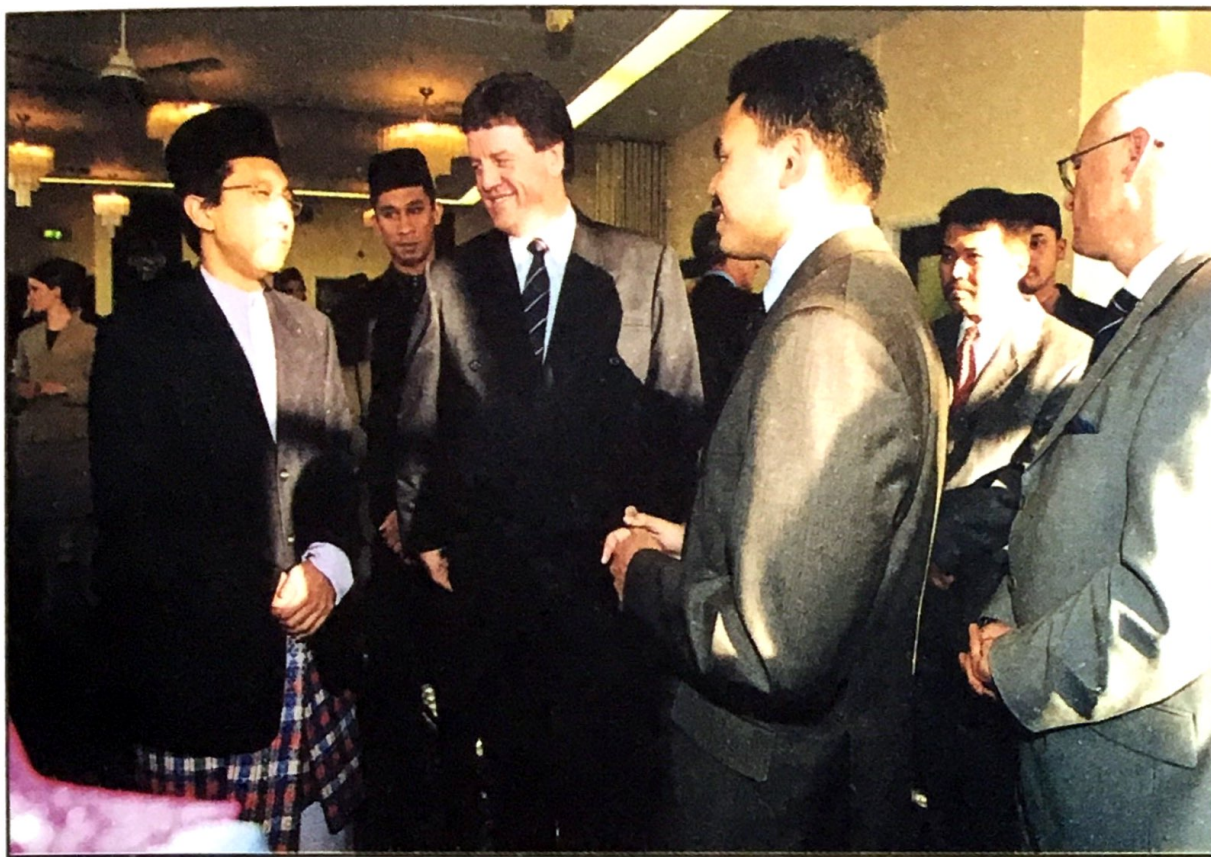
His Royal Highness Crown Prince Haji Al-Muhtadee Billah speaks to one of the Brunei students studying in Cardiff, shortly before attending a luncheon hosted in his honour at the Celtic Suite, UWIC.

* From Centrepage ( Crown Prince visits UK )