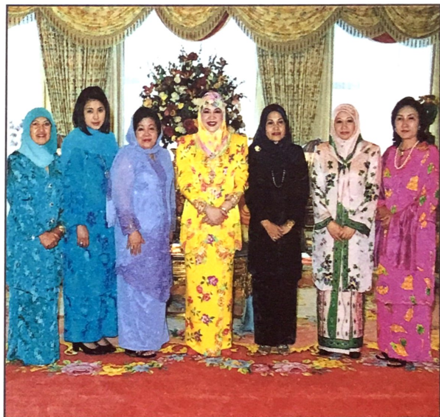
In group photos, members of the Puspanita Women's Association of neighbouring Malaysian state of Sabah with Her Majesty Raja Isteri Pengiran Anak Hajjah Saleha at Istana Nurul Iman, above left, and with Her Royal Highness Pengiran Isteri Hajjah Mariam at Istana Nurul Izzah, above right. Her Majesty Raja Isteri Pengiran Anak Hajjah Saleha, left below, and Her Royal Highness Pengiran Isteri Hajjah Mariam, right below, granting audiences to the wives of the country's new envoys to Jakarta, the UN in New York and the UN in Geneva.