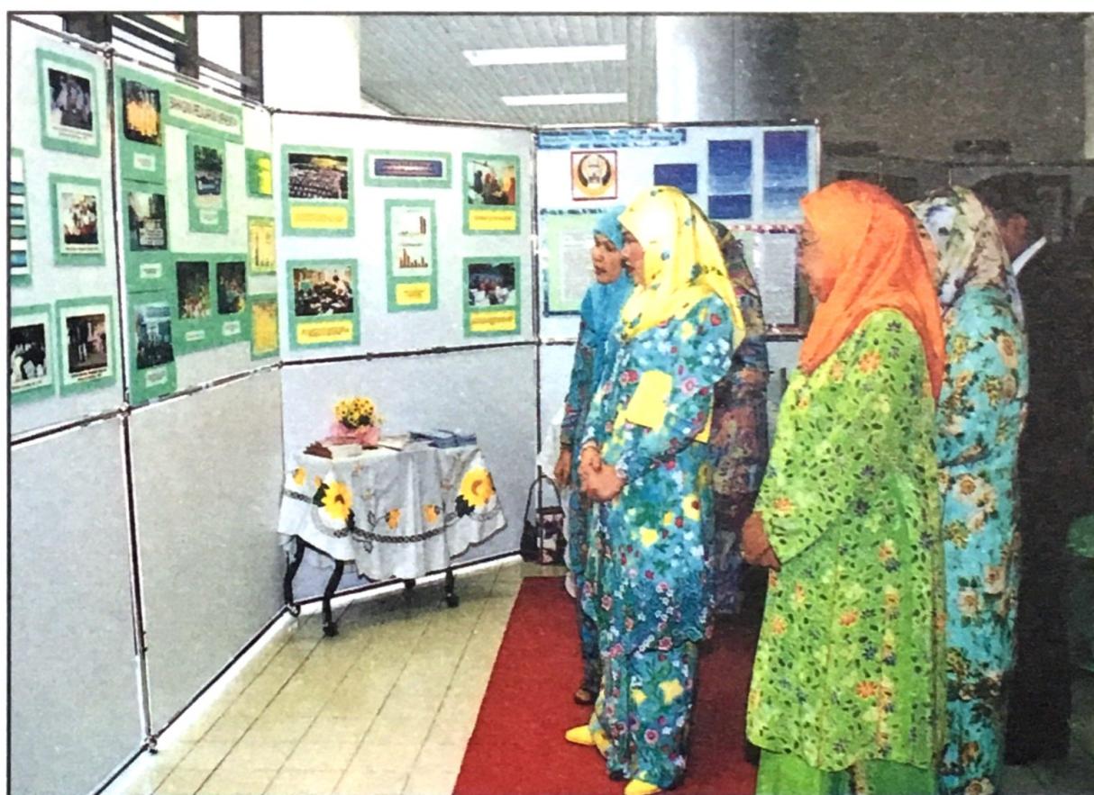
Above: Her Royal Highness Pengiran Isteri Hajjah Mariam views an exhibition shortly after she launched the Brunei Darussalam Children National Council at the Hassanal Bolkiah Indoor Stadium Sports complex in Berakas near the Brunei capital.

The idea of such council was first introduced in HRH's opening speech