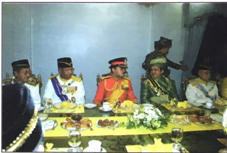
His Royal Highness Crown Prince Haji Al-Muhtadee Billah and His Highness Sultan Tuanku Syed Sirajuddin of Perlis make their way to the throne room of Arau Palace in the Malaysian state's capital of Kangar for the latter's coronation, above left. Above right: His Royal Highness Crown Prince Haji Al-Muhtadee Billah converses with His Highness The Raja Muda of Perlis during a luncheon held shortly after the coronation ceremony of the Sultan of the state of Perlis.