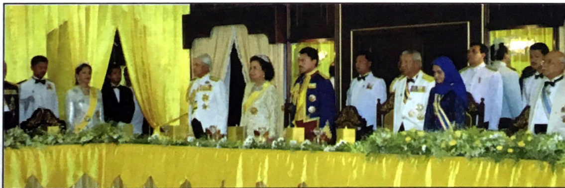
Right: His Royal Highness Crown Prince Haji Al-Muhtadee Billah and other Malaysian rulers at a banquet in conjunction with the coronation of the Sultan of the state of Perlis.