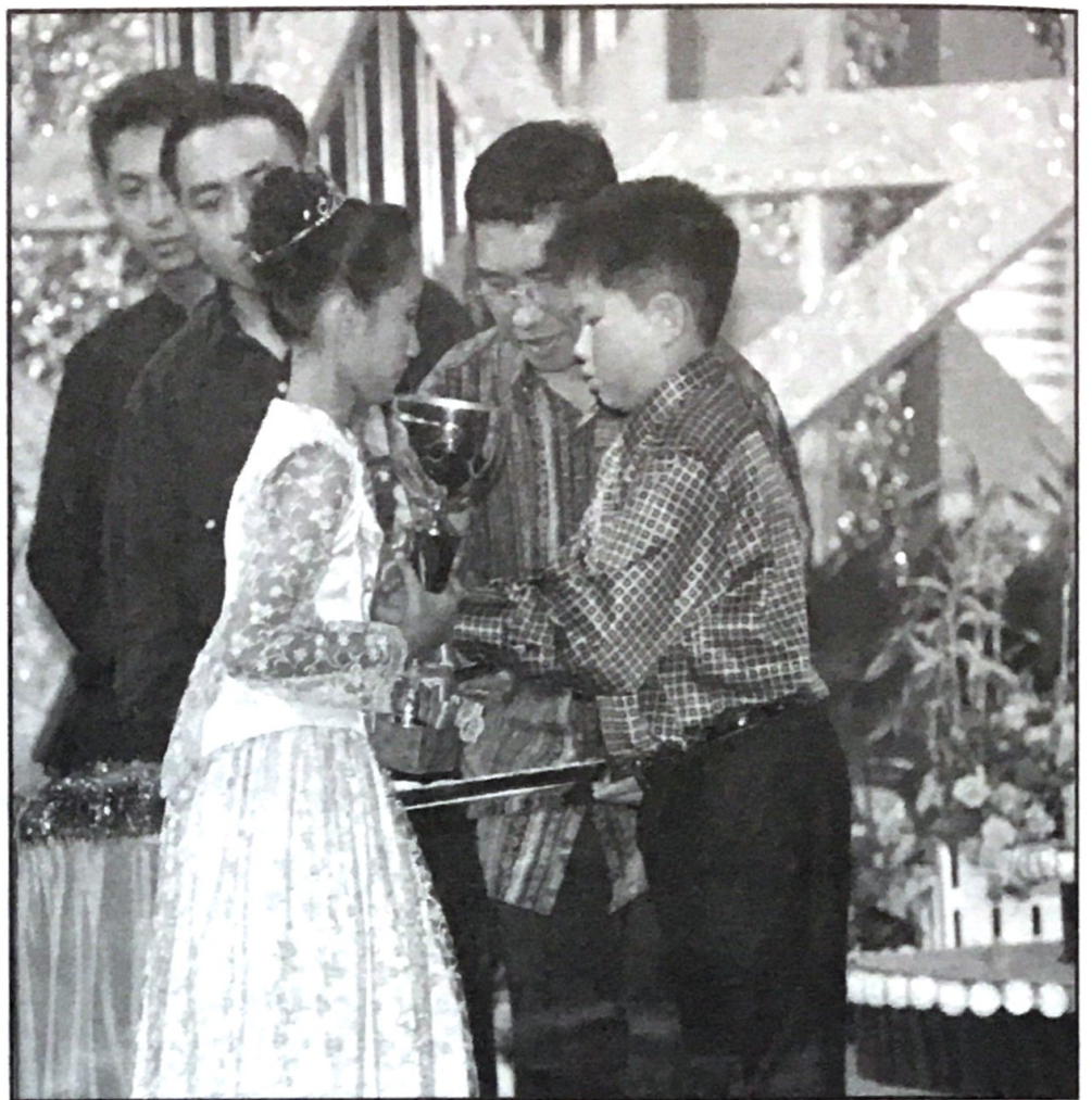
The winner of Kristal and Radio Television Brunei's annual bintang kecil (little stars) singing contest for 2001 receives her prize from the chief guest, His Royal Highness Prince 'Abdul Mateen.

The Bintang Kecil contest was the first step in the singing careers of previous winners who have now recorded albums, he noted.