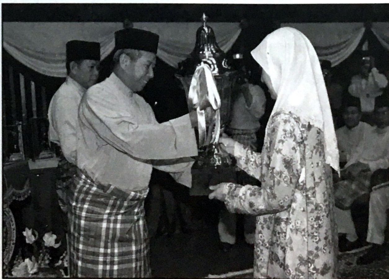
A winner of the female section of the Koran reading competition for youths for the national level receives her prizes from the Minister of Culture, Youth and Sports, Pehin Dato Haji Hussain.