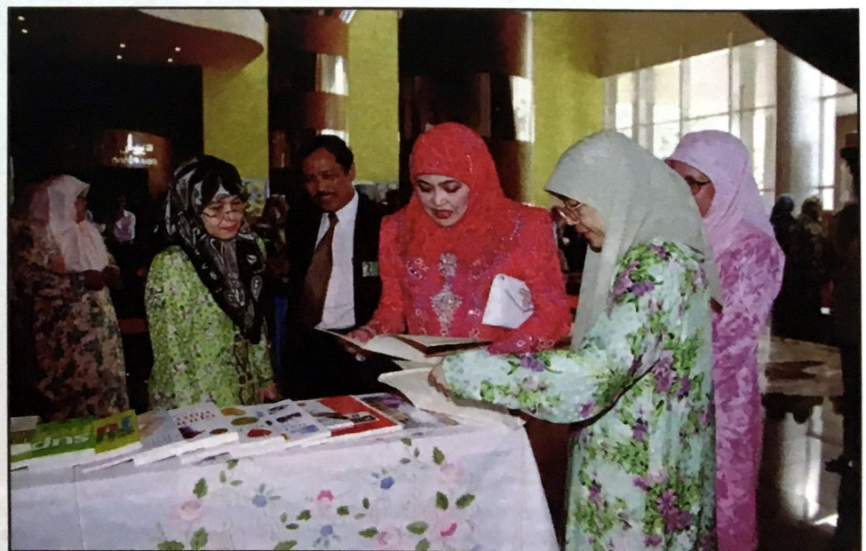
Her Majesty being given a short briefing prior to her touring various exhibitions on health and food security in which numerous government agencies and private companies participated as part of the celebrations marking Women Council Day.