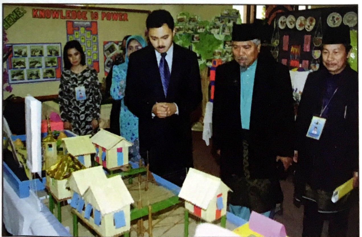
The Brunei Crown Prince views various exhibits made by pupils of the Nusa Laila Puteri School which celebrated its silver jubilee early this month at which His Royal Highness was the guest-of-honor.