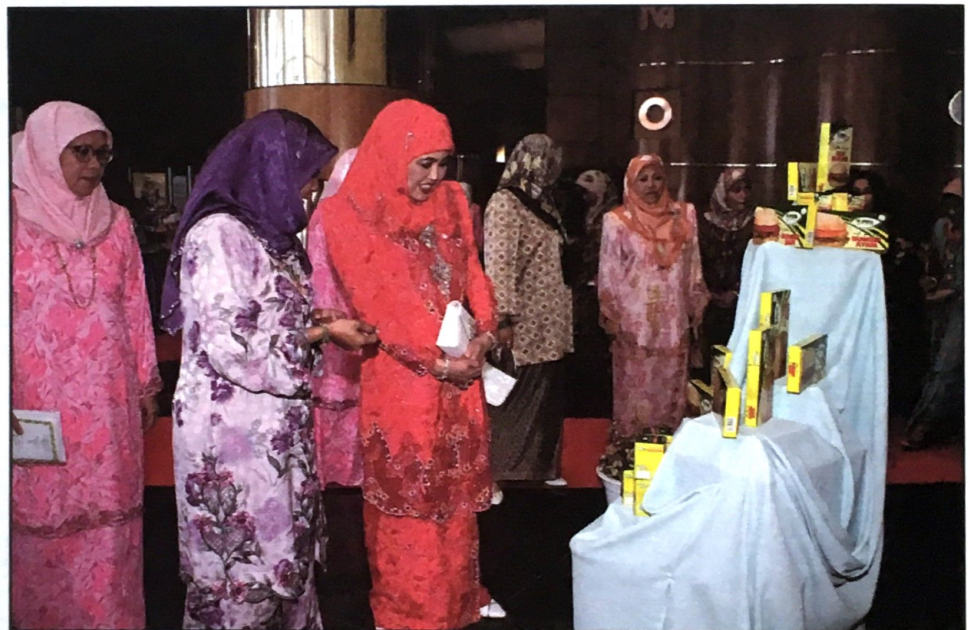
Her Majesty Raja Isteri Pengiran Anak Hajjah Saleha views an exhibition on health and food security which was put up by a local company, above.

Besides being an official organisation for women, the council also strives to help improve the standard of women and the less fortunate in all fields, including education, economy, welfare, culture and social.