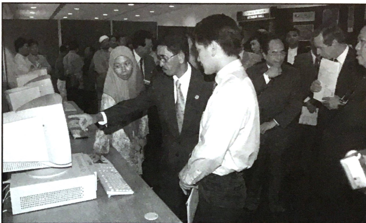
The Minister of Development, Pengiran Indera Wijaya Pengiran Dr. Haji Ismail launched the 6 th ASEAN Science Week in Bandar Seri Begawan emphasizing on the importance of science and technology in the daily lives of the people.

technology development, closer cooperation between the ASEAN countries is needed for every member to march forward in the field.