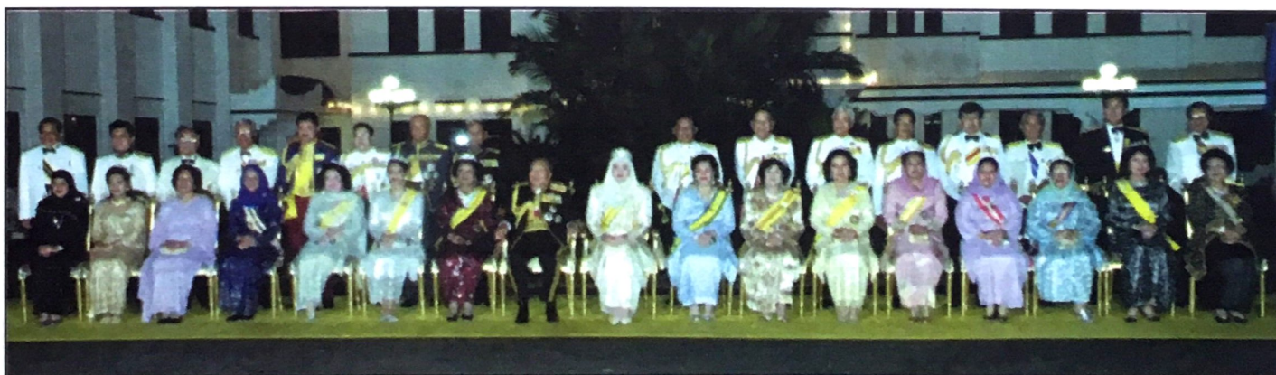
Picture above: Brunei's Crown Prince Haji Al-Muhtadee Billah in a group photo in front of the Arau Palace with the rulers of various Malaysian states attending the coronation of the ruler of Perlis state.