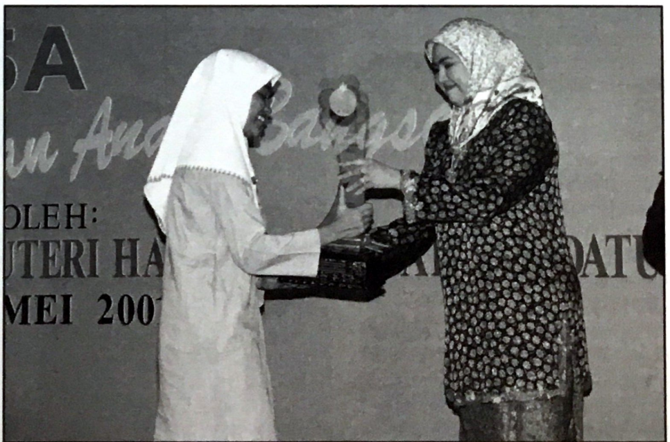
PRYNOSA's Patron, Her Royal Highness Princess Hajjah Rashidah Sa'adatul Bolkiah presents prizes to the team leader of the Sultan Hassan Secondary School – winner of the third PRYNOSA competition.

PRYNOSA 3 was organised by the Forestry Department and sponsored by Brunei Shell Petroleum Company Sendirian Berhad (BSP).