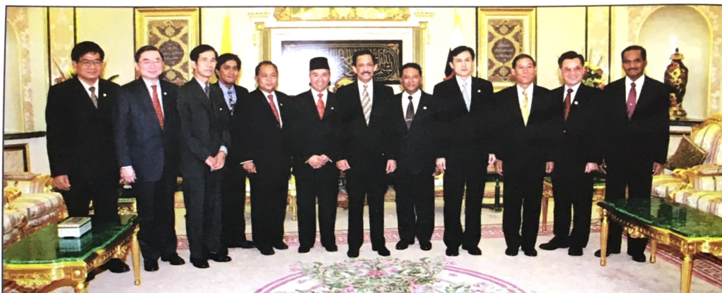
ASEAN's Energy Ministers with His Majesty The Sultan and Yang Di-Pertuan of Brunei Darussalam at Istana Nurul Iman (palace) in Bandar Seri Begawan.