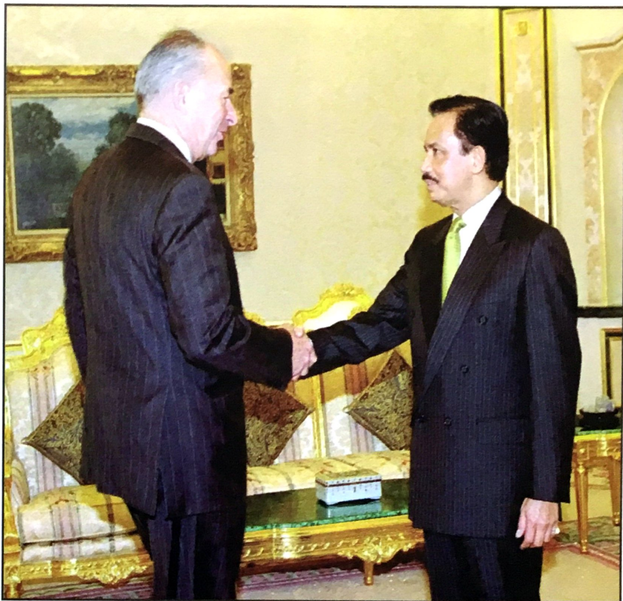
His Majesty The Sultan and Yang Di-Pertuan of Brunei Darussalam and His Excellency Don McKinnon, Secretary General of the Commonwealth greet each other before getting down to discussions on matters pertaining to the commonwealth.