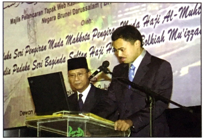
Above: His Royal Highness Crown Prince Haji Al-Muhtadee Billah officially launches the Brunei Darussalam National Information Technology (BIT) Council's official website while the Minister of Communications, Pehin Dato Haji Zakaria looks on. The Crown Prince afterwards toured an exhibition on current technology developments put up by both the public and private sectors.

His Royal Highness Crown Prince Haji Al-Muhtadee Billah has launched the Brunei National Information Technology (BIT) Council's official Website at the Development Ministry in Berakas on 9 July.