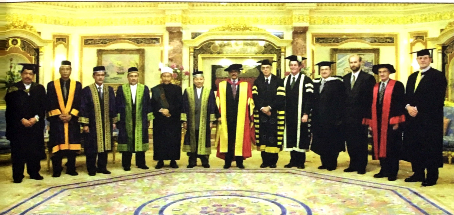
His Majesty The Sultan and Yang Di-Pertuan of Brunei Darussalam in a group photo with senior members of Universiti Brunei Darussalam and Australia's Queensland University after being awarded an honorary doctorate of law degree by the latter institution.