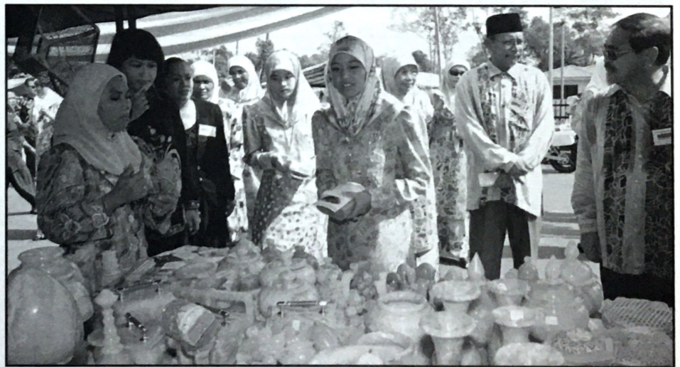
Her Royal Highness Princess 'Azemah Ni'matul Bolkihah, centre, takes a walk about of the exhibition and sales stalls after she had officially opened the Al-Ameerah Al-Hajah Maryam Centre's open day. The Princess was accompanied by her sister, Her Royal Highness Princess Fadzilah Lubabul Bulqiah, slightly behind to HRH's right.