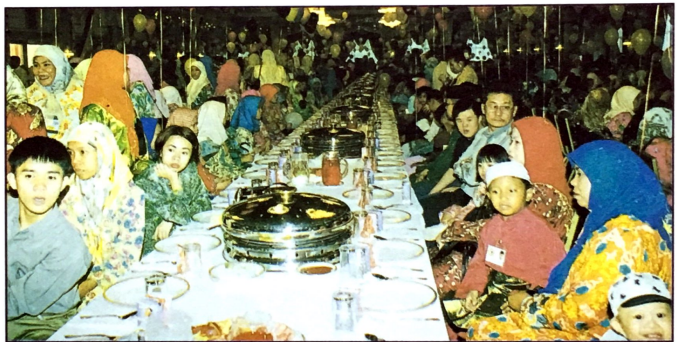
Orphans, handicapped and less fortunate enjoying the festivity.

On 1 January, His Majesty Sultan Haji Hassanal Bolkiah Mu'izzaddin