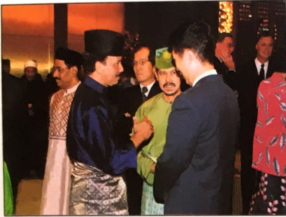
Above: His Majesty the Sultan and Yang Di-Pertuan of Brunei Darussalam and his brother, His Royal Highness Prince Mohamed Bolkiah, the Minister of Foreign Affairs, mingle and chat informally with state dignitaries and foreign diplomats on Hari Raya Aidilfitri morning. Right: The ruler exchanges greetings with one of thousands of visitors who had come to Istana Nurul Iman when it was open to the public for three-days in conjunction with the Hari Raya Aidilfitri festival. Looking on are His Royal Highness Crown Prince Haji Al-Muhtadee Billah, second from right and His Royal Highness Prince Mohamed Bolkiah, far right.