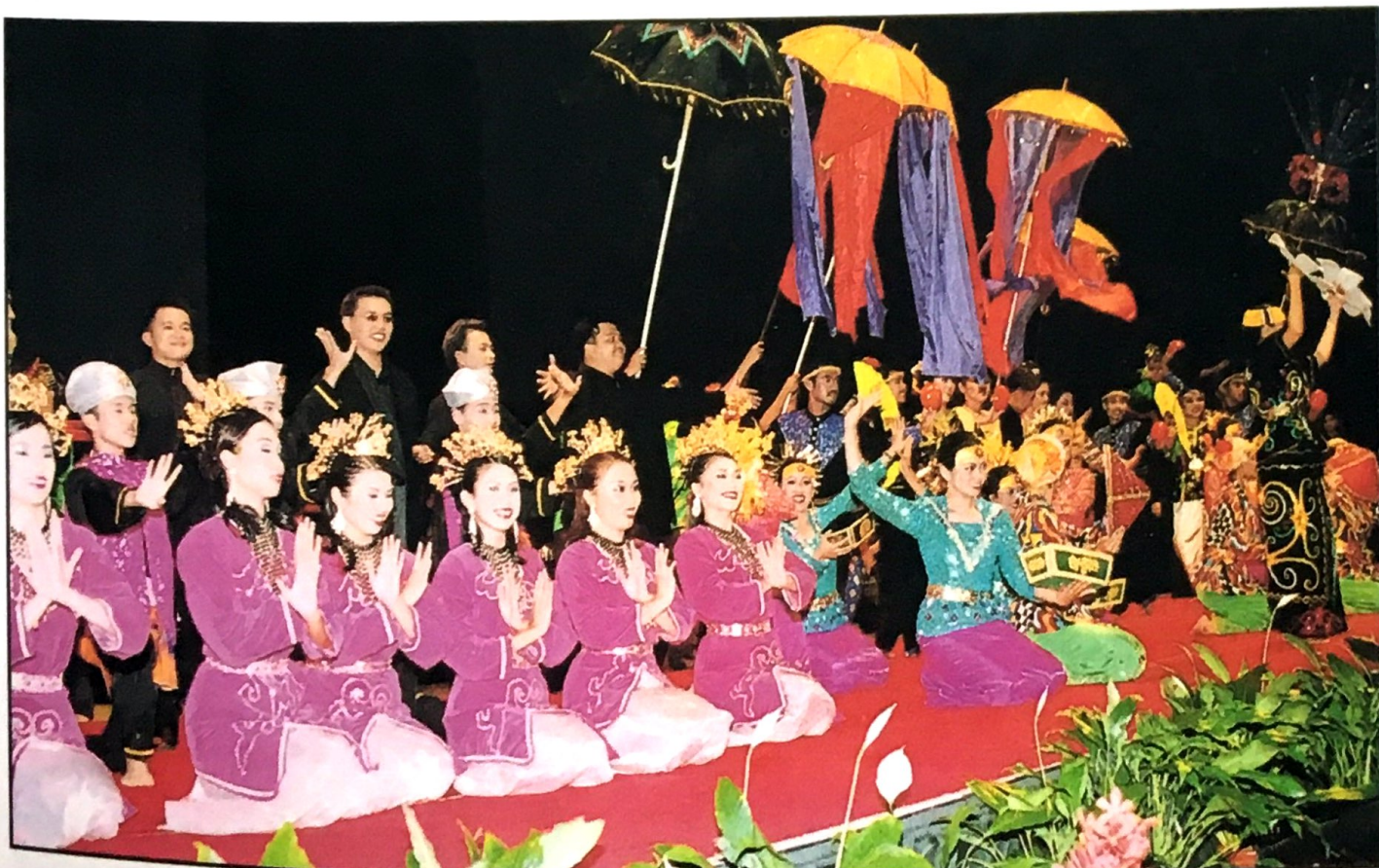
After the firework displays and an array of cultural performances, His Majesty consented to mingle and chat informally with business people, entrepreneurs as well as artistes (above), who contributed to making the evening a lively occasion.