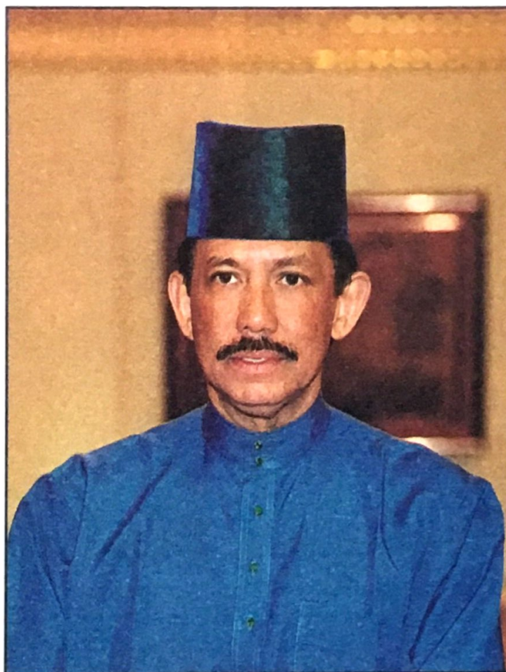
His Majesty The Sultan and Yang Di-Pertuan of Brunei Darussalam urged for the strengthening of faith in order to uphold the resilience of the Muslim race.

H is Majesty Sultan Haji Hassanal Bolkiah Mu'izzaddin Waddaulah, The Sultan and Yang Di-Pertuan of Brunei Darussalam has said that the 'Islamic soul' is the most important factor in building the resilience of the ummahs (Muslim race). Muslims with true Islamic spiritualism and piety will be blessed and protected by Allah The Almighty.