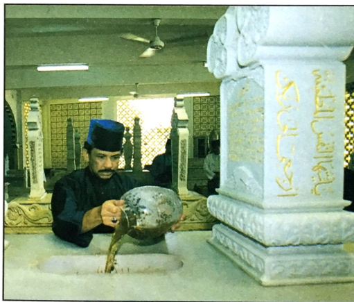
His Majesty The Sultan and Yang Di-Pertuan of Brunei Darussalam leads members of the royal family to sprinkle 'ayeng asah-asahan' (scented water) on the tombs of his late parents at the royal mausoleum in Bandar Seri Begawan.

His Majesty Sultan Haji Hassanal Bolkiah Mu'izzaddin Waddaulah, The Sultan and Yang Di-Pertuan of Brunei Darussalam attended a bertahlil (recital of Islamic religious verses) ceremony for his late parents at the Royal Mausoleum in Jalan Kubah Makam Di-Raja in the Brunei capital on January 3.