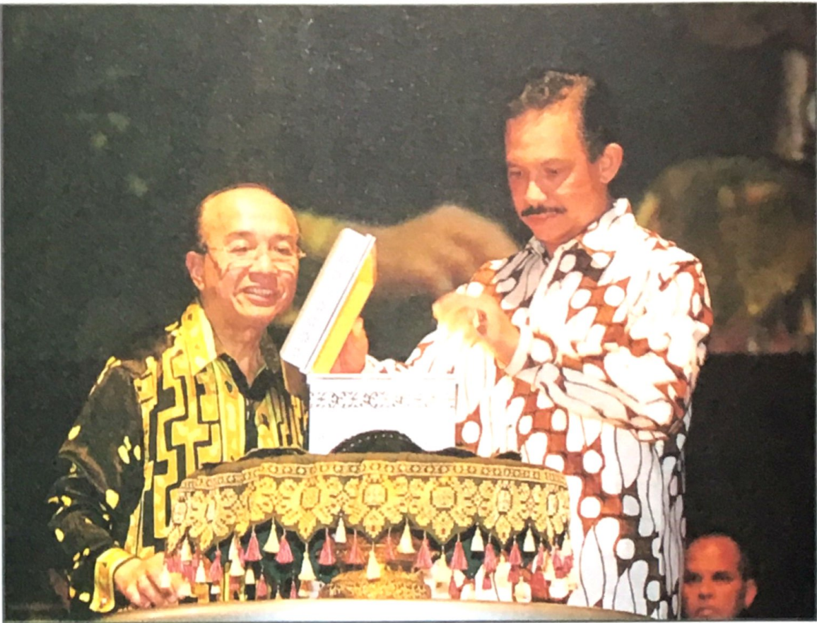
Right: The Chairman of the ASEAN Tourism Minister's Meeting who is also Brunei's Minister of Industry and Primary Resources, Pehin Dato Awang Haji Abdul Rahman looks on as His Majesty officially launches the Visit Brunei Year 2001 and Visit ASEAN Campaign 2002. Below: Artistes get together on stage for the final presentation of the evening as some 2,000 guests watched.