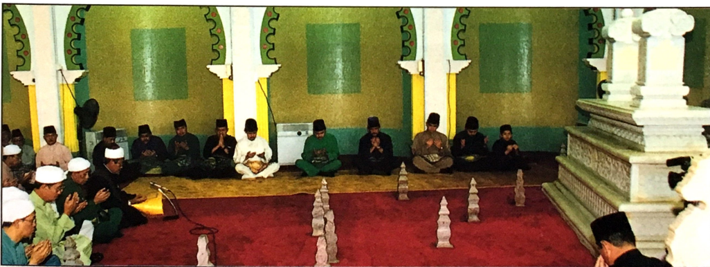
His Majesty and other members of the royal family and others present at the bertahlil ceremony upturn the palms of their hands to seek Allah The Almighty's blessings as the State Mufti reads the do'a.