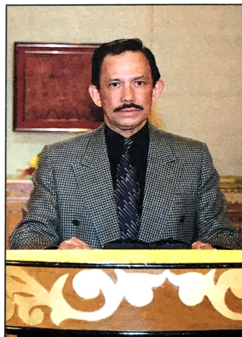
His Majesty Sultan Haji Hassanal Bolkiah Mu'izzaddin Waddaulah, The Sultan and Yang di-Pertuan of Brunei Darussalam, in a televised address ushering in the New Year 2001, underscored the importance of knowledge and education for nation building.

To that, His Majesty says, "Members of the civil services as well as those in the service sector need to aim for high quality work ethics through excellent and trusted service. Likewise those in the private sector whose participation and contribution as well as enhanced productivity are equally essential in the development and progress of the country."