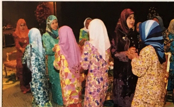
Her Majesty Raja Isteri Pengiran Anak Hajjah Saleha exchanges greetings with wives of state dignitaries and foreign diplomats, centre-left, while Her Royal Highness Pengiran Isteri Hajjah Mariam does likewise, above-left, as did other members of the royal family, left below. Above centre: His Majesty The Sultan and Yang Di-Pertuan of Brunei Darussalam and other male members of the royal family receiving a long line of visitors who came to convey greetings. Right: His Majesty's first grandchild, Princess Raheemah Sanaul Bolkiah appears intent while going through her first experiences of exchanging greetings with the well-wishers.