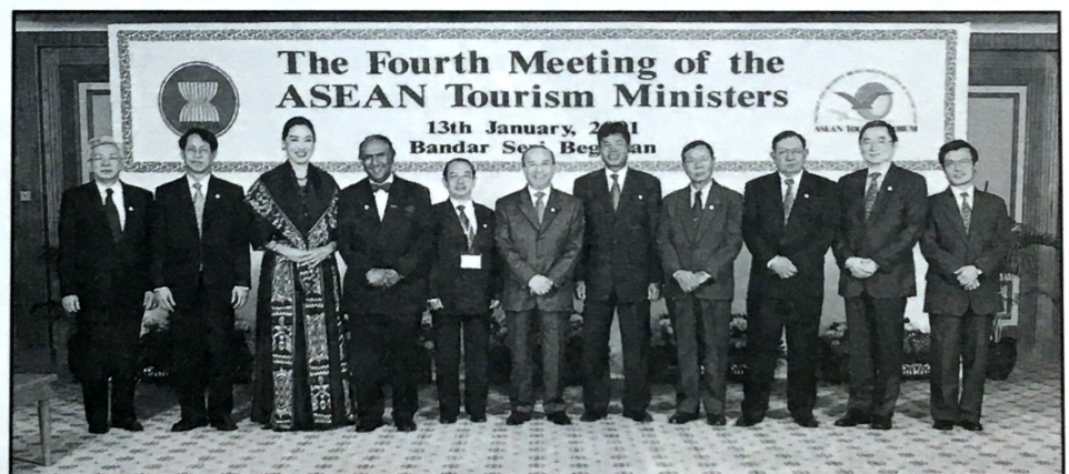
ASEAN Tourism ministers in a group photograph during their fourth meeting in Bandar Seri Begawan. The Chairman of the meeting, Brunei Darussalam's Minister of Industry and Primary Resources is in the centre.

The eight-day ASEAN Tourism Forum (ATF) held in Bandar Seri Begawan, Brunei Darussalam's capital, from January 9-16 that enforced the Visit ASEAN Campaign (VAC) from January 13 of which Brunei contributes B$30 million to market ASEAN as a single destination was planned in tandem with the launching of the Visit Brunei Year 2001.