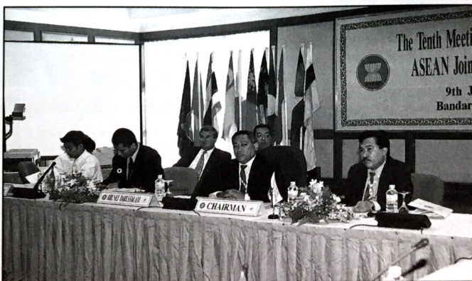
The Director of Promotion and Tourism Development, Sheikh Jamaluddin chairs a meeting of the ASEAN Tourism Forum.

Brunei Darussalam's economic diversification mooted in its Sixth National Development Plan of 1986-1990 entailed a multifaceted industrial development that included the tertiary industrial sector such as tourism. Tourism potential was once again underscored in the Seventh National Development Plan of 1996-2000 with a sum of B$8.9 million earmarked for tourism infrastructure expenses. Following the economic downturn of 1997, Brunei's response was the establishment of the Brunei Darussalam Economic Council (BDEC) in 1999, a group comprising of State officials and prominent members of the local business community tasked to produce short and long-term action plans for economic recovery. BDEC produced a cascade of reports that collectively form the country's economic blue print. In one of its reports BDEC's recommendations identified the tourism sector as bearing economic potentials.