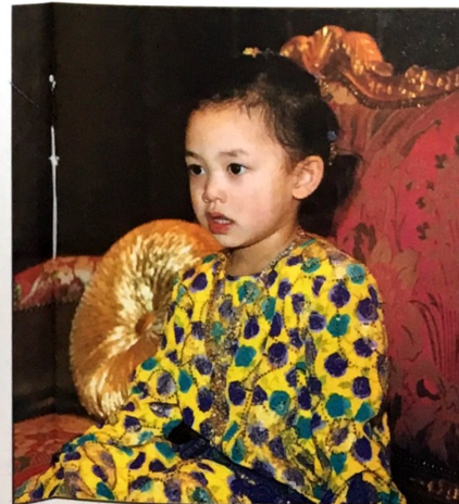
His Majesty's daughters, Their Royal Highnesses Princess Hajjah Rashidah Sa'adatul Bolkiah, Princess Hajjah Muta-Wakilah Hayatul Bolkiah, Princess Hajjah Majeedah Nuurul Bolkiah, Princess Hajjah Hafizah Sururul Bolkiah, Princess 'Azemah Ni'matul Bolkiah and Princess Fadzilah Lubabul Bolkiah also joined in the festive greeting exchanges with the thousands of visitors who converged on Istana Nurul Iman, below.