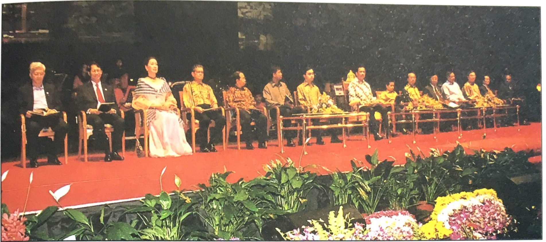
Above: His Majesty pictured with his children, Their Royal Highnesses Prince 'Abdul Malik and Prince 'Abdul Mateen and ASEAN Tourism Ministers at the launching ceremony of Visit Brunei Year 2001 and Visit ASEAN Campaign 2002. The fireworks and cultural show-filled event took place at Jerudong Playground and Recreation Park.