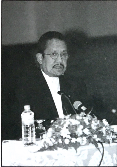
The President of Brunei Darussalam's National Olympic Council, His Royal Highness Prince Haji Sufri Bolkiah outlining stricter stand on selection of Brunei athletes and sportsmen for future international and regional competitions.

His Royal Highness Prince Haji Sufri Bolkiah, the President of Brunei Darussalam's National Olympic Council said, only the best athletes and teams would be allowed to participate in the 21 st Southeast Asian (SEA) Games, to be held in Kuala Lumpur, Malaysia later this year.