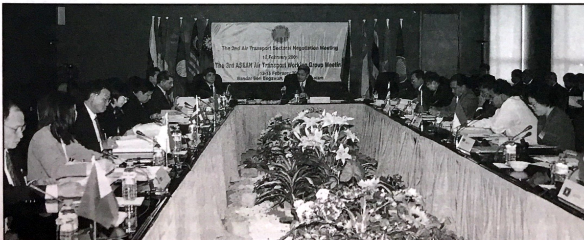
A session of the Third ASEAN Air Transport Working Group Meeting in progress at the Ministry of Communication in Berakas, near Bandar Seri Begawan.