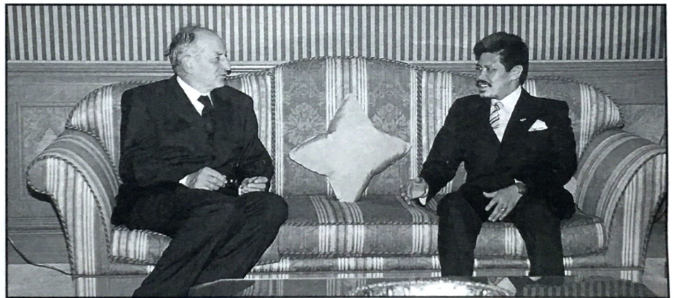
Brunei Darussalam's Minister of Foreign Affairs, His Royal Highness Prince Mohamed Bolkiah and Switzerland's Federal Councillor and Economic Minister in discussion during their meeting at Balai Penghadapan, Bukit Kayangan in the Brunei capital, Bandar Seri Begawan, above. Below: The visiting Swiss Economic Minister and Brunei's Minister of Industry and Primary Resources led their respective delegation in a meeting, at which cooperation in various areas between the two countries were discussed, including trade, investment, tourism and banking.

His Excellency and delegation also took the opportunity to visit places of interest in the country, which included the Jame Asr' Hassanal Bolkiah mosque in Kiulap, the Royal Regalia Building and the 'Kampong Ayer' or Water Village.