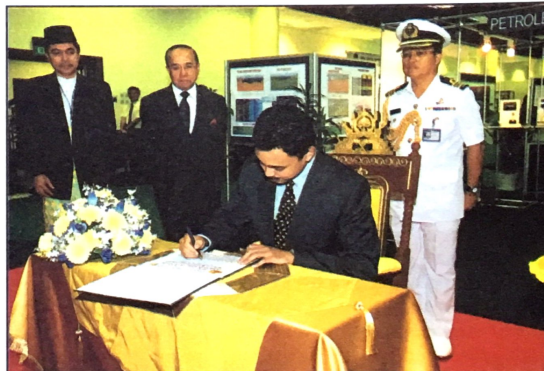
His Royal Highness Crown Prince Haji Al-Muhtadee Billah speaking at the launching of the new petroleum exploration areas while the Minister of Industry and Primary Resources, who is also BOGA's Chairman, Pehin Dato Awang Haji Abdul Rahman looks on, top picture. Above: HRH The Crown Prince signing the visitor's book. Left and below: HRH The Crown Prince being briefed by officials as he toured an exhibition on the petroleum industry.