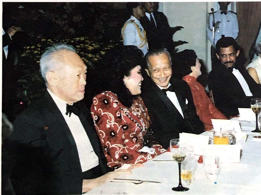
Top left: His Majesty the Sultan and Yang Di-Pertuan of Brunei Darussalam inspected a guard of honour mounted by Singapore's Armed Forces personnel at the ground of the Istana Negara soon after the Brunei ruler arrived for a three-day state visit. His Majesty and Her Majesty the Raja Isteri Pengiran Anak Saleha were also given a red carpet welcome earlier at the Changi International airport, picture above. Middle picture: From left to right are the Right-Honourable Prime Minister of Singapore, Mr. Lee Kuan Yew, Her Majesty the Raja Isteri Pengiran Anak Saleha, His Excellency Mr. Wee Kim Wee, Mrs. Wee Kim Wee and His Majesty the Sultan and Yang Di-Pertuan of Brunei Darussalam at a state banquet hosted by the Singapore President. Their Majesties the Sultan and the Raja Isteri attending a reception hosted by Prime Minister Lee Kuan Yew. Below: In a separate itinerary, Her Majesty the Raja Isteri Pengiran Anak Saleha visited the Rosyth School - an institution for some of the republic's brightest students.