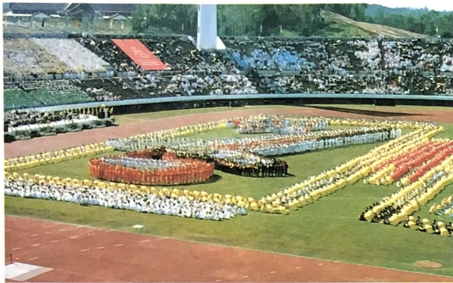
Top picture: His Majesty the Sultan (forefront) watches the National Day celebration at the Hassanal Bolkiah National Stadium. Seated on His Majesty's right are his brothers, HRH Prince Muda Haji Mohamed Bolkiah and HRH Prince Muda Haji Jefri Bolkiah and partly hidden on His Majesty's left is HRH Prince Muda Haji Sufri Bolkiah. Above: The centre-part of the stadium is engulfed by a sea of colours as participants went about with their presentations. And Below: The private sector, too, contributed towards making the National Day celebration as colourful and memorable as possible and banners put by some private organisations line the streets of the capital alongside the multi-coloured illuminations and arches.