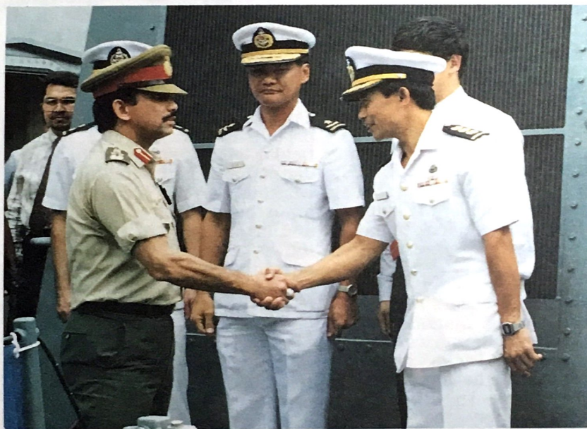
Top left: His Majesty the Sultan and President Wee Kim Wee engrossed in discussion during a tea party hosted by the Singapore Head of State. Above: During a visit to the Jurong Industrial Estate, the Brunei ruler planted a 'Tambusu tree' to mark his visit there. In the picture on left, His Majesty the Sultan bids farewell to the Commander of the RSS Valour at the end of his tour of the missile-corvette and saw its sea combat capability. Bottom left: Sporting an airman's uniform, the Brunei monarch took part in a 40-minute flight on board a Hawkeye Reconnaissance aircraft of the Singapore Airforce, which he piloted for part of the flight. Bottom picture: Her Majesty the Raja Isteri Pengiran Anak Saleha signing the visitor's book on arrival the Singapore Botanical Garden where an orchid was named Dendrobium Saleha , in her honour.