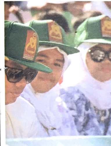
Above: With the theme and logo of the celebration imprinted in their caps, the National Day is a time for rejoicing for both participants and spectators alike. Left: Beautiful arches are everywhere creating a lively atmosphere of celebration and festival. Right: The participants make yet another formation based on the theme of the celebration that "Effective communication strengthens unity."