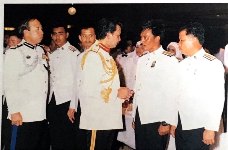
The monarch also consented to give a separate banquet for members of the security forces and uniformed Government Departments and uniformed voluntary organisations, with some of whom he chatted informally, pictures above and right.