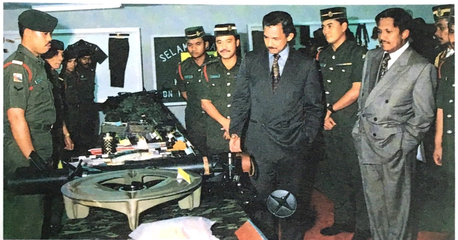
As he had done days earlier in the Brunei Muara, Tutong and Temburong districts, the monarch mingled freely and informally with his subjects in Belait as he toured various programmes of activities especially put up for the celebrations.

In his titah (royal address) at a ceremony heralding his 48th birthday anniversary celebrations in the Belait district on July 22, the Brunei monarch said that the district is well-known for its multi-racial population. Besides citizens and permanent residents, it also has