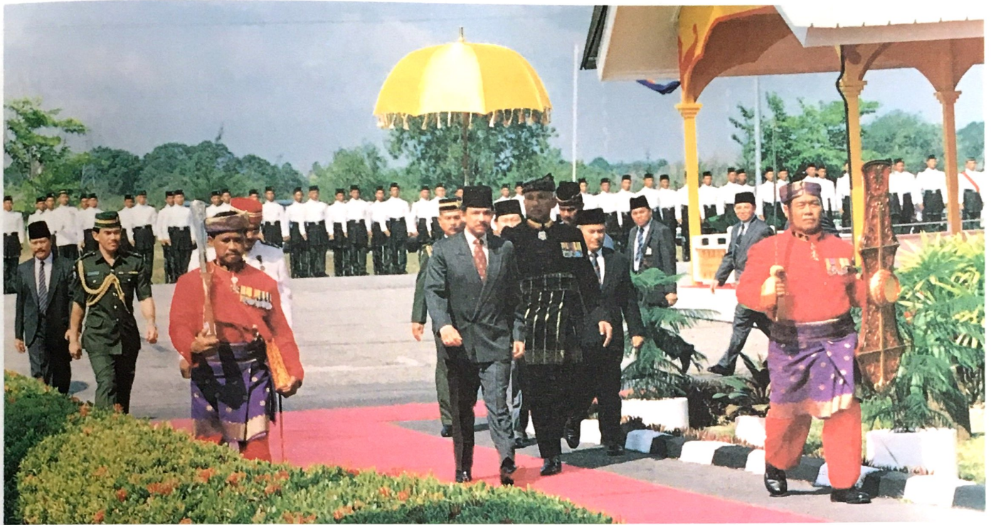
Above: His Majesty The Sultan and Yang Di-Pertuan of Brunei Darussalam leaves the Tutong Town civic centre's ground after he had inspected the parade and makes his way for the audience ceremony inside the centre at the start of his birthday celebrations in the Tutong district.