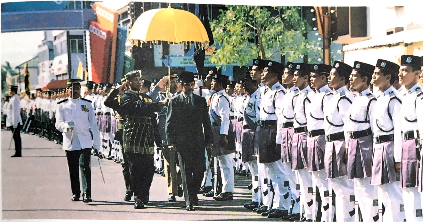
A parade in front of the Kuala Belait community centre, and an audience within marked the start of His Majesty's birthday celebrations in the Belait district.