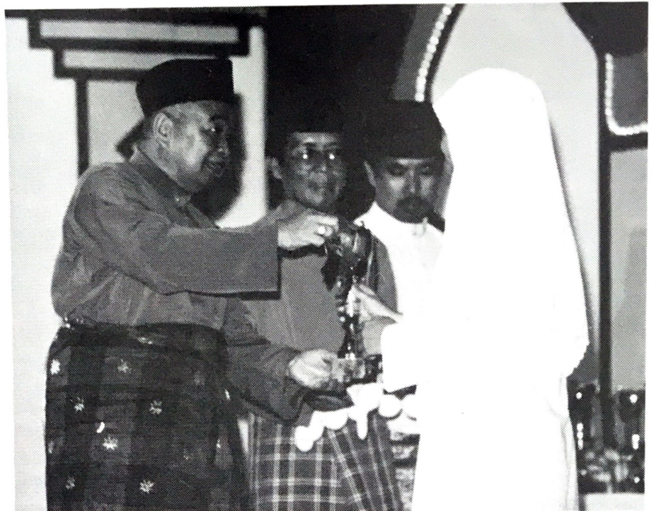
The Minister of Religious Affairs, Yang Berhormat Pehin Jawatan Luar Pekerma Raja Dato Seri Utama Dr. Ustaz Haji Awang Mohd. Zain bin Haji Serudin presents prize to a winner of a 'Rawi' reading competition among schools.

The minister said one of the bases of 'akidah' (faith) is believing in the messengers of Allah the Almighty, of whom Prophet Muhammad (peace be upon him) was the last. One of the