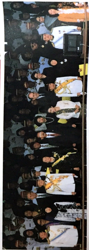
Paduka Seri Pengiran Perdana Wazir Sahibul Himmah Wal Waqar Pengiran Muda Mohamed Bolkih, HRH Paduka Seri Pengiran Bendahara Seri Maharaja Permaisura Pengiran Muda Haji Sufri Bolkih and Yang Amat Mulia (YAM) Pengiran Bini Hajjah Mazlun, HRH Paduka Seri Pengiran Digadong Sahibul Mai Pengiran Muda Haji Jefri Bolkih and YAM Pengiran Anak Isteri Pengiran Norhayati, HRH Paduka Seri Duli Pengiran Muda Haji 'Abdul 'Azim, HRH Paduka Seri Duli Pengiran Muda 'Abdul Malik, Yang Teramat Mulia (YTM) Paduka Seri Pengiran Anak Puteri Hajjah Rashidah Sa'adatul Bolkih, YTM Paduka Seri Pengiran Anak Puteri Hajjah Muta-Wakkilah Hayatul Bolkih, YTM Paduka Seri Pengiran Anak Puteri Hajjah Majeedah Nurul Bolqiah, YTM Paduka Seri Pengiran Anak Puteri Hajjah Halifah Sururul Bolqiah, YTM Paduka Seri Pengiran Anak Puteri 'Azemah Ni'matul Bolkih and YTM Paduka Seri Pengiran Anak Puteri Fadziilah Lubabul Bulqiah, pictures at top left and top right. Left: His Majesty about to inspect the parade staged by men of the Royal Brunei Armed Forces, the Royal Brunei Police Force, uniformed Government Departments and uniformed voluntary organisations in the capital - the first of a series of parades traditionally held to mark the ruler's birthday anniversary.