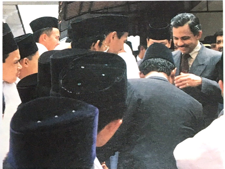
Right: As in other districts, the ruler is ever-swamped by his subjects in Tutong eager to greet him during the meet-the-people session, which followed the parade and audience ceremony.

Tutong is a heavily-agricultural district and one of the highlights of the celebrations in the district was an exhibition on agriculture and forestry, below, besides many other programmes.