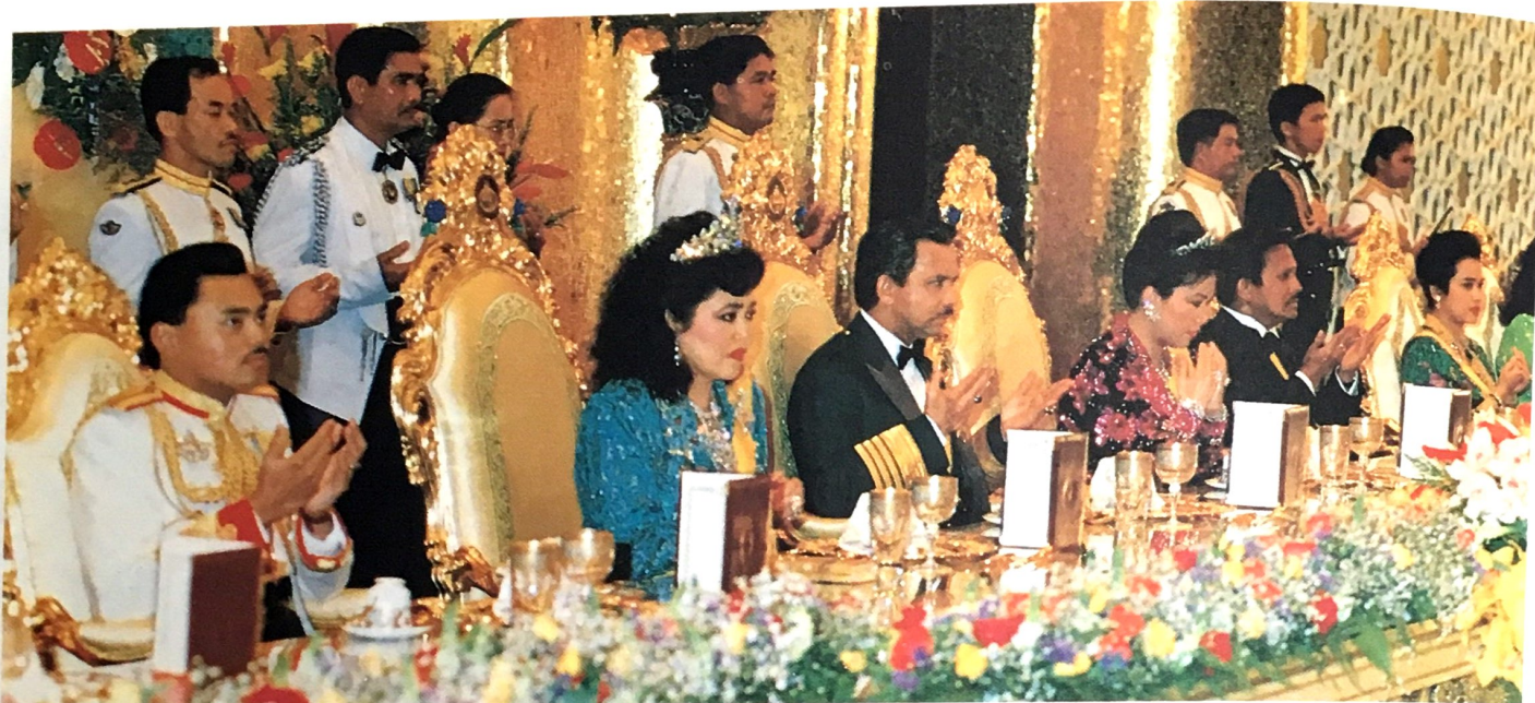
His Majesty, Her Majesty the Raja Isteri, Her Royal Highness the Pengiran Isteri and His Royal Highness Prince Haji Al-Muhtadee Billah and other members of the royal family raise their hands to the do'a at the start of state banquet in conjunction with the ruler's birthday. It was attended by some 2,000 guests comprising state dignitaries, foreign VIPs and diplomats based in Brunei Darussalam, senior Government officials and leading members of the community and business sectors.