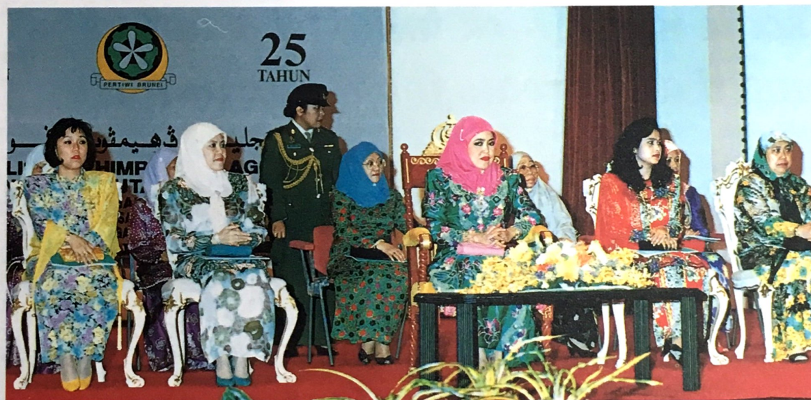
Left: Several women members of the royal family including Yang Teramat Mulia Paduka Seri Pengiran Anak