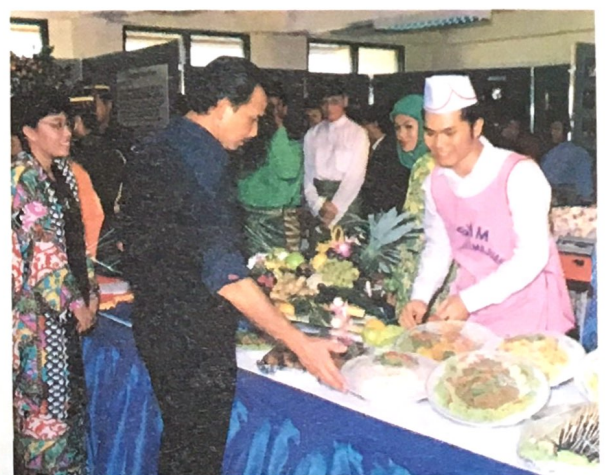
Crowds of loyal subjects reach out eagerly to shake His Majesty's hands during a gathering in the Brunei Muara district to enable residents convey their greetings in conjunction with the monarch's birthday. Various programmes were organised at the gathering, including cookery exhibition.