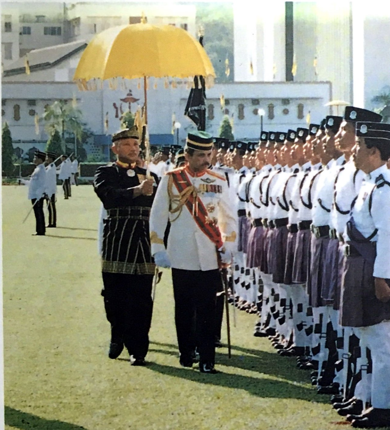
His Majesty Paduka Seri Baginda Sultan Haji Hassanal Bolkiah Mu'izzaddin Waddaulah, Sultan and Yang Di-Pertuan of Brunei Darussalam inspecting contingents taking part in the traditional parade at the Taman Haji Sri Muda Omar Ali Saifuddien in the Brunei capital at the start of celebrations of his forty-eighth birthday anniversary on 15 July.