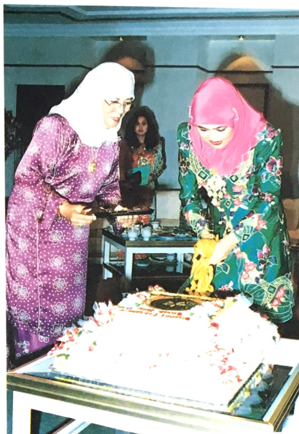
Above right: Her Majesty Paduka Seri Baginda Raja Isteri Pengiran Anak Hajjah Saleha cuts the anniversary cake during celebration marking the Silver Jubilee of the Brunei Darussalam Women's Association, PERTIWI.