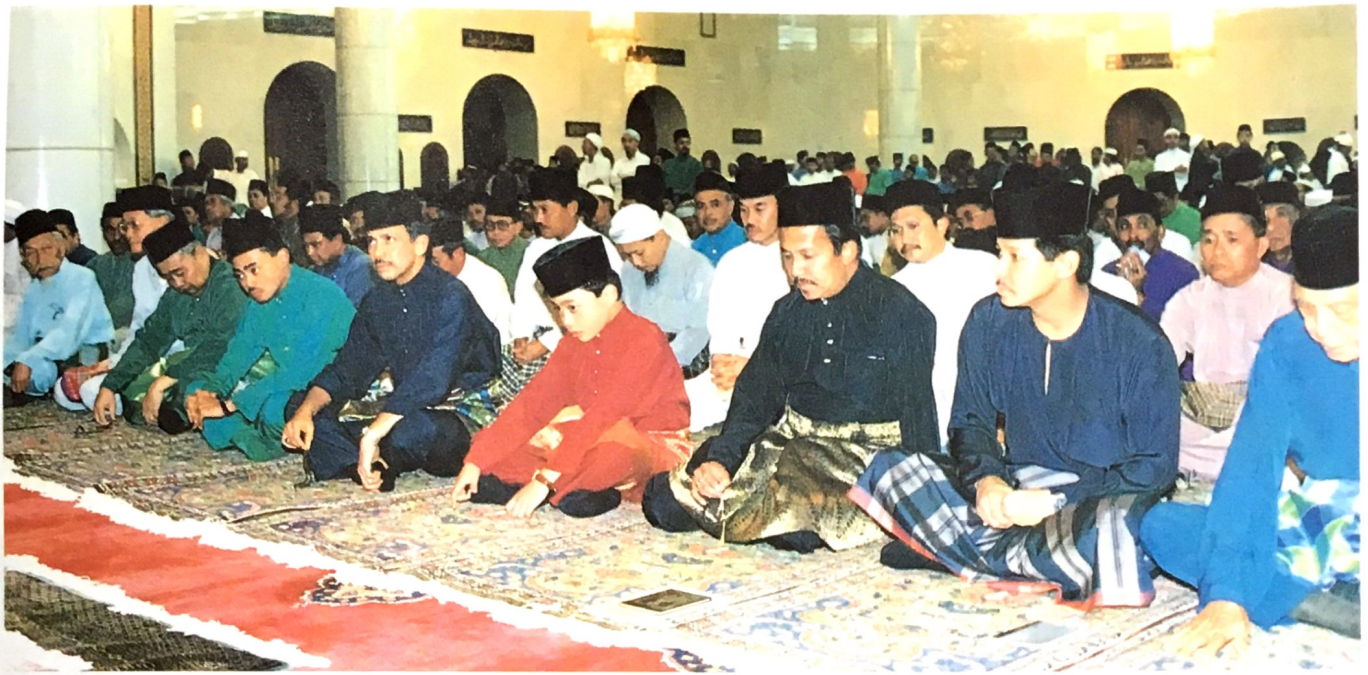
His Majesty The Sultan and Yang Di-Pertuan of Brunei Darussalam joined his Muslim subjects in thanksgiving prayers at the Jame' 'Asri Hassanil Bolkiah mosque in the evening of 14 July, the eve of his 48th birthday anniversary. With His Majesty were His Royal Highness Paduka Seri Duli Pengiran Muda Haji Al-Muhtadee Billah, His Royal Highness Paduka Seri Pengiran Bendahara Seri Maharaja Permaisura Pengiran Muda Haji Sufri Bolkiah, His Royal Highness Paduka Seri Pengiran Digadong Sahibul Mal Pengiran Muda Haji Jefri Bolkiah and His Royal Highness Paduka Seri Duli Pengiran Muda 'Abdul Malik as well as other male members of the royal family.

Delivering the titah from the balai singgahsana (throne room) of Istana Nurul Iman during the traditional audience and investiture ceremony to a large audience in the palace as well as to home viewers and listeners via television and radio nationwide, His Majesty Paduka Seri Baginda Sultan Haji Hassanal Bolkiah Mu'izzaddin Waddaulah, Sultan and Yang Di-Pertuan of Brunei