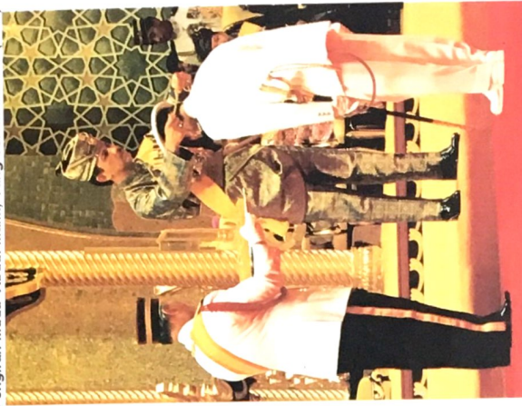
The ruler bestows birthday honours on one of this year's recipients for meritorious service and deeds to the country, above. Far left: Watching the parade from the grandstands of the Taman Haji Sir Muda Omar Ali Saifuddin in the Brunei capital were thousands of guests including foreign VIPs. Seen in the front row of the picture are some of the foreign guests including Malaysian Deputy Prime Minister, Yang Amat Berhormat Dato' Seri Anwar Ibrahim, extreme left, his wife to his left, Indonesian Defence Minister, General Edi Sudradjat (5th from left) and his wife and Malaysian Foreign Affairs Minister, Yang Berhormat Dato Abdullah Ahmad Badawi (2nd from right) and his wife, extreme right. As with the other foreign guests, the Malaysian ministers and their wives were granted audiences by His Majesty, Her Majesty the Raja Isteri and Her Royal Highness the Pengiran Isteri.

We are resolved to providing such amenities as housing, hence,