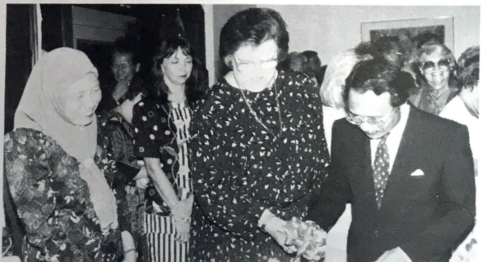
The Communication Minister, Yang Berhormat Dato Seri Laila Jasa Awang Haji Zakaria cuts the cake at US Independence Day celebration hosted by the US ambassador to Brunei Darussalam, to the minister's right.

The function was attended by diplomats, senior government officials and leading members of the business community.