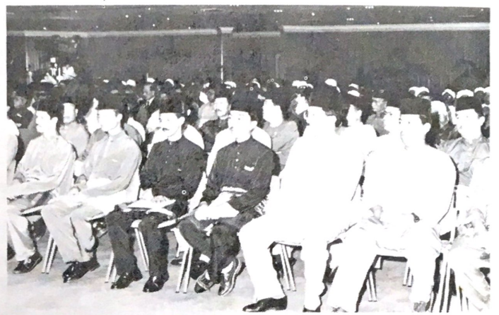
Permanent Secretaries, foreign diplomats, senior Government officials and members of the public, above left and above right, were also present at the celebration which commemorates Prophet Muhammad's (peace be upon him) ascension to heaven.