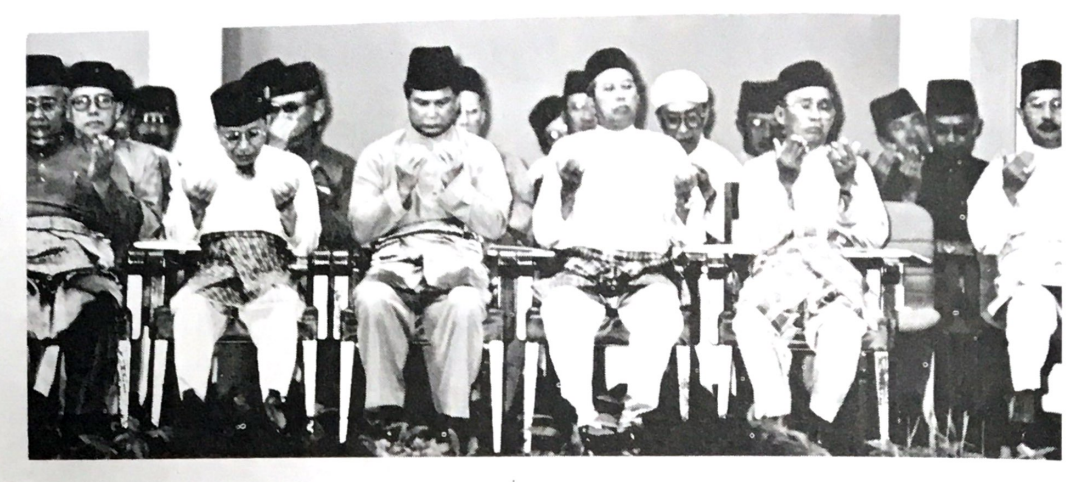
Right: Cabinet ministers and their deputies, members of councils also attended the Isra' Me'raj celebration.