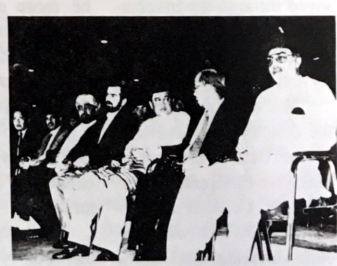
Above left and above right: Some of the foreign diplomats and permanent secretaries who were among thousands watching the competition.