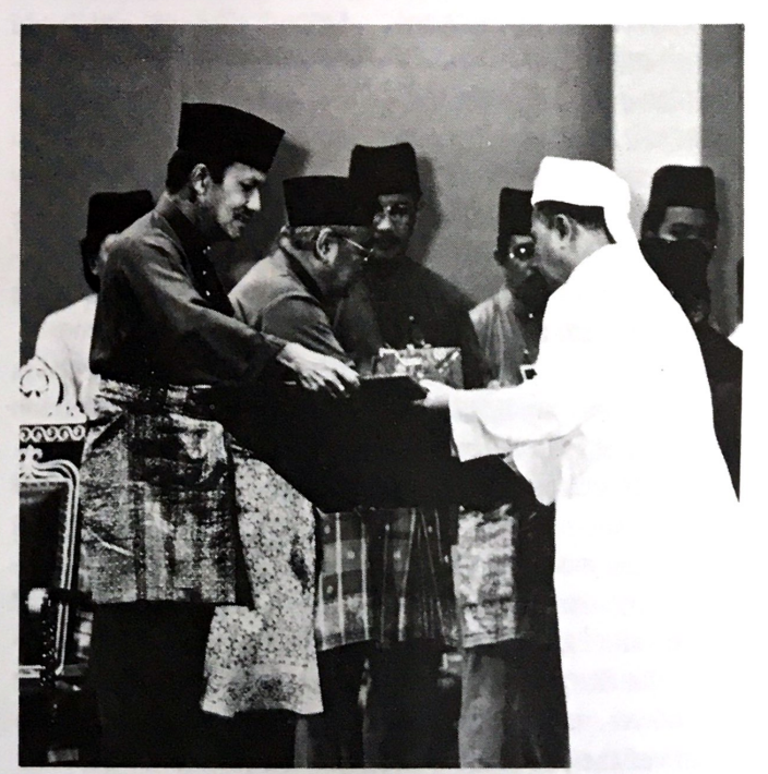
The imam (senior mosque official) of one of the winning mosques receiving the award from His Royal Highness which was the highlight of the celebration, attended by dignitaries including pengiran-pengiran cheteria, above right.