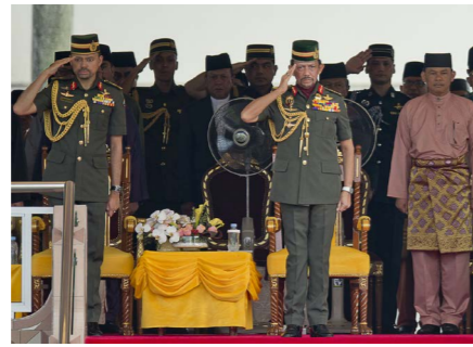
8. 34 th National Day Celebration Grand Assembly