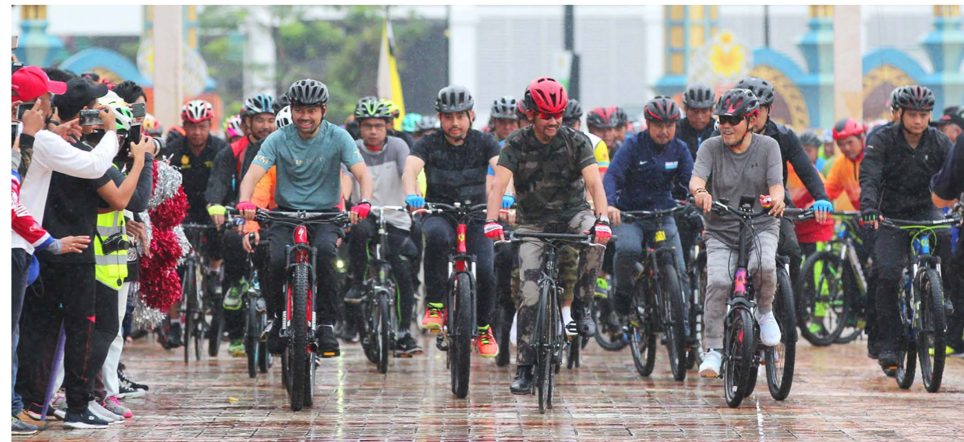
His Majesty the Sultan and Yang Di-Pertuan of Brunei Darussalam joining the Semangat Kebangsaan Cycling Recreation. Also present were the sons and the brother of His Majesty; His Royal Highness Prince Haji Al-Muhtadee Billah, the Crown Prince and Senior Minister at the Prime Minister's Office; His Royal Highness Prince 'Abdul Malik and His Royal Highness Prince Mohamed Bolkiah.

BANDAR SERI BEGAWAN, February 25 - His Majesty Sultan Haji Hassanal Bolkiah Mu'izzaddin Waddaulah ibni Al-Marhum Sultan Haji Omar 'Ali Saifuddien Sa'adul Khairi Waddien, Sultan and Yang Di-Pertuan of Brunei Darussalam consented to join the Semangat Kebangsaan (National Spirit) Cycling Recreation, reflecting that there are no barriers in the relationship between the sovereign and the people.