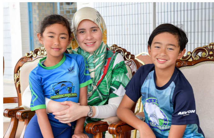
Her Royal Highness Paduka Seri Pengiran Anak Isteri Pengiran Anak Sarah binti Pengiran Haji Salleh Ab Rahaman with Yang Teramat Mulia Pengiran Muda 'Abdul Muntaqim and Yang Teramat Mulia Pengiran Anak Muneerah Madhul Bolkiah at the 5 th Brunei 100m Sprint Championship.

The championship was participated by over 338 swimmers