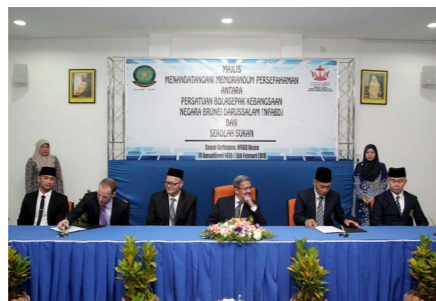
19. MoU seal towards the development of national football