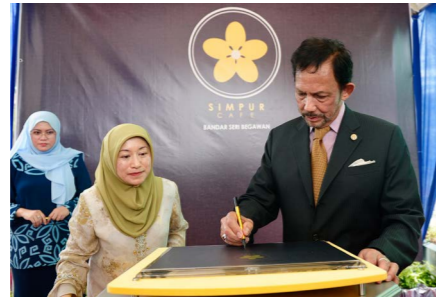
12. His Majesty officiates the First International Symposium on Ethnobotany and launches UBD Botanical Research Centre