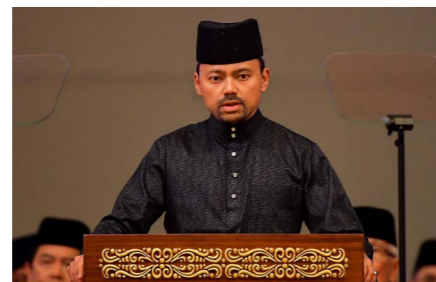
16. Opening of the Final of the National Musabaqah Al-Quran for Adults 1439 Hijrah / 2018 Masihi