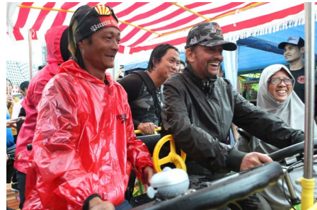
11. His Majesty joins Semangat Kebangsaan (National Spirit) Cycling Recreation