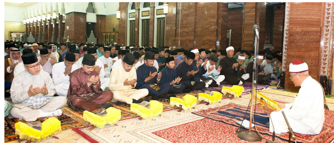
His Majesty Sultan Haji Hassanal Bolkiah Mu'izzaddin Waddaulah ibni Al-Marhum Sultan Haji Omar 'Ali Saifuddien Sa'adul Khairi Waddien, Sultan and Yang Di-Pertuan of Brunei Darussalam and members of the Royal Family during the Kesyukuran Ceremony.

BANDAR SERI BEGAWAN, February 22 - Citizens and residents of this beloved country, are definitely grateful for the security and peace achieved under the leadership of His Majesty Sultan Haji Hassanal Bolkiah Mu'izzaddin Waddaulah ibni Al-Marhum Sultan Haji Omar 'Ali Saifuddien Sa'adul Khairi Waddien, Sultan and Yang Di-Pertuan of Brunei Darussalam and thus are able to celebrate the 34 th National Day of Brunei Darussalam.