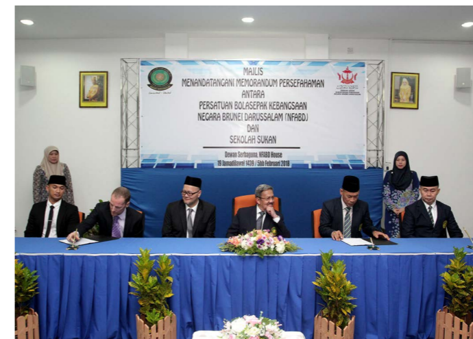
His Royal Highness Prince Haji Sufri Bolkiah, President of the National Football Association of Brunei Darussalam (NFABD) witnessing the signing of Memorandum of Understanding between NFABD and the Sports School, Ministry of Education.

BERAKAS, February 5 - His Royal Highness Prince Haji Sufri Bolkiah, President of the National Football Association of Brunei Darussalam (NFABD) graced a Memorandum of Understanding signing ceremony between NFABD and the Sports School, Ministry of Education.