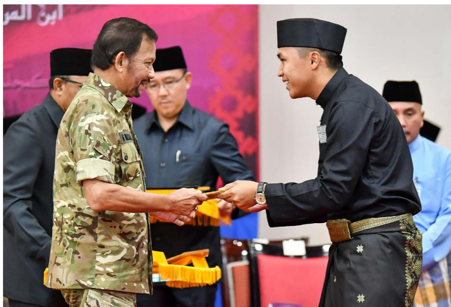
His Majesty Sultan Haji Hassanal Bolkiah Mu'izzaddin Waddaulah ibni Al-Marhum Sultan Haji Omar 'Ali Saifuddien Sa'adul Khairi Waddien, Sultan and Yang Di-Pertuan of Brunei Darussalam presenting a house key to a recipient under the National Housing Programme for Tutong and Belait District.

His Majesty then visited the Tumpuan Telisai Primary School, Tutong, Cluster 5, which is an educational institution in the mukim (sub-district).