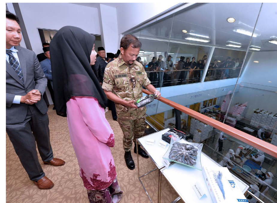
His Majesty reviewing products manufactured by Golden Corporation Sdn. Bhd. (in collaboration with Semaun Marine Resources Sdn. Bhd) at Kampung Serambangun Industrial Site.

The company is continually growing and penetrating local and overseas markets, while promoting the country's name by exporting products abroad and ensuring adequate result and food security in the country.