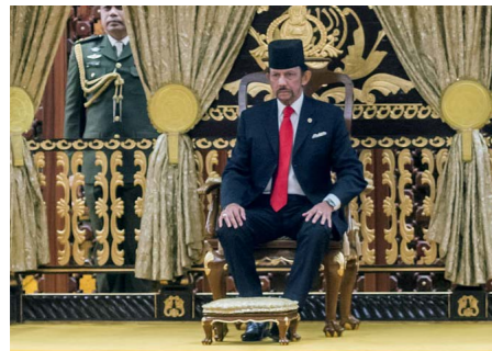
1. Swearing-In Ceremony for New Cabinet Ministers and Deputy Ministers