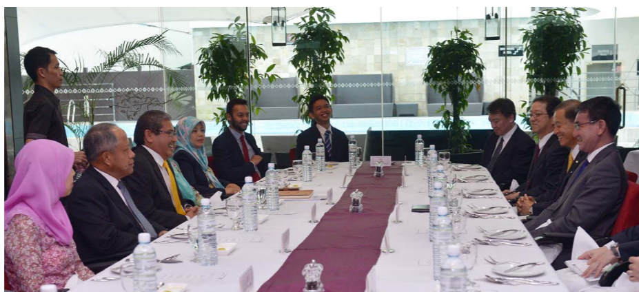
The Minister for Foreign Affairs of Japan, His Excellency Taro Kono during a meeting with Second Minister of Foreign Affairs and Trade, Yang Berhormat Dato Seri Paduka Awang Haji Erywan bin Pehin Datu Pekerma Jaya Haji Mohd. Yusof. Also present at the meeting was the Second Minister of Defence, Yang Berhormat Pehin Datu Lailaraja Retired Major General Dato Paduka Seri Haji Awang Halbi bin Haji Mohd Yussof.