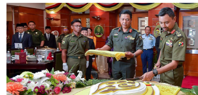
His Royal Highness Prince General Haji Al-Muhtadee Billah ibni His Majesty Sultan Haji Hassanal Bolkiah Mu'izzaddin Waddaulah, the Crown Prince and Senior Minister at the Prime Minister's Office; and General of Royal Brunei Armed Forces (RBAF) during the cake cutting ceremony presented by the RBAF officers.

Also in attendance was His Royal Highness Prince 'Abdul Malik.