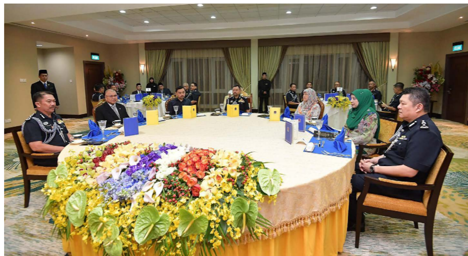
His Royal Highness and the royal family consented to proceed to the Banquet Hall for the Afternoon Tea Reception.

At the event, His Royal Highness signed the Lembaran Kenangan Keberangkatan and consented to join a group photo session.