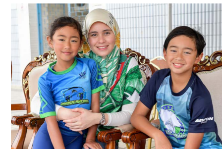
18. Her Royal Highness attends Swimming Championship