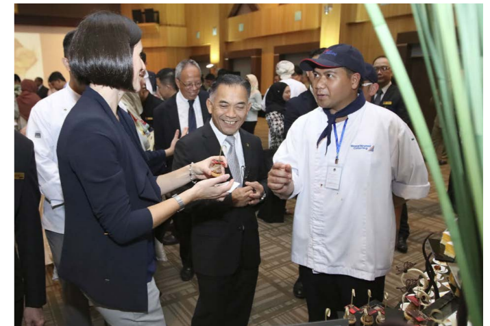
The Minister of Primary Resources and Tourism, Yang Berhormat Dato Seri Setia Awang Haji Ali bin Haji Apong visiting the booths at the Brunei Gastronomy Week 2018.

He added that this boosts the aroma and the flavours of the food. Certain Bruneian dishes which are usually wrapped in banana leaves are pais daging , pais udang , pais ikan and others.