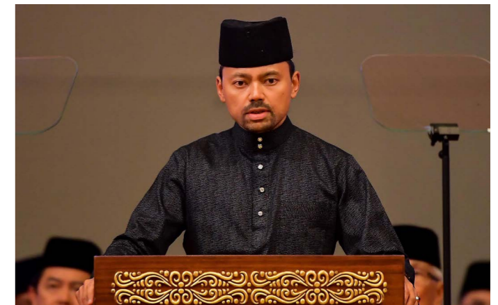
His Royal Highness Prince Haji Al-Muhtadee Billah ibni His Majesty Sultan Haji Hassanal Bolkiah Mu'izzaddin Waddaulah, the Crown Prince and Senior Minister at the Prime Minister's Office delivering a sabda (royal speech) at the National Musabaqah Al-Quran for Adults 1439 Hijrah/2018 Masihi.

not younger than 18 years old and not older than 40 years old, have successfully featured young and talented participants. "With today's technological facilities, assisted by Al-Quran programmes on social media, the efforts of His Majesty's government has boosted interest among teens to be involved in the field Al-Quran tarannum. Indeed, these factors are also among those that expedites the enhancement of the youth's skills who are interested and dedicated in honing their talents", Yang Berhormat added.