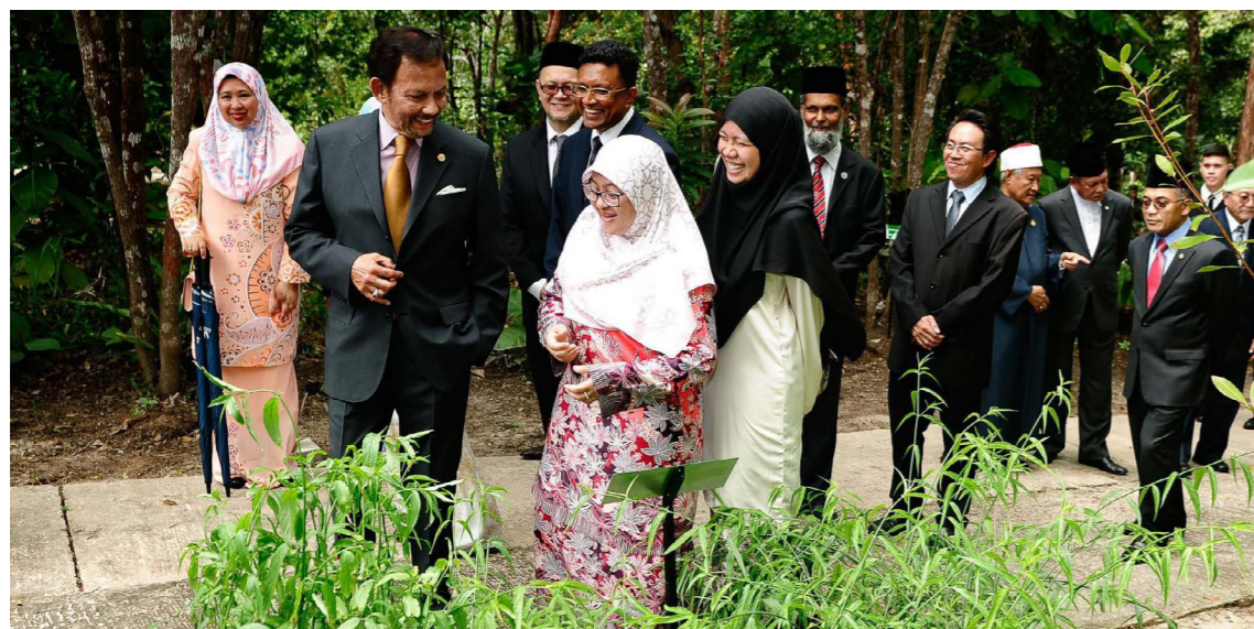
His Majesty during the visit to the UBD Botanical Research Centre.