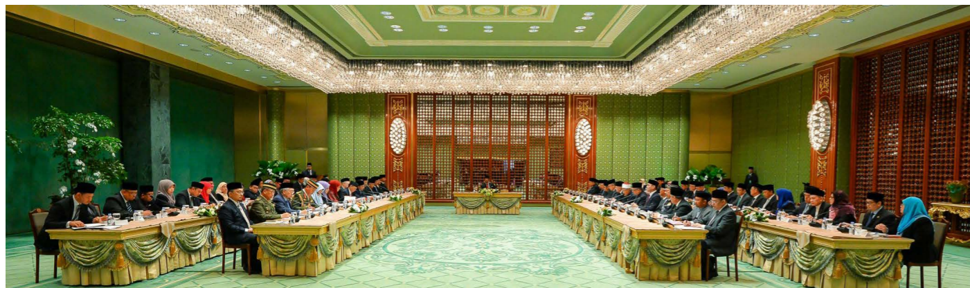
His Majesty the Sultan and Yang Di-Pertuan of Brunei Darussalam and Cabinet Ministers and Deputy Ministers at the Cabinet Ministers Special Meeting.

In the meantime, His Majesty the Sultan and Yang Di-Pertuan of Brunei Darussalam also congratulated those who still hold their post and the newly appointed. Hopefully with each appointment they will be able to bring bigger and positive changes in the government.