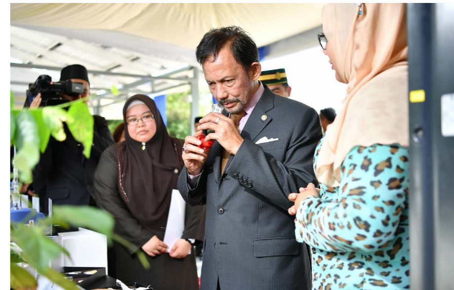
His Majesty taking a closer look at one of the plants at the research centre.