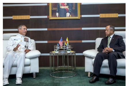
22. Commander of the United States Pacific Command pays courtesy calls