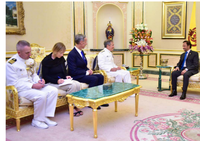
His Excellency Admiral Harry Binkley Harris Junior, Commander of the United States Pacific Command (USPACOM) on February 21.

His Majesty Sultan Haji Hassanal Bolkiah Mu'izzaddin Waddaulah ibni Al-Marhum Sultan Haji Omar 'Ali Saifuddien Sa'adul Khairi Waddien, Sultan and Yang Di-Pertuan of Brunei Darussalam, Minister of Defence, and the Supreme Commander of Royal Brunei Armed Forces (RBAF), consented to receive in audience at Istana Nurul Iman: