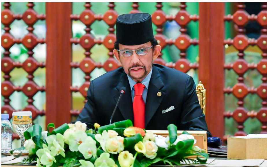
His Majesty Sultan Haji Hassanal Bolkiah Mu'izzaddin Waddaulah ibni Al-Marhum Sultan Haji Omar Ali Ali Saifuddien Sa'adul Khairi Waddien, Sultan and Yang Di-Pertuan of Brunei Darussalam delivering a titah (royal speech) at the Cabinet Ministers Special Meeting held at Istana Nurul Iman.

"I know many issues that have emerged, which are meant to attract attention or for publicity with the intention