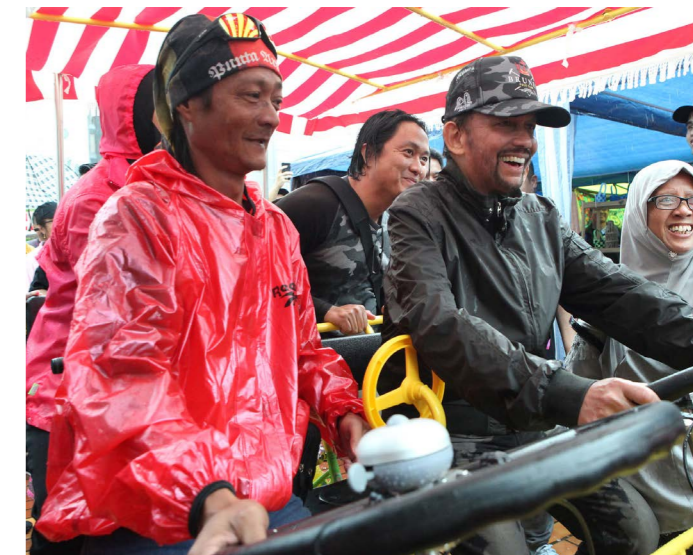
His Majesty riding a four-wheel bicycle at the Bandarku Ceria programme.

After the Cycling Recreation event, His Majesty then witnessed a parade of 34 cyclists from all districts who participated in the 34km event, departing from 6.45am followed by 34 child cyclists as well as a performance by 374 trainees of the National Service Programme (PKBN).