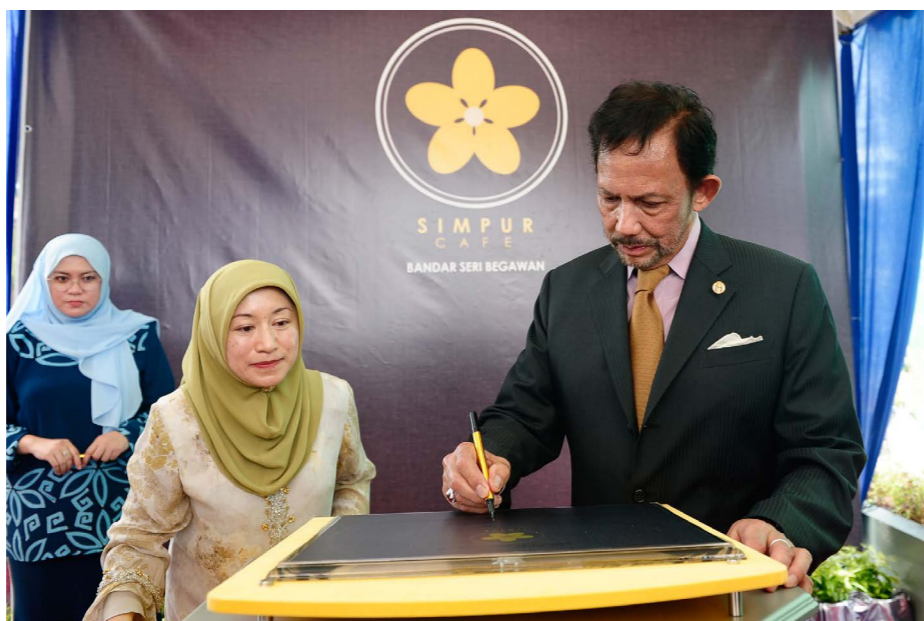
His Majesty the Sultan of Brunei Darussalam signing a plaque at UBD Simpuri Café BSB, a UBD-owned cafe that operates in the campus premises.

Upon arrival, His Majesty who is also the Chancellor of UBD was greeted by the Minister of Education, Yang Berhormat Dato Paduka Awang Haji Hamzah bin Sulaiman, the Minister of Education, as