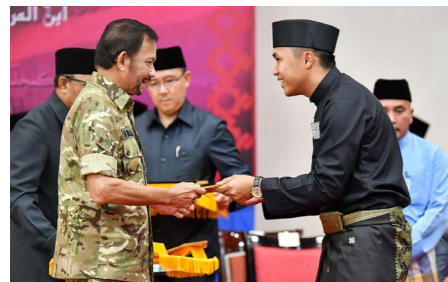
14. House Key Presentation Ceremony to 601 recipients