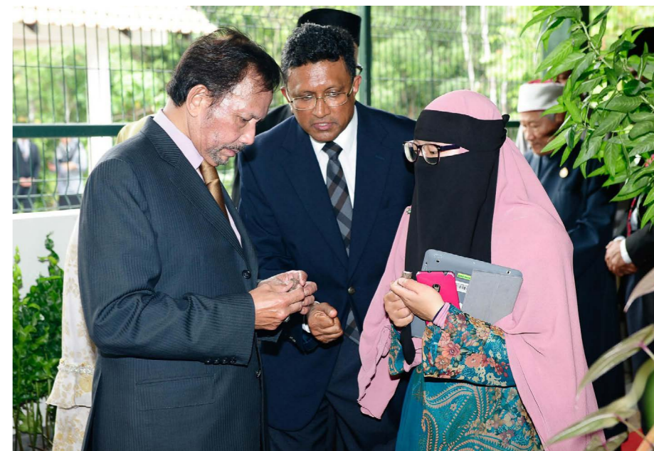
His Majesty being briefed on the plants and trees that grows in an estimated area of five acres of tropical heath forest known kerangas .

university's female hostel and has identified about 200 herbal plants and 100 tree species growing in the estimated five acres of tropical heath forest known kerangas .