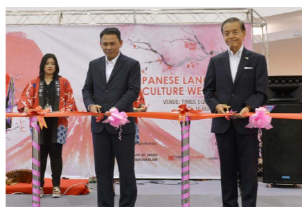
24. Japanese Language and Cultural Week promotes learning opportunities