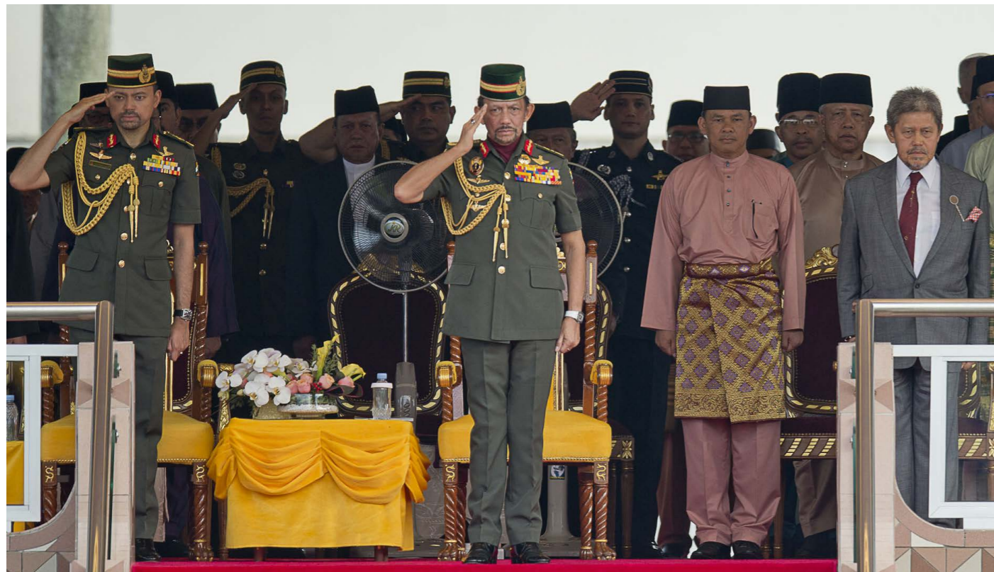
His Majesty Sultan Haji Hassanal Bolkiah Mu’izzaddin Waddaulah ibni Al-Marhum Sultan Haji Omar ‘Ali Saifuddin Sa’adul Khairi Waddien, Sultan and Yang Di-Pertuan of Brunei Darussalam during the 34 th National Day of Brunei Darussalam Anniversary Celebration at Taman Haji Sir Muda Omar ‘Ali Saifuddin.

BANDAR SERI BEGAWAN, February 24 – Brunei Darussalam once again made history by celebrating its 34 th National Day, a blessing for all the people and the residents to feel the excitement and love towards the nation, the sovereign, the race and the religion based on the Islamic Malay Monarchy and as a Zikir nation.