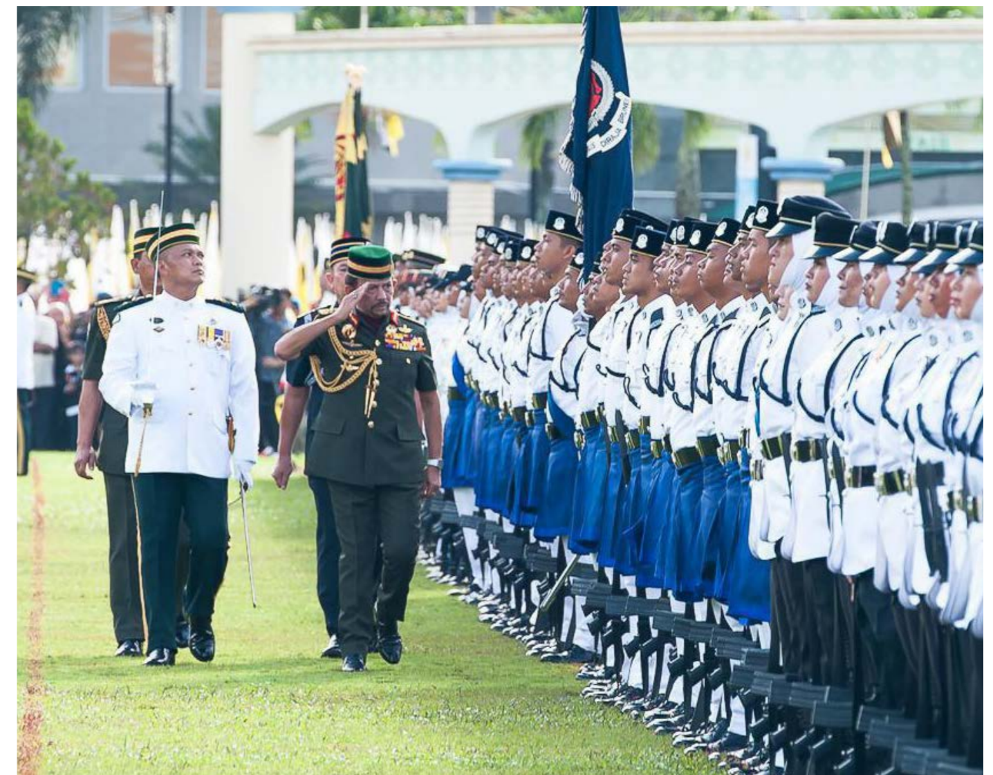
His Majesty inspecting the Guard of Honour mounted by personnel of the Royal Brunei Armed Forces and Royal Brunei Police Force.

In achieving National Vision, each national development agencies is responsible and accountable for ensuring that all activities are geared towards achieving the Brunei Vision 2035.