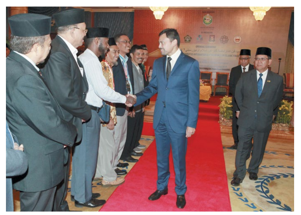
His Royal Highness meeting the presenters and delegates, both local and international.