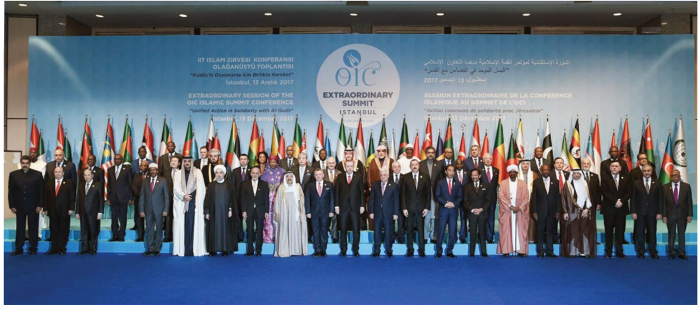
His Majesty the Sultan and Yang Di-Pertuan of Brunei Darussalam and other OIC leaders in a group photo session, before proceeding to the Conference Hall.

At the end of the OIC Extraordinary Summit, a Communique on the 'US Administration's recognition of the occupied City of Al-Quds Ash-Sharif as so-called capital of Israel, the occupying power, and decision to transfer the US Embassy to Al-Quds' and the Istanbul Declaration were adopted.