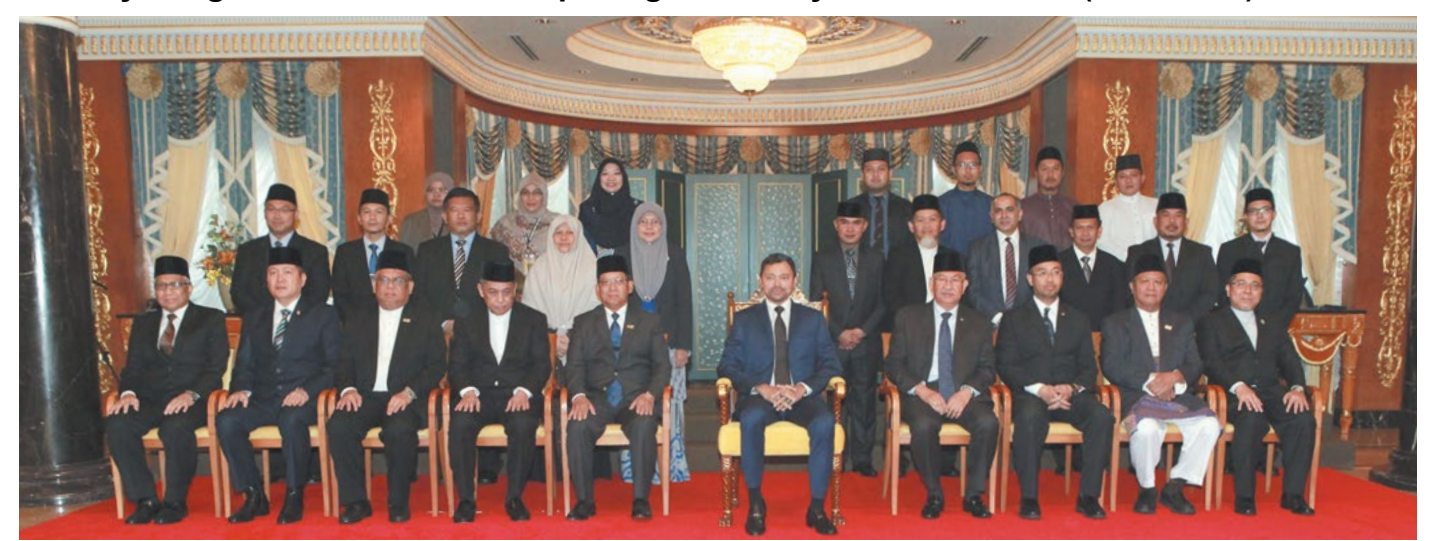
His Royal Highness in a group photo with invited speakers and the Steering Committee during the opening ceremony of the 5th AICIF.