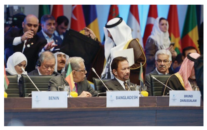
His Majesty the Sultan and Yang Di-Pertuan of Brunei Darussalam during the Organisation of Islamic Cooperation (OIC) Extraordinary Summit.

In concluding the titah , the Monarch expressed Brunei Darussalam's support for the Communique and the Istanbul Declaration.