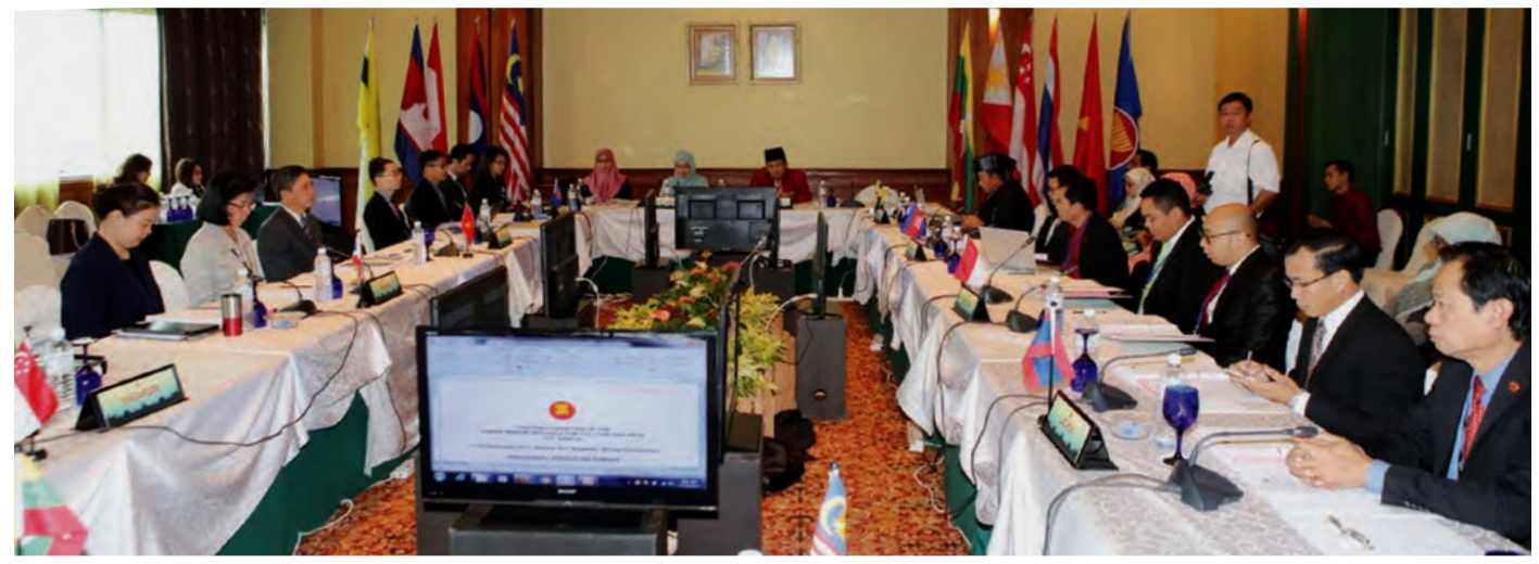
The 13th Meeting of ASEAN Senior officials Responsible for Culture and Arts SOMCA) and related meetings with Dialogue Partners held at The Centrepoint Hotel, Gadong.