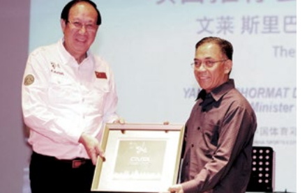
15. China – Asean Rally participants celebrated

14. Politeknik Brunei receives ISO 9001:2015 Award