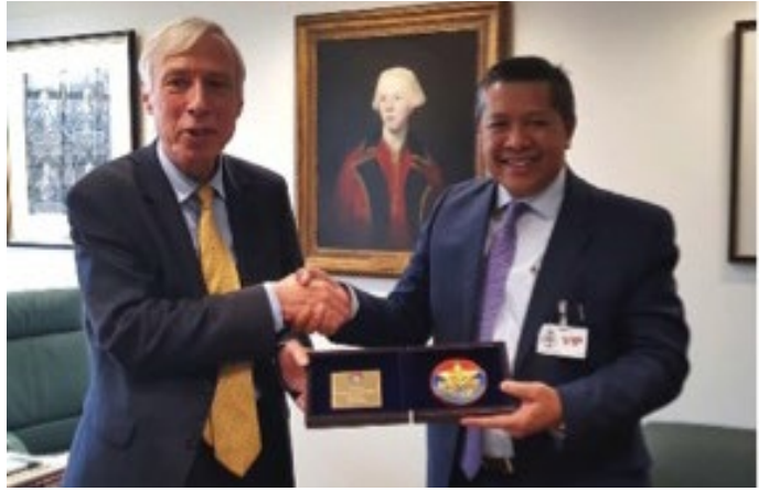
Retired First Admiral Dato Seri Pahlawan Haji Abdul Aziz the Deputy Minister of Defence with the Right Honourable Earl Howe, Deputy Leader of the House of Lords and Minister of State for Defence, United Kingdom.

As part of his programme, the Deputy Minister of Defence visited the Cabinet Office at Whitehall, London.