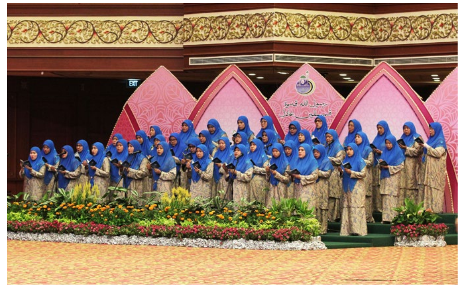
Dikir Marhaban by officers and staff from the Prime Minister's Office, Ministry of Religious Affairs and members of the Brunei Darussalam Women's Council.

The ceremony was also enlivened with a Dikir Marhaban by officers and staff from the Prime Minister's Office, Ministry of Religious Affairs and members of the Brunei Darussalam Women's Council.