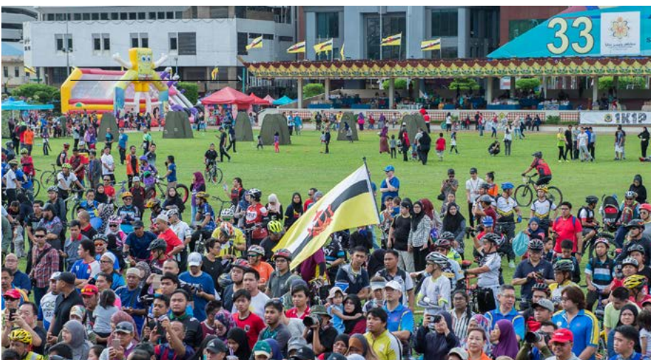
Members of the public from all walks of life gathering at Taman Haji Sir Muda Omar 'Ali Saifuddien eager to join the cycling recreation (right).