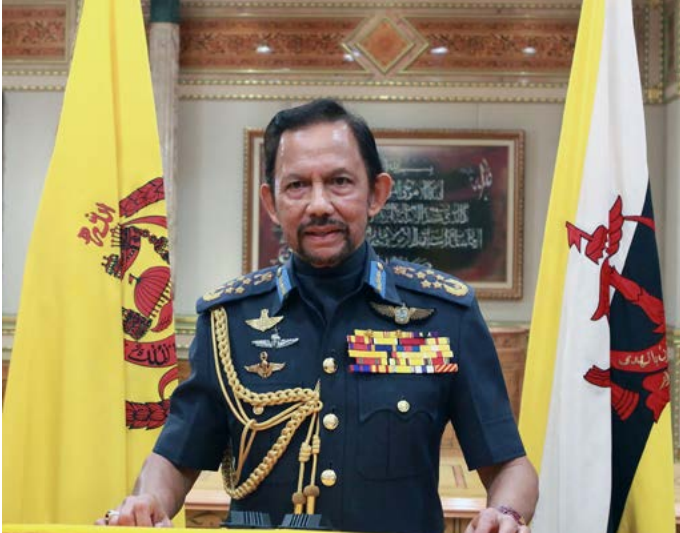
His Majesty Sultan Haji Hassanal Bolkiah Mu'izzaddin Waddaulah ibni Al-Marhum Sultan Haji Omar 'Ali Saifuddien Sa'adul Khairi Waddien, Sultan and Yang Di-Pertuan of Brunei Darussalam delivering a titah (royal speech) on the eve of the 33 rd National Day Celebration at Istana Nurul Iman.

BANDAR SERI BEGAWAN, February 22 - His Majesty Sultan Haji Hassanal Bolkiah Mu'izzaddin Waddaulah ibni Al-Marhum Sultan Haji Omar 'Ali Saifuddien Sa'adul Khairi Waddien, Sultan and Yang Di-Pertuan of Brunei Darussalam in his titah (royal speech) on the eve of the 33 rd National Day Celebration 2017 at Istana Nurul Iman said that the country should be more agile to produce high results that can contribute to progress and help the nation realise the Brunei Vision 2035 vision, which should not only sound beautiful when conveyed in words as it is intellectually rhetoric, but it should also be implemented with full commitment and determination.