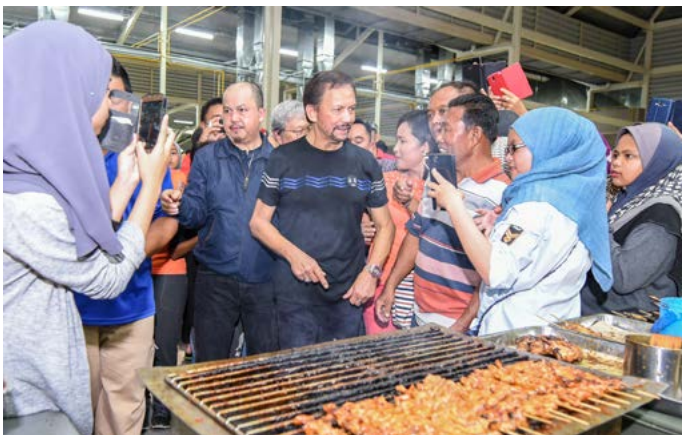
His Majesty the Sultan and Yang Di-Pertuan of Brunei Darussalam interacting with vendors (above and below).