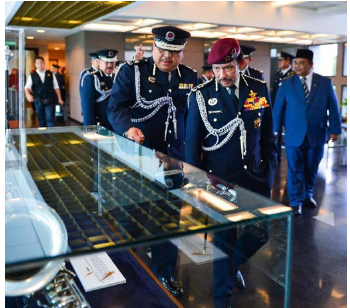
His Majesty Sultan Haji Hassanal Bolkiah Mu'izzaddin Waddaulah ibni Al-Marhum Sultan Haji Omar 'Ali Saifuddien Sa'adul Khairi Waddien, Sultan and Yang Di-Pertuan of Brunei Darussalam listening to an explanation at one of the departments at the new Police Headquarters.