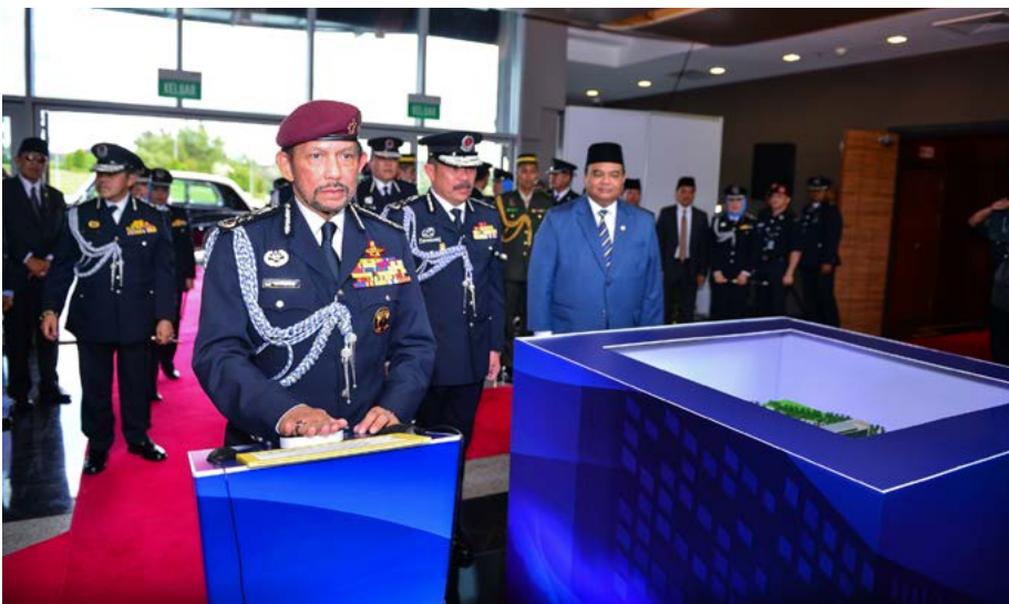
His Majesty the Sultan and Yang Di-Pertuan of Brunei Darussalam inaugurating the new building of the Police Headquarters.

Among the senior police officers attending the 96 th Police Day Parade.