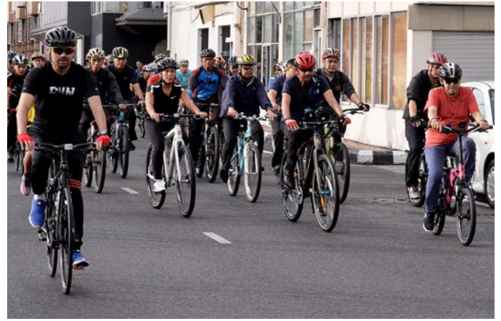
His Majesty the Sultan and Yang Di-Pertuan of Brunei Darussalam and members of the royal family during the cycling event.