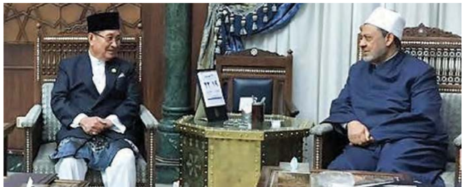
Yang Berhormat Minister of Religious Affairs during a courtesy visit discuss bilateral cooperation with the Honorable Fadhilatus Sheikh Al-Imam Al-Akbar Ustaz Dr. Ahmad At-Tayyib, Sheikh Al-Azhar, the Arab Republic of Egypt.

The discussions also focused on efforts to engage University of Al-Azhar As-Sharif experts in the field of Tarannum in Al-Quran and Qiraat as lecturers at the Institut Tahfiz Al-Quran Sultan Haji Hassanal Bolkiaah. At the same time,