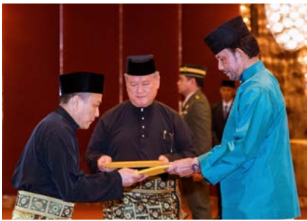
5. His Majesty presents and receives Letters of Credence