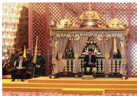
22. 382 recipients receive State Honorary Medals