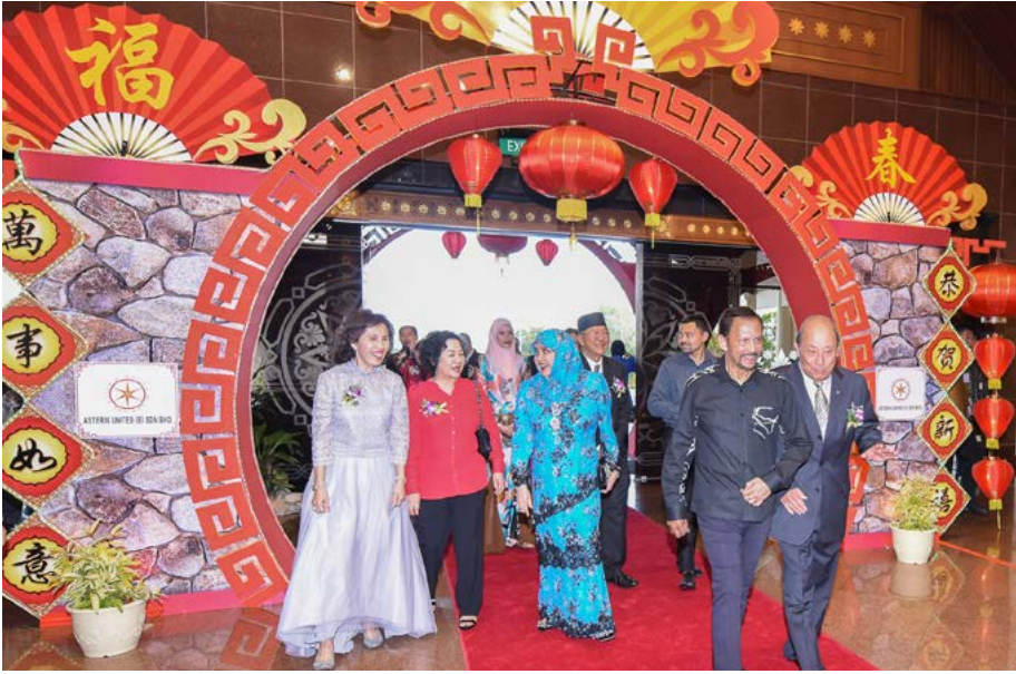
His Majesty Sultan Haji Hassanal Bolkiah Mu'izzaddin Waddaulah ibni Al-Marhum Sultan Haji Omar 'Ali Saifuddien Sa'adul Khairi Waddien, Sultan and Yang Di-Pertuan of Brunei Darussalam and Her Majesty Duli Raja Isteri Pengiran Anak Hajah Saleha binti Al-Marhum Pengiran Pemancha Pengiran Anak Haji Mohamed Alam upon arrival.