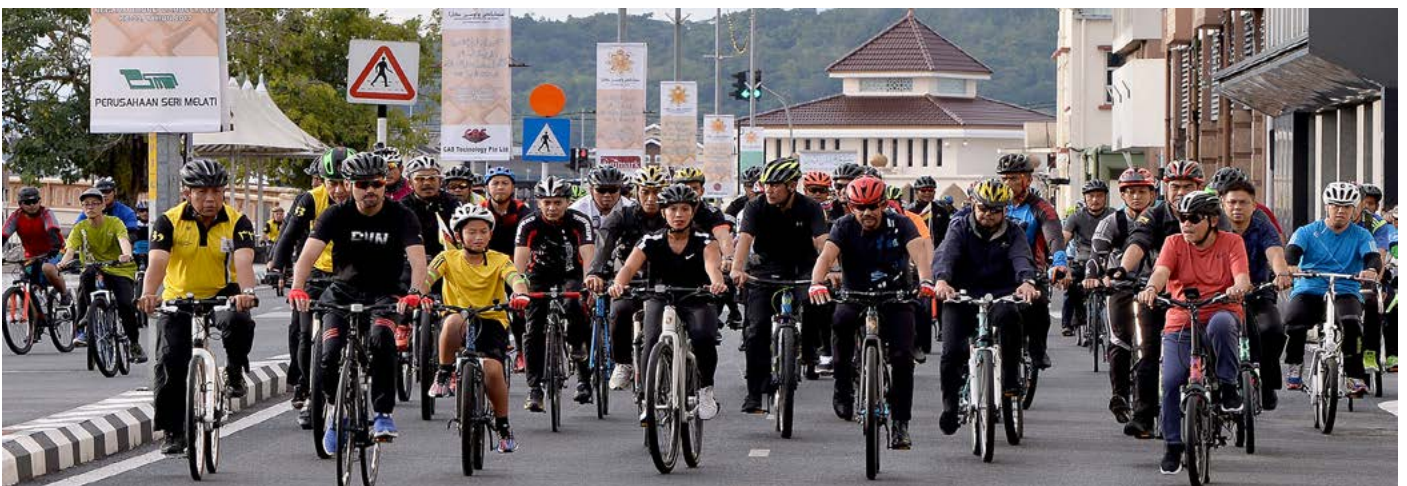
His Majesty the Sultan and Yang Di-Pertuan of Brunei Darussalam and members of the royal family during the cycling event.