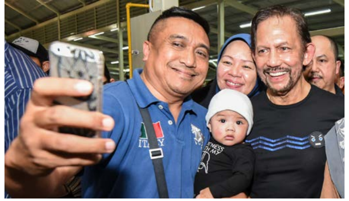
His Majesty mingling with visitors of the market (above and below).