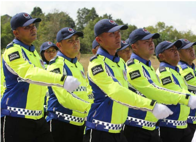
Among the Royal Brunei Police Force contingents' participating at the 96 th Police Day Parade (left and below).

Before leaving, His Majesty also visited to various departments at the second and fourth floors of the building and witnessed the exhibition on caps and swords before signing a commemorative parchment.