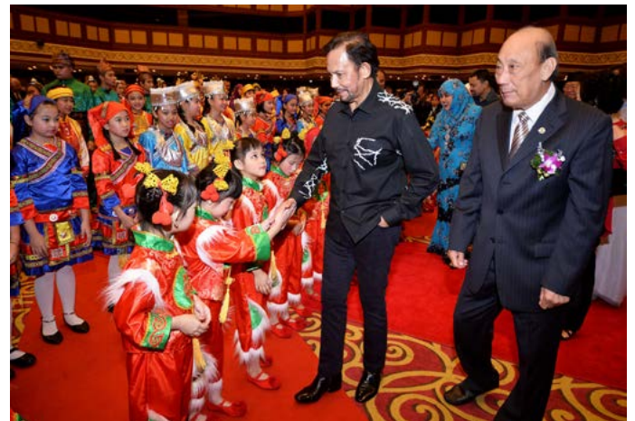
Their Majesties and members of the royal family mingling with performers from Chung Hwa Middle School, Bandar Seri Begawan (above).

Also present at the ceremony were His Royal Highness Prince Haji Al-Muhtadee Billah, the Crown Prince and Senior Minister at the Prime Minister's Office and Her Royal Highness Paduka Seri Pengiran Anak Isteri Pengiran Anak Sarah binti Pengiran Haji Salleh Ab. Rahaman (left).