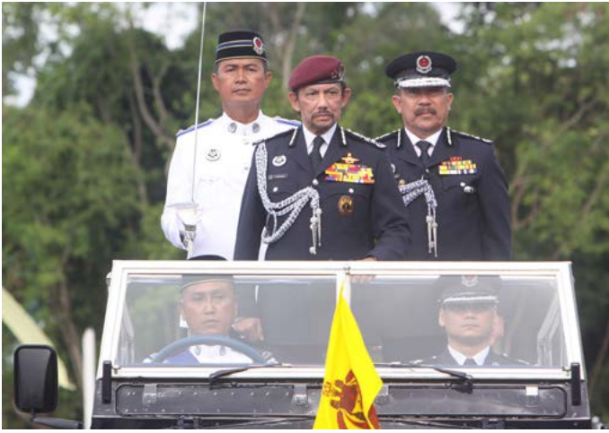
His Majesty inspecting the Guard of Honour mounted by the Royal Brunei Police Force (RBPF) at the parade (left and below).