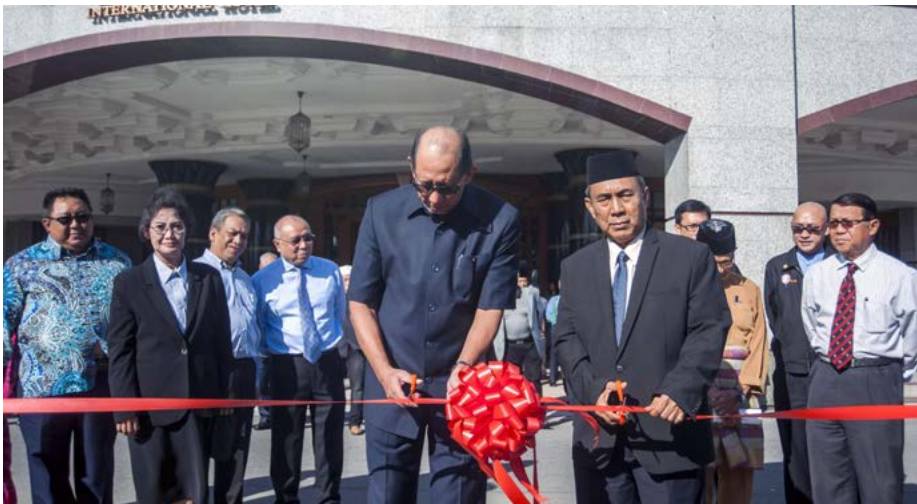
Yang Berhormat the Minister of Communications and the Managing Director of ADBS Sendirian Berhad, cutting the ribbon marking the launching of the Brunei - Sarawak - Pontianak Cross-Border Express Bus.

BANDAR SERI BEGAWAN, February 9 – The Government of His Majesty the Sultan and Yang Di-Pertuan of Brunei Darussalam is currently trying to further expand trade and job opportunities not only within the country but also hopes that entrepreneurs would venture into more overseas markets, especially in neighbouring countries.