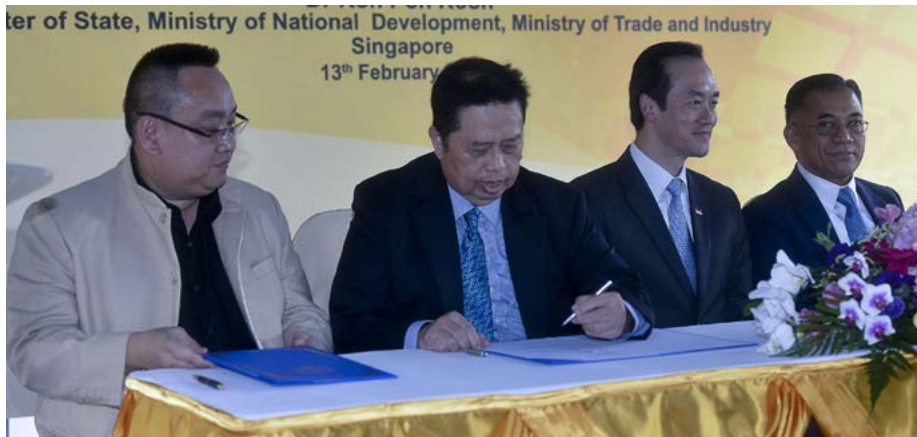
Contract Signing between KR Apollo Sendirian Berhad and the Fisheries Department.

"These requirements are aligned towards improving productivity and increasing competitiveness which will allow the country's products and services to penetrate the export market," the Minister added.