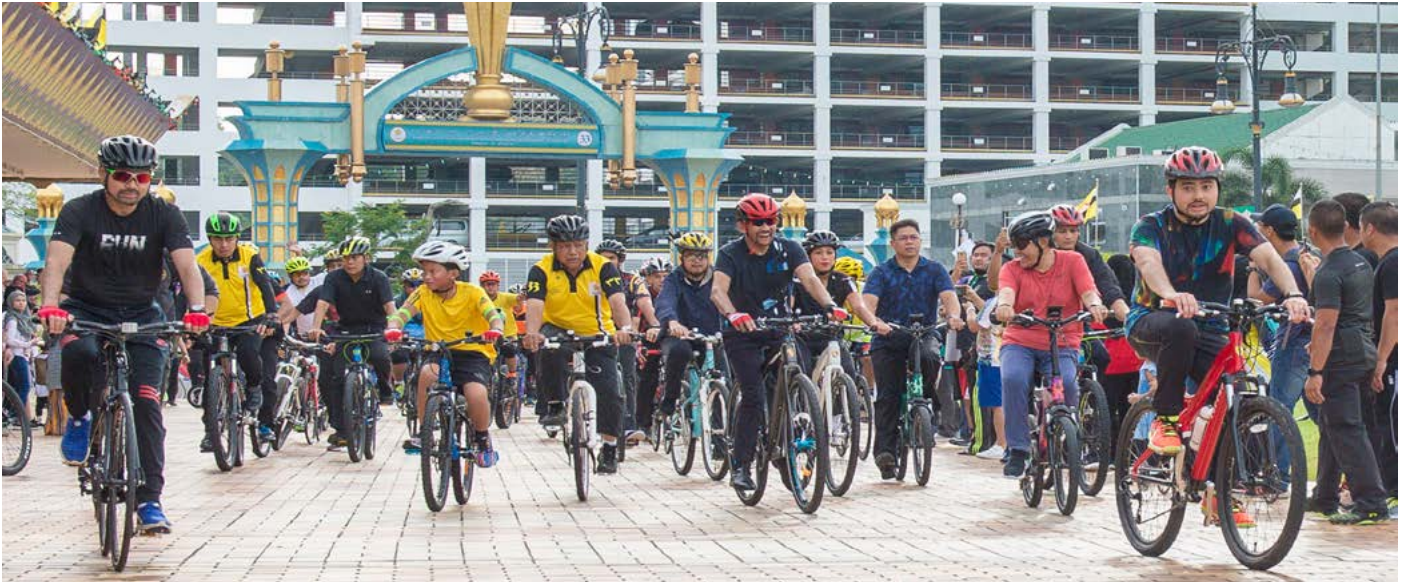
His Majesty Sultan Haji Hassanal Bolkiah Mu'izzaddin Waddaulah ibni Al-Marhum Sultan Haji Omar 'Ali Saifuddien Sa'adul Khairi Waddien, Sultan and Yang Di-Pertuan of Brunei Darussalam and members of the royal family participating in the 16-kilometre cycling event which began and ended at Taman Haji Sir Muda Omar 'Ali Saifuddien.

BANDAR SERI BEGAWAN, February 26 - The aspects of a healthy lifestyle and recreation to foster national unity through the appreciation of sports culture and community involvement as a whole lead to the creation of healthy citizens towards achieving the Brunei Vision 2035.