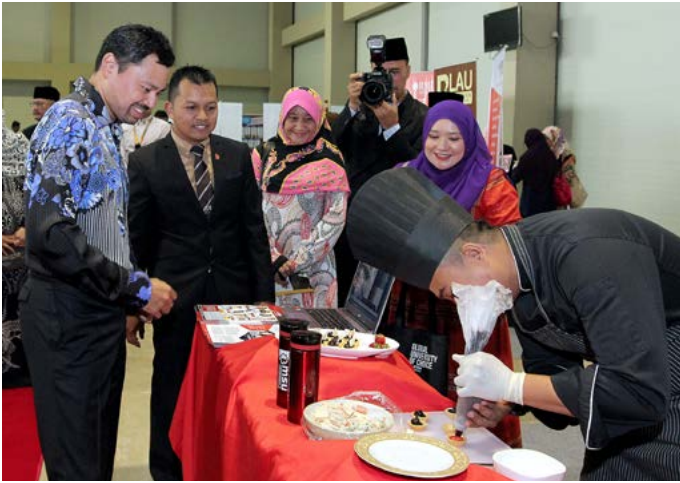
His Royal Highness taking a closer look at one of the activities at the expo.