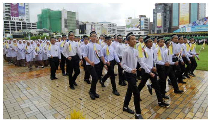
A march-past by uniformed personnel carrying national flags (above, left); and a march-past representing various organisations (above, right and below)