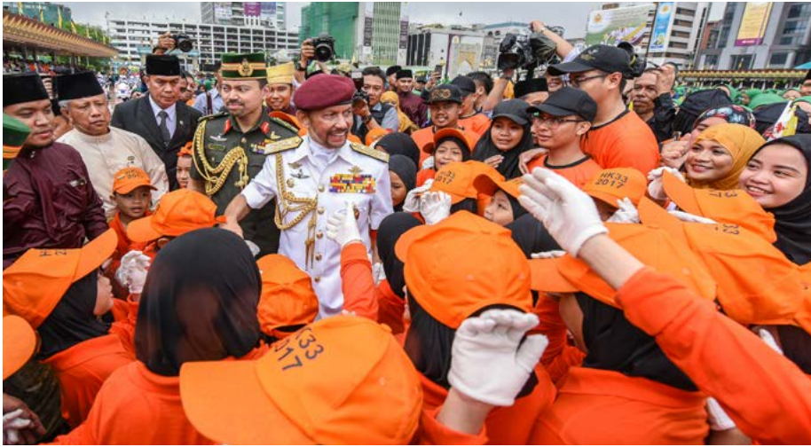
His Majesty during the get-together session with some of the participants at the event.