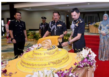
19. His Royal Highness graces separate high-tea receptions hosted by RBPF and RBAF