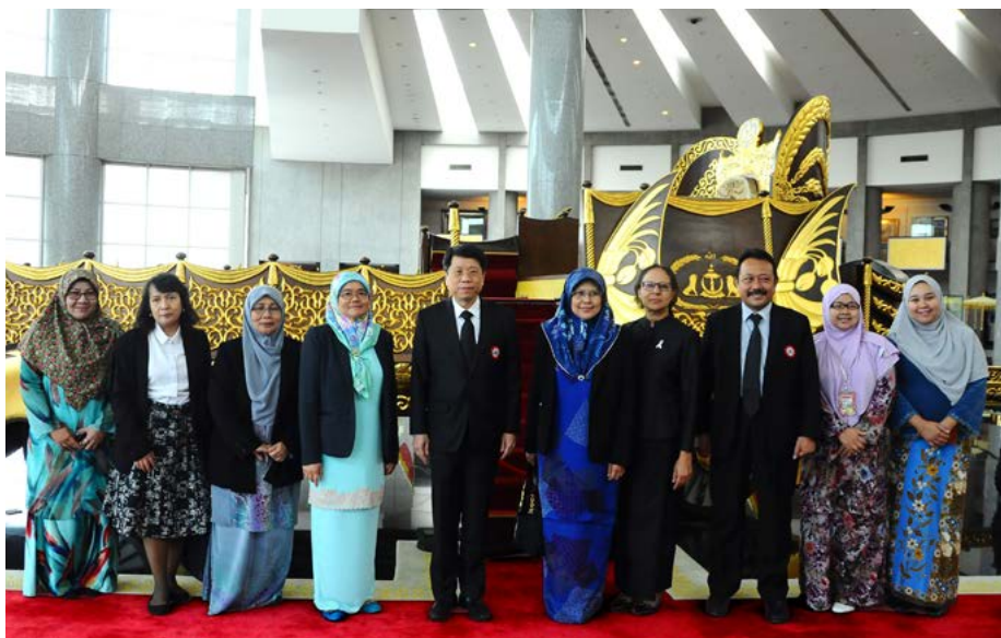
Thailand's Minister of Education, His Excellency Dr. Teerakiat Jareonsettasin as President of the South East Asian Ministers of Education Organization Council (SEAMEO Council) (fifth from left) and members of delegation in a group photo while visiting the Royal Regalia Building.

BANDAR SERI BEGAWAN, February 9 - His Excellency Dr. Teerakiat Jareonsettasin, Thailand's Minister of Education as President of the South East Asian Ministers of Education Organization