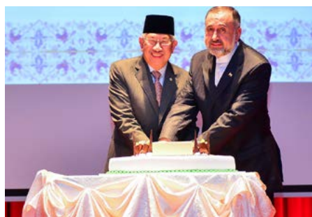
23. Iran Embassy celebrates 38 th anniversary of Iran Islamic Revolution