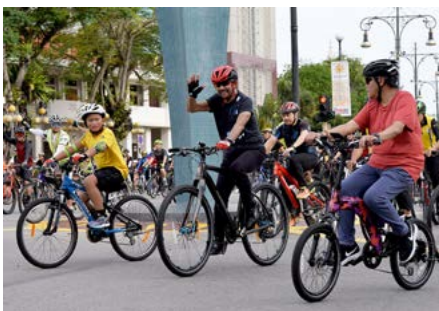
16. Healthy citizens towards achieving Brunei Vision 2035