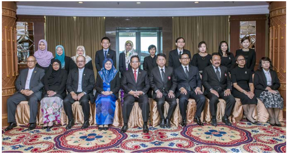
Yang Berhormat Minister of Education in a group photo with His Excellency Dr. Teerakiat Jareonsettasin, the Thailand's Education Minister after having a discussion at The Rizqun International Hotel.

His Excellency is on a two-day visit to this country as part of his series of visits to SEAMEO member countries after Malaysia, the Republic of Singapore, the