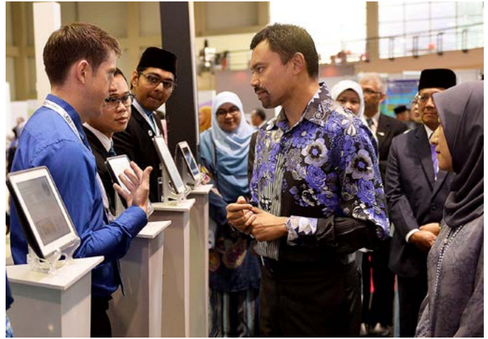
His Royal Highness at the Higher Education Expo 2017.