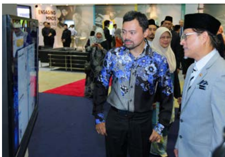
18. Higher Education Expo 2017 offers various programmes