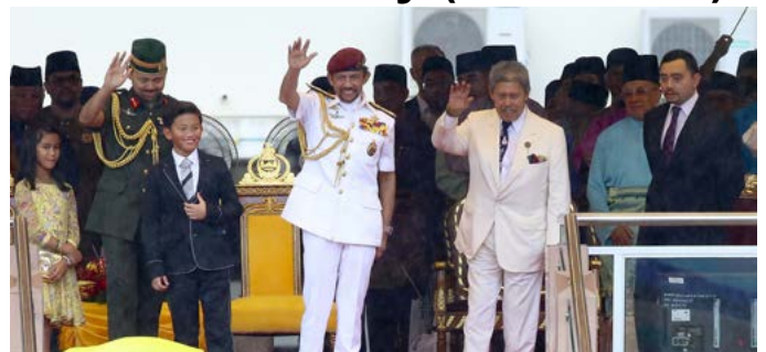
His Majesty Sultan Haji Hassanal Bolkiah Mu'izzaddin Waddaulah ibni Al-Marhum Sultan Haji Omar 'Ali Saifuddien Sa'adul Khairi Waddien, Sultan and Yang Di-Pertuan of Brunei Darussalam and members of the royal family during the 33 rd National Day at Taman Haji Sir Muda Omar 'Ali Saifuddien.

The celebration was further enlivened with performances themed "Accomplishing the National Vision" involving some 6,833 participants from various sectors and agencies including