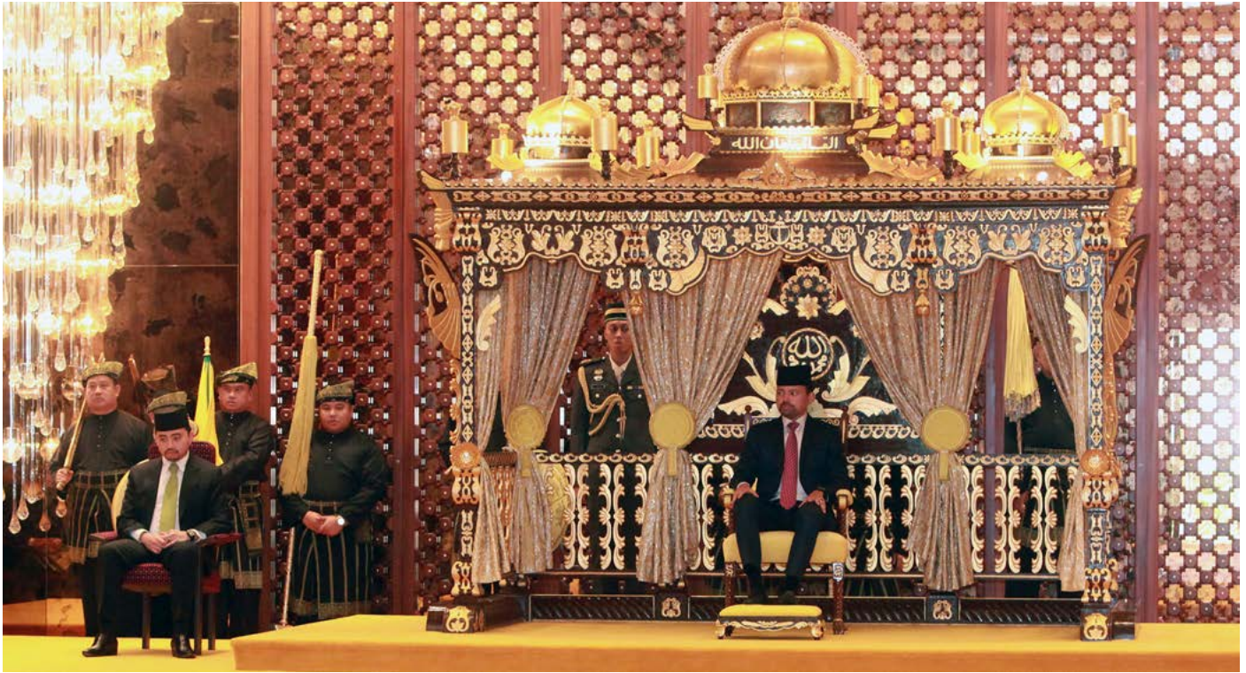
His Royal Highness Prince Haji Al-Muhtadee Billah ibni His Majesty Sultan Haji Hassanal Bolkiah Mu'izzaddin Waddaulah, the Crown Prince and Senior Minister at the Prime Minister's Office at the ceremony as personal representative to His Majesty the Sultan and Yang Di-Pertuan of Brunei Darussalam.

BANDAR SERI BEGAWAN, February 28 - His Majesty Sultan Haji Hassanal Bolkiah Mu'izzaddin Waddaulah ibni Al-Marhum Sultan Haji Omar 'Ali Saifuddien Sa'adul Khairi Waddien, Sultan and Yang Di-Pertuan of Brunei Darussalam has conferred State Honorary Medals to 382 recipients in honour of the monarch's 70 th Birthday Anniversary Celebration.