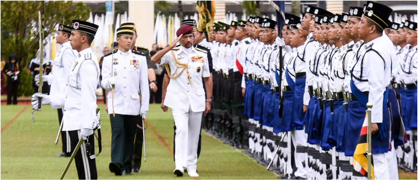
His Majesty Sultan Haji Hassanal Bolkiah Mu'izzaddin Waddaulah ibni Al-Marhum Sultan Haji Omar 'Ali Saifuddien Sa'adul Khairi Waddien, Sultan and Yang Di-Pertuan of Brunei Darussalam inspecting the Guard of Honour at the 33 rd National Day Celebration.