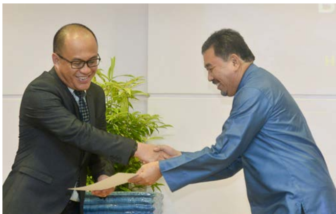
The Permanent Secretary at the Ministry of Primary Resources and Tourism (MPRT) as personal representative to the Minister of Primary Resources and Tourism presenting certificates of appreciation to the participant.

RIMBA, February 2 - The Workshop on Facilitating Agri-Business Development in Brunei Darussalam, which was held for four days since January 30, ended with a closing ceremony and the presentation of certificates which took place at Dewan Simpur, Horticulture Business Centre.