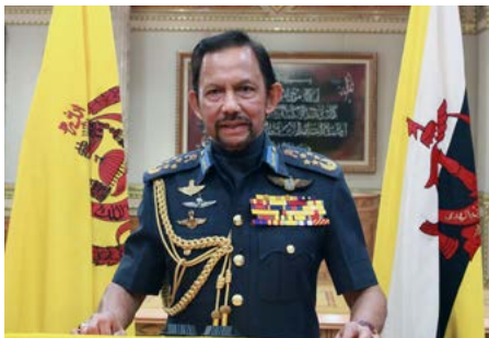
13. Implement Brunei Vision 2035 with full commitment