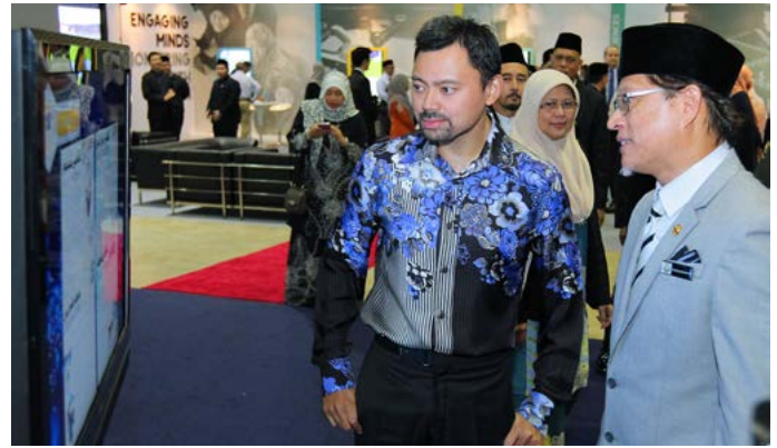
His Royal Highness Prince Haji Al-Muhtadee Billah ibni His Majesty Sultan Haji Hassanal Bolkiah Mu'izzaddin Waddaulah, the Crown Prince and Senior Minister at the Prime Minister's Office touring the Higher Education Expo 2017.

Among the local government institutions participating in the exhibition are Universiti Brunei Darussalam (UBD), Universiti