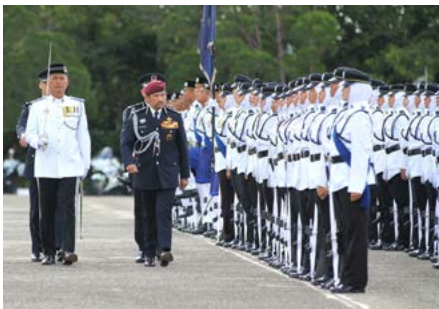
9. RBPF urged to uplift efforts in enforcing law