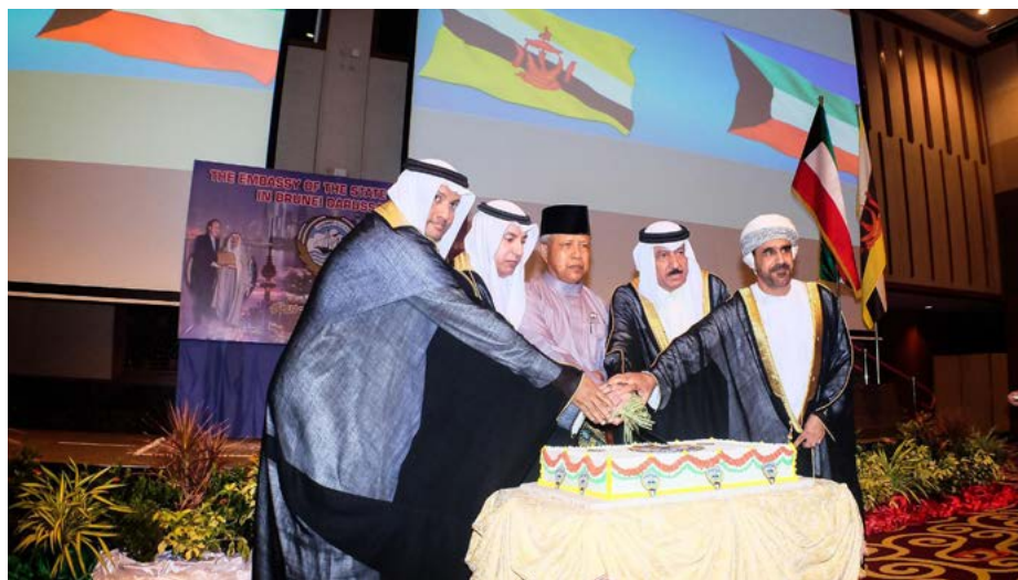
Yang Berhormat Minister of Culture, Youth and Sports with His Excellency Ambassador Extraordinary and Plenipotentiary of the State Kuwait to Brunei Darussalam and other officials during the cake-cutting ceremony.

JERUDONG, February 24 - The Embassy of Kuwait in the country held a Dinner Reception in conjunction with the 56 th National Day Anniversary of the State of Kuwait which took place at The Empire Hotel & Country Club.