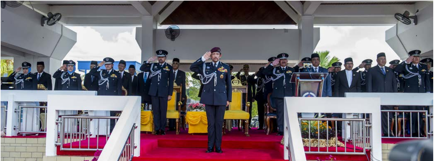
His Majesty Sultan Haji Hassanal Bolkiah Mu'izzaddin Waddaulah ibni Al-Marhum Sultan Haji Omar 'Ali Saifuddien Sa'adul Khairi Waddien, Sultan and Yang Di-Pertuan of Brunei Darussalam receiving a Royal Salute at the parade.