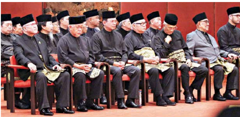
Among those present were Yang Amat Mulia Pengiran-Pengiran Cheterias and Pengiran-Pengiran Peranakan.

Also in attendance were Yang Amat Mulia Pengiran-Pengiran Cheterias; cabinet ministers; members of Privy Council; deputy ministers; Pengiran-Pengiran Peranakan; Pehin-Pehin Manteri; Manteri-Manteri Pedalaman, high commissioners; foreign ambassadors; permanent secretaries, heads of departments, senior government officers as well as mukim penghulus and village heads.