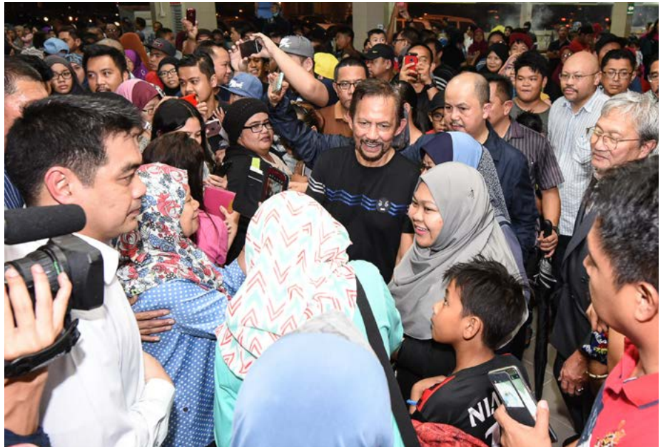
His Majesty Sultan Haji Hassanal Bolkiah Mu'izzaddin Waddaulah ibni Al-Marhum Sultan Haji Omar 'Ali Saifuddien Sa'adul Khairi Waddien, Sultan and Yang Di-Pertuan of Brunei Darussalam mingles with the vendors and visitors at the market.

Upon arrival, His Majesty was greeted by a crowd of people who were thronging the busy market looking for their favorite local delicacies.