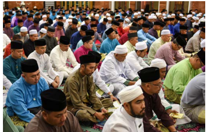
Among the congregants attending the Kesyukuran Ceremony at the Sultan Omar 'Ali Saifuddien Mosque in the capital in conjunction with the 33 rd National Day Celebration.