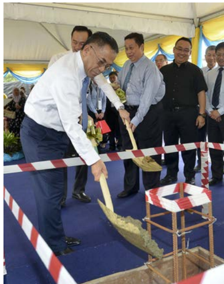
Yang Berhormat Minister of Primary Resources and Tourism officiating the Ground-Breaking Ceremony for the first Land Based Vertical Aquaculture Farm KR Apollo Sendirian Berhad Project.

BANDAR SERI BEGAWAN, February 13 - The Ground-Breaking Ceremony for the first Land Based Vertical Aquaculture Farm KR Apollo Sendirian Berhad Project was held at the Freshwater Aquaculture Site, in Sungai Jambu, Kampung Tungku.