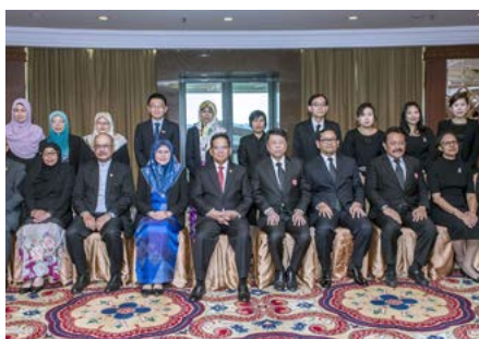
23. Brunei - Thailand discuss matters of common interest in education