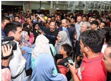
8. His Majesty's surprise visit to Gadong night market