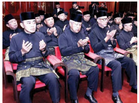
Also in attendance were cabinet ministers, members of Privy Council; deputy ministers and Pehin-Pehin Manteri.