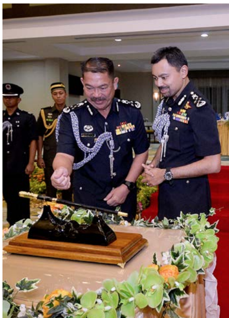
His Royal Highness Prince Haji Al-Muhtadee Billah ibni His Majesty Sultan Haji Hassanal Bolkiah Mu'izzaddin Waddaulah, the Crown Prince and Senior Minister at the Prime Minister's Office receiving pesambah (souvenir) (left); and His Royal Highness the Crown Prince and Her Royal Highness Paduka Seri Pengiran Anak Isteri Pengiran Anak Sarah receiving a junjung ziarah (right).