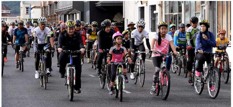
Also joining the cycling event was Her Royal Highness Princess Ameerah Wardatul Bolkiah (above).

His Majesty also toured and had a closer look at the numerous activities being held such as the sales of clothing, food, beverages, sports accessories, children's games, garage sales and many more.