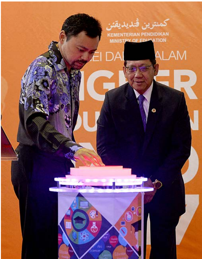
His Royal Highness the Crown Prince and Senior Minister at the Prime Minister's Office launching the Higher Education Expo 2017.