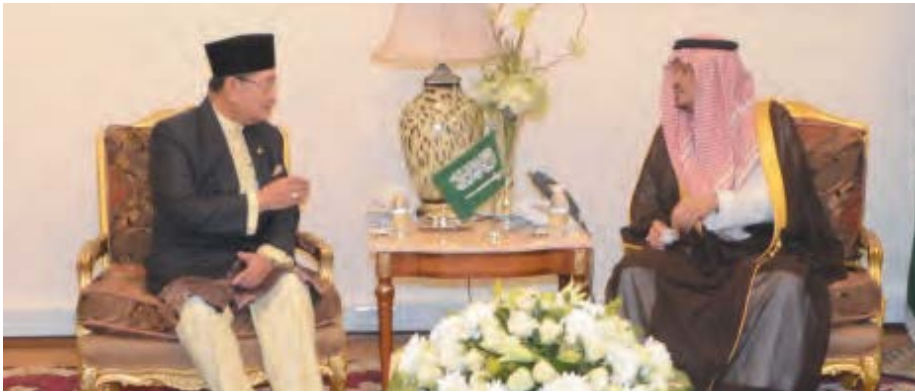
Yang Berhormat Minister of Religious Affairs during the meeting with the the Honorable Dr. Mohammed Salih bin Tahir Bentin, the Minister of Hajj and Umrah, the Kingdom of Saudi Arabia.

JEDDAH, KINGDOM OF SAUDI ARABIA, February 16 - The Ministry of Hajj and Umrah and the Government of the Kingdom of Saudi Arabia reaffirmed their efforts to improve accommodation, transportation, air passage and other related matters for the 1438 Hijrah Hajj season and beyond.