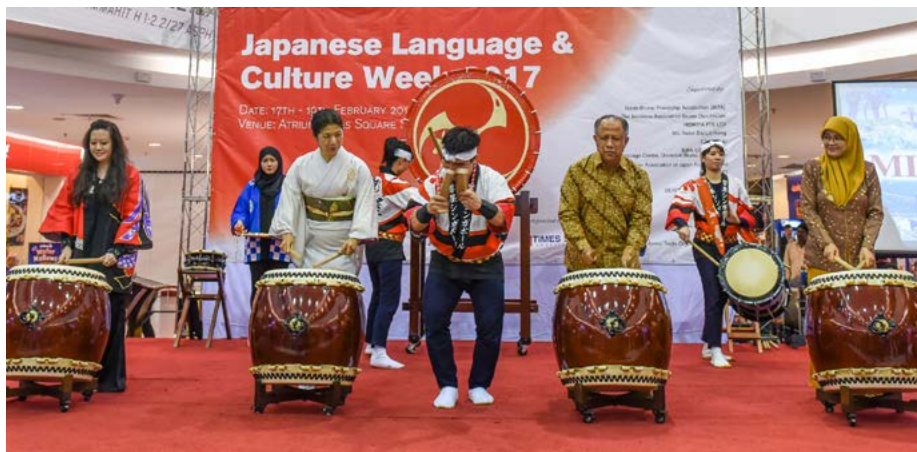
Yang Berhormat Minister of Culture, Youth and Sports as the Guest of Honour and spouse at the launching ceremony.