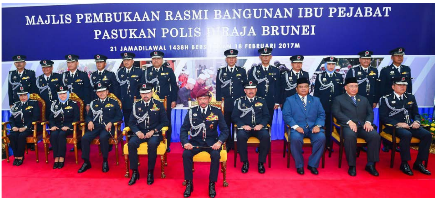
His Majesty; His Royal Highness Prince Haji Al-Muhtadee Billah, the Crown Prince and Senior Minister at the Prime Minister's Office; His Royal Highness Prince Mohamed Bolkihah; Her Royal Highness Princess Hajah Masna, Ambassador-at-Large at the Ministry of Foreign Affairs and Trade; and Her Royal Highness Princess Hajah Nor'ain in a group photo during the Inauguration Ceremony of Police Headquarter's new building.