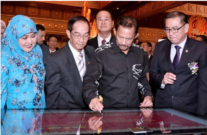
His Majesty the Sultan and Yang Di-Pertuan of Brunei Darussalam signing on the screen after the meet-and-greet with students online through video conference.