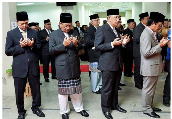
Among those present at the launching ceremony were cabinet ministers and deputy ministers.