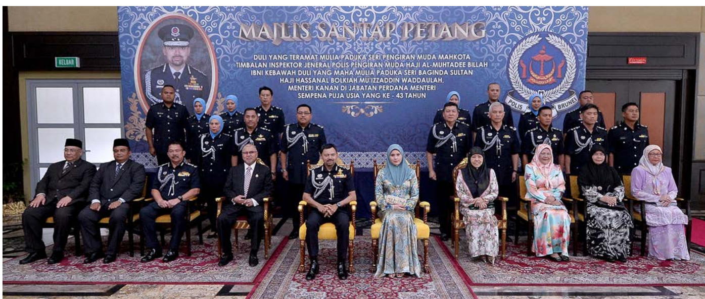
Their Royal Highnesses in a group photo at the ceremony.