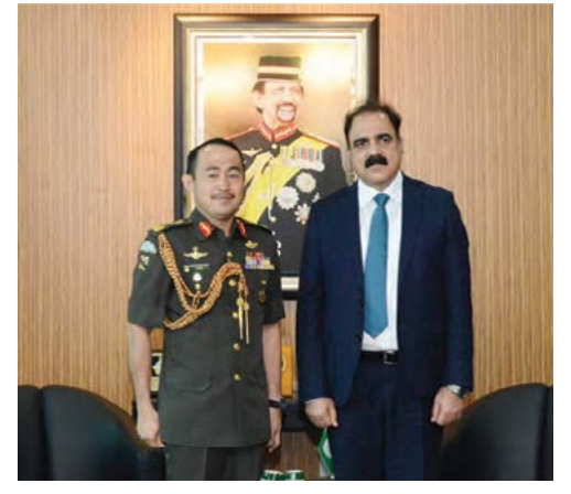
His Excellency Security Defence of the Islamic Republic of Pakistan paying separate courtesy calls to Yang Mulia Deputy Minister of Defence (left); and Yang Dimuliakan Commander of the Royal Brunei Armed Forces (right).

BOLKIAH GARISON, August 9 - His Excellency Lieutenant General (Rtd) Zamir-Ul-Hassan Shah. Security Defence of the Islamic Republic of Pakistan paid a courtesy call to Yang Mulia First Admiral (Rtd) Dato Seri Pahlawan Awang Abdul Aziz bin Haji Mohd. Tamit, Deputy Minister of Defence.