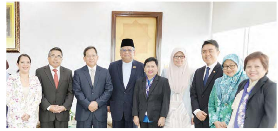
Yang Berhormat Minister of Education in a group photo with the delegation from the Republic of the Philippines' Commission on Higher Education.

Also present were Yang Mulia Pengiran Dato Seri Paduka Haji Bahrom bin Pengiran Haji Bahar, Deputy Minister of Education; and His Excellency Philippines to Brunei Darussalam, who Ahmad, Deputy Permanent Secretary