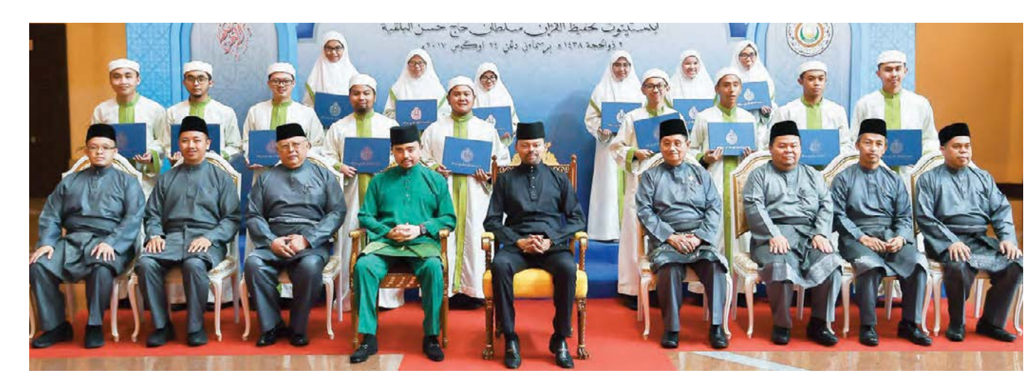
Their Royal Highnesses in a group photo with the graduates of the institution.