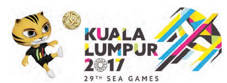
KUALA LUMPUR, MALAYSIA, August 16 - Brunei Darussalam's sepak takraw team scored their first medal for the national contingent after snatching bronze with 157 points in the Chinlone event at the Titiwangsa Stadium in Kuala Lumpur,