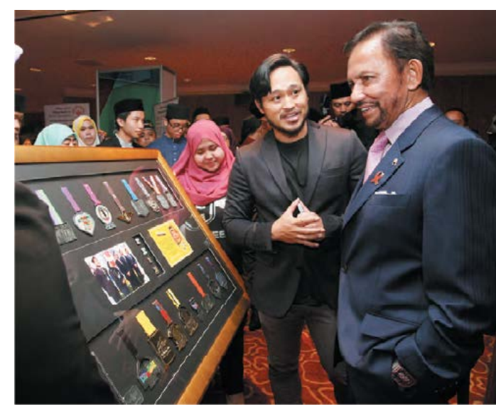
His Majesty the Sultan and Yang Di-Pertuan of Brunei Darussalam and other members of royal family at the Youth Get-Together (above and below)