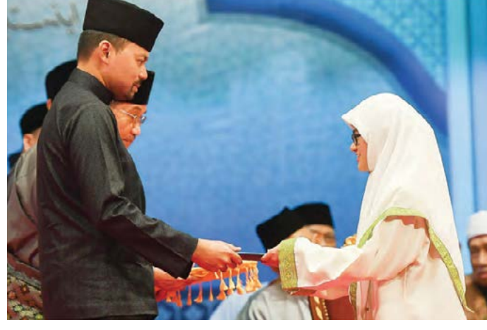
His Royal Highness the Crown Prince presenting 'Aliyaah Qiraat certificates to the graduates at the ceremony.