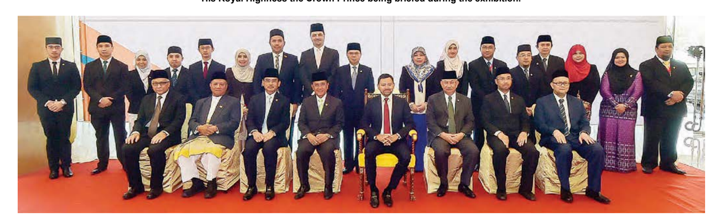
His Royal Highness in a group photo during the BIIS2017.