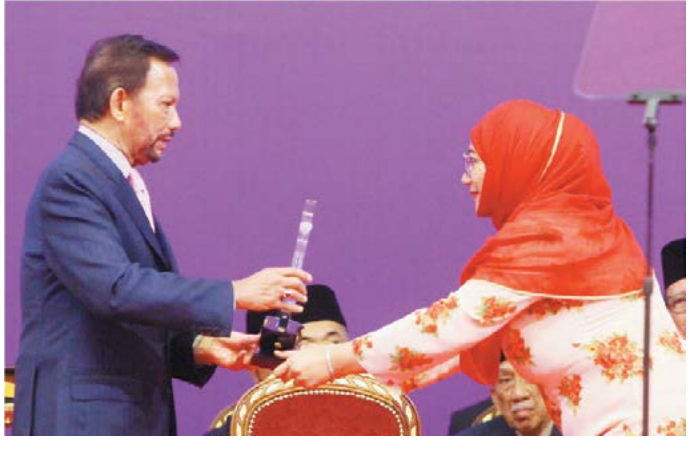
His Majesty the Sultan and Yang Di-Pertuan of Brunei Darussalam presenting the National Youth Day 2017 Awards to the recipients (above).

The Monarch called for the youth to not be passive but active. Hence, the scheduling of their time or day must be taken into account. If we allow the youth to follow the trend of solely relaxing, the risk would be very bad for the future. The country could be left with weak human resources and the lack of competitiveness to face various challenges.