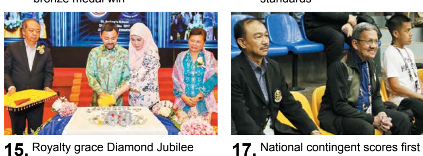
15. Royalty grace Diamond Jubilee Gala Dinner