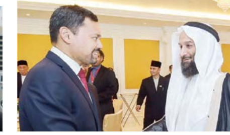
13. Ensuring adherence to syariah