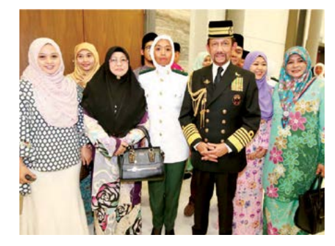
His Majesty during the Junjung Ziarah Ceremony with the newly commissioned officer cadets along with their family members (above and below).