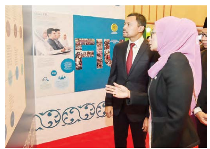
His Royal Highness the Crown Prince being briefed during the exhibition.

Themed "Globalisation of Islamic Finance: The Road Ahead", the two-day BIIS2017 is held until August 3 by CIBFM in collaboration with AMBD.