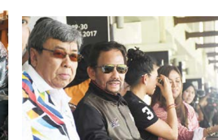
10. His Majesty attends SEA Games polo match