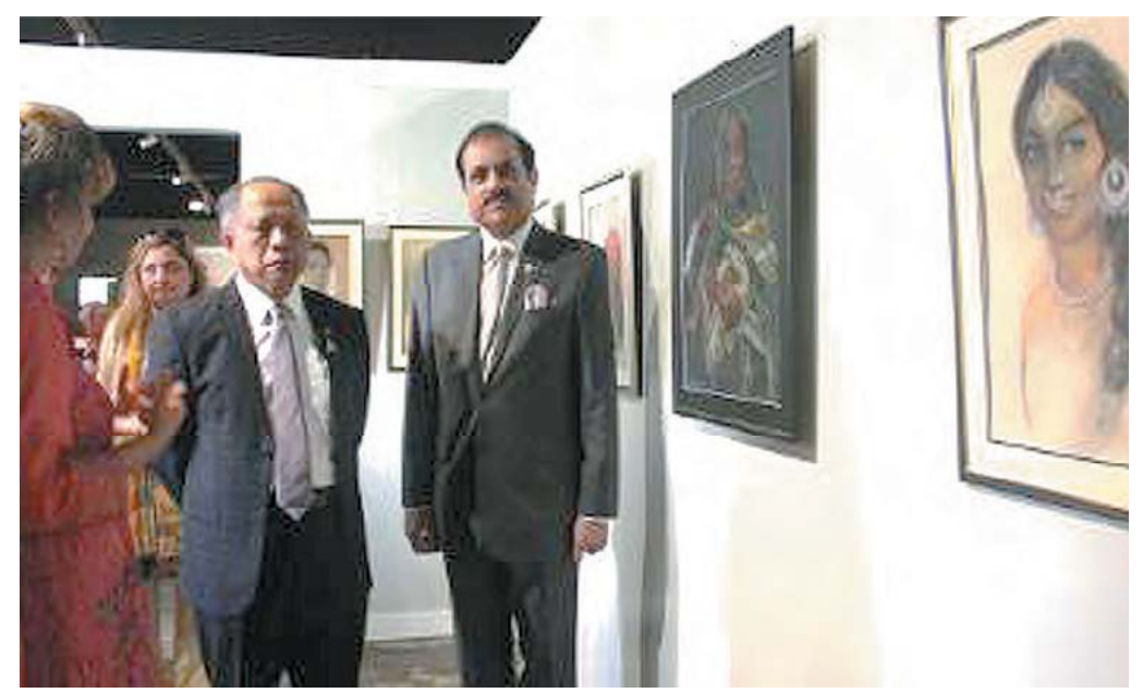
Yang Berhormat Minister of Culture. Youth and Sports at the exhibition held in conjunction with the 71st National Independence Day of the Islamic Republic of Pakistan at the Royal Wharf Art Gallery.

Also present were heads of foreign delegations to Brunei Darussalam: Permanent Secretary at the Ministry of Culture, Youth and Sports; senior officials: and the public.