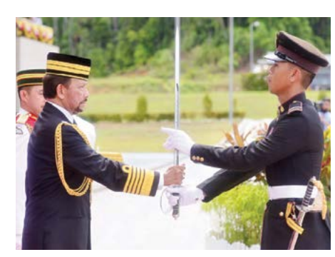
His Majesty conferring the awards for the best officer cadets in various fields under the 16th Intake of the Officer Cadet School (OCS) Defence Academy, RBAF (above and below)