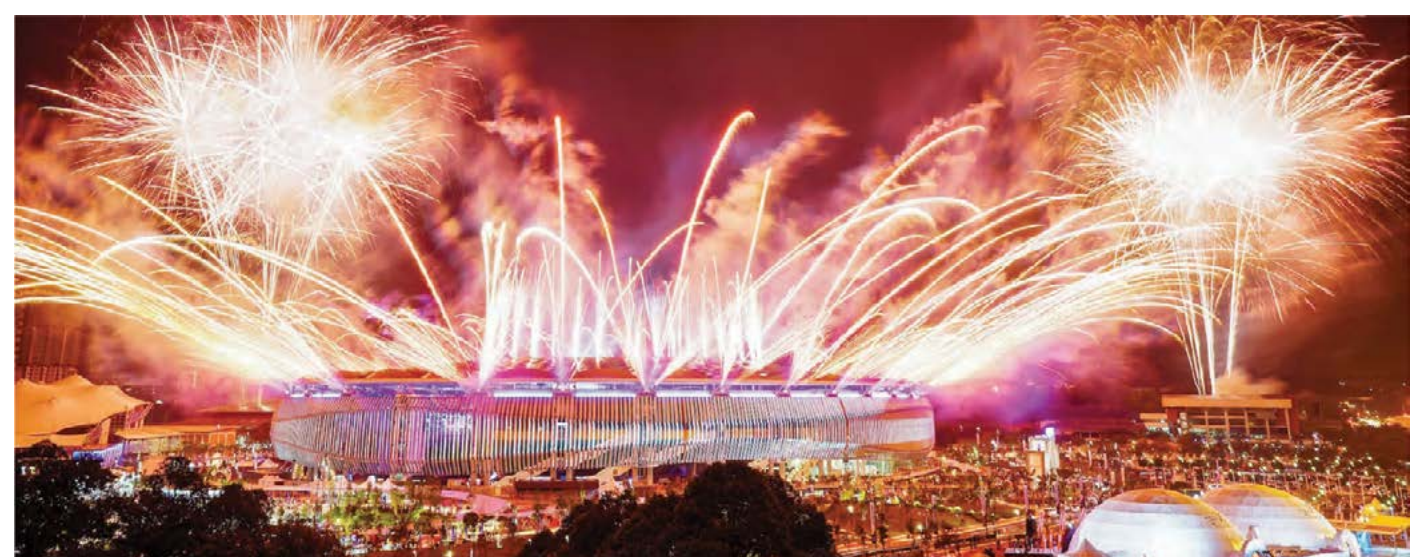
the interesting performances held at the Opening Ceremony of the 29th South East Asian (SEA) Games, which took place in full glory (above and below)