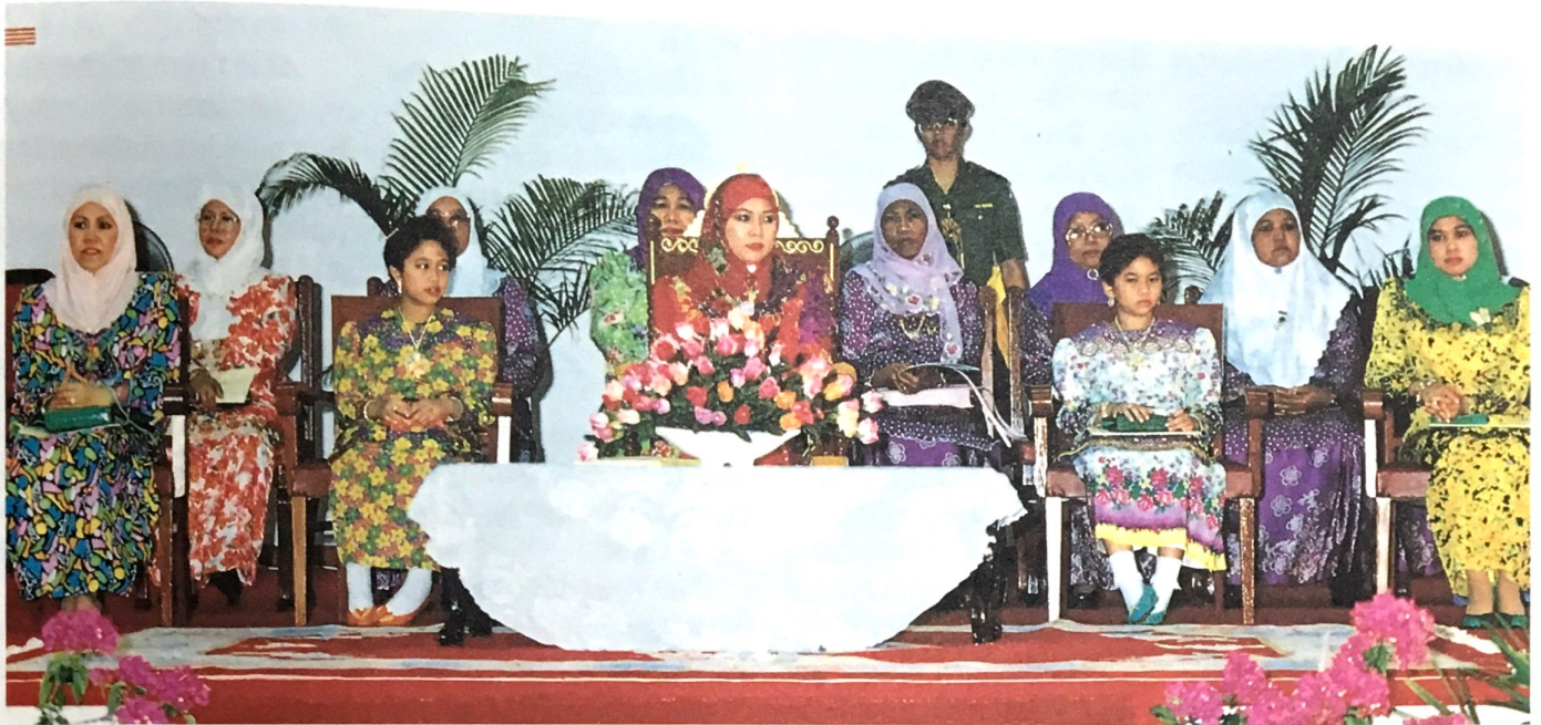
Her Royal Highness Pengiran Isteri Hajjah Mariam on the dais with her daughters sitting on either side of her at the start of the celebration. After presenting the prizes (below), Her Royal Highness took a close look at various items which were put on display for the occasion.