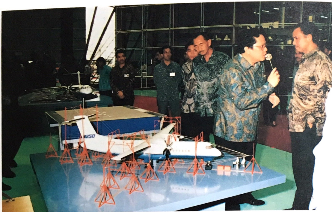
Left: His Majesty The Sultan and Yang Di-Pertuan of Brunei Darussalam being briefed by an IPTN official on various aspects of the aircraft industry as he stands besides a model of IPTN's recently rolled out N250 aircraft.