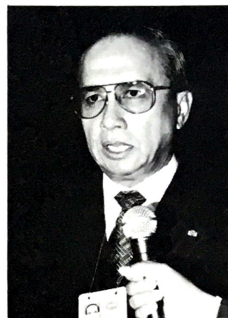
Minister of Industry and Primary Resources, Yang Berhormat Pehin Orang Kaya Setia Pahlawan Dato Seri Setia Awang Haji Abdul Rahman.