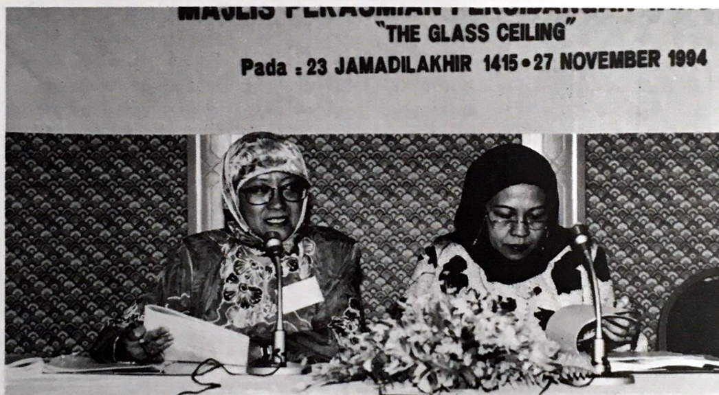
Speaker of the Seminar on Glass Ceiling presenting her working paper.

Glass Ceiling is considered when women feel frustrated for being unable to achieve higher position.