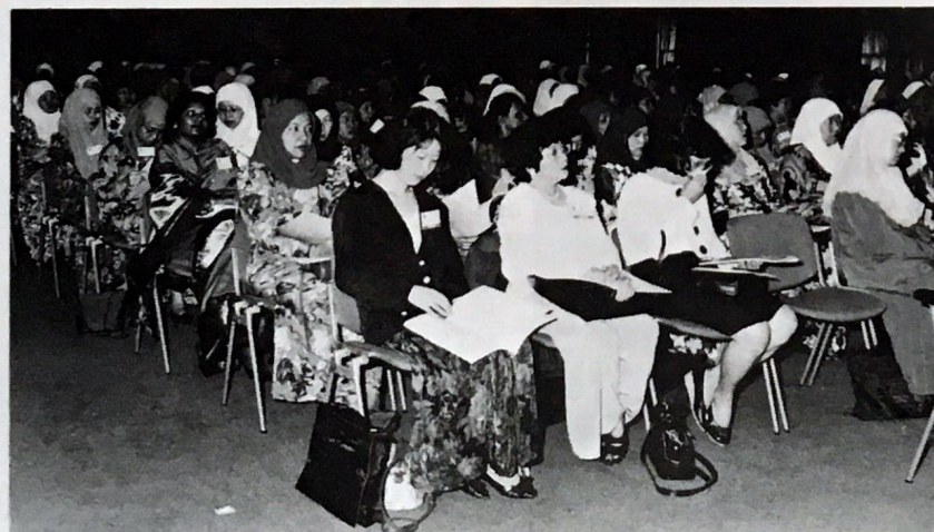
Some of the participants from thirteen countries who took part in the conference.