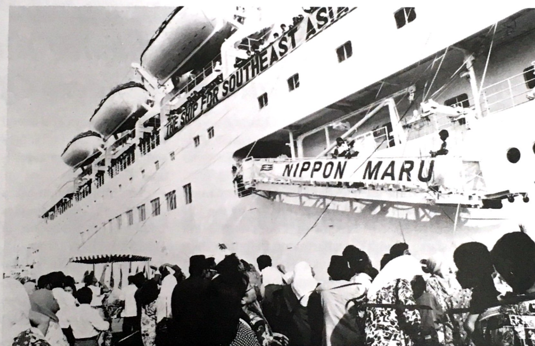
Participants of the 21st SSEAYP wave from aboard the ship Nippon Maru as it sailed off from Muara Port after a four-day stay in the Sultanate.

the relatively small number of former participants involved in the Alumni Association is disproportionate to their total number which is increasing by the year," the Deputy Minister lamented.