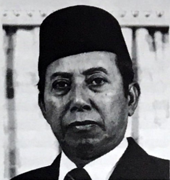
The Minister of Culture, Youth and Sports, Yang Berhormat Pehin Orang Kaya Digadong Seri Lela Dato Seri Paduka Haji Awang Hussein says that SSEAYP provides opportunity for youths to become responsible.

Darussalam. Brunei Darussalam was its fifth destination for the annual programme, which among other things is aimed at providing youths from those countries with insights into one another's cultures, ways of life as well as exchanging views while on their cruise.