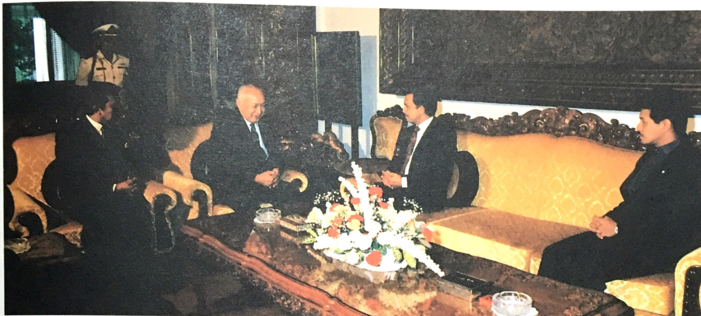
While attending the APEC Leaders' Meeting, His Majesty The Sultan and Yang Di-Pertuan of Brunei Darussalam held bilateral talks with His Excellency President Soeharto of Indonesia (above), at which they discussed bilateral and regional issues and issues pertaining to APEC, and with His Excellency President Fidel Ramos of the Philippines (below) to discuss issues of bilateral and regional interest, including the recently established East ASEAN Growth Area, EAGA.