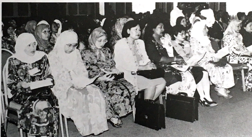
Participants of the Border Health Conference attending the conference's opening ceremony.

The topics discussed included communicable diseases, vector-borne disease, food and drug control, manpower development and training.