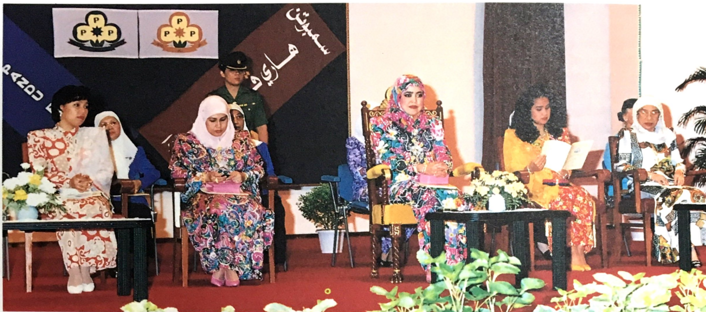
On the dais before delivering her address, Her Majesty Paduka Seri Baginda Raja Isteri Pengiran Anak Hajjah Saleha, flanked by other members of the royal family. Left, below: Her Majesty presented medals and warrants to members of the Brunei Darussalam Girl Guides Association before going around to view some of the exhibits put up by the association in conjunction with the Girl Guides Day.