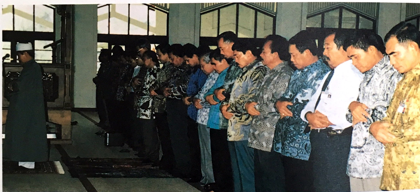
Above: The Brunei monarch and His Royal Highness Prince Haji Jefri Bolkiah joined other Muslims for the late afternoon Zuhur prayer at the Habiburrahman mosque, which is part of IPTN's complex.