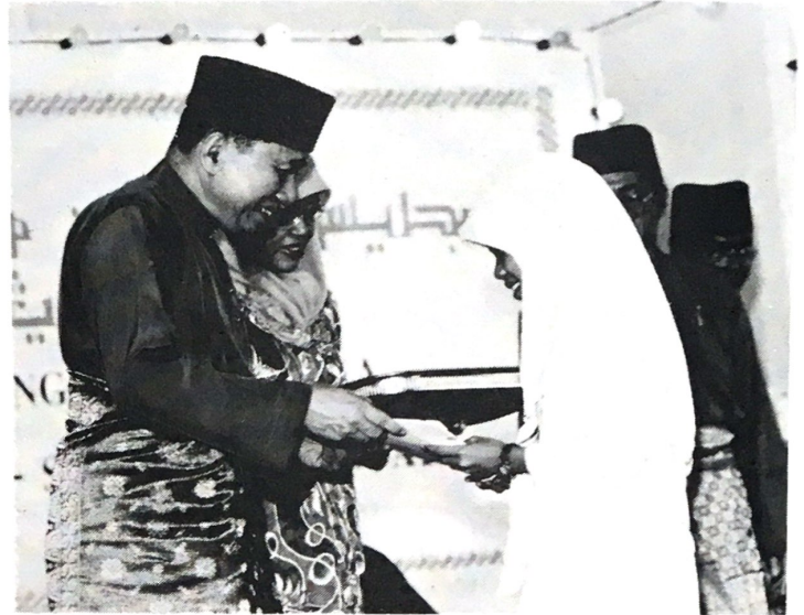
The Education Minister, Yang Berhormat Pehin Orang Kaya Laila Wijaya Dato Seri Setia Haji Awang Abdul Aziz presenting prize to a pupil.

The minister further urged that such specialities