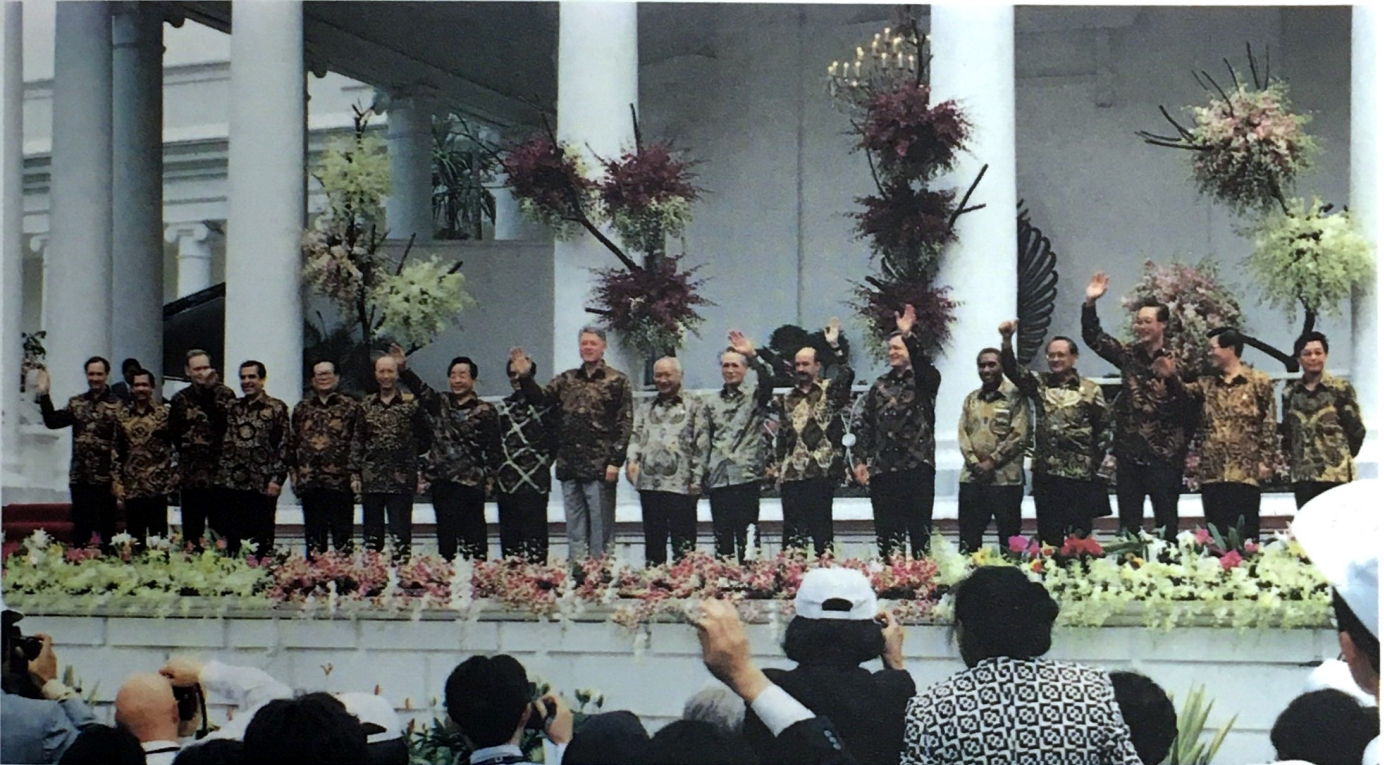
His Majesty Paduka Seri Baginda Sultan Haji Hassanal Bolkiah Mu'izzaddin Waddaulah, Sultan and Yang Di-Pertuan of Brunei Darussalam and other APEC Leaders posing for journalists outside Bogor Palace before getting down to serious discussions.