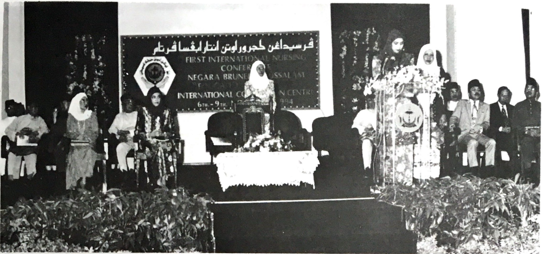
Her Royal Highness Paduka Seri Pengiran Anak Puteri Hajjah Rashidah Sa'adatul Bolkiah officiating the opening of the First International Nursing Conference.

B runei Darussalam's Minister of Health has highlighted that nurses play a pivotal role in the provision of health care, whether in the hospital or in the community setting. He said that the World Health Organisation gives emphasis for primary health care in the achievement of Health for All.