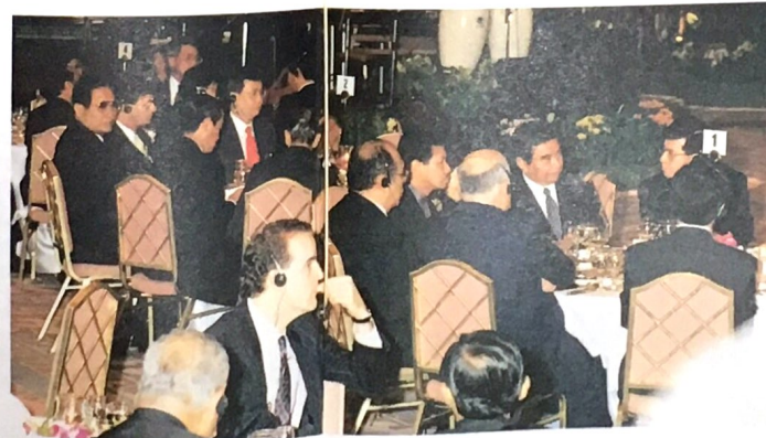
After day-long discussions, the APEC leaders gave a press conference, with His Excellency President Soeharto as spokesman (picture above). Far left: The APEC leaders taking a walk-about in the grounds of Bogor Palace during a break of their discussion. Left: His Royal Highness Prince Haji Jefri Bolkiah, the Finance Minister, joined His Majesty and other delegates at the dinner hosted by President Soeharto to welcome the APEC leaders.