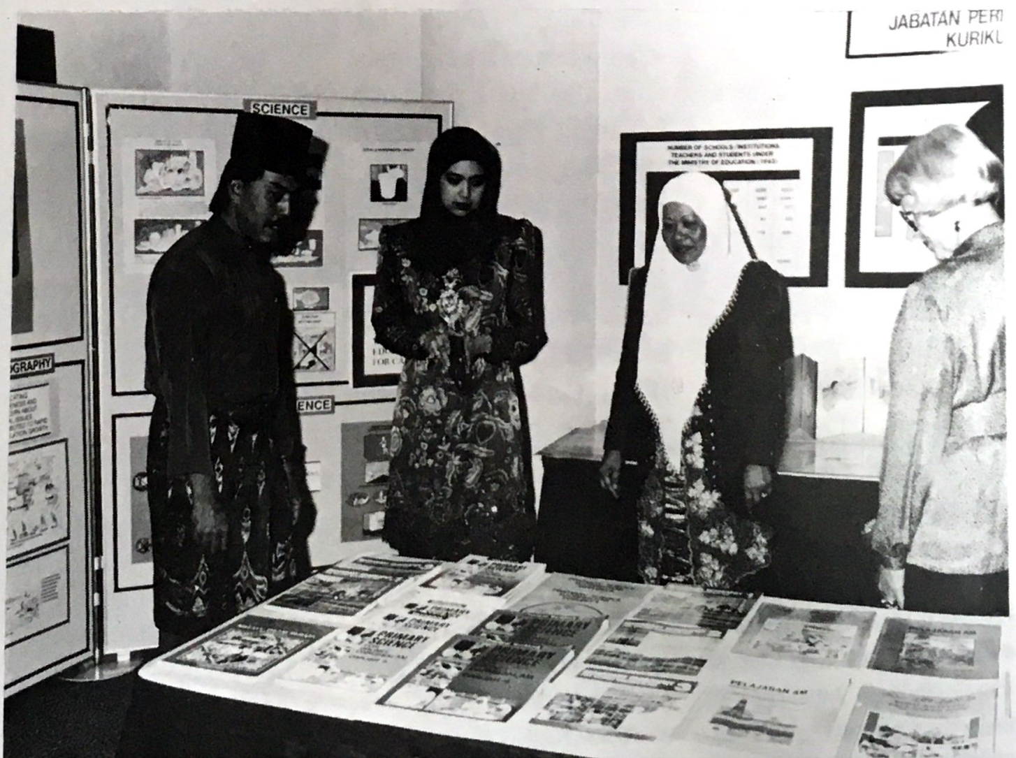
Her Royal Highness Princess Hajjah Rashidah Sa'adatul Bolkiah viewing an exhibition soon after declaring the conference open.