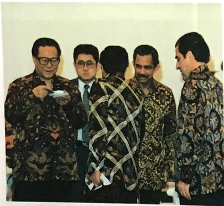
Above: His Majesty Paduka Seri Baginda Sultan Haji Hassanal Bolkiah Mu'izzaddin Waddaulah, Sultan and Yang Di-Pertuan of Brunei Darussalam and the leaders of 17 other member countries of the APEC Forum at the start of their summit in the Garuda Room of the 230-year old Bogor Palace. The Indonesian President who is the Chairman of APEC 1994, formally welcomed the APEC Leaders during a dinner he hosted at the Jakarta Convention Centre on the eve of the Bogor Summit (top picture at far right). Left: His Majesty The Sultan and Yang Di-Pertuan of Brunei Darussalam and the Malaysian Prime Minister, Yang Amat Berhormat Dato Seri Dr. Mahathir Mohammad (back to camera) greet each other while the President of the People's Republic of China (extreme left) and the Chilean President (extreme right) look on.