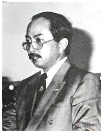
The Minister of Health, Yang Berhormat Dato Paduka Dr. Haji Johar bin Dato Paduka Haji Noordin

lity rate and maternal mortality rate and the high life expectancy indicate the quality of care provided in the country. Most of the communicable diseases are eliminated or have been drastically reduced to insignificance."