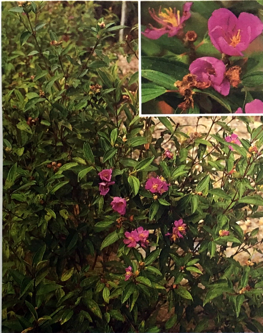
A kudok-kudok shrub: Inset: close-up of kudok-kudok flower