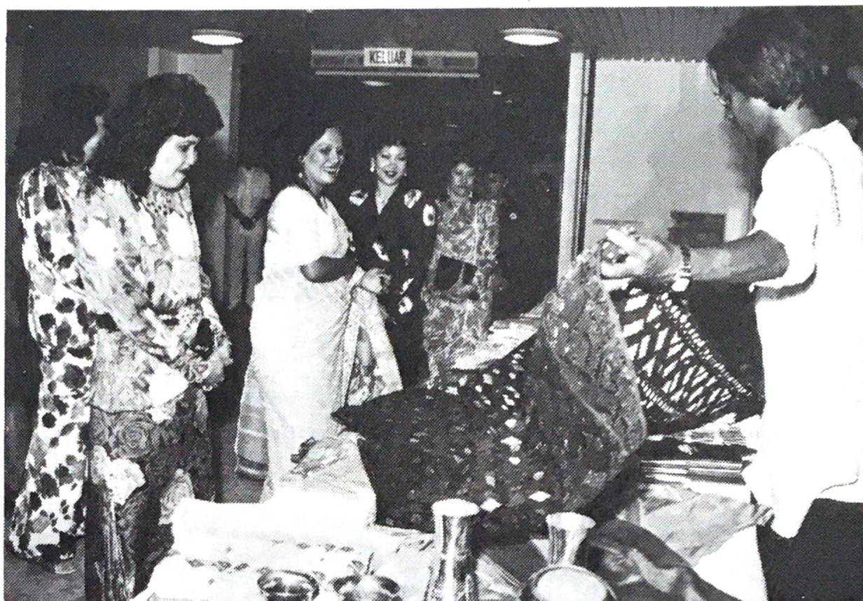
Her Majesty Raja Isteri Pengiran Anak Saleha views an exhibition of textiles held in conjunction with Bangladesh's National Day