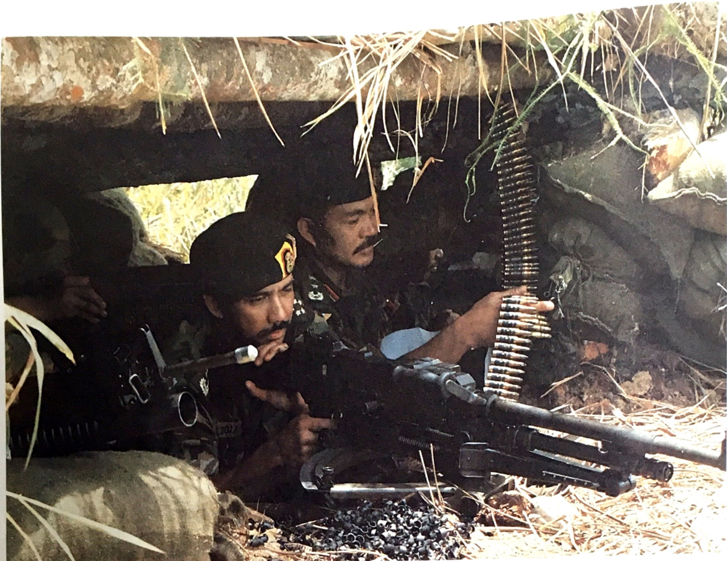
His Majesty Sultan Hassanal Bolkiah Mu'izzaddin Waddaulah, Sultan and Yang Di-Pertuan Negara Brunei Darussalam tries his hand at some gunnery during the military exercise code-named 'Nekad Murni'.