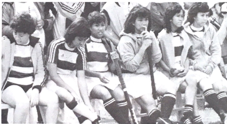
The Labuan Hockey Association 'A' team which were the ladies champions.

The three-day tournament was organised by the Panaga Club in the Belait district, a recreation club run for the staff of the Brunei Shell group of companies.