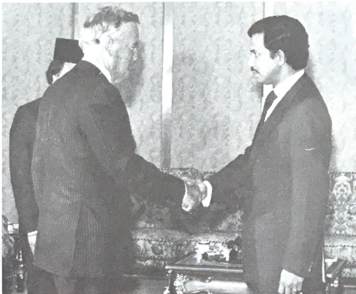
His Majesty Sultan Hassanal Bolkiah Mu'izzaddin Waddaulah, Sultan and Yang Di-Pertuan Negara Brunei Darussalam (right) meets His Excellency the Honourable Sir Joh Bjelke-Peterson, Prime Minister of Queensland, Australia at the Nurul Iman Palace.