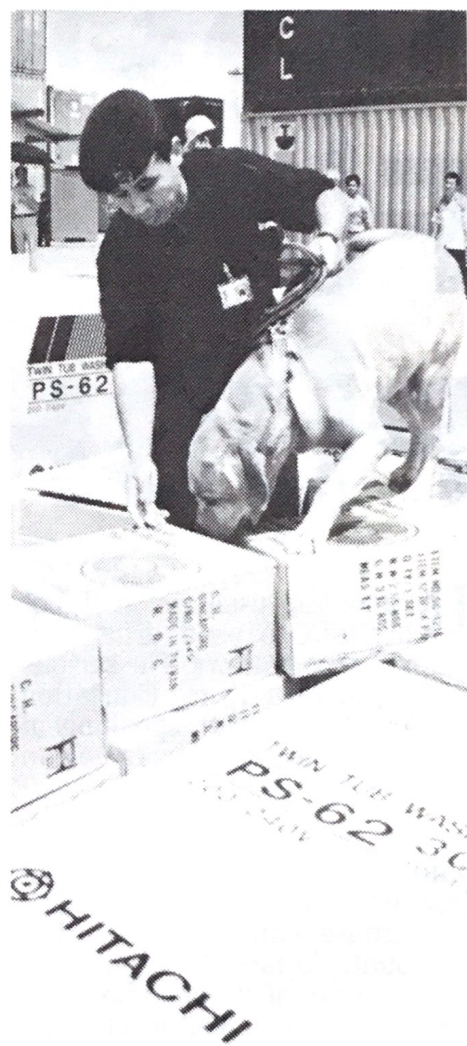
A trained Labrador checks out goods that have arrived at Muara Port which last year handled 698,000 tonnes of cargo.

BRUNEI DARUSSALAM a monthly newsletter, reports on government, social and business events in the country. If you wish to receive this free newsletter regularly and are not already on our mailing list, please let us know.