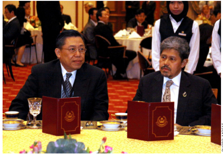
His Royal Highness hosted the luncheon for the members of ABAC.

The members are in the country for a five-day meeting.