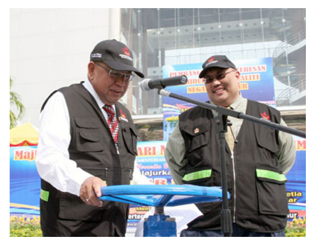
Minister of Development, Pehin Dato Haji Awang Abdullah launches the ministry's Customer Day and celebration of World Water Day.