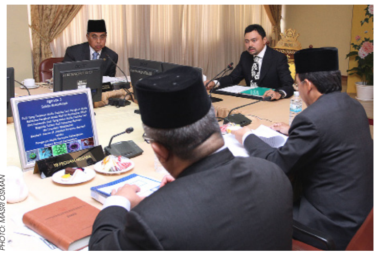
The Special Meeting of the National Disaster Council discuss Influenza A H1N1.

BERAKAS, May 2 - His Royal Highness Crown Prince Pengiran Muda Haji Al-Muhtadee Billah, Senior Minister at the Prime Minister's Office as the Chairman of the National Disaster Management Council said that the role of the public is important in shouldering the responsibilities together in preventing the virus Influenza A H1N1 from spreading more seriously in the country.