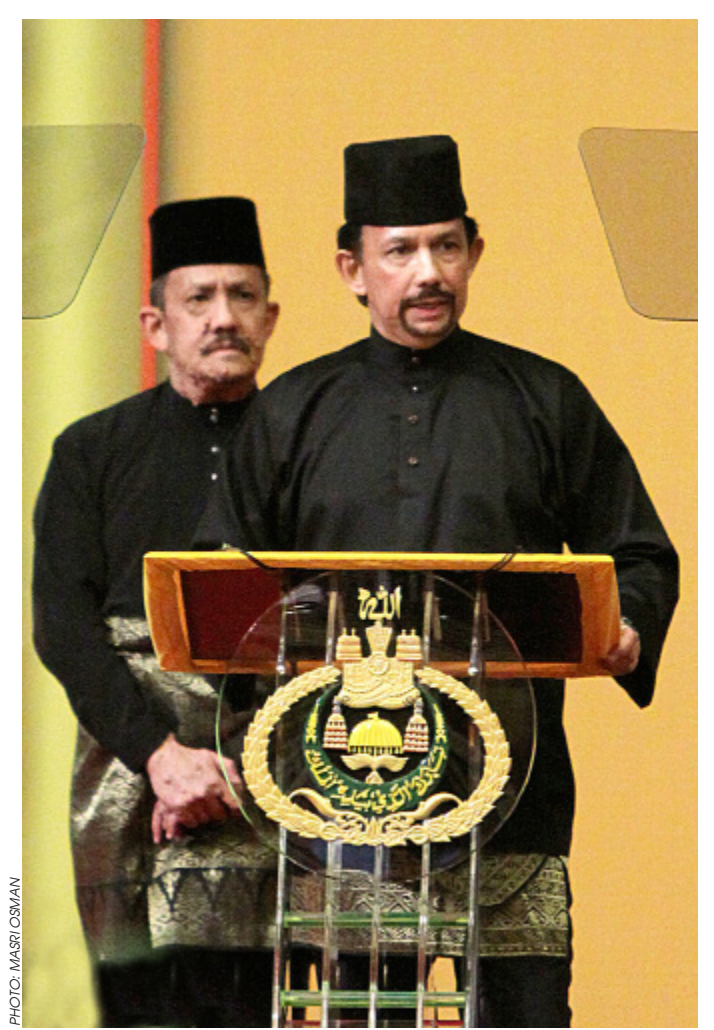
His Majesty delivers his titah (royal speech) at the Special Forum on Malay Islamic Monarchy.