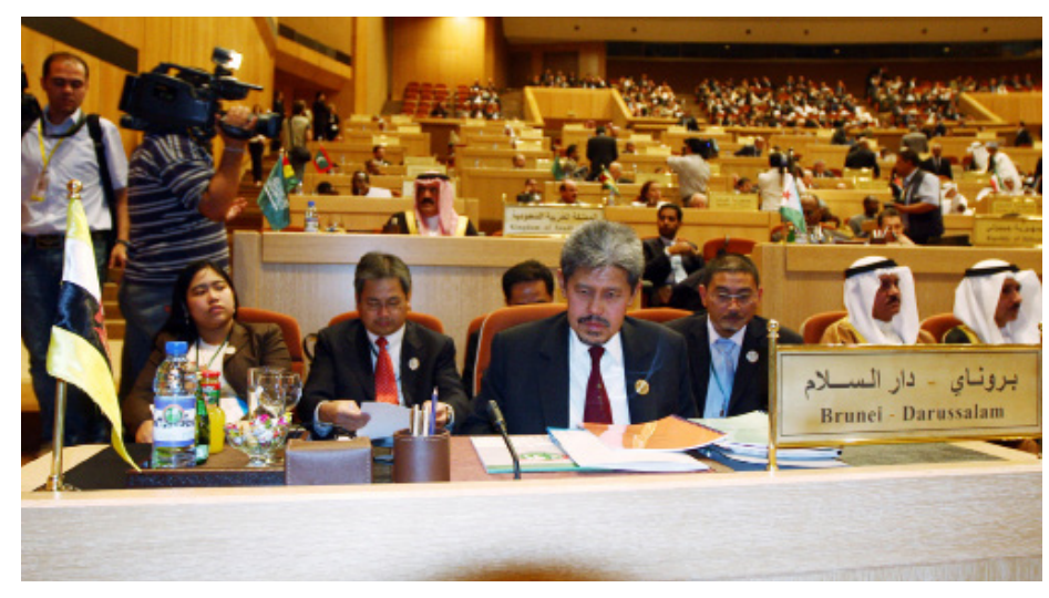
His Royal Highness at one of the sessions.