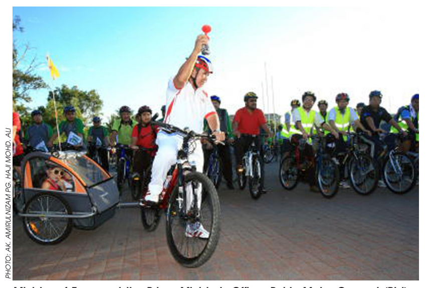
Minister of Energy at the Prime Minister's Office, Pehin Major General (Rtd) Dato Haji Awang Mohammad launches the bicycleton.

Brunei Darussalam's contingent for this year's games comprised of 36 athletes including officers and athletes from the 'Special Need People'. They participated in three sports events namely athletic, tennis and swimming.