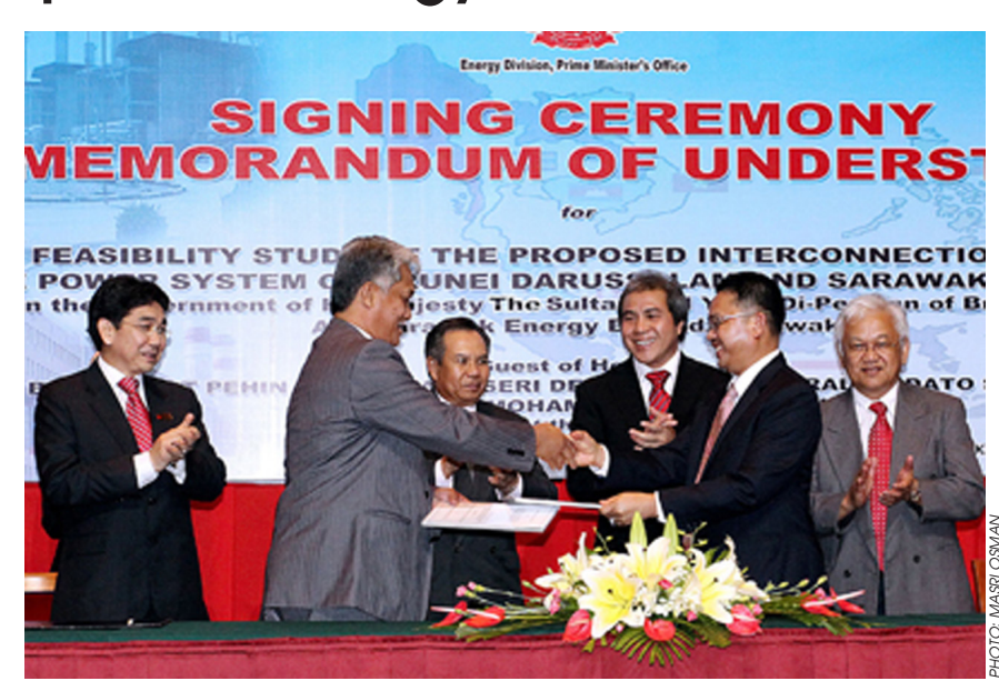
Representatives of Brunei Darussalam and Sarawak shaking hand after the signing of the MoU.

The first phase for the interconnecting of power system from Miri, Sarawak to the western part of