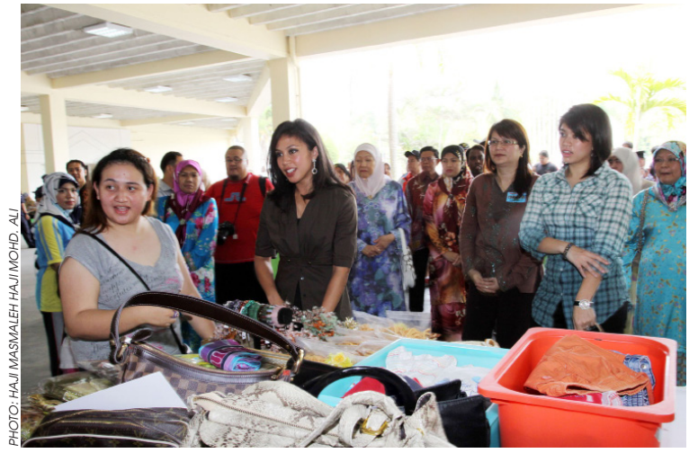
Their Royal Highnesses visit one of the booths at the carnival.