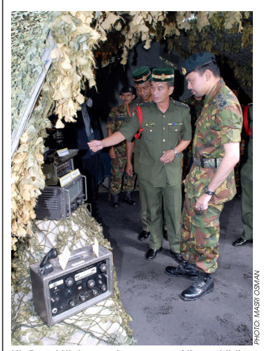
His Royal Highness views some of the exhibits.

Such steps, said His Royal Highness, can ensure that citizens and residents will be more aware and ready to practice preventive measures in maintaining personal hygiene, lessen the risk of exposure from infections and obeying the quarantine orders to those involved.