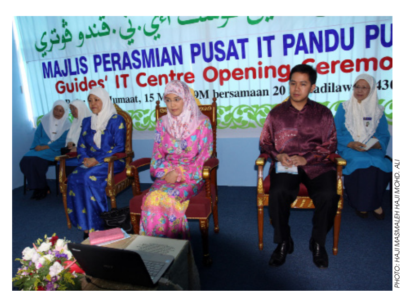
The Guides IT Centre is launched by Her Royal Highness Princess Hajah Majeedah Nuurul Bulqiah.

It is hoped that the Guides IT Centre will facilitate and give early exposure on informationcommunications technology to its members. Guides IT Centre project was implemented with cooperation from Eles Academy.