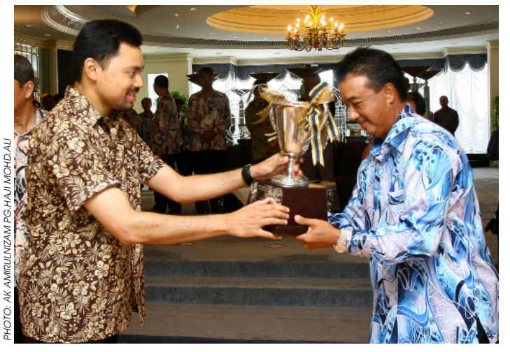
One of the winners receives his trophy from His Royal Highness.