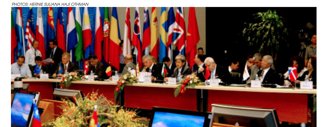
His Royal Highness during the closed session meeting.

After the opening ceremony, His Royal Highness Prince Mohamed Bolkiah and 44 others ASEM Foreign Ministers attend the closed session. In the close session, ASEM members discussed two agendas, the business agreement and the cooperation on global financial crisis.