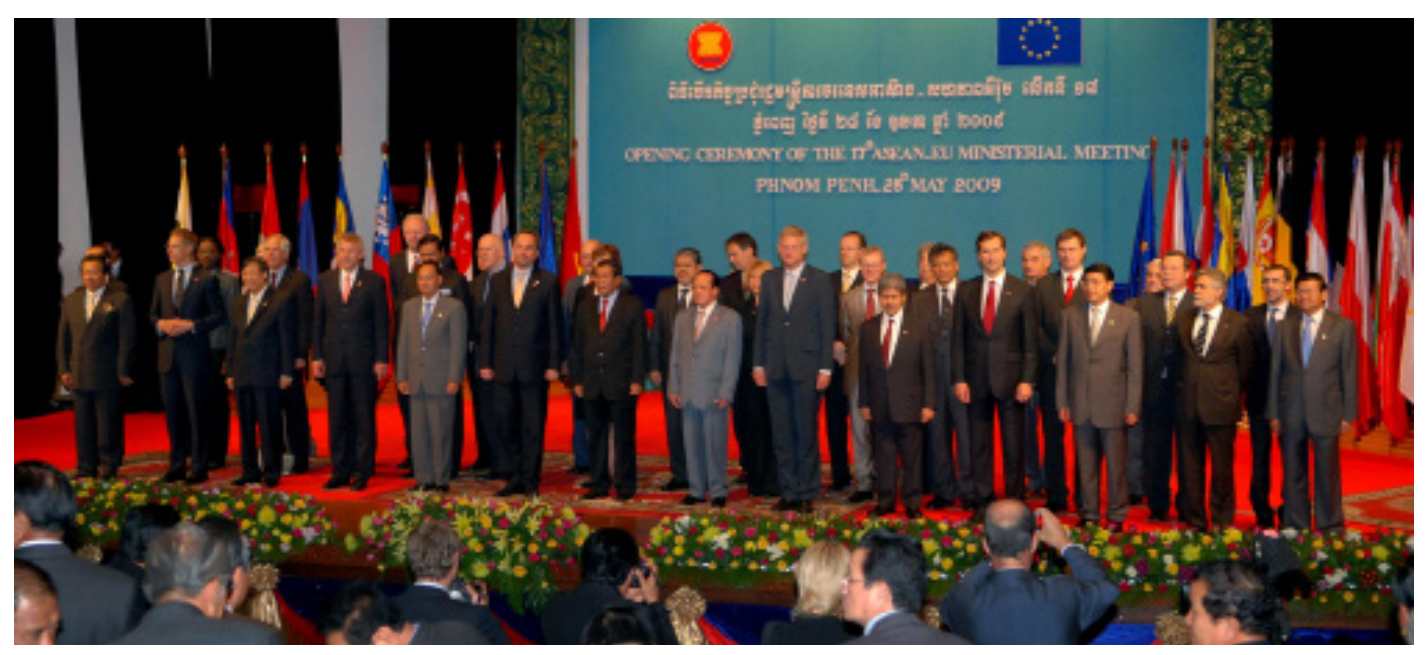
His Royal Highness at the opening ceremony of the 17th ASEAN-EU Ministerial Meeting.