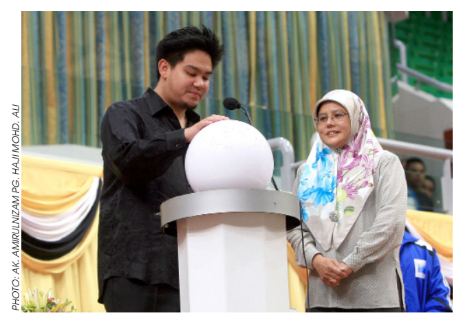
His Royal Highness launches the Family Day Celebration 2009.

Any graduates which have opportunity in 'Discover Year' will continue their study abroad as United Kingdom; Australia and Malaysia in the third year for one year and complete their study at UBD in the fourth year.