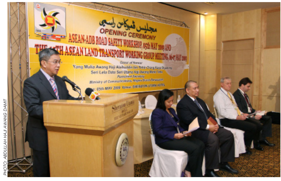
The ASEAN-ADB Road Safety Workshop and the 15th ASEAN Land Transport Working Group Meeting officially opened by Permanent Secretary at the Ministry of Communications.

BANDAR SERI BEGAWAN, May 5 - A large number of road accidents in ASEAN countries are from motorcyclists. They dominate about 60 to 75 per cent of total road accidents including injuries.