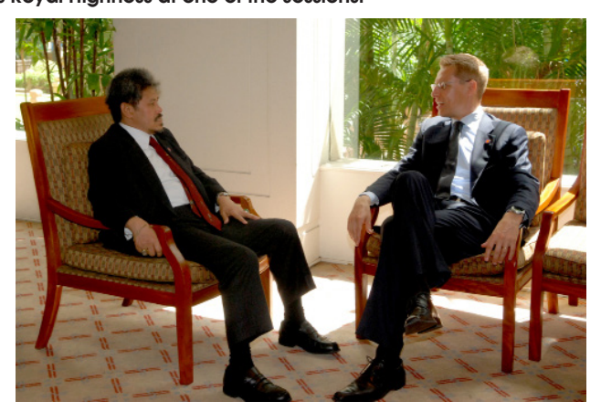
Meeting with Minister of Foreign Affairs of Republic of Finland.

The Honourable Hun Sen stressed that ASEAN-EU need to strengthen cooperation in the regional and international forum, where as ASEAN and EU play an important role such as ASIA-European Meeting.