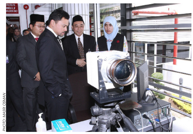
His Royal Highness observes the Thermal Scanner placed in the arrival lane at Brunei International Airport.