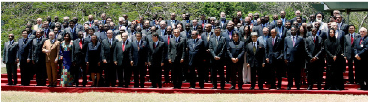
Group photo of ministers attending the Non-Aligned Ministerial Meeting.

His Royal Highness Prince Mohamed Bolkiah arrived in Havana, Cuba on April 28. His Royal Highness was accompanied by Her Royal Highness Pengiran Anak Isteri Pengiran Anak Hajah Zariah.