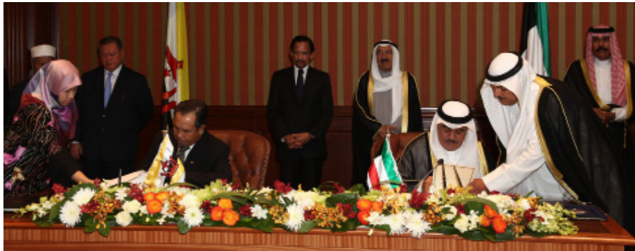
The signing of the Brunei-Kuwait Agreements and Memorandum of Understanding witnessed by His Majesty and His Highness The Emir of Kuwait.

His Majesty's visit to Kuwait was upon an invitation of His Highness The Emir of Kuwait. The visit serves to further enhance relations between the two countries. This is the second State Visit by His Majesty to Kuwait, where the first was in February 1994.