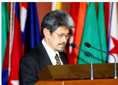
His Royal Highness Prince Mohamed Bolkiah, Minister of Foreign Affairs and Trade delivers his sabda .

HAVANA, April 29 - His Royal Highness Prince Mohamed Bolkiah, Minister of Foreign Affairs and Trade attended the Opening Ceremony and the General Debate of the Ministerial Meeting of the Coordinating Bureau for the Non-Aligned