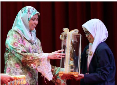
Representative from Sayyidina Umar Al-Khattab Secondary School receives the champion trophy from Her Royal Highness Princess Hajah Rashidah.

LUMAPAS, April 16 - Sayyidina Umar Al-Khattab Secondary School won the 11 th Princess Rashidah Young Nature Scientist Award (PRYNSA). The ceremony was held at the Rizqun International Hotel.