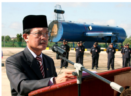
Minister of Communications delivers his speech.