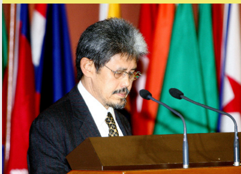
13 HRH attends NAM meeting