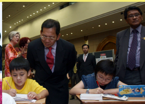
17 World Autism Awareness Day celebrates every April 2