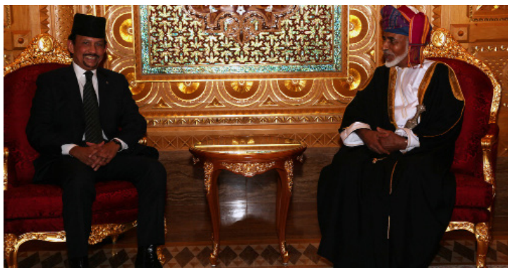
His Majesty and His Majesty Sultan Qaboos during the official meeting at the Al-Alam Palace.

Signing on behalf of the government of His Majesty The Sultan and Yang Di-Pertuan of Brunei Darussalam was The Minister of Energy at the Prime Minister's Office, Pehin Major General (Rtd) Dato Haji Awang Mohammad. Meanwhile, the government of Kuwait was his counterpart His Excellency Mustafa Jassem Al-Shamali, the Minister of Finance and His Excellency Sheikh Ahmad Abdullah Al-Ahmad Al-Sabah, Kuwait's Oil Minister.