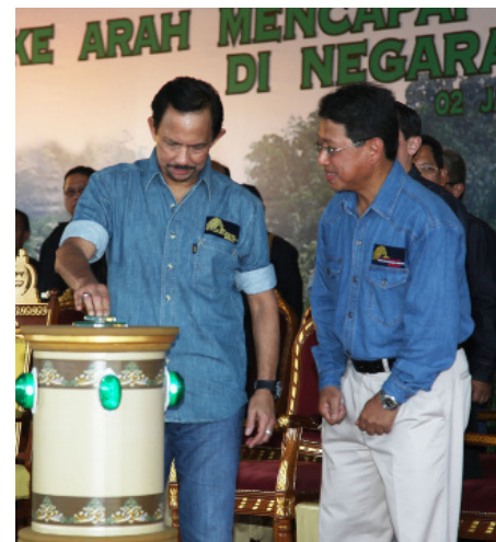
His Majesty launches the new local rice, 'Beras Laila'.

A historic event also took place with the declaration of a new name for locally produced rice now officially