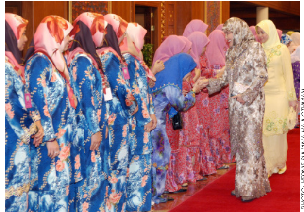
Her Majesty The Raja Isteri and Her Royal Highness Pengiran Isteri at the Special Gathering for Women in conjunction with Prophet Muhammad's birthday anniversary.