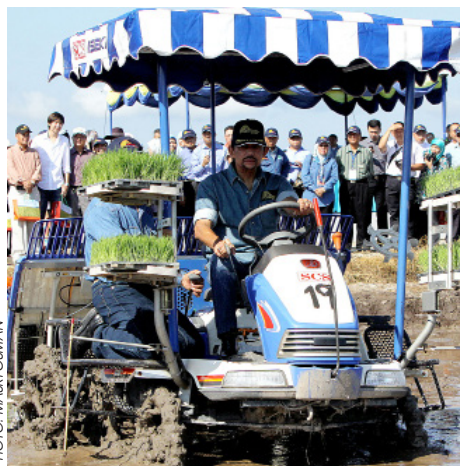
Planting the Beras Laila seedlings using paddy transplanter.

rice production in Brunei Darussalam, the Ministry of Industry and Primary Resources through its short-term plan aims to increase rice production from 3.15 per cent self-sufficiency (982.9 metric tonnes per year) to 20 per cent