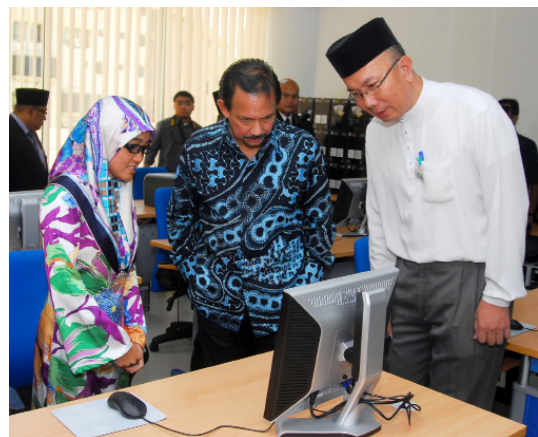
His Majesty during the visit to Media Unit and Academic Resources.

MOE officially launched SPN21 on January 5, 2009 for Year 1 to 4 students. The implementation is carried out in phases where SPN21 is expected to be fully implemented by 2011 for all of its primary and secondary schools.