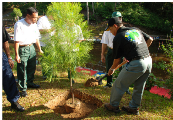
Minister of Industry and Primary Resources plants a tree to mark World Forestry Day 2009.

The climate change inseparable from basic human need, national economy plan, public administration and quality of individual life, family, society and its beyond the bounds of science and technology which converge to ethical issue.