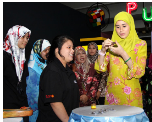
HRH takes a closer look at one of the exhibits at the Oil and Gas Discovery Centre.

OGDC was officially opened by His Majesty The Sultan and Yang Di-Pertuan of Brunei Darussalam on September 14, 2002.