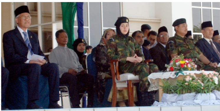
Her Royal Highness attends the launching of UNISSA Army Cadet Team.

TUNGKU, April 22 – Universiti Islam Sultan Sharif Ali (UNISSA) became the second university to form the Army Cadet Team at the higher education institution that involves women platoon.