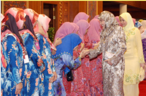
10 Royalty grace special gathering celebrate Maulud