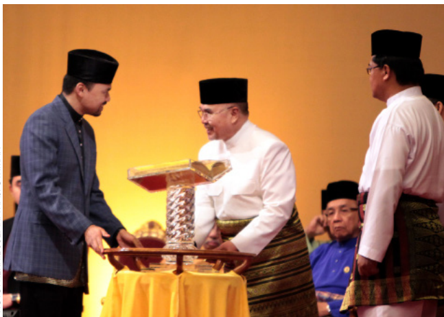
His Royal Highness The Crown Prince receives pesambah .

BERAKAS, March 31 – By the consent of His Majesty The Sultan and Yang Di-Pertuan of Brunei Darussalam, March 31 has been declared as 'Hari Adat Istiadat' or Customs and Traditions Day.