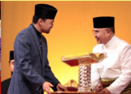
11 March 31 declared 'Hari Adat Istiadat'