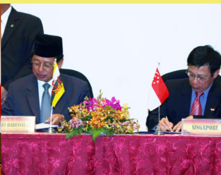
16 Brunei-Singapore sign MoU on cooperation