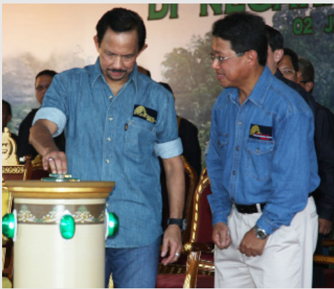
7 Paddy project for self-sufficiency