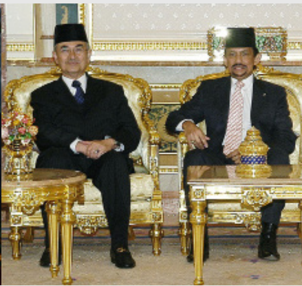
2 His Majesty receives audience from Malaysian Prime Minister