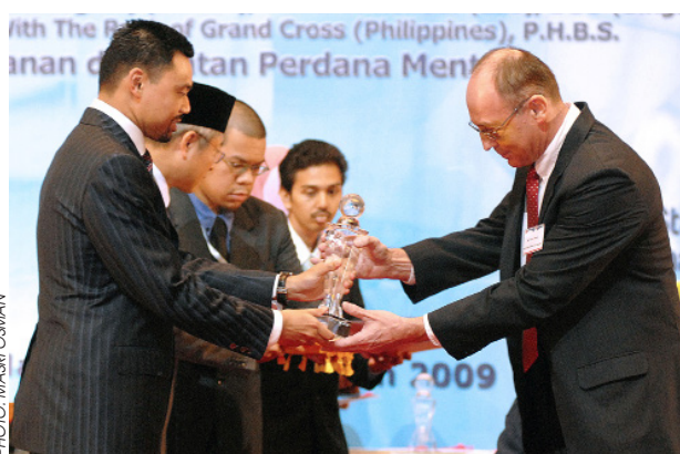
One of the winners receive a trophy from His Royal Highness The Crown Prince.

JERUDONG, March 14 - His Royal Highness Crown Prince Pengiran Muda Haji Al-Muhtadee Billah presented prizes to Crown Prince's Creative, Innovative Product and Technological Advancement (CIPTA) Award 2009, held at the Empire Hotel and Country Club.