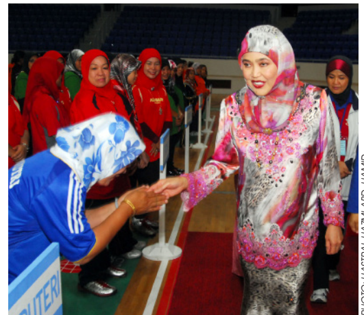
Competing teams are introduces to Her Majesty The Raja Isteri.

The 9 th Brunei Darussalam Women Council Patron's Trophy Championship was organised by the Welfare Body of Wives of Royal Brunei Armed Forces (BAKTI) to enhance the quality of the badminton sport and to bring forth potential players to represent the council at championships, locally and abroad.