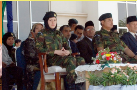
11 UNISSA forms Army Cadet Team