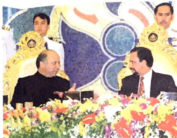
His Majesty and His Excellency Mohammad Nawaz Sharif in the midst of conversation during the banquet.