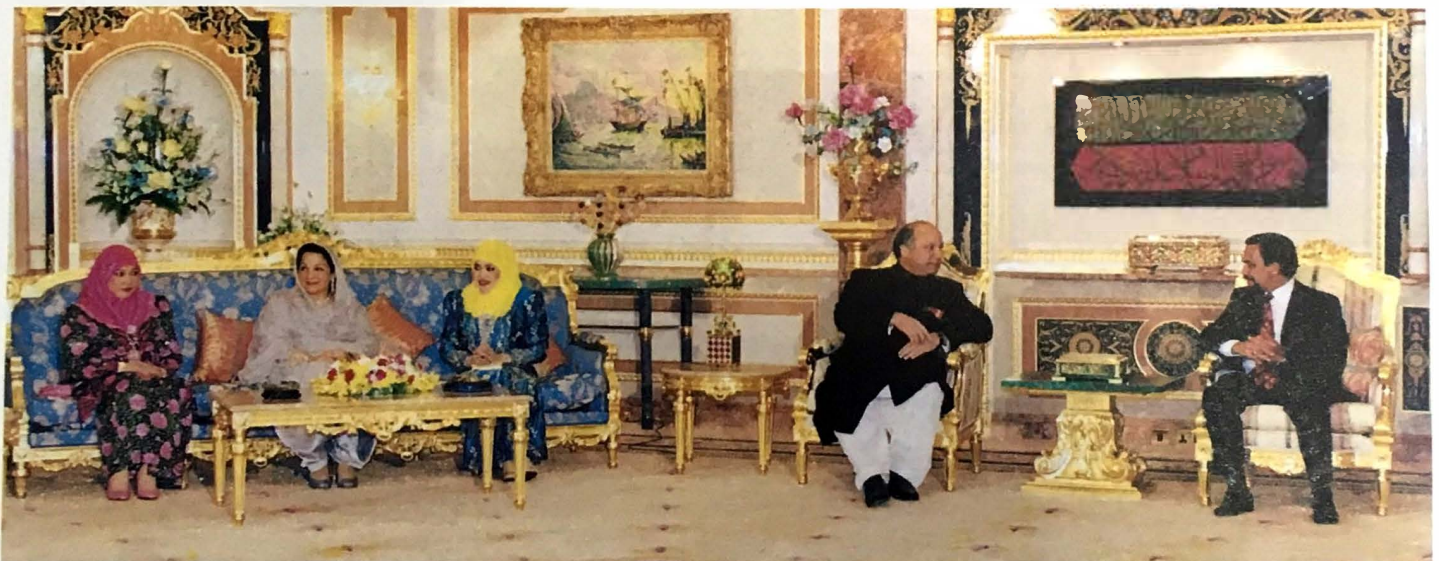
His Majesty Paduka Seri Baginda Sultan Haji Hassanal Bolkiah Mu'izzaddin Waddaulah, Sultan and Yang Di-Pertuan of Brunei Darussalam, Her Majesty Paduka Seri Baginda Raja Isteri Pengiran Anak Hajjah Saleha and Her Royal Highness Pengiran Isteri Hajjah Mariam granting an audience to Pakistani's Prime Minister, His Excellency Mohammad Nawaz Sharif and wife, Begum Kulsoom Nawaz Sharif at Nurul Iman Palace.