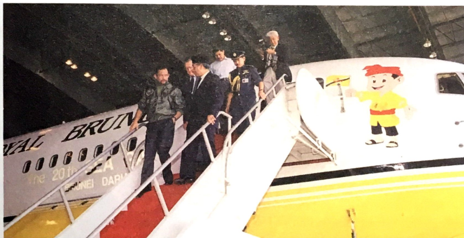
His Majesty the Sultan and Yang Di-Pertuan of Brunei Darussalam visited and observed the interior of one of the airline's aircrafts.

His Majesty also visited the cabin crew section and watched a safety and