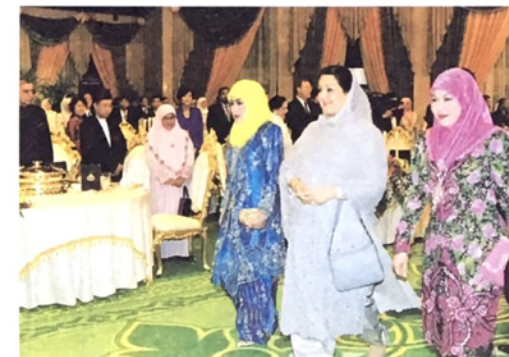
Her Majesty, Her Royal Highness and Begum Kulsoom Nawaz Sharif walk past guests as they leave the Banquet.

"We have prospered before and we will prosper again, Insya Allah."