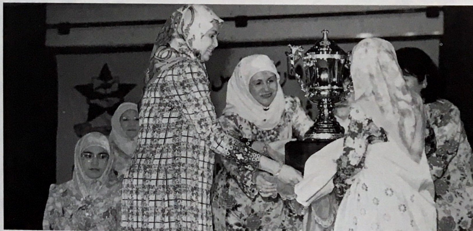
Her Royal Highness Princess Hajjah Rashidah Sa'adatul Bolkiah presenting Model Mother Award to Dayang Hajjah Hajibah bte Umar. The Award was in conjunction with the Brunei Darussalam's Women Council Day this year.

The Model Mother Award, conducted for the first time by the Council was aimed at respecting and appreciating mothers' contribution. It does not only help to promote the status of mothers, but also to honour mothers' attitude of resiliency which should be emulated by the young generation.