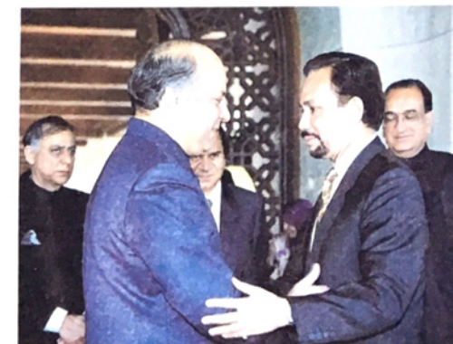
His Majesty bidding farewell to His Excellency Mohammad Nawaz Sharif, the Pakistani Prime Minister, at the end of the latter's three-day visit to Brunei Darussalam.