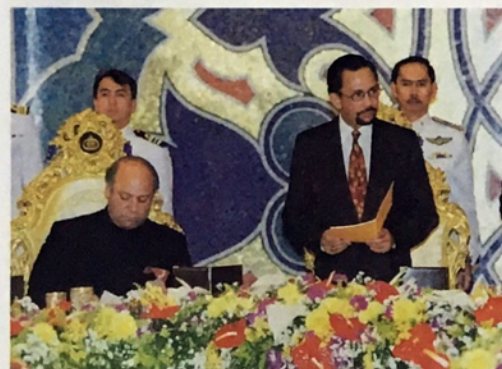
His Majesty delivering his titah during the banquet held in honour of the Pakistani Prime Minister at Nurul Iman Palace (left). His Majesty and His Excellency Mohammad Nawaz Sharif during their audience (picture below).