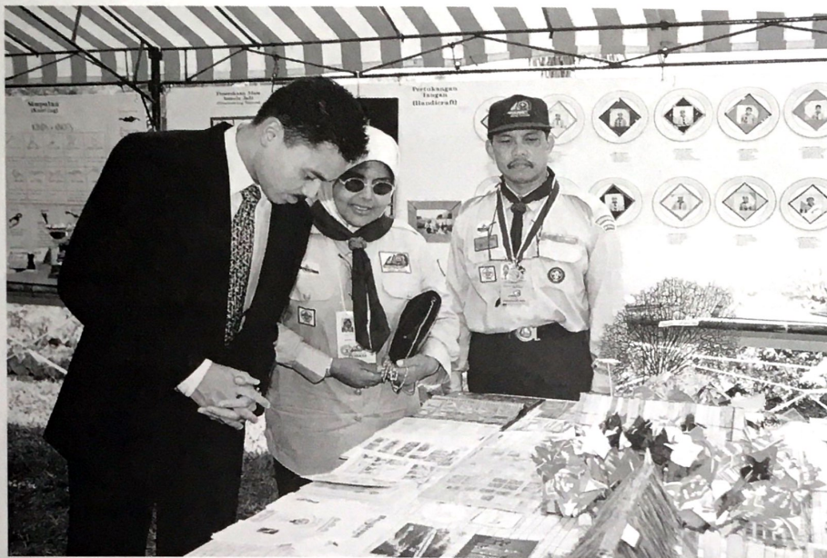
His Royal Highness Crown Prince Haji Al-Muhtadee Billah taking a close look at an exhibition on activities of members of the Scout Associations at the 3rd National Jamboree.

His Royal Highness Crown Prince Haji Al-Muhtadee Billah has said the success of an organisation relies upon specific factors such as proper and well-organised plannings, as well as a dynamic leadership and having vision.