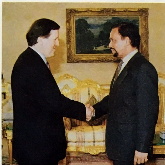
His Majesty Paduka Seri Baginda Sultan Haji Hassanal Bolkiah Mu'izzaddin Waddaulah, Sultan and Yang Di-Pertuan of Brunei Darussalam receiving the British Secretary of State for Defence, Mr. George Robertson in audience at Istana Nurul Iman.

rate audiences by Her Majesty Paduka Seri Baginda Raja Isteri Pengiran Anak Hajjah Saleha and Her Royal Highness Pengiran Isteri Hajjah Mariam at Istana Nurul Iman and Istana Nurul Izzah respectively.