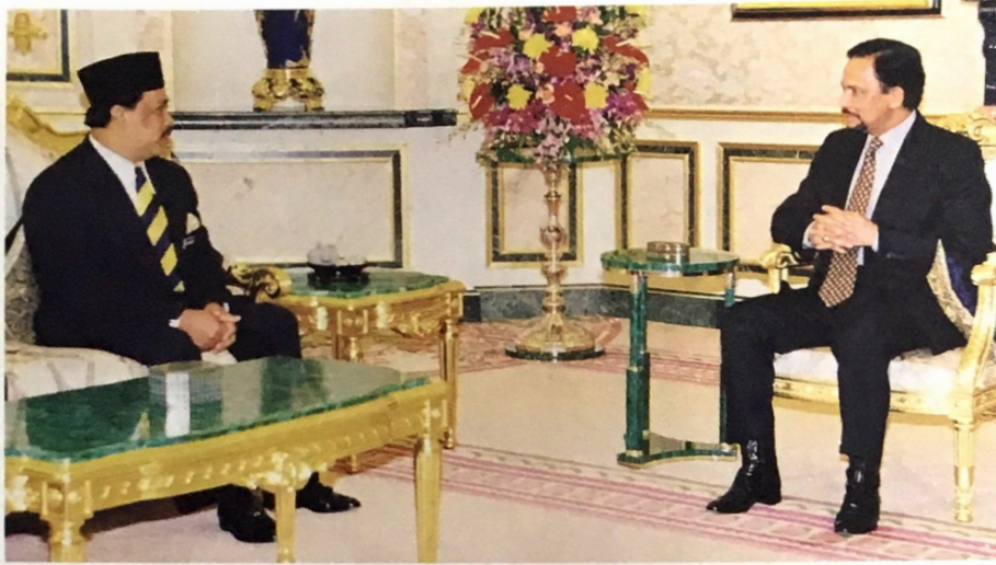
His Majesty Paduka Seri Baginda Sultan Haji Hassanal Bolkiah Mu'izzaddin Waddaulah, Sultan and Yang Di-Pertuan of Brunei Darussalam granting an audience to the visiting Malaysian Minister of Youth and Sports Yang Berhormat Tan Sri Dato Haji Muhyiddin at Istana Nurul Iman, above, while His Royal Highness Prince Haji Sufri Bolkiah received Yang Berhormat Tan Sri Dato Haji Muhyiddin, at Baitul Afiah in Jerudong, below.