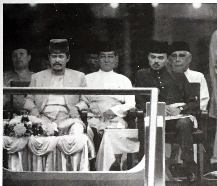
Left: His Royal Highness Paduka Seri Duli Pengiran Muda Haji Al-Muhtadee Billah and His Royal Highness Paduka Seri Pengiran Perdana Wazir Sahibul Haimmah Wal Waqar Pengiran Muda Haji Mohamed Bolkiah at the Koran Reading Competition.

The competition was the thirty second to be held at national level annually.