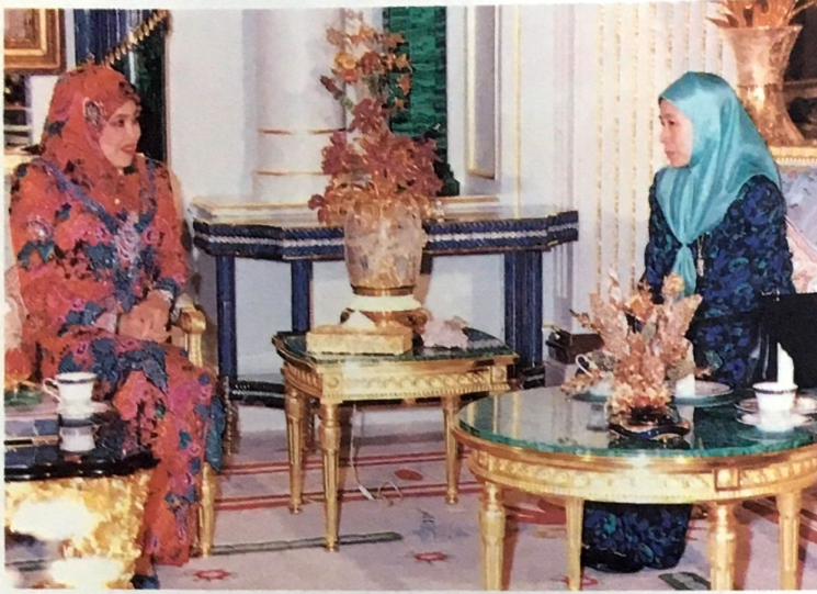
Yang Amat Berbahagia Datin Seri Dr. Wan Azizah Ismail during her audiences with Her Majesty Paduka Seri Baginda Raja Isteri Pengiran Anak Hajjah Saleha at Istana Nurul Iman on January 17 (picture above left), and with Her Royal Highness Pengiran Isteri Hajjah Mariam at Istana Nurul Izzah the same day.