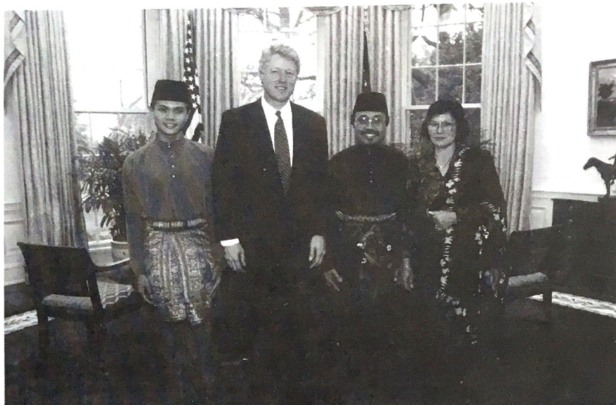
The Sultan and Yang Di-Pertuan of Brunei Darussalam to his latest posting in last November, was previously