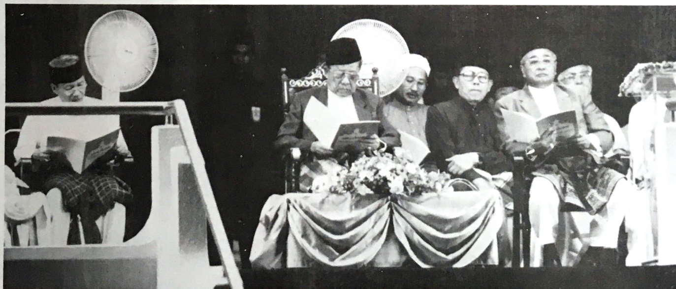
Above: Some of the pengiran-pengiran cheteria, cabinet ministers and dignitaries who were among the large number of people who filled the Taman Haji Sir Omar Ali Saifuddin in the capital watching the competition.