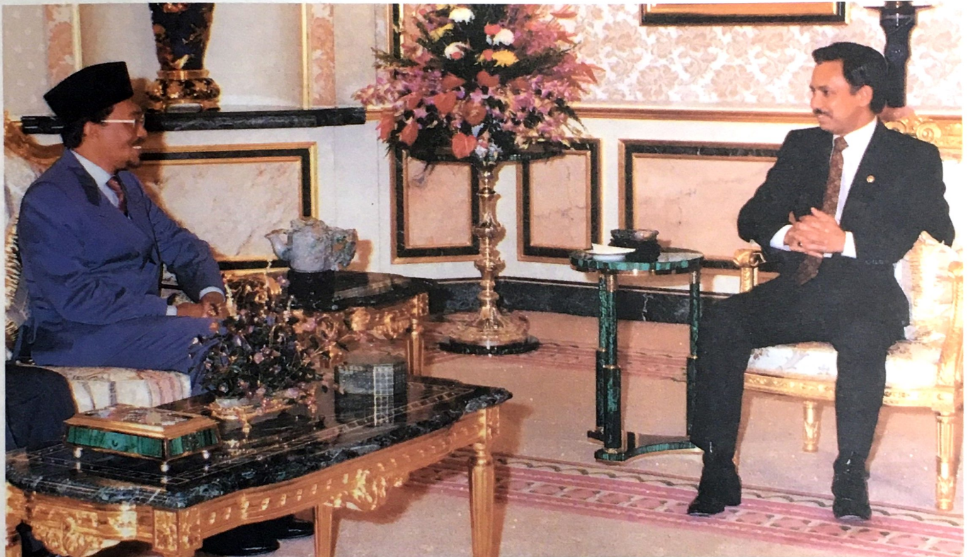
His Majesty The Sultan and Yang Di-Pertuan of Brunei Darussalam in conversation with the Deputy Prime Minister of Malaysia, Yang Amat Berhormat Dato' Seri Anwar Ibrahim, who had an audience with the ruler at Istana Nurul Iman on January 17.

B ilateral issues between Brunei Darussalam and Malaysia, in particular on upgrading their economic cooperation, were under discussion earlier this month between His Majesty Paduka Seri Baginda Sultan Haji Hassanal Bolkiah Mu'izzaddin Waddaulah, Sultan and Yang Di-Pertuan of Brunei Darussalam and Yang Amat Berhormat Dato' Seri Anwar Ibrahim.