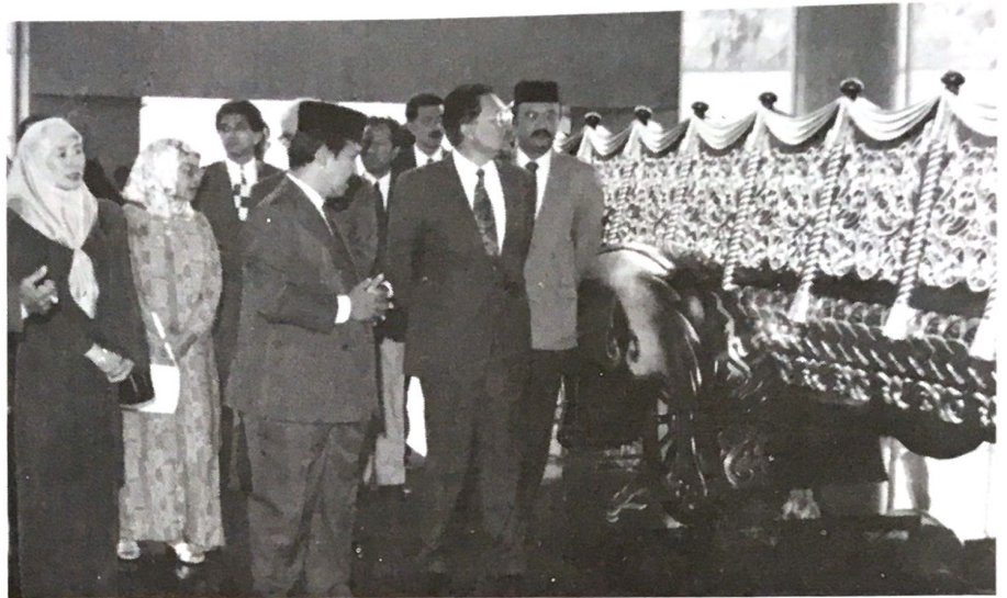
Brunei Museum officials brief the Malaysian Deputy Prime Minister as he and his wife toured the Royal Regalias building in Bandar Seri Begawan as part of their itinerary during their two day official visit.