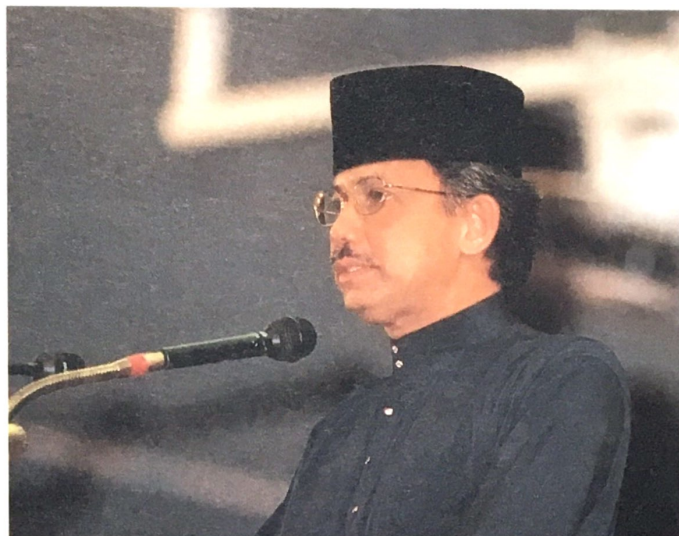
His Majesty The Sultan and Yang Di-Pertuan of Brunei Darussalam delivering his titah (royal address) shortly before presenting prizes at the National Koran Reading competition.

They are aware that the strength of their countries depend on a great deal on the strength of the economy. If the economy is weak, not many development efforts could be carried out, stressed His Majesty Paduka Seri Baginda Sultan