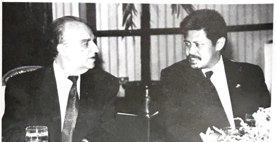
His Excellency Alija Izetbegovic being entertained to a dinner by His Royal Highness Paduka Seri Pengiran Perdana Wazir Sahibul Himmah Wal-Waqar Pengiran Muda Haji Mohamed Bolkiah on behalf of His Majesty.

The two Governments have agreed to develop friendly relations and cooperation between the two countries on the basis of the principles enshrined in the Charter of the United Nations."