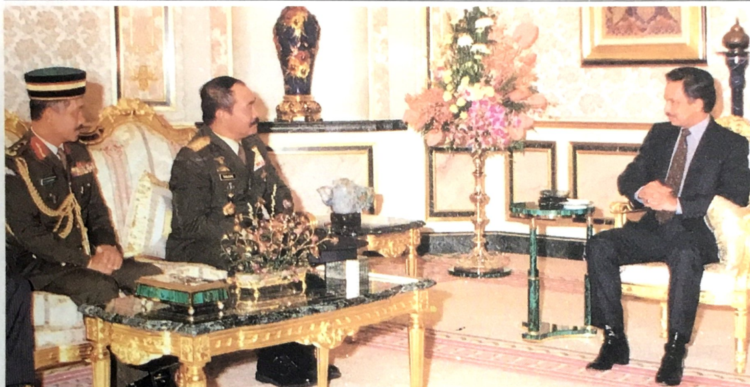
Left: His Majesty The Sultan and Yang Di-Pertuan of Brunei Darussalam in discussion with the Chief of the Indonesian Armed Forces while the Commander of the Royal Brunei Armed Forces looks on.