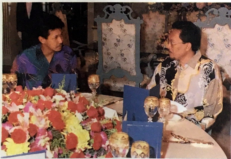
Right: The Malaysian Deputy Prime Minister paying a courtesy call on His Royal Highness Prince Haji Mohamed Bolkiah, Minister of Foreign Affairs at the Balai Penghadapan, Bukit Kayangan in the Brunei Darussalam capital. Above: His Royal Highness Prince Haji Jefri Bolkiah, the Minister of Finance, entertained the Malaysian Deputy Prime Minister at a dinner at the Royal Brunei Golf and Country Club. The prince had earlier led the welcome at the Brunei International airport for the visiting minister.

Yet another memorandum of understanding - this time on the establishment of a joint commission, is expected to be signed. This MOU followed a visit by the Malaysian Prime Minister to Brunei Darussalam last August.