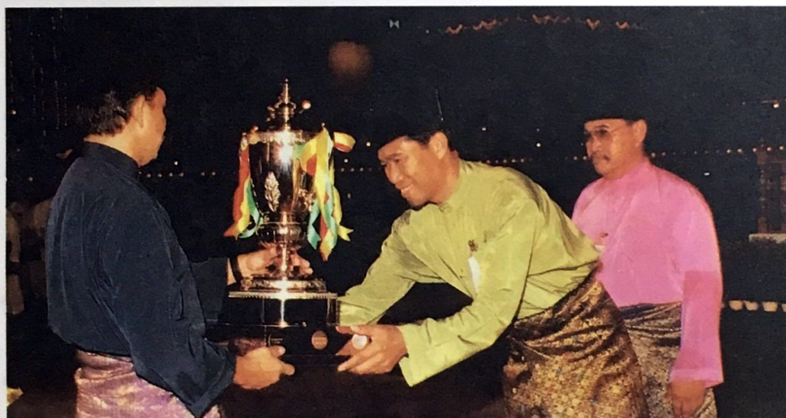
Above and below: The men and women's winners of the National Koran Reading competition receive their prizes from the Brunei monarch. One of the highlights of the competition was a presentation of Koran reading by a guest reader from the Arab Republic of Egypt (picture at right) which also sent judges to the competition alongside Malaysia and Indonesia.