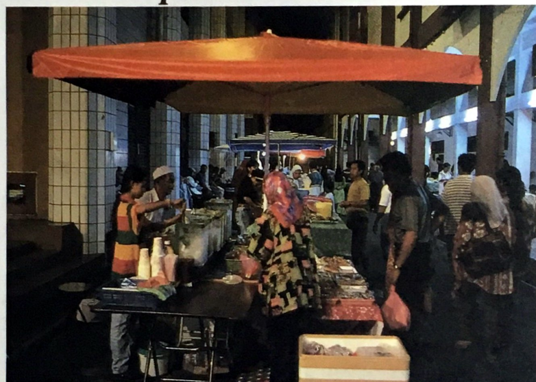
The busy scenes of the weekend open markets, above and right, designed to attract tourists and offer more shopping opportunities to the local people.

T he Commercial Centre and its immediate vicinity in the heart of Bandar Seri Begawan has become a hub of activities, with the introduction on 1 January of the Tamu Hujung Minggu or Weekend Open Markets. Selling a wide variety of goods from food, clothes to live flowers, the Tamu is held from six in the evening to midnight on Saturday, and from six in the morning to midnight on Sunday.