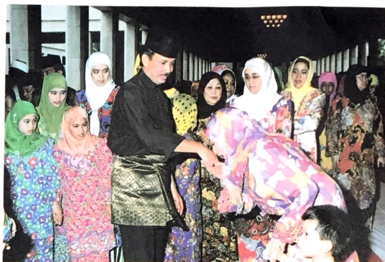
Her Majesty Paduka Seri Baginda Raja Isteri Pengiran Anak Hajjah Saleha and Her Royal Highness Pengiran Isteri Hajjah Mariam (picture above left and above right respectively) kiss His Majesty's hand on the ruler's arrival at the Istana Nurul Iman after his flight from Mecca to perform the haj. His Majesty's daughters and other female members of the royal family did likewise as the ruler walked along the red carpet past each one of them, picture below.