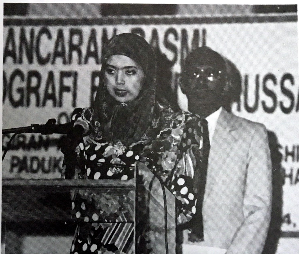
Yang Teramat Mulla Paduka Seri Pengiran Anak Puteri Hajjah Rashidah Sa'adatul Bolkiah urged that developments should take place hand in hand with the conservation of nature and protection of the environment.