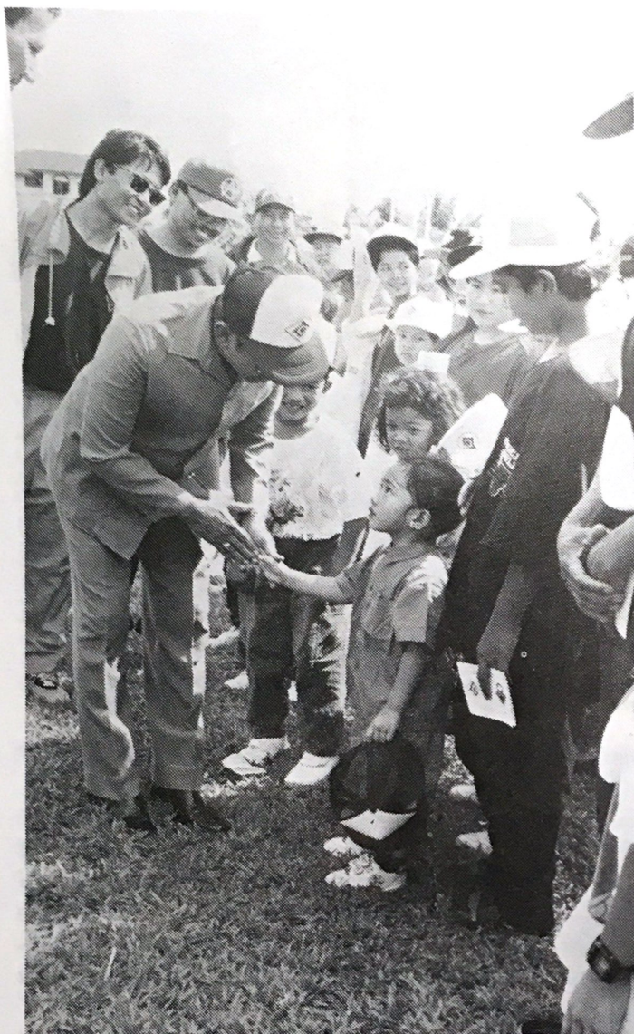
The Minister of Culture, Youth and Sports exchanges words with a youngster from one of the large number of families taking part in activities marking the International Day of the Family on 15 May.

The declaration of the International Day of the Family by the United Nations on May 15 each year, the minister pointed out, reflects the commitment and support of the international community towards the significance of the family institution as an agent for constructive development and change in society.