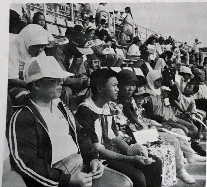
Above left and above right: Families watch from the grandstand as some of their children perform various presentations in conjunction with the International Day of the Family.