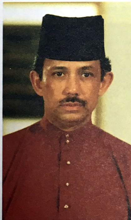
His Majesty Paduka Seri Baginda Sultan Haji Hassanal Bolkiah Mu'izzaddin Waddaulah, Sultan and Yang Di-Pertuan of Brunei Darussalam speaking to the nation over radio and television in conjunction with Hari Raya Aidiladha (Great Day of the Sacrifice) celebration.

atrocities inflicted by the Serbs against a Muslim-majority town in Gorazde, would definitely increase the number of Muslim victims.