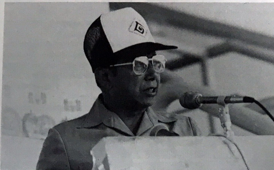
Above: Yang Berhormat Pehin Orang Kaya Digadong Seri Lela Dato Seri Paduka Haji Awang Hussain, The Minister of Culture, Youth and Sports, urged government agencies and non-governmental bodies to work together towards achieving 'happy family' state of affairs in Brunei Darussalam.