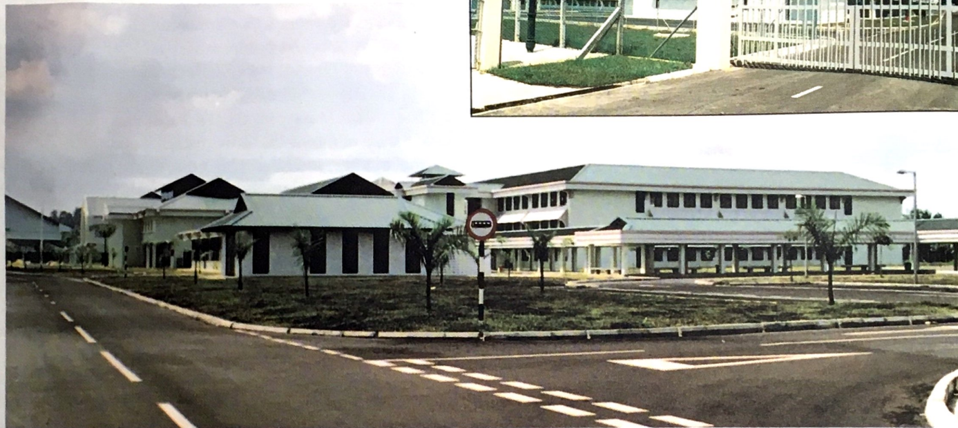
A general view of the Tanjung Bunut Secondary, which is one of many opened recently. Inset: the large assembly hall is among the school's prominent features.

B runei Darussalam's efforts towards meeting its skilled manpower requirements have been intensified, particularly since it assumed full responsibility as a fully independent and sovereign nation on 1 January, 1984.