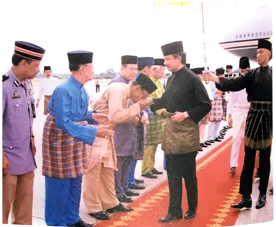
Top picture: His Majesty The Sultan and Yang Di-Pertuan of Brunei Darussalam stands in homage of the do'a shortly after alighting from his aircraft during his homecoming reception at the Brunei International airport after performing the haj in Mecca. His Majesty's eldest son, His Royal Highness Paduka Seri Duli Pengiran Muda Haji Al-Muhtadee Billah (to HM's right) led the welcoming party. Above: The ruler being greeted by state dignitaries who lined the tarmac, while thousands of schoolchildren lined the route from the airport to the Istana Nurul Iman to give their monarch a warm homecoming.