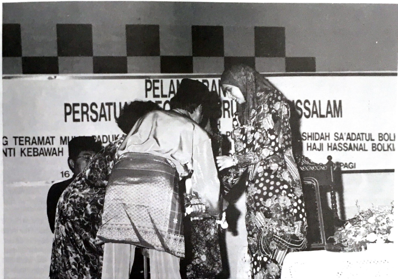
Yang Teramat Mulla Paduka Seri Pengiran Anak Puteri Hajjah Rashidah Sa'adatul Bolkiah ceremonially conducting the official launching of Brunei Darussalam's Geography Association, of which she is patron.

Development should be carried out hand in hand with conserving nature.