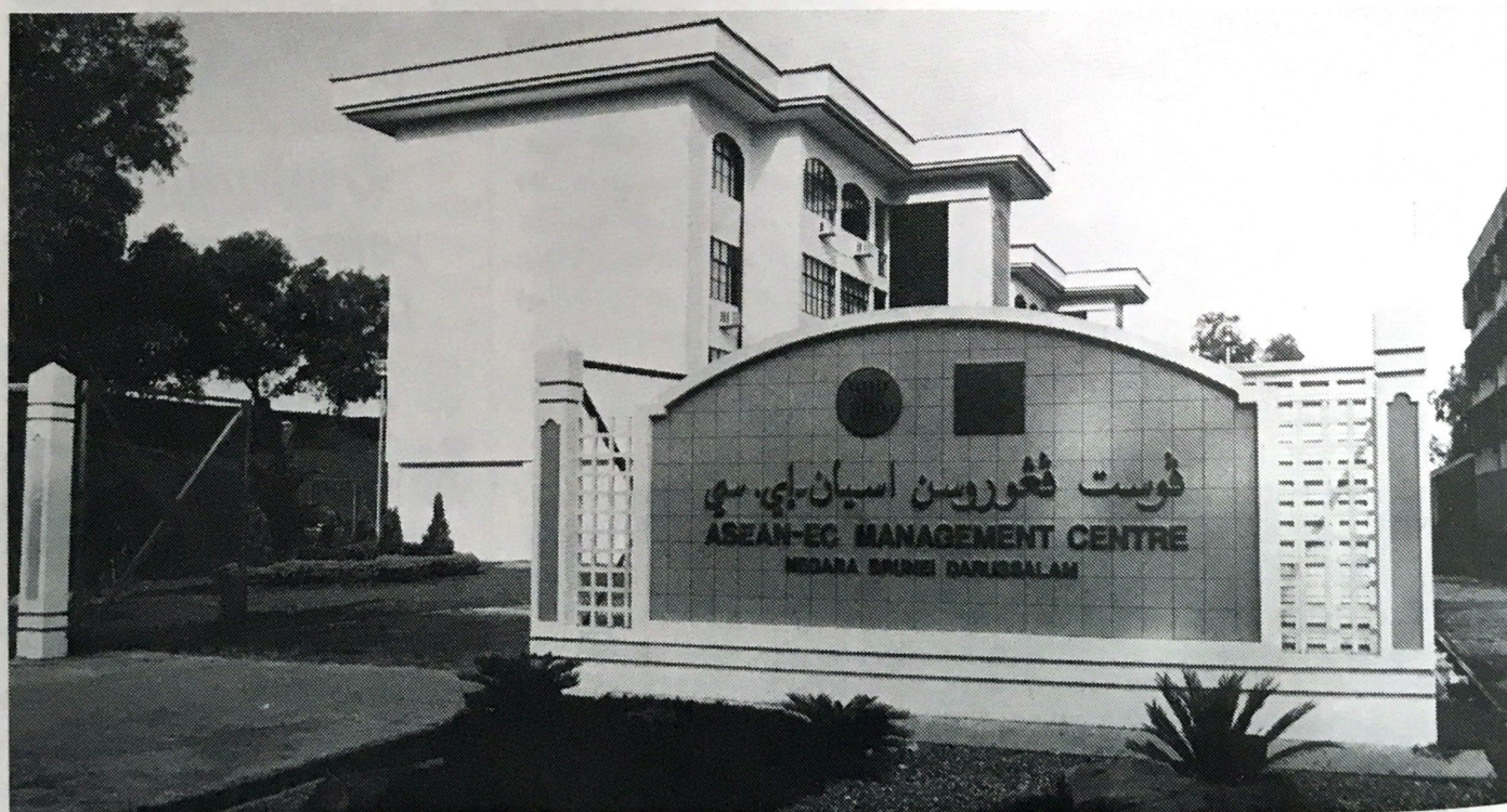
The ASEAN-EC Management Centre, opened officially on 11 May, is the product of an inter-regional cooperation between the Association of South-East Asian Nations, ASEAN, and the European Union. It is situated at Gadong, about three kilometres outside the Brunei Darussalam capital of Bandar Seri Begawan.