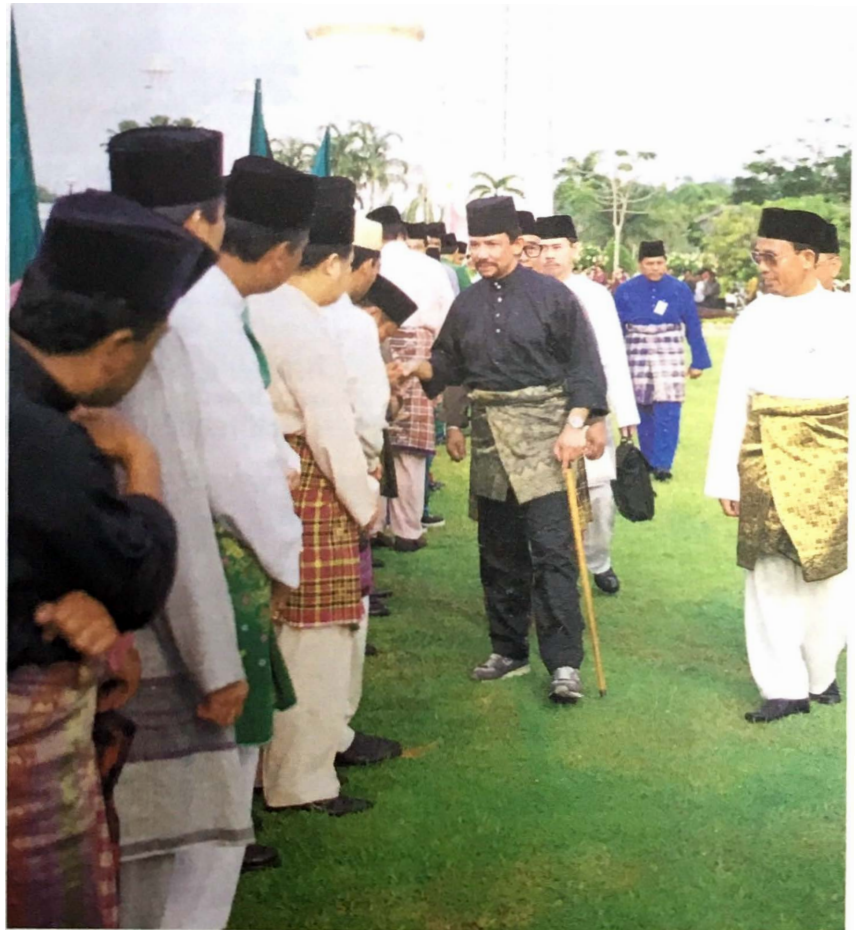
His Majesty Paduka Seri Baginda Sultan Haji Hassanah Bolkiah Mu'izzaddin Waddaulah, Sultan and Yang Di-Pertuan of Brunei Darussalam mingles with heads of the participating teams at the Taman Haji Sir Muda Omar 'Ali Saifuddien before a mass procession marking Prophet Muhammad's (peace be upon him) birthday anniversary.