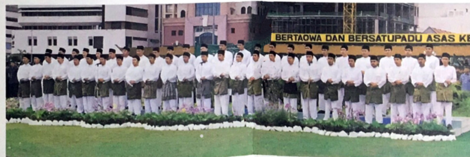
Students of the religious school taking part in the mass procession, above left, and above right, is a 'Zikir Marhaban' (recitation of praises of the prophet) being performed by students of the Seri Begawan Religious Teachers' Training College during the celebration which is also attended by foreign diplomats to Brunei Darussalam, picture right.