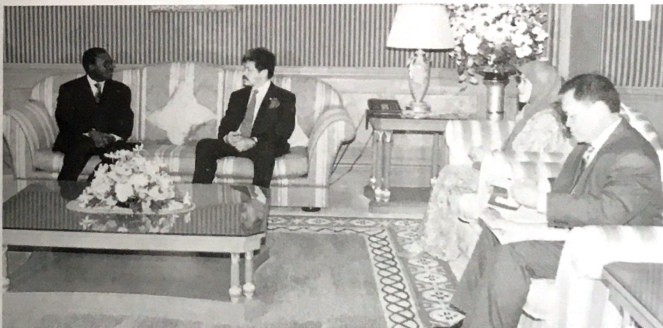
His Royal Highness Prince Mohamed Bolkiah, the Deputy Sultan granting an audience to His Excellency Osho Pierre, the Defence Minister and Acting Minister of Foreign Affairs of the Republic of Benin.

His Excellency was in the country for a five-day visit to enhance bilateral relations and cooperation with Brunei Darussalam.