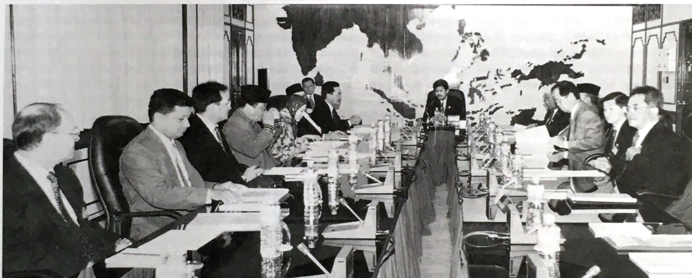
His Royal Highness Prince Mohamed Bolkiah, the Minister of Foreign Affairs chairing the Third Meeting of the Brunei Darussalam Economic Council at the Ministry of Foreign Affairs.

His Majesty's Government was represented by the Minister of Culture, Youth and Sports, the Honourable Pehin Orang Kaya Digadong Seri Lela Dato Seri Paduka Haji Awang Hussain.