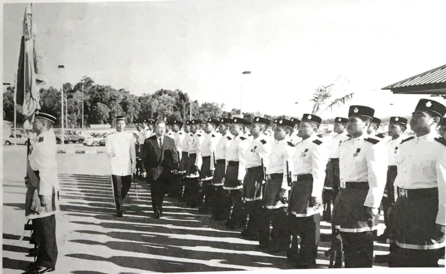
The Deputy Minister of Defence, YAM Pengiran Sanggamara Diraja Major General (R) Pengiran Haji Ibnu Ba'asith, inspecting the guard of honour by members of the Royal Brunei Air Forces.

The Deputy Minister of Defence officiating the new Royal Brunei Air Force's base. The new base costs around $7 million.