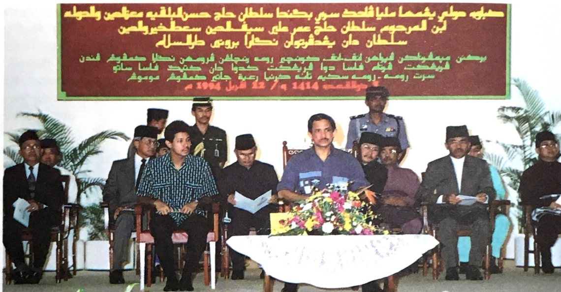
His Majesty The Sultan and Yang Di-Pertuan of Brunei Darussalam and His Royal Highness Prince Haji Jefri Bolkiah at the start of the visit to Mukim Kuala Belait, during which the ruler presented keys to 228 houses to their owners. Below: One of the more than 200 latest recipients of houses under the government's housing provision schemes receiving the key to his house from the monarch. Bottom picture: The monarch talking to a student while he toured the Jefri Bolkiah College of Engineering.

Kampong Pandan in Mukim Belait in the Belait district is just one of many sites selected for both the National Housing Programme and the Housing Scheme for Landless Citizens. In all, at least fourteen sites have been chosen for the two projects throughout the country.