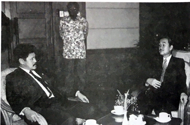
Before attending the first meeting of the Brunei Darussalam-Malaysia Joint Commission, the foreign ministers of the two countries held a 50-minute 'four-eyes' meeting.