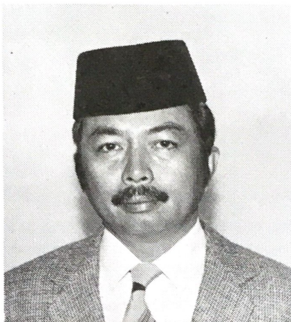
The Health Minister, Yang Berhormat Dato Paduka Dr. Awang Haji Johar bin Dato Paduka Haji Noordin.

The Minister of Health, Yang Berhormat Dato Paduka Dr. Haji Johar bin Dato Paduka Haji Noordin in his speech highlighted the high incidence of people with tooth problems in the country. One of the