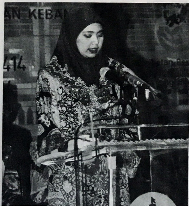
Yang Teramat Mulia Paduka Seri Pengiran Anak Puteri Hajjah Rashidah Sa'adatul Bolkiah, eldest daughter of His Majesty the Sultan and Yang Di-Pertuan of Brunei Darussalam.

Her Royal Highness Paduka Seri Pengiran Anak Puteri Hajjah Rashidah Sa'adatul Bolkiah, the eldest daughter of His Majesty The Sultan and Yang Di-Pertuan of Brunei Darussalam,