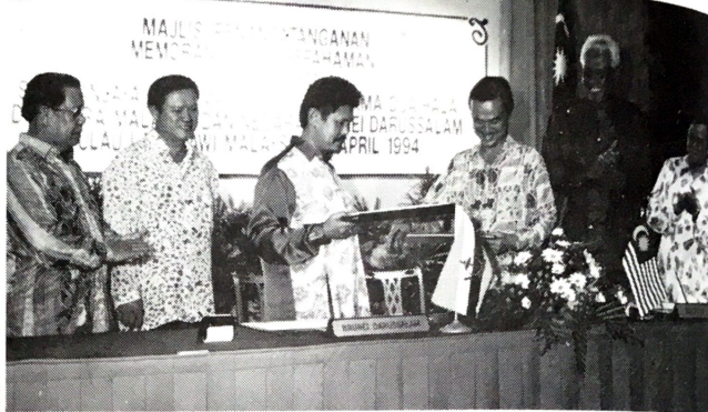
The Foreign Affairs Ministers of Brunei Darussalam and Malaysia exchange documents following the signing of a Memorandum of Understanding, MOU, on the establishment of a Joint Commission For Bilateral Cooperation between the two countries.

The next issue of the Brunei Darussalam newsletter will appear on 15 May 1994. If there are events relating to our country you would like featured in this newsletter please call us on Tel: 02-225941 or better still, send us a report with a picture, if possible. All editorial rights reserved.