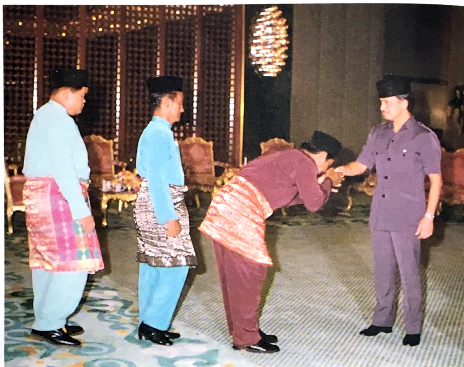
Each of the nearly 3,000 prospective pilgrims filed past and greeted the ruler during an audience before their departures to the holy land.

This year the Bruneian pilgrims are being flown by Royal Brunei