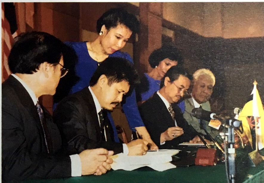
The Brunei Darussalam Foreign Affairs Minister, His Royal Highness Prince Mohamed Bolkiah and his Malaysian counterpart, Datuk Abdullah Haji Ahmad Badawi signing the agreed minutes of the first meeting of the Brunei-Malaysia Joint Commission For Bilateral Cooperation.

B runei Darussalam and Malaysia have established a joint commission for bilateral cooperation.