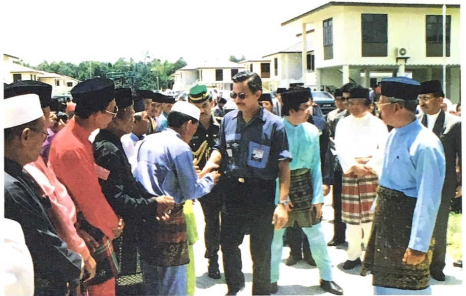
Loyal subjects crowd their beloved ruler as he toured the housing scheme shortly after he presented the keys to the owners of the houses.