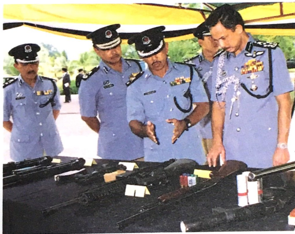
Above: His Majesty The Sultan and Yang Di-Pertuan of Brunei Darussalam inspected a guard of honour on arrival at the Royal Brunei Police Force during his latest visit. Apart from the drills (bottom left), an assortment of weapons was on display (left).