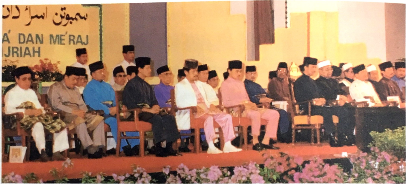
His Majesty flanked to his right by His Royal Highness Paduka Seri Duli Pengiran Muda Haji Al-Muhtadee Billah (HM's eldest son) and two brothers, Their Royal Highnesses Paduka Seri Pengiran Perdana Wazir Sahibul Himmah Wal-Waqar Pengiran Muda Haji Mohamed Bolkiah and Paduka Seri Pengiran Digadong Sahibul Mal Pengiran Muda Haji Jefri Bolkiah on the dais along with pengiran-pengiran cheteria, cabinet ministers and other state dignitaries during the celebration.