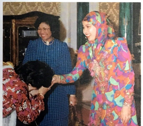
The Malaysian International Trade and Industry Minister also had separate audiences on January 11 with Her Majesty Paduka Seri Baginda Raja Isteri Pengiran Anak Hajjah Saleha at Istana Nurul Iman (picture above left), and with Her Royal Highness Pengiran Isteri Hajjah Mariam at Istana Nurul Izzah.