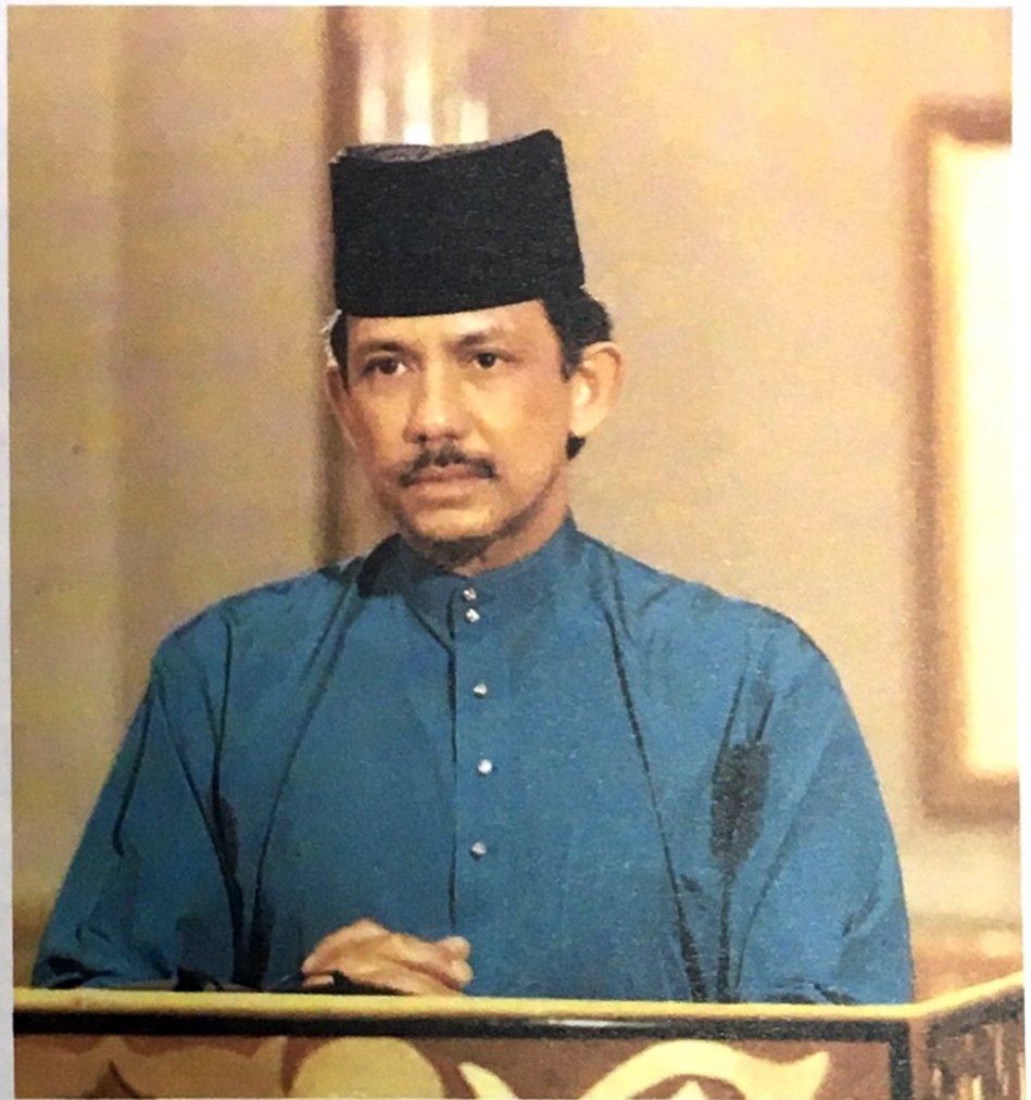
His Majesty Paduka Seri Baginda Sultan Haji Hassanal Bolkiah Mu'izzaddin Waddaulah, Sultan and Yang Di-Pertuan of Brunei Darussalam delivering his New Year 1994 address to the nation over radio and television on New Year's eve.

In this respect, ASEAN has established its Free Trade Area, AFTA, which demonstrates that ASEAN is a regional organisation that genuinely supports free trade not only among its member countries, but with other regions as well, His Majesty stressed while adding that, apart from being beneficial to all, it will also