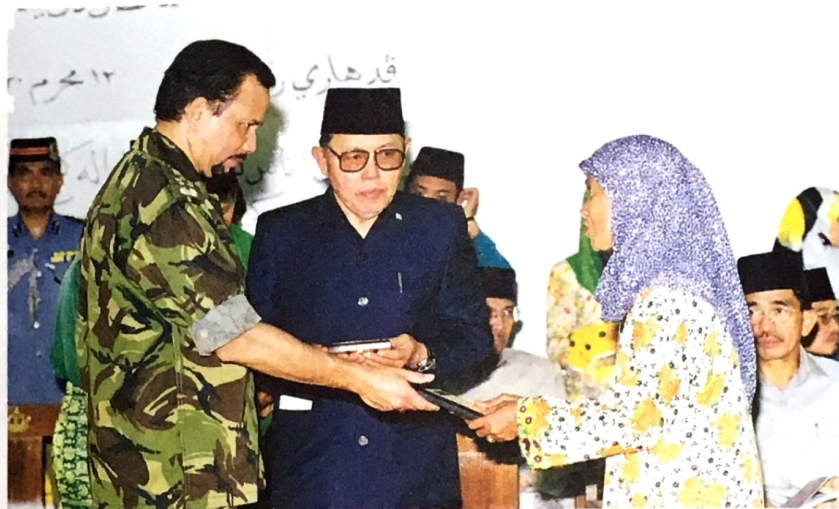
His Majesty Paduka Seri Baginda Sultan Haji Hassanal Bolkiah Mu'izzaddin Waddaulah, Sultan and Yang Di-Pertuan of Brunei Darussalam presenting a house key to one of the recipients of the Housing Scheme of the Sultan Haji Hassanal Bolkiah Foundation.

After presenting the keys, His Majesty watched an exhibition on various aspects of the scheme, followed by a visit to the nearby Kampong Selangan Primary School. His Majesty also went to the houses of the 14 recipients, who reside in nine different villages and