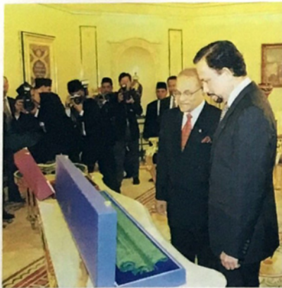
• From page one (Maldives President on state visit to Sultanate)

dent's visit was a renewal of friendship and strengthening of relations between the two countries.