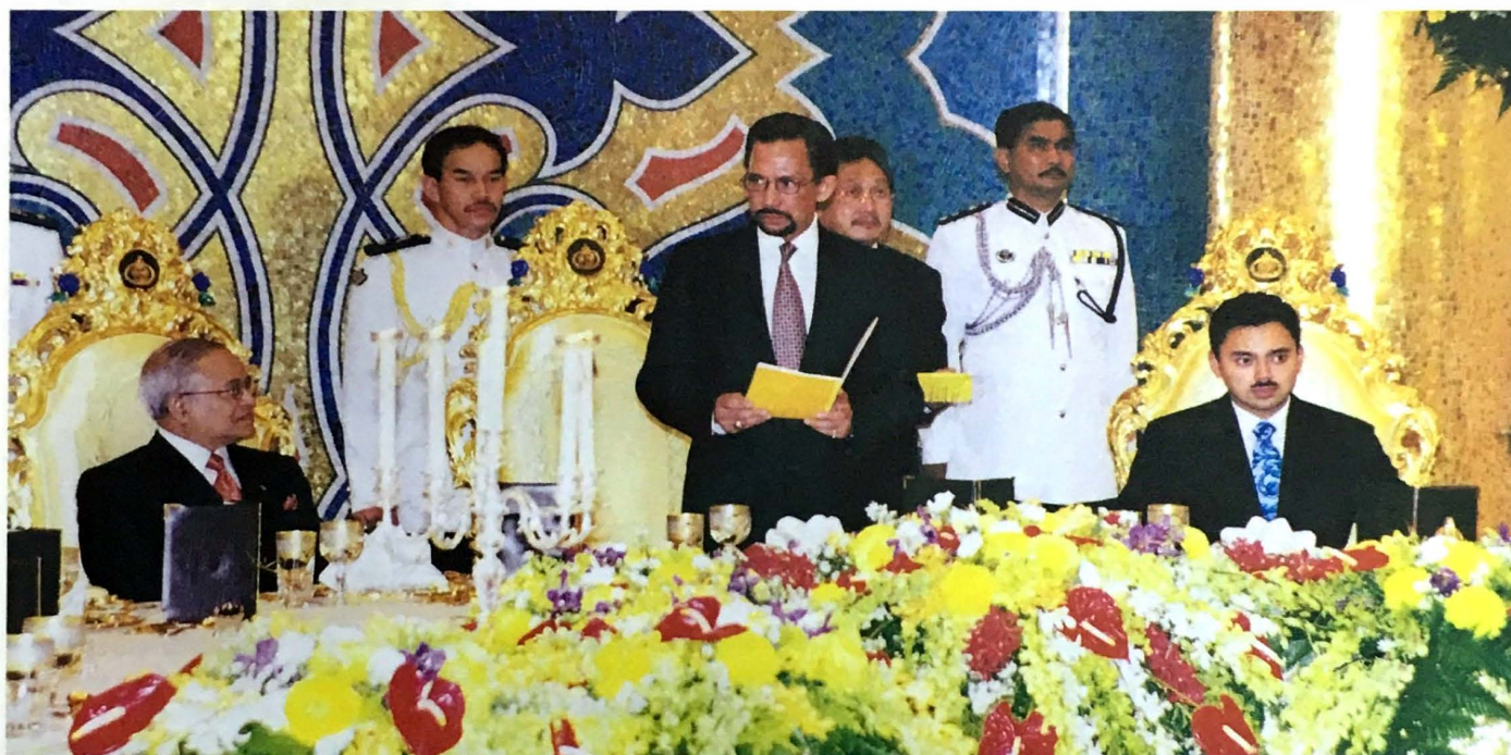
His Majesty Sultan Haji Hassanal Bolkiah Mu'izzaddin Waddaulah, Sultan and Yang Di-Pertuan of Brunei Darussalam delivering a 'titah' during a state banquet at Istana Nurul Iman in honour of His Excellency President Maumoon Abdul Gayoom of the Republic of Maldives, (seated on His Majesty's right) while His Royal Highness Crown Prince Haji Al-Muhtadee Billah on right of picture.