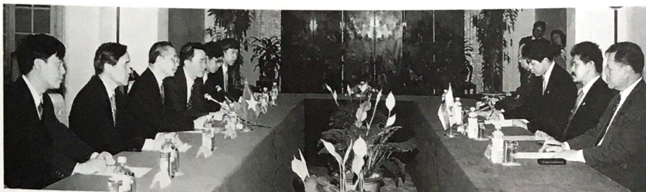
HRH Prince Mohamed Bolkiah, the Foreign Affairs Minister, holding an official discussions with the Deputy Prime Minister and Minister of Foreign Affairs of Vietnam, His Excellency Mr. Nguyen Manh Cam (picture left).