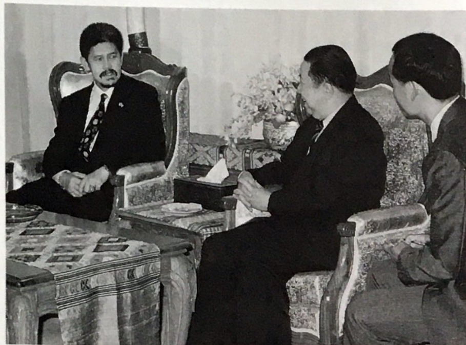
During a two-day working visit to the Lao People's Democratic Republic, HRH Prince Mohamed Bolkiah, the Minister of Foreign Affairs, met the Laotian Prime Minister, His Excellency Sisavath Keabounpanh (left).

Picture below shows His Royal Highness being greeted by His Excellency Mr. Somsavat Lengsavad at a dinner hosted by His Excellency and wife during his working visit to the Lao People's Democratic Republic, and being welcomed by the Singapore Prime Minister, His Excellency Mr. Goh Chok Tong when he calls on His Excellency at the Prime Minister's Office during his working visit to Singapore ( picture bottom of page).