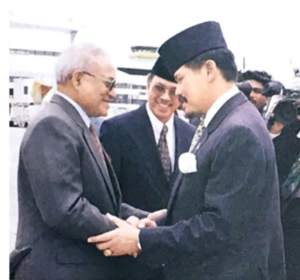
• From page 6

tanate views the need to protect and preserve the environment very seriously.