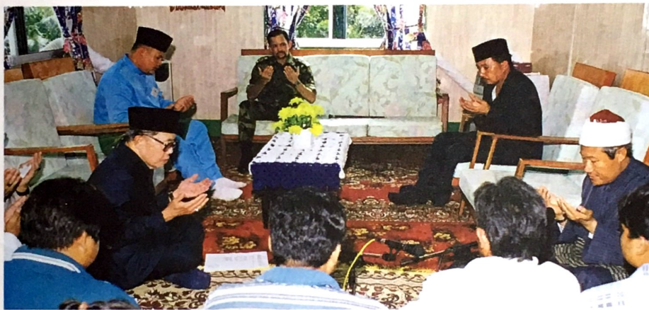
A thanksgiving prayer being read by the State Mufti after two families of 14 embrace the Islamic faith before His Majesty the Sultan and Yang Di-Pertuan of Brunei Darussalam.