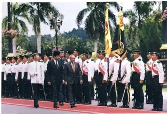
His Majesty Sultan Haji Hassanal Bolkiah Mu'izzaddin Waddaulah, Sultan and Yang Di-Pertuan of Brunei Darussalam accompanying His Excellency President Maumoon Abdul Gayoom of the Republic of Maldives as the visiting leader inspects a guard of honour at the courtyard of Istana Nurul Iman, left. The Brunei monarch and the visiting president exchanging mementos before proceeding to the banquet hall of Istana Nurul Iman (picture below and below right).