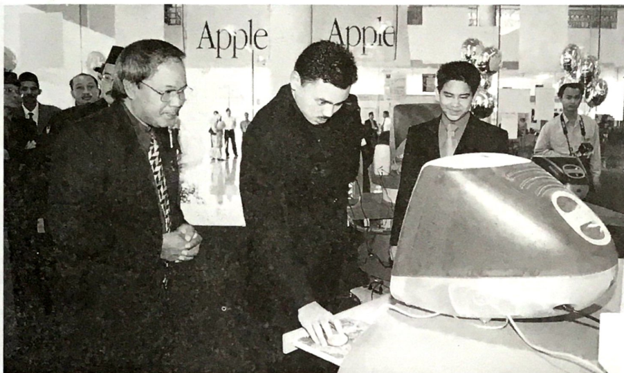
His Royal Highness Crown Prince Haji Al-Muhtadee Billah tries to operate one of the computers displayed at BITEK '99, while His Royal Highness Prince Haji 'Abdul 'Azim looks on.

munity needs to be cautious in selecting good values through information technology facilities.