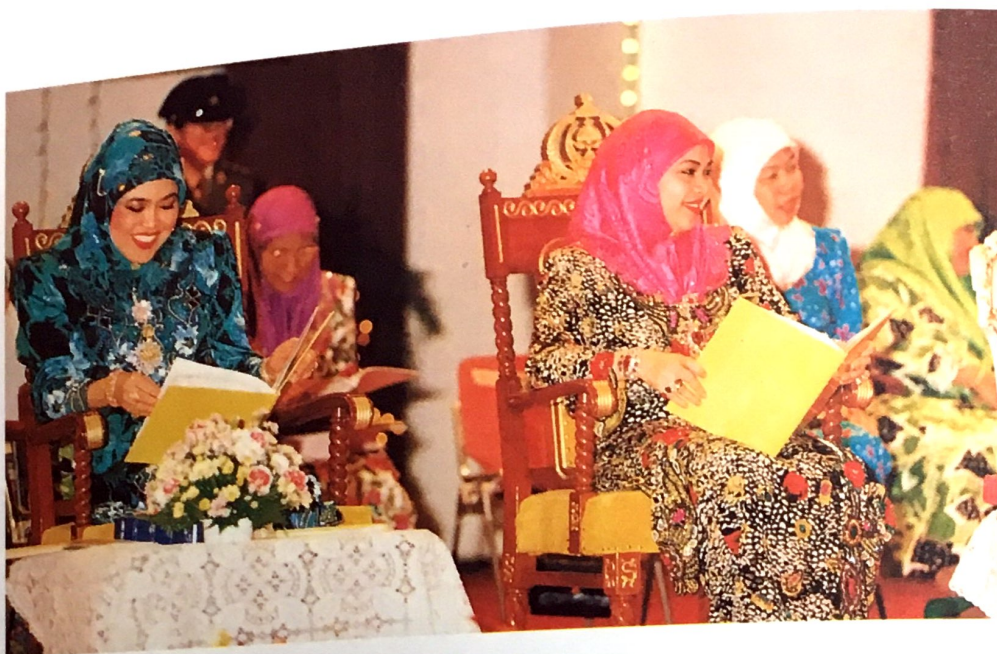
Left: Her Majesty Paduka Seri Baginda Raja Isteri Pengiran Anak Hajjah Saleha and Her Royal Highness Pengiran Isteri Hajjah Mariam at the start of the competition.