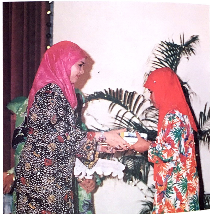
Above left and above right: Her Majesty and Her Royal Highness presenting prizes and souvenirs to the winners and other participants of the competition.

H er Majesty Paduka Seri Baginda Raja Isteri Pengiran Anak Hajjah Saleha and Her Royal Highness Pengiran Isteri Hajjah Mariam have attended a Koran reading competition among associations affiliated to the Brunei Darussalam Women's Council.