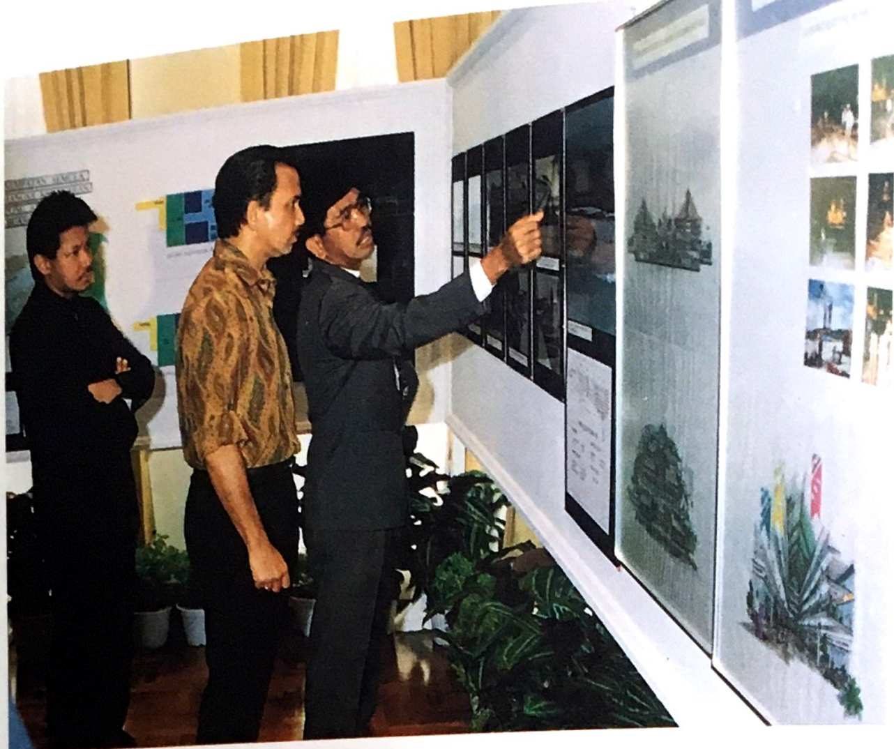
Left: Briefed by the Minister of Development, Yang Berhormat Pengiran Dato Seri Paduka Dr. Haji Ismail, His Majesty and His Royal Highness Prince Haji Jefri Bolkiah look at an exhibit on display as part of an exhibition on the foundation and the Kampung Buang Sakar Housing project, which the monarch later toured (picture below).