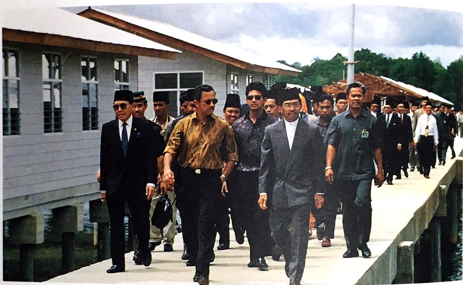
His Majesty also visited the site of a fire which destroyed more than 70 houses in three villages on Kampung Ayer two days earlier (bottom picture). There the ruler met some of the fire victims.