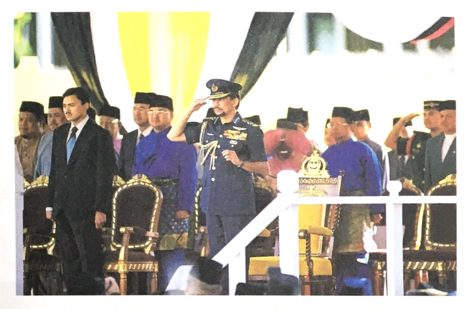
His Majesty Paduka Seri Baginda Sultan Haji Hassanal Bolkiah Mu'izzaddin Waddaulah, Sultan and Yang Di-Pertuan Negara Brunei Darussalam consented to receive a salute from the participants marching pass the royal dias.

This year's National Day celebration began with a mass parade in centre of the capital staged by 17,000 participants representing various ministries and departments including youth associations and private sectors. The parade was preceded by an oath read-