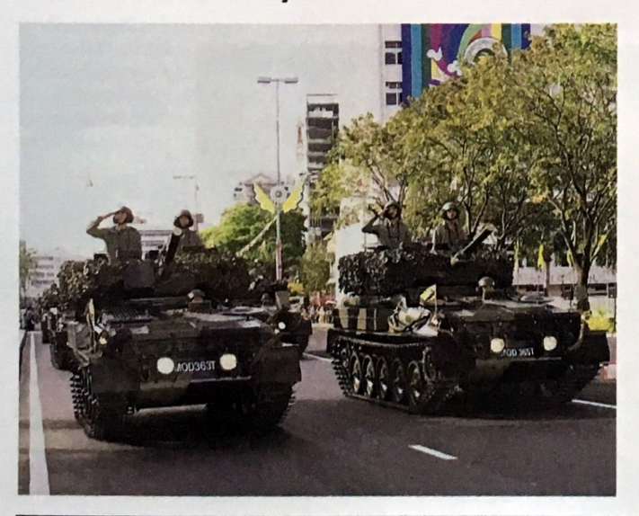
The defence forces with their armoured vehicles also one of the interesting features of the day's celebration, left. Age is not the limit. The children scout also joins the mass parade in an effort to culcate the spirit of patriotism amongst them, below.