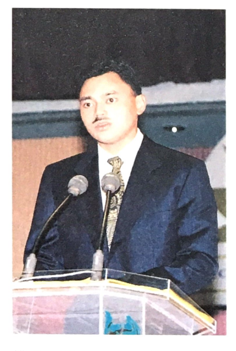
His Royal Highness Crown Prince Haji Al-Muhtadee Billah addresses delegates at the opening of the Pan-Commonwealth Forum on open learning.

The forum marked the 10th anniversary of the formation of COL,