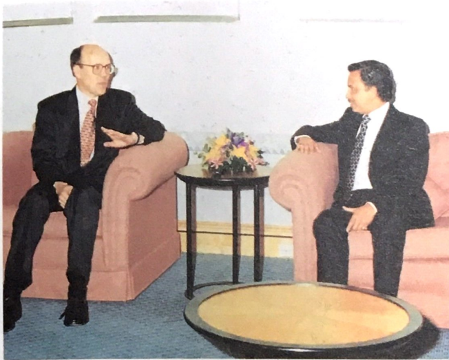
From page 6 (Brunei - New Zealand)