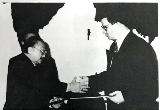
Brunei's Deputy Foreign Affairs Minister, Dato Paduka Awang Haji Mohd. Ali exchanging statement with First Deputy Foreign Minister of Czech Republic, His Excellency Alexandra Vondra on Brunei-Czech Republic diplomatic relations establishment.

The exchange of statement on the establishment of diplomatic relations took place on 3 April, 1995.