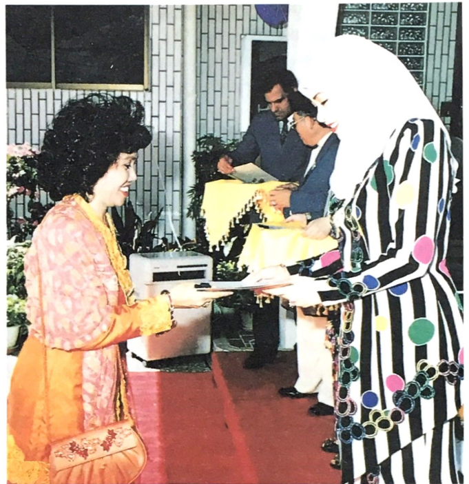
Above right: Her Royal Highness Pengiran Isteri Hajjah Mariam presents certificate to a representative of a businessman who had earlier made a donation to the centre. Right: Her Royal Highness and other members of the royal family watching a demonstration of the braille, and below, Her Royal Highness watches a handicapped child working on the computer.

numerous activities organised by its committee. Some are even taught professional skills, while others are active in participating in sports meets for the handicapped, both at regional and international levels.