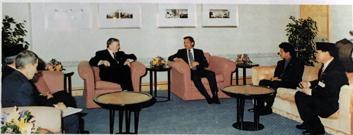
His Majesty granted an audience to New Zealand's Prime Minister, the Rt. Hon. James Bolger at which they had wide-ranging discussions. His Royal Highness Prince Haji Jefri Bolkiah was also present, as were senior officials from both sides.