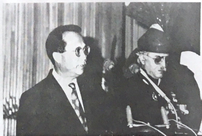
The Communications Minister, Dato Seri Laila Jasa Awang Haji Zakaria, flanked by Pakistan's High Commissioner in Bandar Seri Begawan, speaking during the republic's National Day celebration.

Presently a large number of Pakistani nationals work in Brunei Darussalam, in such areas as teaching, medical and skilled and semi-skilled labour.