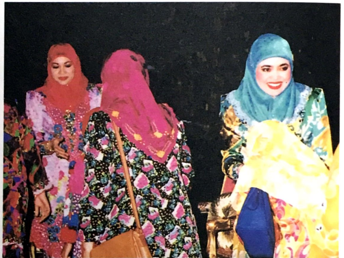
His Majesty (top picture) and Her Majesty The Raja Isteri and Her Royal Highness The Pengiran Isteri (above) granting an audience at Istana Nurul Iman to the more than 2,000 prospective Haj pilgrims shortly before the pilgrims departed for the holy city of Mecca.