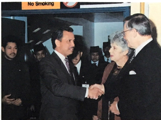
Above: His Majesty The Sultan and Yang Di-Pertuan of Brunei Darussalam and entourage being welcomed by the Governor-General of New Zealand, Her Excellency Dame Catherine Tizard and the Rt. Hon. Prime Minister James Bolger upon arrival at Wellington's international airport, which was followed by a ceremonial welcome at Parliament House, at which the ruler took the salute and inspected a guard of honour, right. Below: His Majesty and Dame Catherine Tizard holding discussion preceding a state dinner hosted in His Majesty's honour by the New Zealand Governor-General.