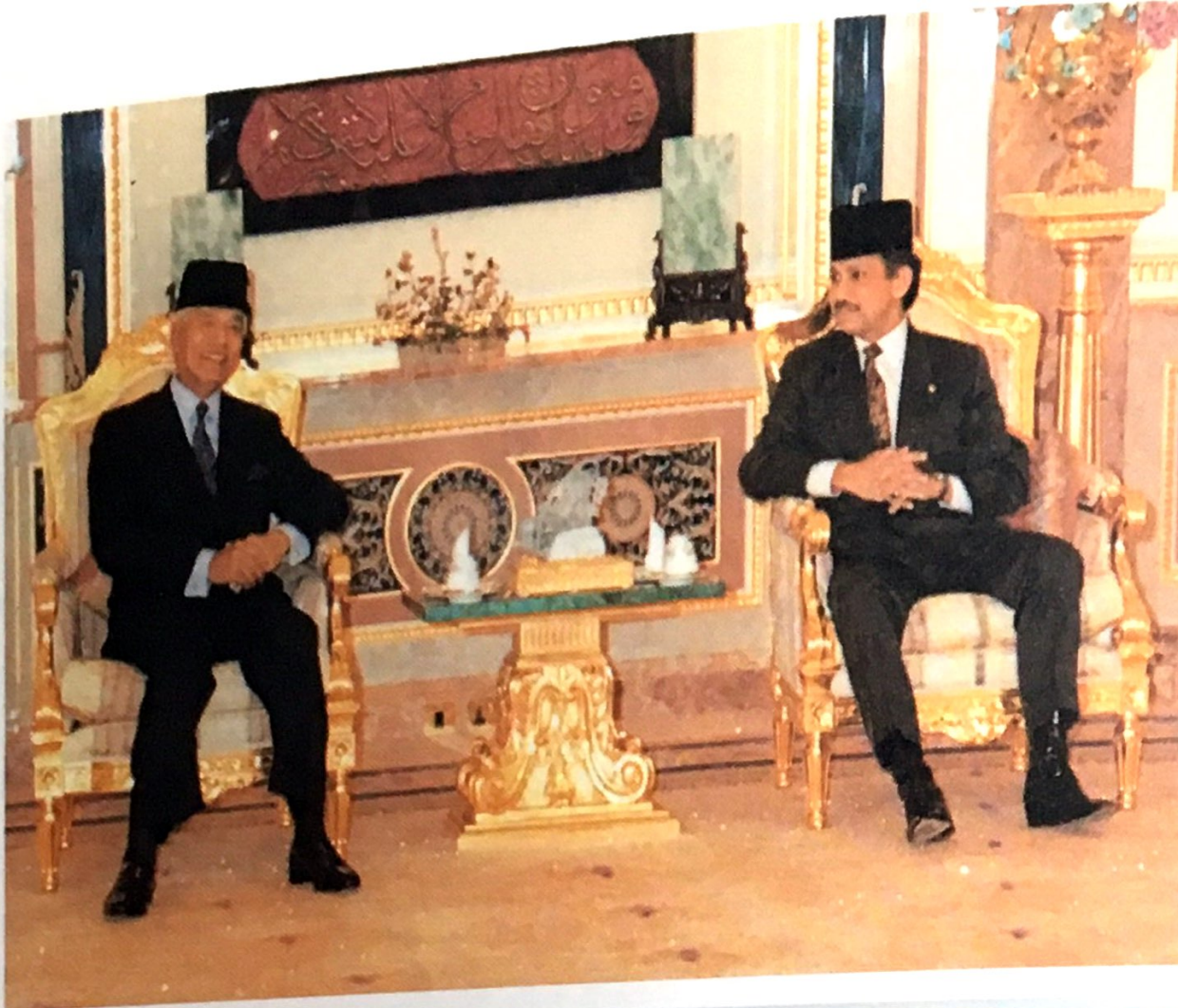
Left: His Majesty The Sultan and Yang Di-Pertuan of Brunei Darussalam and His Majesty The Yang Dipertuan Agong of Malaysia share a light moment when the Malaysian paramount ruler made a courtesy call on the Brunei monarch at the Istana Nurul Iman shortly after his arrival on April 4 for a two-day visit. Below: His Majesty The Yang Dipertuan Agong is greeted by Brunei dignitaries and foreign diplomats while His Royal Highness Paduka Seri Pengiran Perdana Wazir Sahibul Himmah Wal-Waqar Pengiran Muda Mohamed Bolkiah, who led the welcoming party, walks alongside the ruler.