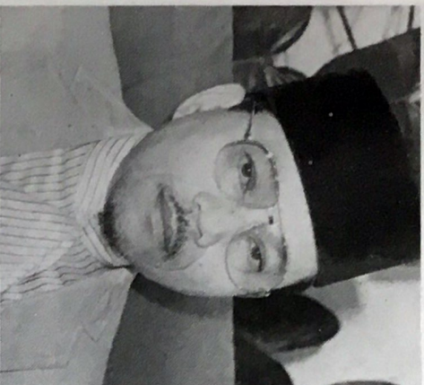
The Education Minister, Yang Berhormat Pehin Orang Kaya Laila Wajaya Dato Seri Setia Haji Awang Abdul Aziz.

Studies Centre has been made possible not only by a grant from His Majesty's Government and Brunei-Shell Petroleum Sendirian Berhad, but also with the full support of other government departments, which responded admirably to the challenge of building and equipping such a high-class facility in the depths of the Temburong Forest.