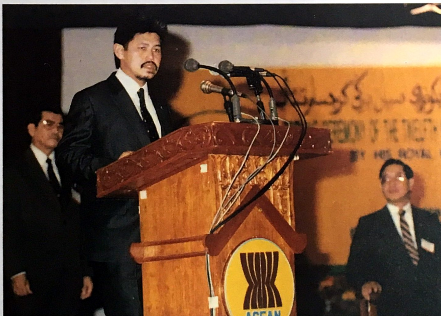
His Royal Highness Paduka Seri Pengiran Perdana Wazir Sahibul Himmah Wal-Waqar Pengiran Muda Mohamed Bolkiah officially opened the Twelfth ASEAN Economic Ministers' Meeting on Energy Cooperation.

I n the six years since Brunei Darussalam last hosted the Meeting of ASEAN Economic Ministers on Energy Cooperation, the pace of ASEAN's development has quickened, His Royal Highness Prince Mohamed Bolkiah said at the opening of the 12th Meeting of ASEAN Economic Ministers on Energy Cooperation.