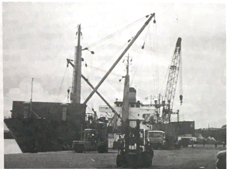
Pictures clockwise: General view of Muara Port, cargo handling and loading and unloading of cargoes.

T he Muara Deep Water Port, situated at the estuary of the Brunei river about 15 kilometres from the capital, Bandar Seri Begawan, is steadily growing not only in capability but also in importance, especially in the wake of efforts towards implementing various economic programmes of the BIMP-EAGA or the Brunei Darussalam - Indonesia - Malaysia - Philippines - East ASEAN Growth Area. Already capable of handling hundreds of thousands of tonnes of cargo each year, the port is constantly being improved and provided with new facilities. One day, it may well become the 'gateway for international trade for the BIMP-EAGA'. (See Page 8)