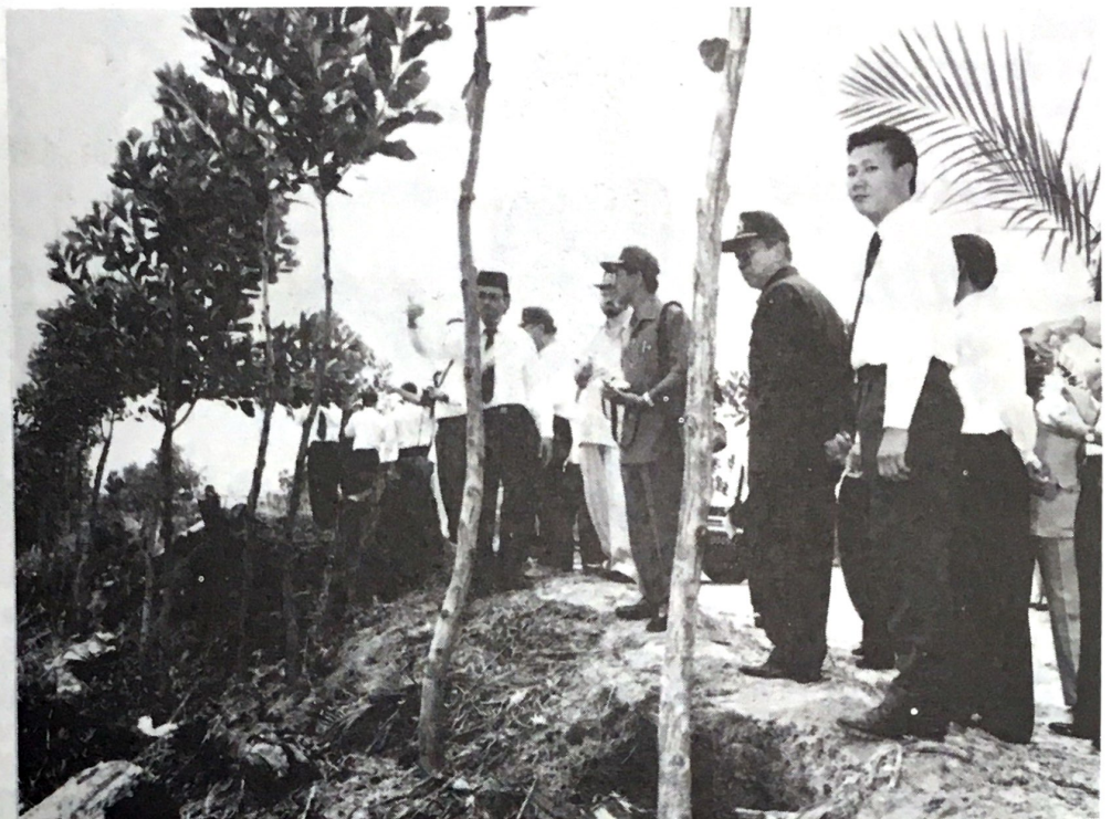
The Minister of Development, Yang Berhormat Pengiran Dato Seri Paduka Dr. Haji Ismail (third from right) tours a site earmarked for reforestation at Sungai Mau in the Labi area of Belait district.

In a speech before launching this year's World Forestry Day, which was also held in conjunction with the ASEAN Environmental Year on 21 March, Yang Berhormat Pengiran Dato Seri Paduka Dr. Haji Ismail spoke about the country's Policy on Forestry, high-