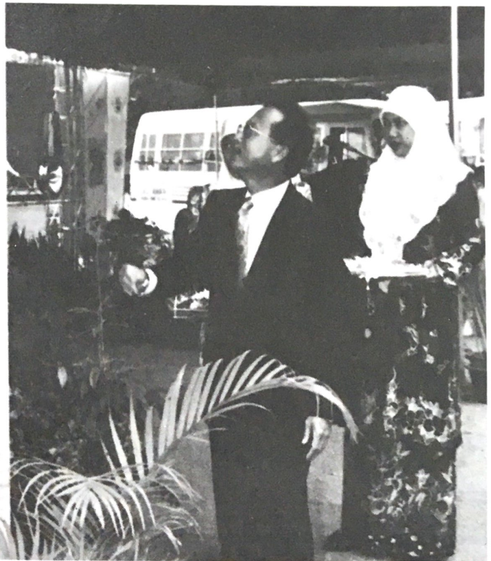
The Minister of Communications, Dato Seri Laila Jasa Awang Haji Zakaria unveils plaque at the official launching of a campaign on communications, marked by inauguration of a new bus service in and around the capital.