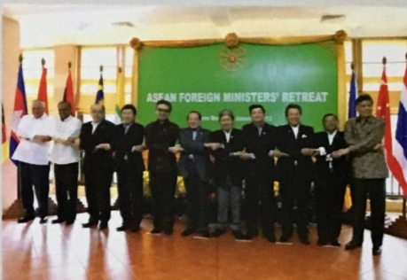
10 ASEAN Foreign Ministers' Retreat Meeting