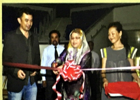
The Deputy Minister of Culture, Youth and Sports, Datin Paduka Dayang Hajah Adina officiates the 2 nd Volume of Bru-Xpo.

Bru-Xpo is an international exhibition for corporates, non-government organisations (NGO) and government institutions to display their products and services in this modern generation. Among the countries that participating in the Bru-Xpo were Brunei Darussalam, Malaysia and the Republic of Indonesia.