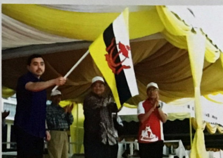
10 Go-Kart Race 2012