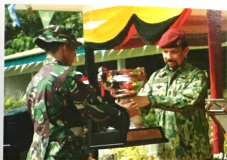
6 Republic of Indonesia wins 10th BISAM