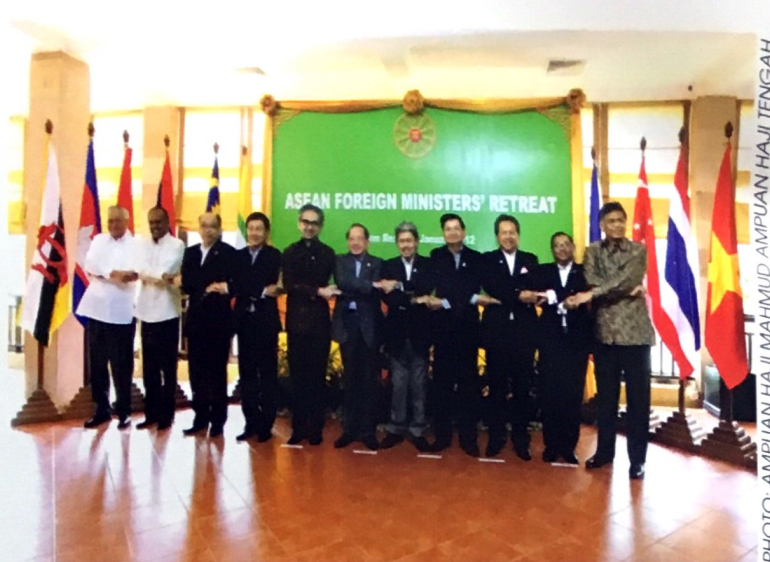
His Royal Highness and other ASEAN Foreign Ministers at the ASEAN Foreign Ministers' Retreat Meeting.

The dinner took place at the Sokha Angkor Hotel.