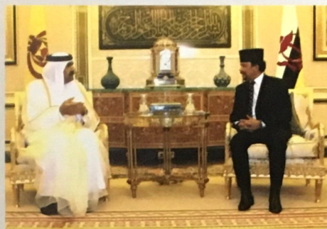
4 His Majesty welcomes Emir of the State of Qatar