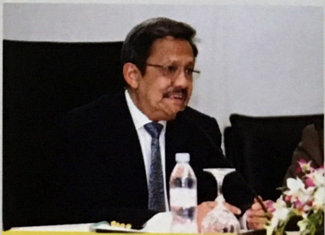
10 His Royal Highness attends 26th SEA Games Post-Mortem Meeting