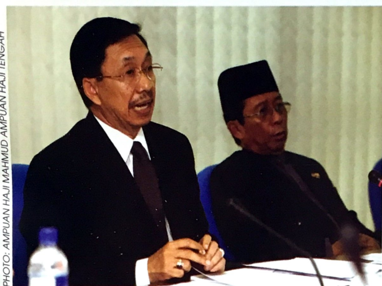
The Minister of Culture, Youth and Sports, Pehin Dato Awang Haji Hazair and the Minister of Religious Affairs, Pengiran Dato Dr. Haji Mohammad as the Joint-Advisor of the Fund Committee at the launching of the Humanitarian Fund for the Victims of Tropical Storm Washi, the Republic of the Philippines.

The MoU was an agreement cooperation in basic research and high education for the mutual interest of both institutions.