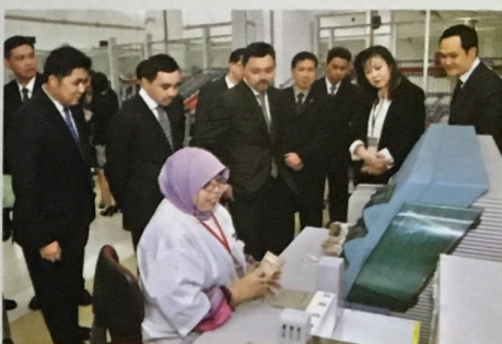
6 Their Royal Highnesses on official visit to Singapore