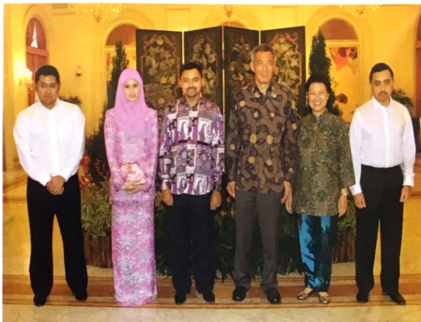
Their Royal Highnesses in a group photo with His Excellency Lee Hsien Loong, Prime Minister of Singapore and spouse.

Also in attendance were His Royal Highness Prince 'Abdul Malik; and Yang Amat Mulia Pengiran Muda 'Abdul Qawi. Present to watch the football match was the President of Republic of Singapore, His Excellency Dr. Tony Tan Keng Yam and Mr. S. R. Nathan.