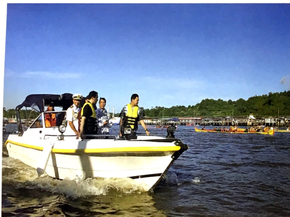
His Royal Highness launching the Brunei Darussalam Regatta 2012.

BANDAR SERI BEGAWAN, January 22 - His Royal Highness Prince Haji Al-Muhtadee Billah, The Crown Prince and Senior Minister at the Prime Minister's Office launched the Brunei Darussalam Regatta 2012.