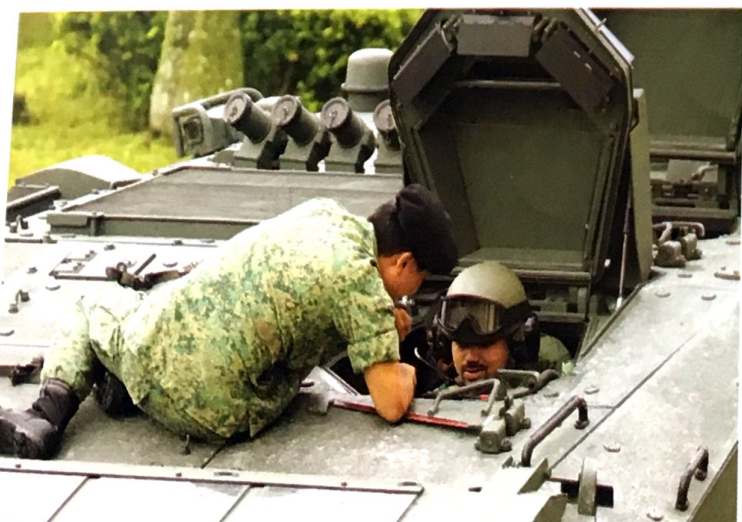
His Royal Highness Prince General Haji Al-Muhtadee Billah during a visit to Murai Urban Training Facility (MUTF) in Lim Chu Kang.

SINGAPORE, January 10 - His Royal Highness Prince General Haji Al-Muhtadee Billah, The Crown Prince and Senior Minister at the Prime Minister's Office continued his official visit to the Republic of Singapore with a visit to Murai Urban Training Facility (MUTF) in Lim Chu Kang.