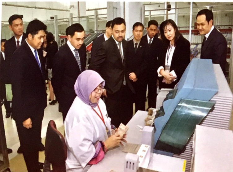
His Royal Highness takes a closer look at the operations of Singapore Currency House.

SINGAPORE, January 9 - His Royal Highness Prince Haji Al-Muhtadee Billah, The Crown Prince and Senior Minister at the Prime Minister's Office and Her Royal Highness Paduka Seri Pengiran Anak Isteri Pengiran Anak Sarah are in the Republic of Singapore for a five-day official visit.