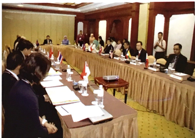
Some 30 participants at the 3 rd meeting of the ASEAN Focal Points on Tobacco Control (AFPTC).

The AFPTC is a working group established in 2010 under the Health Cooperation Activities, ASEAN Socio-cultural Community Blueprint aims at reviewing the status and progress of the bi-annual work plan as well as the formulation of the subsequent work plan, centred around issues related to tobacco control.