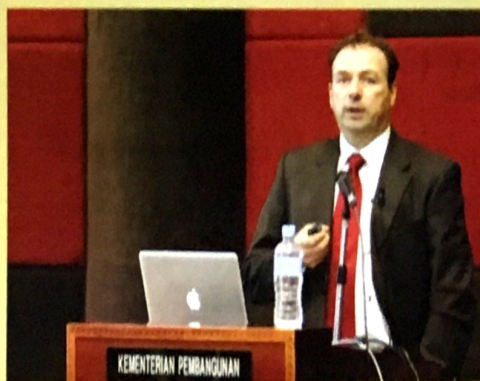
One of the speakers at the Climate Changes Lecture from University of Melbourne, Australia.