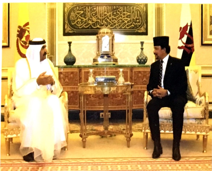
His Majesty The Sultan and Yang Di-Pertuan of Brunei Darussalam and His Highness The Emir of the State of Qatar during a one-to-one meeting.

BANDAR SERI BEGAWAN, January 17 - His Majesty Sultan Haji Hassanal Bolkiah Mu'izzaddin Waddaulah, The Sultan and Yang Di-Pertuan of Brunei Darussalam received a courtesy visit from His Highness Sheikh Hamad bin Khalifa Al-Thani, Emir of the State of Qatar who was on a one-day state visit to Brunei Darussalam.