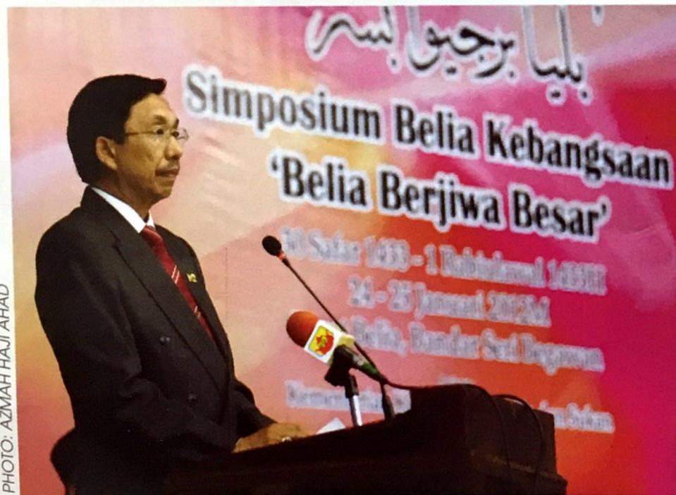
Minister of Culture, Youth and Sports, Pehin Dato Awang Haji Hazair officiates the National Youth Symposium.

BANDAR SERI BEGAWAN, January 24 - Youths must strive for excellence in various fields, according to their individual capabilities in order to achieve the status of big-hearted youths. Their achievements can be used to develop their individual talents and potential.