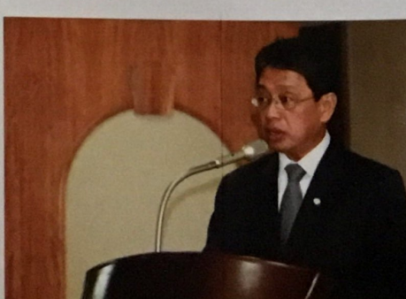
13 UBD hosts ICUBE