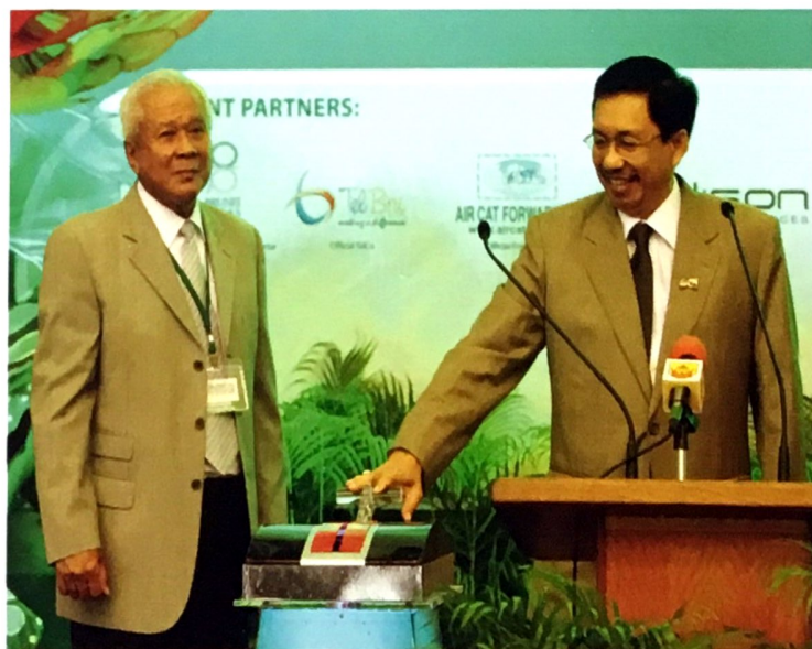
Minister of Culture, Youth and Sports, Pehin Dato Awang Haji Hazair (right) launched CF9.

CF9 which ran until January 8 was participated by more than 330 booths from 10 countries that offered the latest goods and services in various categories including Info-Technology and Communications, clothes, house hardware and foods on the special prices.