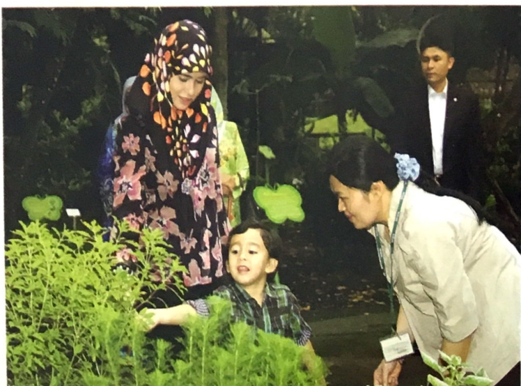
Her Royal Highness Paduka Seri Pengiran Anak Isteri Pengiran Anak Sarah and His Royal Highness Prince 'Abdul Muntaqim during a visit to the Jacob Ballas Children's Garden.

(Their Royal Highnesses on official visit to Singapore)