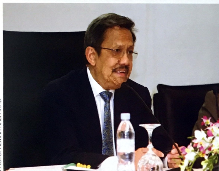
His Royal Highness made the sabda at the 26 th SEA Games Post-Mortem Meeting.