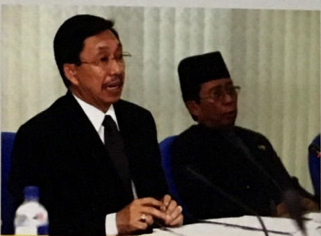
11 Humanitarian Fund set up