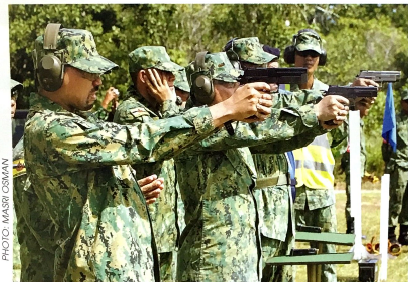
His Royal Highness Prince General Haji Al-Muhtadee Billah at the 10 th Brunei International Skill-At-Arms Meet (BISAM).

BANDAR SERI BEGAWAN, January 19 - Brunei International Skill-At-Arms Meet (BISAM) was first incepted back in 1985. It is an international shooting competition event pioneered by the Royal Brunei Armed Forces (RBAF) and competed by firers and marksmen from countries of this region and beyond.