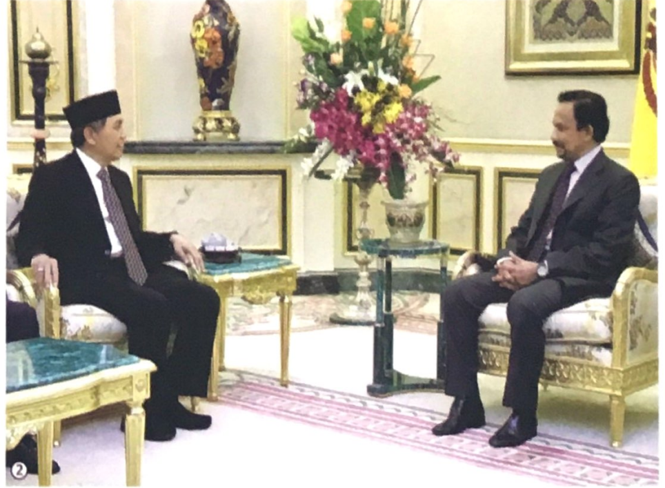
His Excellency Hadi Poernomo, Chairman of the Audit Board of the Republic of Indonesia on January 26.