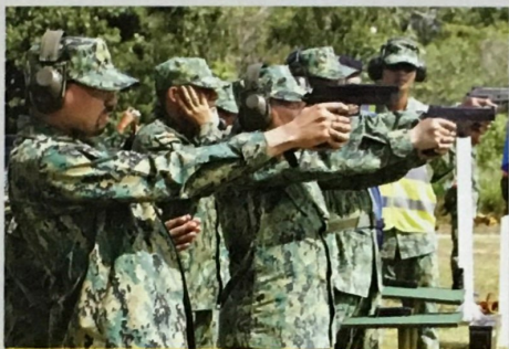
9 His Royal Highness officiates 10th BISAM