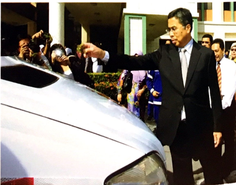
Minister of Health, Pehin Dato Awang Haji Adanan sprinkles scented flowers on the new ambulances.

It is hoped that with the supply of new ambulances will improve the quality and Emergency Medical Ambulance Services (EMAS) efforts in handling medical emergency situations besides as an addition to the existing ambulances.