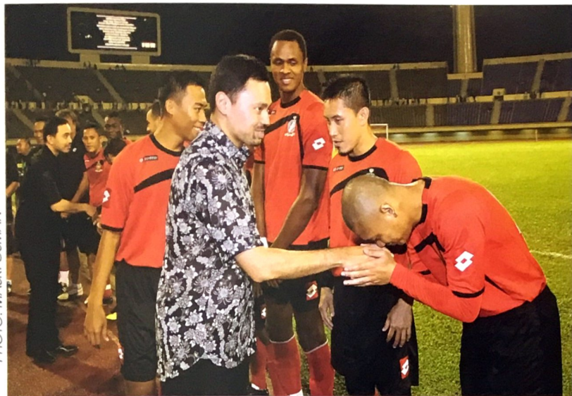
His Royal Highness is introduced to the players of both teams.

BANDAR SERI BEGAWAN, January 18 - A friendly football match between Brunei DPMM FC and Chiang Rai Utd. (United) from the Kingdom of Thailand was held at the Hassanal Bolkiah National Stadium in Berakas.