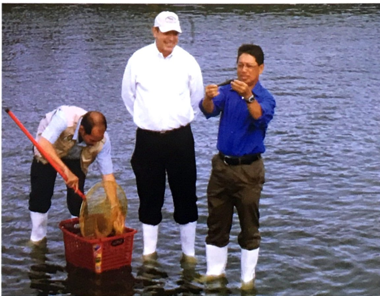
Minister of Industry and Primary Resources, Pehin Dato Awang Haji Yahya at the harvesting ceremony at the Aquaculture Research and Development Centre in Telisai.

Present at the harvesting ceremony at the Aquaculture Research and Development Centre, Telisai was the Minister of Industry and Primary Resources, Pehin Dato Awang Haji Yahya.