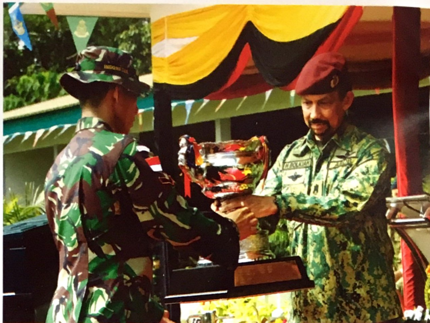
His Majesty The Sultan and Yang Di-Pertuan of Brunei Darussalam presents the trophy to the champion team of the 10 th BISAM.

Accompanying His Majesty was His Royal Highness Prince General Haji Al-Muhtadee Billah, The Crown Prince and Senior Minister at the Prime Minister's Office.