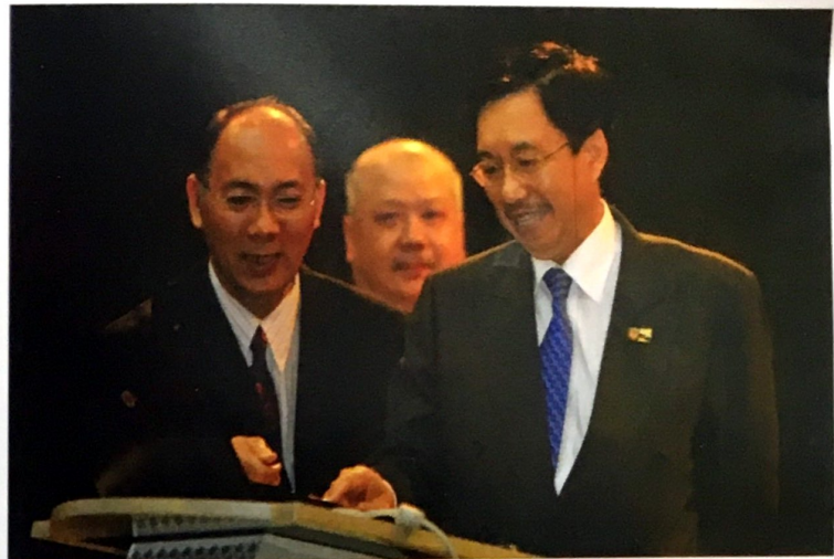
Minister of Culture, Youth and Sports, Pehin Dato Awang Haji Hazair launches the Archive System 'e-Arkib'.

The records can only be accessed or referenced by the National Archives of Brunei Darussalam government and