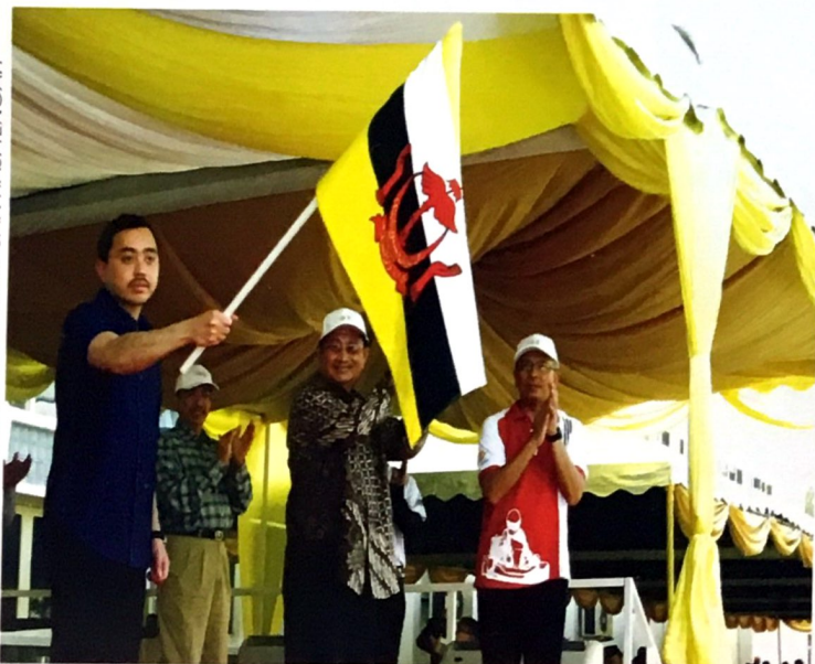
His Royal Highness Prince 'Abdul Malik launches the Go-Kart Race in conjunction with the 41 st anniversary of the re-naming of Bandar Brunei to Bandar Seri Begawan.