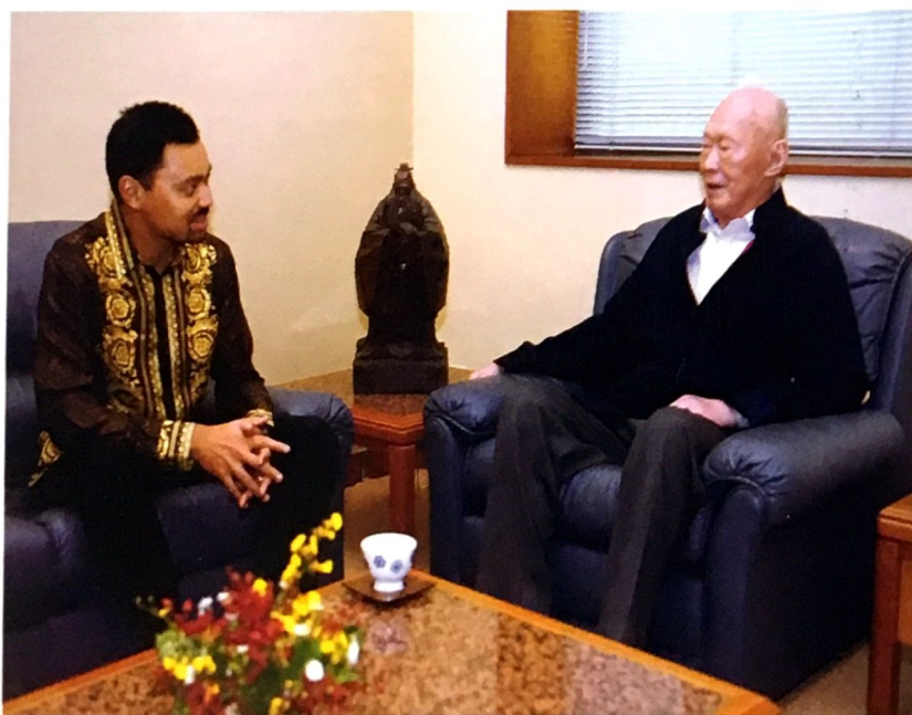
His Royal Highness and Former Minister Mentor His Excellency Lee Kuan Yew discuss bilateral relations as well as regional and international matters of mutual concern.

SINGAPORE, January 11 - His Royal Highness Prince Haji Al-Muhtadee Billah, The Crown Prince and Senior Minister at the Prime Minister's Office discussed bilateral relations as well as regional and international matters of mutual concern with Former Minister Mentor His Excellency Lee Kuan Yew.