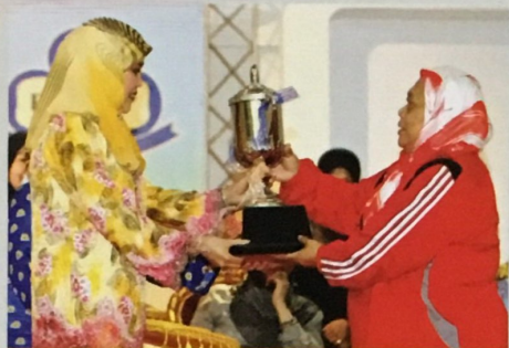
6 10th Badminton Championship Women's Patron Cup