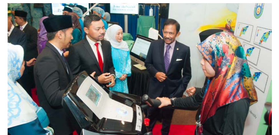
His Majesty and His Royal Highness Prince Dr. Haji Al-Muhtadee Billah, the Crown Prince and Senior Minister at the Prime Minister's Office witnessing the activities held at the 28 th Teacher's Day Celebration Exhibition.