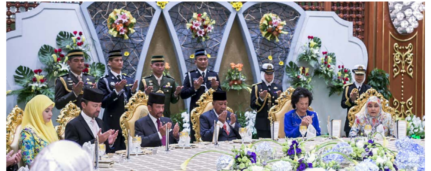
Their Majesties together with His Royal Highness the Sultan of Kedah Darul Aman and Her Royal Highness the Sultanah of Kedah Darul Aman during Luncheon.

Their Majesties then consented to a photo session with His Royal Highness the Sultan of Kedah Darul Aman and Her Royal Highness the Sultanah of Kedah Darul Aman, as well as with members of the royal family.