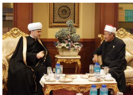
22. Exchanging views on mutual interests