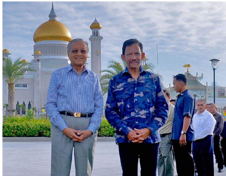
His Majesty Sultan Haji Hassanal Bolkiah Mu'izzaddin Waddaulah ibni Al-Marhum Sultan Haji Omar 'Ali Saifuddin Sa'adul Khairi Waddien, Sultan and Yang Di-Pertuan of Brunei Darussalam with Yang Amat Berhormat Tun Dato Laila Utama Dr. Mahathir bin Mohamad, the Prime Minister of Malaysia.

BANDAR SERI BEGAWAN, September 3 - His Majesty Sultan Haji Hassanal Bolkiah Mu'izzaddin Waddaulah ibni Al-Marhum Sultan Haji Omar 'Ali Saifuddin Sa'adul Khairi Waddien, Sultan and Yang Di-Pertuan of Brunei Darussalam held a Morning Walk with Yang Amat Berhormat Tun Dato Laila Utama Dr. Mahathir bin Mohamad, the Prime Minister of Malaysia, demonstrating the importance of a healthy lifestyle.