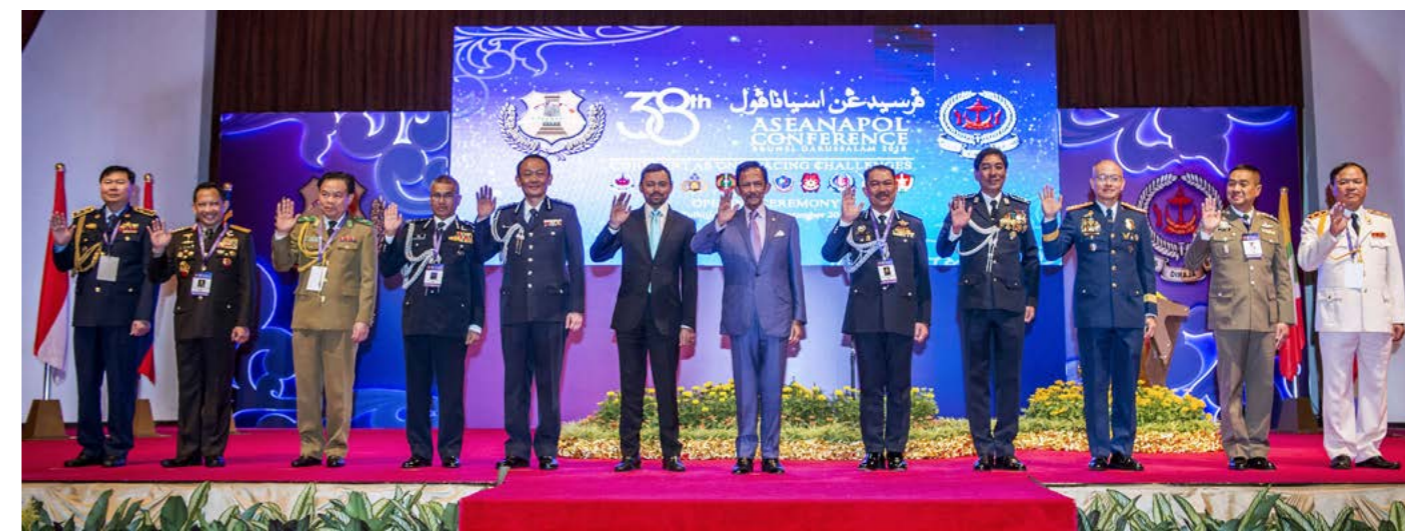
His Majesty Sultan Haji Hassanal Bolkiah Mu'izzaddin Waddaulah ibni Al-Marhum Sultan Haji Omar 'Ali Saifuddin Sa'adul Khairi Waddien, Sultan and Yang Di-Pertuan Negara Brunei Darussalam, Inspector General of the Royal Brunei Police Force and His Royal Highness Prince Haji Al-Muhtadee Billah ibni His Majesty Sultan Haji Hassanal Bolkiah Mu'izzaddin Waddaulah, the Crown Prince and Senior Minister at the Prime Minister's Office and Deputy Inspector General of Police, Royal Brunei Police Force in a group photo session.