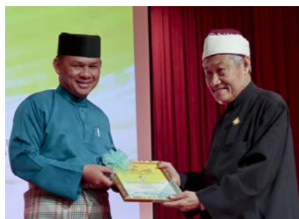
21. Four receive South East Asia Literature Council Literary Award