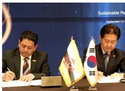
23. Brunei Darussalam and Republic of Korea sign MoU on Defence Cooperation