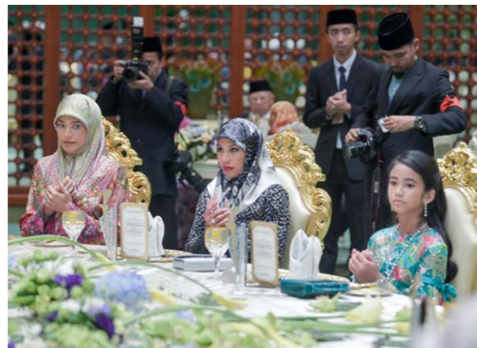
Her Royal Highness Princess Hajah Majeedah Nuurul Bolkiah binti His Majesty Sultan Haji Hassanal Bolkiah Mu'izzaddin Waddaulah, Her Royal Highness Princess 'Azemah Ni'matul Bolkiah binti His Majesty Sultan Haji Hassanal Bolkiah Mu'izzaddin Waddaulah and Her Royal Highness Princess Ameerah Wardatul Bolkiah binti His Majesty Sultan Haji Hassanal Bolkiah Mu'izzaddin Waddaulah (left to right).