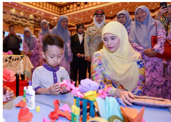
Her Royal Highness mingling and taking a closer look at a student handcrafting flowers.

The skills of women in handicraft, cooking and art of arrangement should not be hobbies only, even for those who venture into business, creative creativity will add value to the