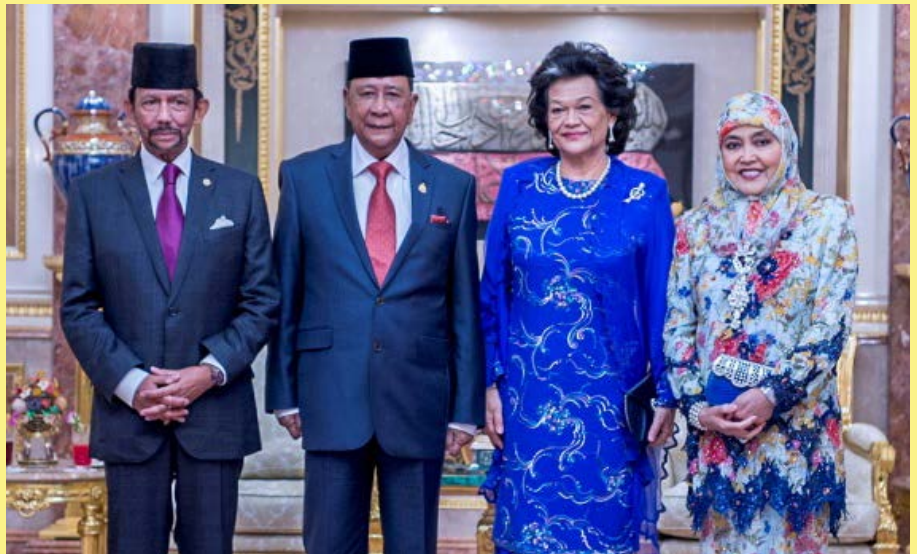
His Majesty Sultan Haji Hassanal Bolkiah Mu'izzaddin Waddaulah ibni Al-Marhum Sultan Haji Omar 'Ali Saifuddien Sa'adul Khairi Waddien, Sultan and Yang Di-Pertuan of Brunei Darussalam and Her Majesty Duli Raja Isteri Pengiran Anak Hajah Saleha binti Al-Marhum Pengiran Pemancha Pengiran Anak Haji Mohamed Alam with His Royal Highness Sultan Sallehuddin ibni Al-Marhum Sultan Badlishah, the Sultan of Kedah Darul Aman and Her Royal Highness Sultanah Maliha binti Al-Marhum Tengku Ariff, the Sultanah of Kedah Darul Aman.

BANDAR SERI BEGAWAN, September 8 - His Majesty Sultan Haji Hassanal Bolkiah Mu'izzaddin Waddaulah ibni Al-Marhum Sultan Haji Omar 'Ali Saifuddien Sa'adul Khairi Waddien, Sultan and Yang Di-Pertuan of Brunei Darussalam and Her Majesty Duli Raja Isteri Pengiran Anak Hajah Saleha binti Al-Marhum Pengiran Pemancha Pengiran Anak Haji Mohamed Alam received a Courtesy Visit from His Royal Highness Sultan Sallehuddin ibni Al-Marhum Sultan Badlishah, the Sultan of Kedah Darul Aman and Her Royal Highness Sultanah Maliha binti Al-Marhum Tengku Ariff, the Sultanah of Kedah Darul Aman. The ceremony took place at Istana Nurul Iman.