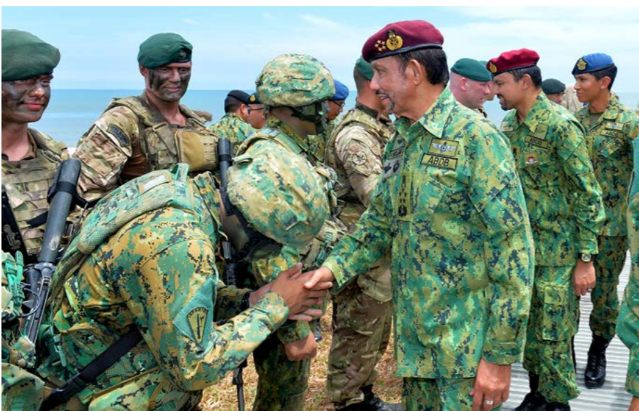
His Majesty and Their Royal Highnesses receiving a junjung ziarah (meet and greet) with RBAF members and the United Kingdom Royal Marines Commando members.

Accompanying His Majesty were His Royal Highness Prince General Haji Al-Muhtadee Billah, the Crown Prince and