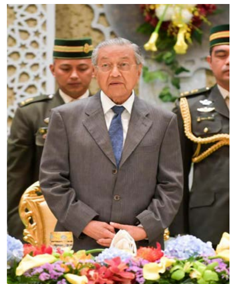
Yang Amat Berhormat Tun Dato Laila Utama Dr. Mahathir bin Mohamad, the Prime Minister of Malaysia delivering his return address during the Official Luncheon.

Yang Amat Berhormat the Prime Minister of Malaysia and Yang Amat Berbahagia Tun Datin as well as their delegation are in the country on a two-day Official Visit.