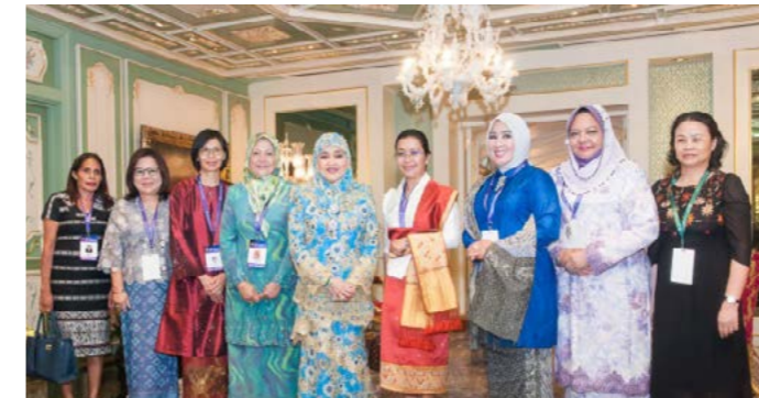
Spouses of the Association of Southeast Asian Nations Chiefs of Police, ASEANAPOL on September 4.

Her Majesty Duli Raja Isteri Pengiran Anak Hajah Saleha binti Al-Marhum Pengiran Pemancha Pengiran Anak Haji Mohamed Alam received in audiences at the Istana Nurul Iman from: