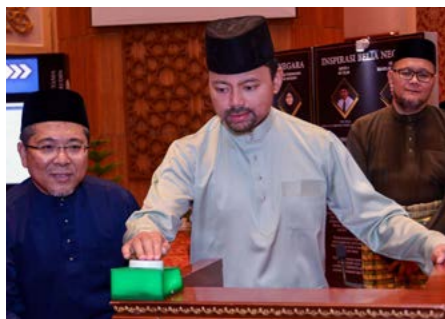
16. UNISSA's 8th Mahrajan Hafli Al-Takharruj