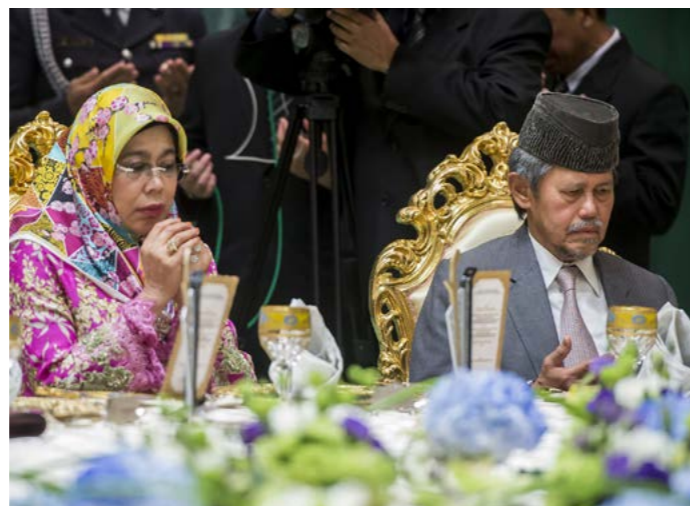
His Royal Highness Prince Mohamed Bolkiah ibni Al-Marhum Sultan Haji Omar 'Ali Saifuddin Sa'adul Khairi Waddien and Her Royal Highness Pengiran Anak Isteri Pengiran Anak Hajah Zariah binti Al-Marhum Pengiran Pemancha Pengiran Anak Haji Mohamed Alam.