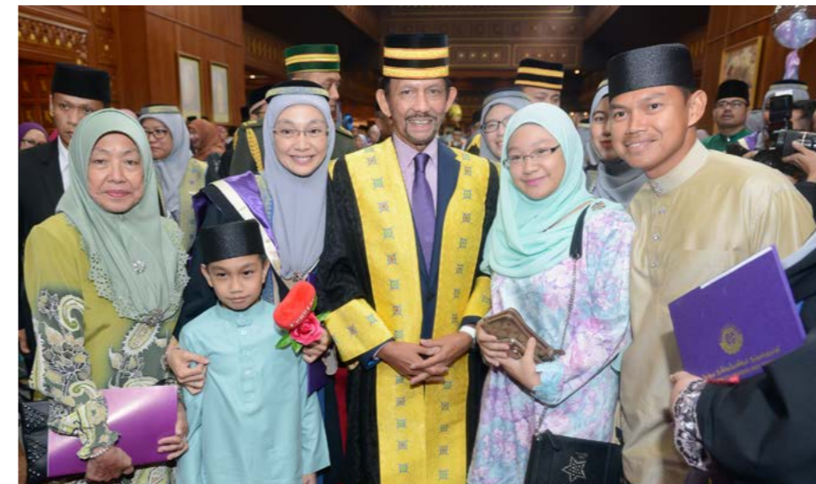
His Majesty in a photo with one of recipients and her family.

BERAKAS, September 29 – The awarding of degrees and diplomas to the graduates of Universiti Teknologi Brunei (UTB) is the starting moment for a new generation towards contributing to the nation's development and economy.