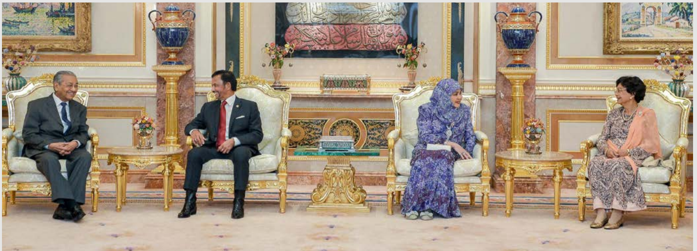
His Majesty Sultan Haji Hassanal Bolkiah Mu'izzaddin Waddaulah ibni Al-Marhum Sultan Haji Omar 'Ali Saifuddien Sa'adul Khairi Waddien, Sultan and Yang Di-Pertuan of Brunei Darussalam and Her Majesty Duli Raja Isteri Pengiran Anak Hajah Saleha binti Al-Marhum Pengiran Pemancha Pengiran Anak Haji Mohamed Alam with Yang Amat Berhormat Tun Dato Laila Utama Dr. Mahathir bin Mohamad, the Prime Minister of Malaysia and spouse, Yang Amat Berbahagia Tun Datin Dr. Siti Hasmah binti Mohd. Ali.