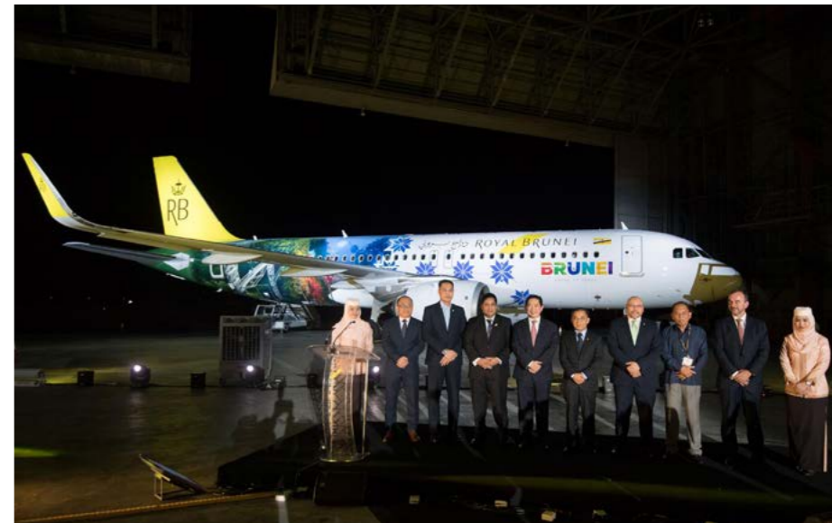
Yang Berhormat Dato Seri Setia Awang Haji Ali bin Haji Apong, Minister of Primary Resources and Tourism; Yang Berhormat Dato Seri Setia Dr. Awang Haji Mohd. Amin Liew bin Abdullah, Second Minister of Finance and Economy as the Chairman of the RB Board of Directors; and Yang Berhormat Dato Seri Setia Awang Abdul Mutalib bin Pehin Orang Kaya Seri Setia Dato Paduka Haji Mohammad Yusof, Minister of Communications officially launching the Airbus A320neo at Brunei International Airport.

Previously, RB announced the introduction of its non-stop Brunei-London flight which is scheduled to begin at the end of October and also introduced destination networks to Nanning, Hangzhou and Taipei. At the ceremony, RB also announced the twice a week flight to Haikou starting from the 30 th of October 2018; twice a week flight to Changsha from the 18 th of December 2018; and flight to Tokyo - Narita from the 15 th of March 2019.