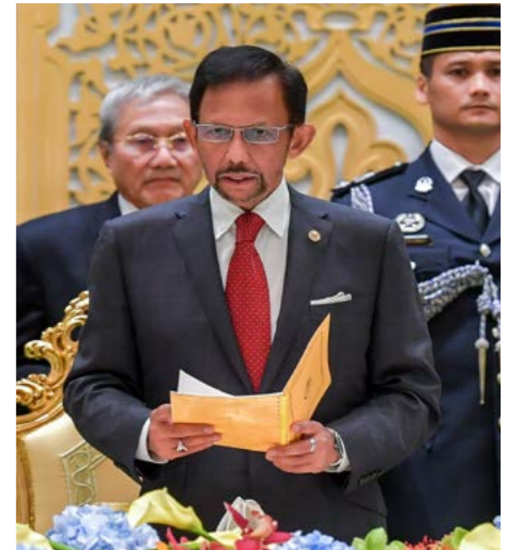
His Majesty the Sultan and Yang Di-Pertuan of Brunei Darussalam delivering a titah (royal speech) during the Official Luncheon.

In ending his speech, Yang Amat Berhormat stated that Malaysia and Brunei Darussalam have been cooperating in numerous fields and hoped that this close cooperation will continue.