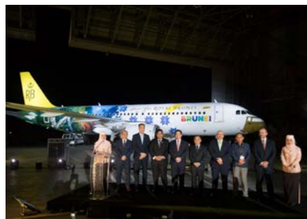
19. Launching of Airbus A320neo