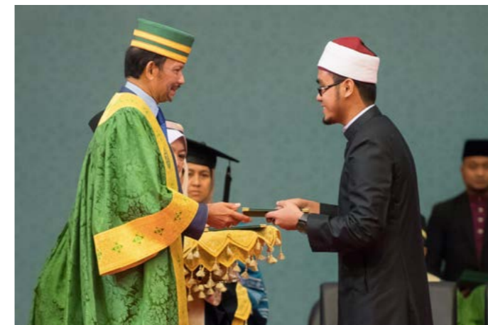
His Majesty Sultan Haji Hassanal Bolkiah Mu'izzaddin Waddaulah ibni Al-Marhum Sultan Haji Omar 'Ali Saifuddien Sa'adul Khairi Waddien, Sultan and Yang Di-Pertuan of Brunei Darussalam, the Chancellor of UNISSA bestowing a graduation certificate to one of the graduates at UNISSA's 8 th Convocation Ceremony.

BANDAR SERI BEGAWAN, September 17 - A total of 208 graduates of the Sultan Sharif Ali Islamic University (UNISSA) received degrees, diplomas and certificates in various fields and levels of study during 8 th UNISSA Hafli Al-Takharruj Convocation Ceremony which took place at the International Convention Centre in Berakas.