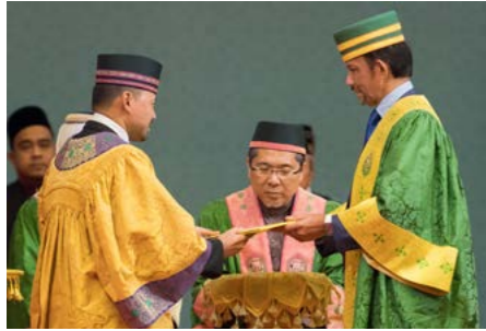
11. His Royal Highness awarded honorary degree of Doctor of Islamic Finance