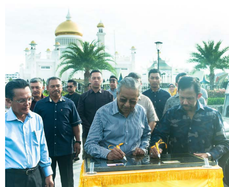
His Majesty and Yang Amat Berhormat Prime Minister of Malaysia together signing a commemorative parchment.

The Official Visit by Yang Amat Berhormat is the first since Yang Amat Berhormat was sworn in as the new Prime Minister of Malaysia on the 10th of May 2018.