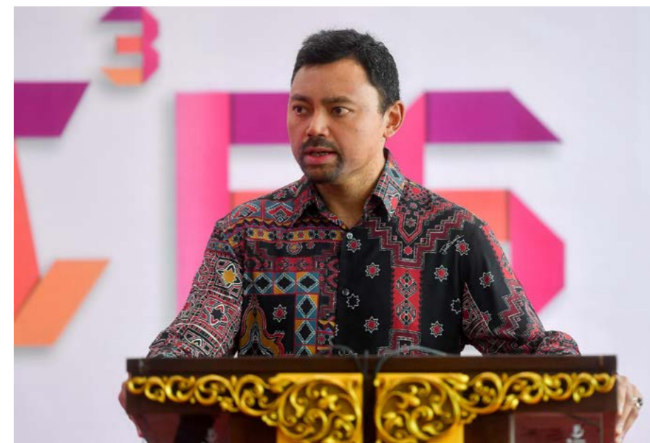
His Royal Highness Prince (Dr.) Haji Al-Muhtadee Billah ibni His Majesty Sultan Haji Hassanal Bolkiah Mu'izzaddin Waddaulah, the Crown Prince and Senior Minister at the Prime Minister's Office as the Pro-Chancellor of Universiti Teknologi Brunei (UTB) officiating the opening ceremony of UTB's 5 th Convocation Festival.

His Royal Highness then consented to deliver a sabda (royal speech) launching UTB's 5 th Convocation Festival 2018, which was then followed by the call of