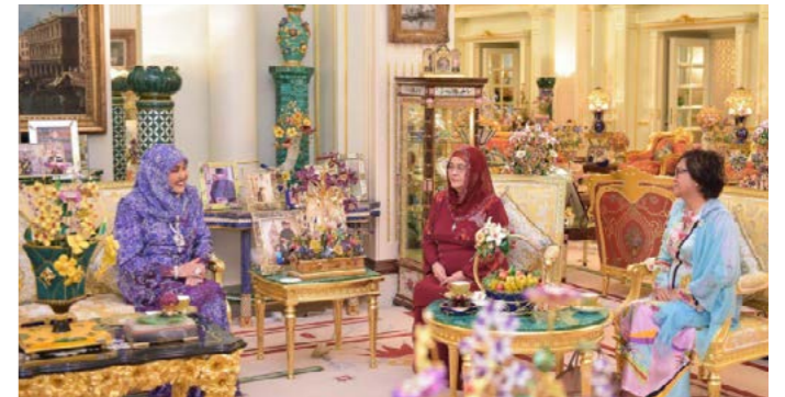
Yang Amat Berbahagia Datin Patinggi Dato Hajah Juma'ani binti Tun Tuanku Haji Bujang, the spouse of the Chief Minister of Sarawak on September 19.