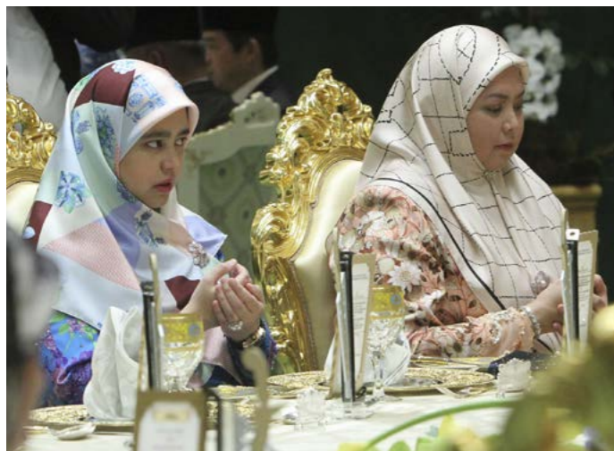
Princess Hajah Rashidah Sa'adatol Bolkiah binti His Majesty Sultan Haji Hassanal Bolkiah Mu'izzaddin Waddaulah (right) and Her Royal Highness Princess Hajah Hafizah Sururul Bolkiah binti His Majesty Sultan Haji Hassanal Bolkiah Mu'izzaddin Waddaulah (left).