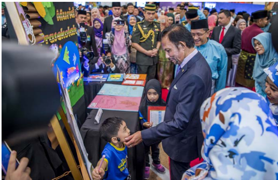
His Majesty interacting with students who participated in the exhibition which focuses on aspects of teaching and learning innovation and creativity in preschool. His Majesty interacting with students who participated in the exhibition which focuses on aspects of teaching and learning innovation and creativity in preschool.

"Based on this, teachers' careers can be seen as more challenging and complex. Only teachers with the ability