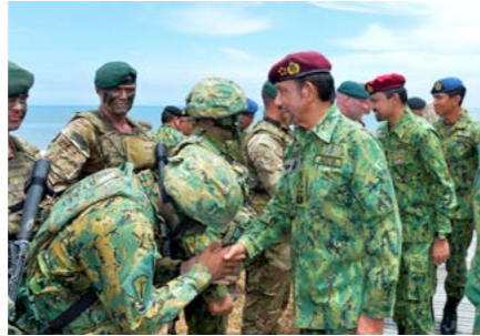
13. His Majesty attends Third Setia Kawan Exercise