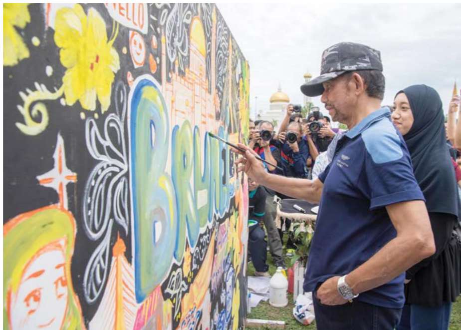
His Majesty painting on one of the graffiti art exhibited by Art & Creative Alumni Guild Siswazah Universiti Brunei Darussalam.