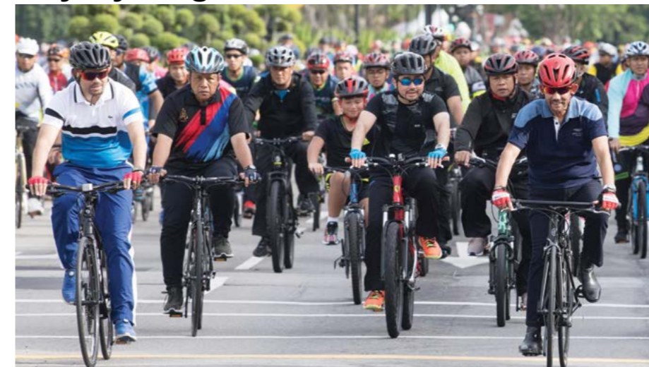
His Majesty Sultan Haji Hassanal Bolkiah Mu'izzaddin Waddaulah ibni Al-Marhum Sultan Haji Omar 'Ali Saifuddin Sa'adul Khairi Waddien, Sultan and Yang Di-Pertuan of Brunei Darussalam with His Majesty's sons and brothers; His Royal Highness Prince Haji Al-Muhtadee Billah, the Crown Prince and Senior Minister at the Prime Minister's Office; His Royal Highness Prince 'Abdul Malik; His Royal Highness Prince 'Abdul Wakeel; and His Royal Highness Prince Mohamed Bolkiah participating in the National Youth Day Cycling Recreation 2018.

BANDAR SERI BEGAWAN, September 2 - The National Youth Day Cycling Recreation 2018 proves not only to be a health activity but is also able to unite all walks of life in the country.