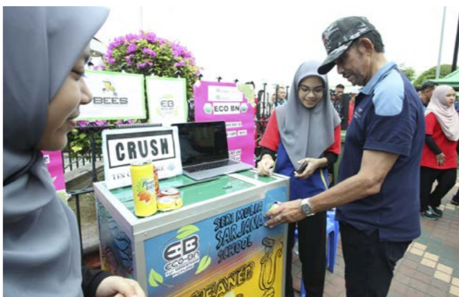
His Majesty trying out the EB-ECO Bn machine, created by Year 9 Express students from Seri Mulia Sarjana School, which is aimed for recycling purposes.

The National Youth Day Cycling Recreation 2018 was held in conjunction with the 13 th National Youth Day celebration, which was celebrated on the 1 st of August.