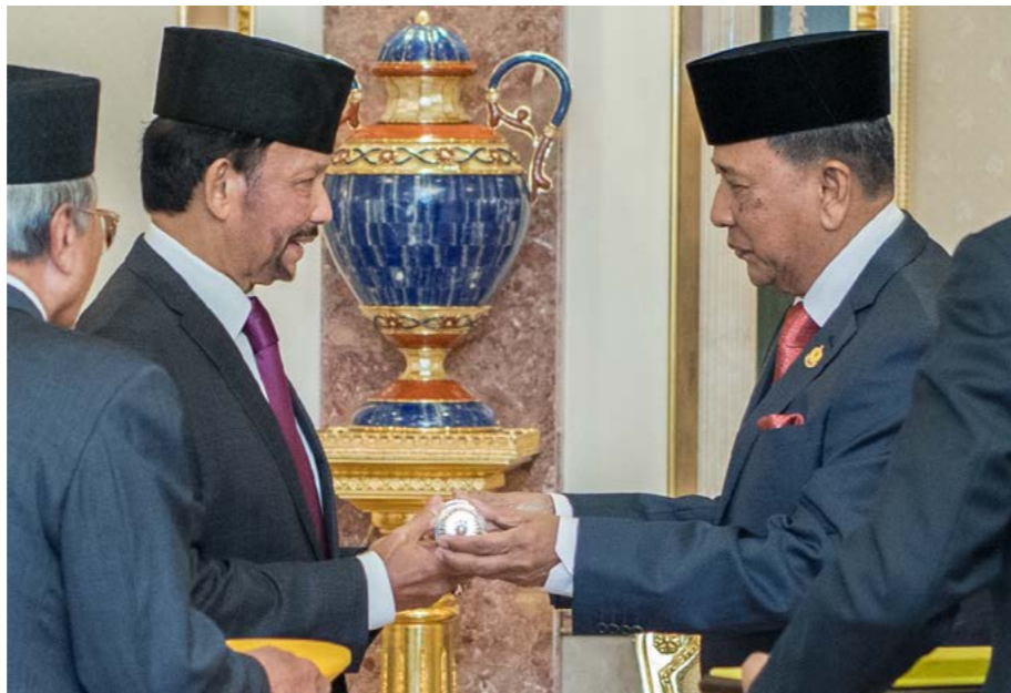
His Majesty receiving an invitation from His Royal Highness the Sultan of Kedah Darul Aman to the Coronation Ceremony of His Royal Highness as the 29 th Sultan of Kedah Darul Aman which will be held at Istana Anak Bukit, Kedah Darul Aman on the 22 nd of October 2018.

Present at the ceremony were His Royal Highness Prince Haji Al-Muhtadee Billah, the Crown Prince and Senior Minister at the Prime Minister's Office and Her Royal Highness Paduka Seri Pengiran Anak Isteri Pengiran Anak Sarah binti Pengiran Haji Salleh Ab. Rahaman; His Royal Highness Prince 'Abdul Malik and Yang Amat Mulia Pengiran Anak Isteri Pengiran Raabi'atul 'Adawiyah binti Pengiran Haji Bolkiah; His Royal Highness Prince 'Abdul Mateen; His Royal Highness Prince 'Abdul Wakeel; His Royal Highness Prince Mohamed Bolkiah and Her Royal Highness Pengiran Anak Isteri Pengiran Anak Hajah Zariah;