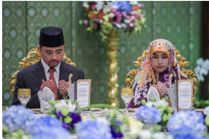
His Royal Highness Prince 'Abdul Malik ibni His Majesty Sultan Haji Hassanal Bolkiah Mu'izzaddin Waddaulah and Yang Amat Mulia Pengiran Anak Isteri Pengiran Raabi'atul 'Adawiyah binti Pengiran Haji Bolkiah.