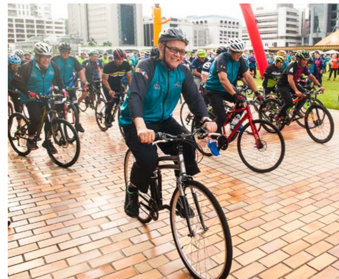
The Minister of Education, Yang Berhormat Dato Seri Setia Awang Haji Hamzah bin Haji Sulaiman joining the 28 th Teachers' Day Run and Cycle Event.

The cycling event, which covered a distance of 11.5 kilometres,