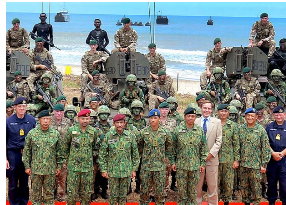
His Majesty Sultan Haji Hassanal Bolkiah Mu'izzaddin Waddaulah ibni Al-Marhum Sultan Haji Omar 'Ali Saifuddin Sa'adul Khairi Waddien, Sultan and Yang Di-Pertuan of Brunei Darussalam, Minister of Defence and Supreme Commander of the Royal Brunei Armed Forces (RBAF); His Royal Highness Prince General Haji Al-Muhtadee Billah, the Crown Prince and Senior Minister at the Prime Minister's Office, and General of the Royal Brunei Armed Forces; and His Royal Highness 920 Captain (Air Force) Prince 'Abdul Mateen in a group photo with RBAF members and United Kingdom Royal Marines Commando members.

Prior to departure, His Majesty and Their Royal Highnesses viewed the Static Exhibition of Setia Kawan Gallery on display and received a pesambah