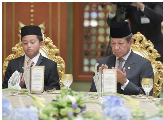
His Royal Highness Prince 'Abdul Wakeel ibni His Majesty Sultan Haji Hassanal Bolkiah Mu'izzaddin Waddaulah (left) and His Royal Highness Prince Haji Jefri Bolkiah ibni Al-Marhum Sultan Haji Omar 'Ali Saifuddin Sa'adul Khairi Waddien (right).