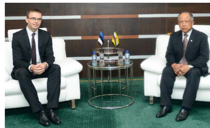
Yang Berhormat Pehin Datu Lailaraja Major General (Rtd) Dato Paduka Seri Haji Awang Halbi, Second Minister of Defence with His Excellency Sven Mikser, Minister of Foreign Affairs of the Republic of Estonia.

His Excellency Sven Mikser is in the country for two days for his inaugural visit to Brunei Darussalam.