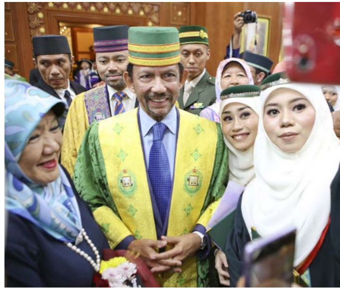
His Majesty in a group photo with the graduates of UNISSA.