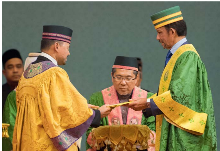
His Majesty Sultan Haji Hassanal Bolkiah Mu'izzaddin Waddaulah ibni Al-Marhum Sultan Haji Omar 'Ali Saifuddien Sa'adul Khairi Waddien, Sultan and Yang Di-Pertuan of Brunei Darussalam, conferring an honorary degree of Doctor in Islamic Finance to His Royal Highness Prince (Dr.) Haji Al-Muhtadee Billah, the Crown Prince and Senior Minister at the Prime Minister's Office and Pro-Chancellor of UNISSA.

BANDAR SERI BEGAWAN, 17 September – In conjunction with the 8 th UNISSA Hafli Al-Takharuj Ceremony, His Majesty Sultan Haji Hassanal Bolkiah Mu'izzaddin Waddaulah ibni Al-Marhum Sultan Haji Omar 'Ali Saifuddien Sa'adul Khairi Waddien, Sultan and Yang Di-Pertuan of Brunei Darussalam, the Chancellor of UNISSA conferred the honorary degree of Doctor of Islamic Finance to His Royal Highness Prince (Dr.) Haji Al-Muhtadee ibni His Majesty Sultan Haji Hassanal Bolkiah Mu'izzaddin Waddaulah, the Crown Prince and Senior Minister at the Prime Minister's Office and Pro-Chancellor of UNISSA.