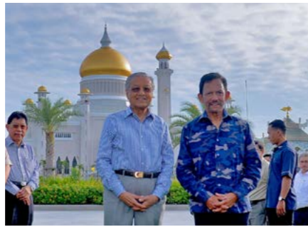
3. His Majesty holds Morning Walk at Taman Mahkota Jubli Emas with the Prime Minister of Malaysia