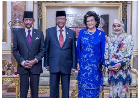
1. Courtesy Visit from His Royal Highness the Sultan of Kedah Darul Aman and Her Royal Highness the Sultanah of Kedah Darul Aman