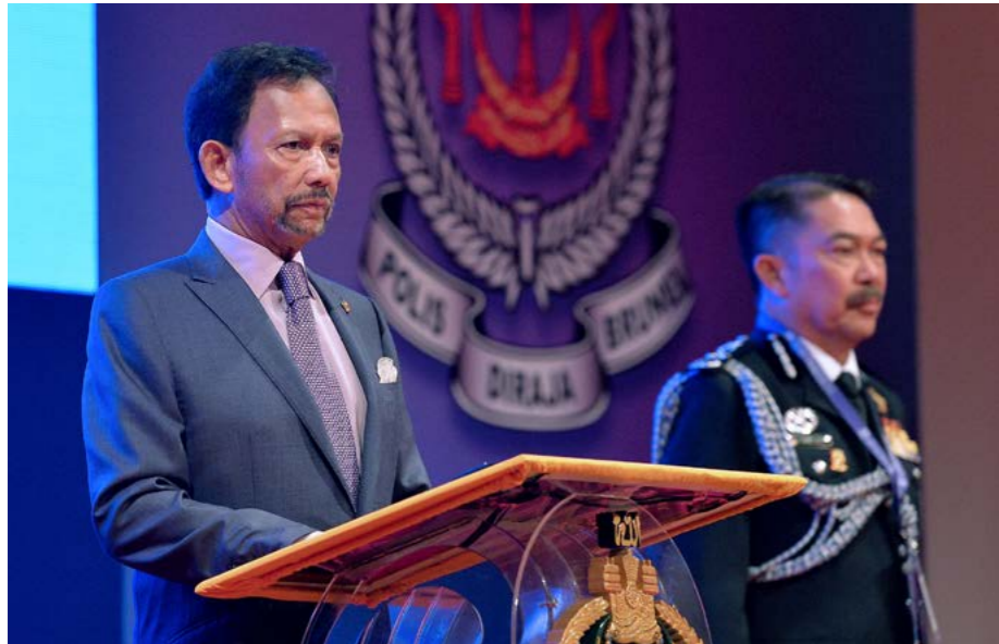
His Majesty Sultan Haji Hassanal Bolkiah Mu'izzaddin Waddaulah ibni Al-Marhum Sultan Haji Omar 'Ali Saifuddien Sa'adul Khairi Waddien, Sultan and Yang Di-Pertuan of Brunei Darussalam, Inspector General of the Royal Brunei Police Force delivering a titah (royal speech).