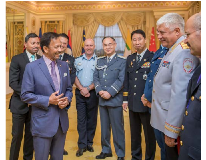
His Majesty the Sultan and Yang Di-Pertuan of Brunei Darussalam and His Royal Highness interacting with the Heads of Delegation from ASEAN Member States, Dialogue Partners and Observers attending the 38 th ASEANAPOL Conference.

His Majesty then officiated the Opening of the 38 th ASEANAPOL Conference and joined Heads of Delegation from ASEANAPOL countries, Dialogue Partners, and Observers for a Luncheon and a group photo session.