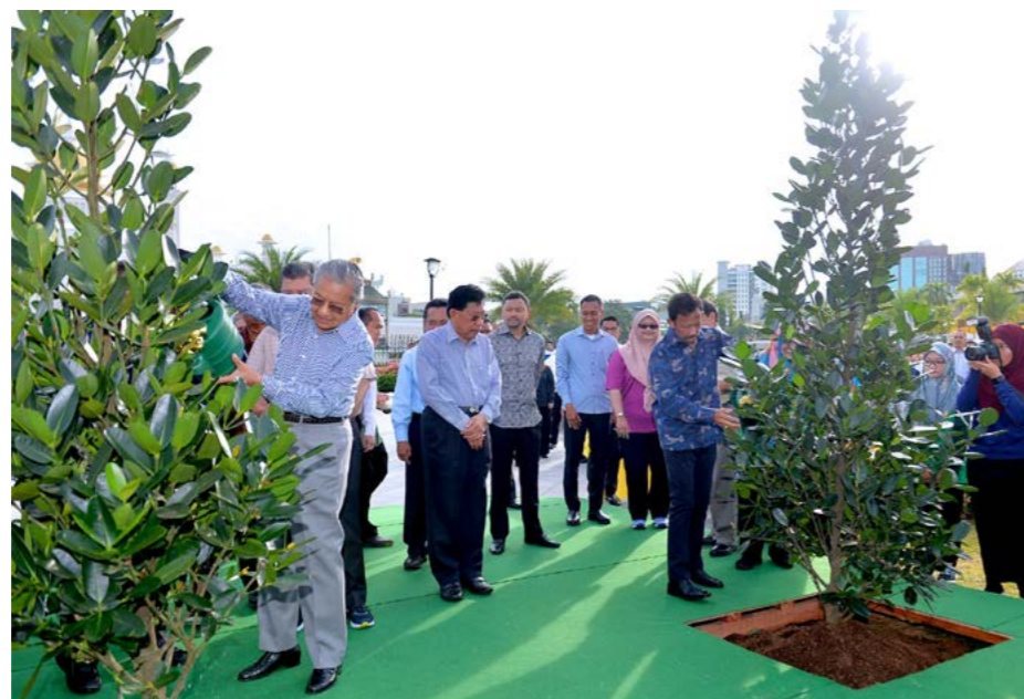
His Majesty and Yang Amat Berhormat Prime Minister of Malaysia watering the 'Garcinia Subelliptica', also known as Happiness Tree, which signifies the longstanding friendly ties between Brunei Darussalam and Malaysia.

This was followed with the watering of trees called 'Garcinia Subelliptica', also known as the Happiness Tree,