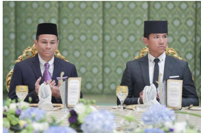
His Royal Highness Prince 'Abdul Mateen ibni His Majesty Sultan Haji Hassanal Bolkiah Mu'izzaddin Waddaulah (right) and Yang Teramat Mulia Dato' Tunku Shazuddin Ariff ibni Sultan Sallehuddin (right).