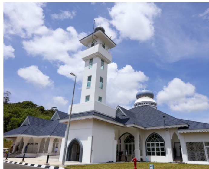
The newly built Ar-Rahim mosque.