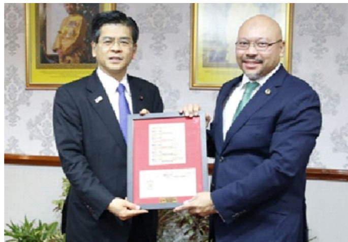
Yang Berhormat Dato Seri Setia Awang Abdul Mutalib bin Pehin Orang Kaya Seri Setia Dato Paduka Haji Mohammad Yusof, Minister of Transport and Infocommunications with His Excellency Keiichi Ishi, Minister of Land, Infrastructure, Transport and Tourism of Japan.