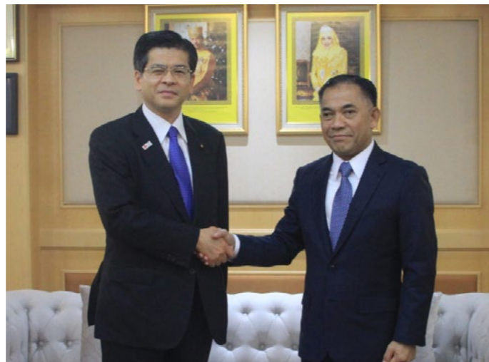
Yang Berhormat Dato Seri Setia Awang Haji Ali bin Haji Apong, Minister of Primary Resources and Tourism with His Excellency Keiichi Ishi, Minister of Land, Infrastructure, Transport and Tourism of Japan.

The visit was the first visit of His Excellency Keiichi Ishi to Brunei Darussalam and the delegation will depart from Brunei Darussalam on the 5 th of May 2019.