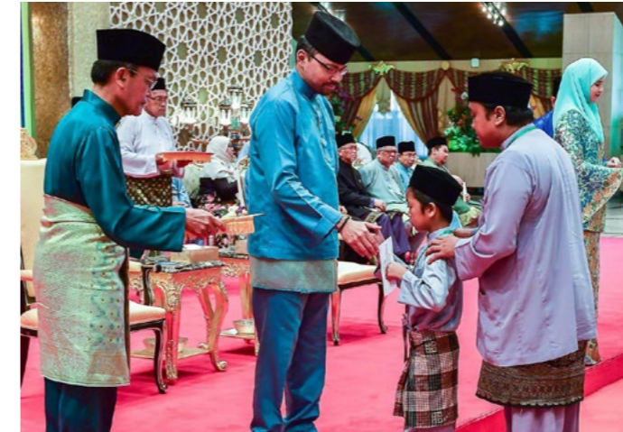
His Royal Highness Prince Haji Al-Muhtadee Billah ibni His Majesty Sultan Haji Hassanal Bolkiah Mu'izzaddin Waddaulah, the Crown Prince and Senior Minister at the Prime Minister's Office and Her Royal Highness Pengiran Anak Isteri Pengiran Anak Sarah binti Pengiran Haji Salleh Ab Rahaman as the personal representatives of His Majesty the Sultan and Yang Di-Pertuan of Brunei Darussalam presenting His Majesty's personal gifts in conjunction with Hari Raya Aidilfitri 1440 Hijrah/2019 Masihi celebration at Istana Nurul Iman.

BANDAR SERI BEGAWAN, May 29-30 - His Majesty Sultan Haji Hassanal Bolkiah Mu'izzaddin Waddaulah ibni Al-Marhum Sultan Haji Omar 'Ali Saifuddien Sa'adul Khairi Waddien, Sultan and Yang Di-Pertuan of Brunei Darussalam has consented to bestow personal gifts to 19,913 recipients of the underprivileged, comprising of those with special needs, orphans, the poor and those who receive monthly welfare assistance, in the occasion of the upcoming Hari Raya Aidilfitri celebration this year.