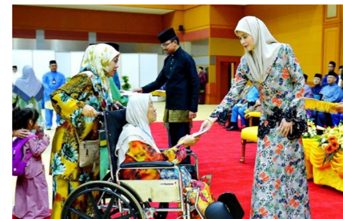
Their Royal Highnesses presenting His Majesty's personal gifts at Dewan Insani, Seria.

Gracing the presentation ceremony as the personal representatives of His Majesty the Sultan and Yang Di-Pertuan of Brunei Darussalam on the 29 th of May were His Majesty's sons and daughters.