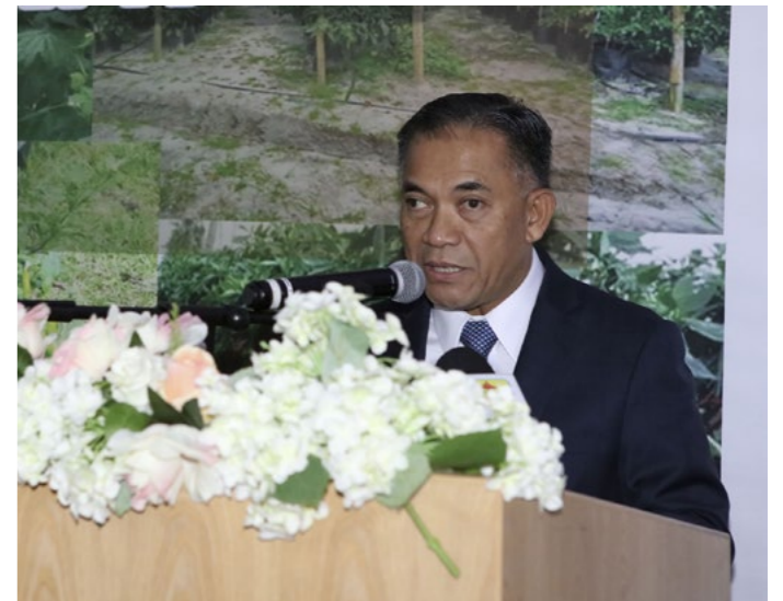
Yang Berhormat Dato Seri Setia Awang Haji Ali bin Haji Apong, Minister of Primary Resources and Tourism delivering his speech during the launching of the Local Crop Production held at Sim Kim Huat (SKH) Supermarket, Annajat Complex in Kampung Mata-Mata.

The Minister further calls for other supermarkets to follow the steps taken by SKH Supermarket, as well as to other farmers to