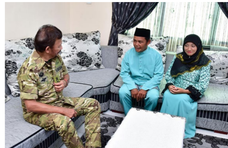
His Majesty during the visit to one of the homes of the house key recipients.