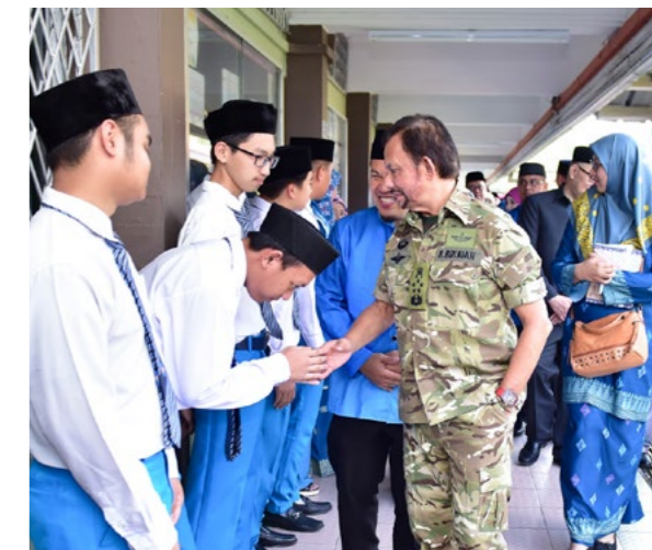
His Majesty receiving a junjung ziarah from students of Muda Hashim Secondary School, Jalan Sungai Besar Tutong.

Across 474 hectares of land, a total of 756 house units were built; 368 cluster houses and 388 terrace houses.