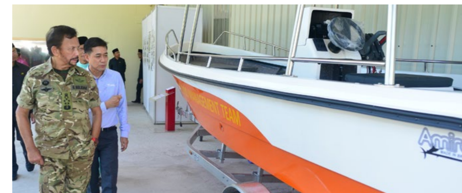
His Majesty during the visit to Perusahaan Seri Melati Sendirian Berhad boat making in Kampung Kuala Tutong.

The national housing scheme is a comprehensive housing development with land areas for future public facilities such as schools, a mosque, parks, recreational areas and playgrounds.