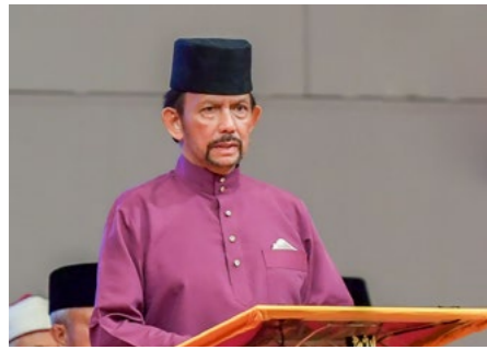
1. Al-Quran, the source of all knowledge