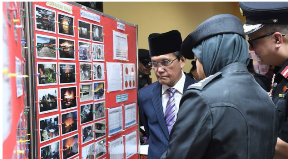
The Minister of Home Affairs viewing the exhibition in conjunction with the event.

"In this regard, we wish to seek cooperation from all parties, especially mukim and village residents to equally monitor and protect firefighting equipments from being damaged. According to Section 13 from Fire Safety Order, 2016, any person who covers, encloses, or conceals any fire-hydrant will be liable to a fine not exceeding $5,000.00 and also be liable to pay for any expenses reasonably incurred in repairing or