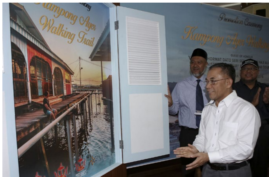
Yang Berhormat Dato Seri Setia Awang Haji Ali bin Haji Apong, Minister of Primary Resources and Tourism officiating the launching of the 'Kampong Ayer Walking Trail' at the Kampong Ayer Cultural and Tourism Gallery.

The Permanent Secretary added that tourists can enjoy interesting views along the routes such as a visit to local cake producers, the Kampong Ayer Police Station and school, and can take a closer look at the traditional lifestyle of the