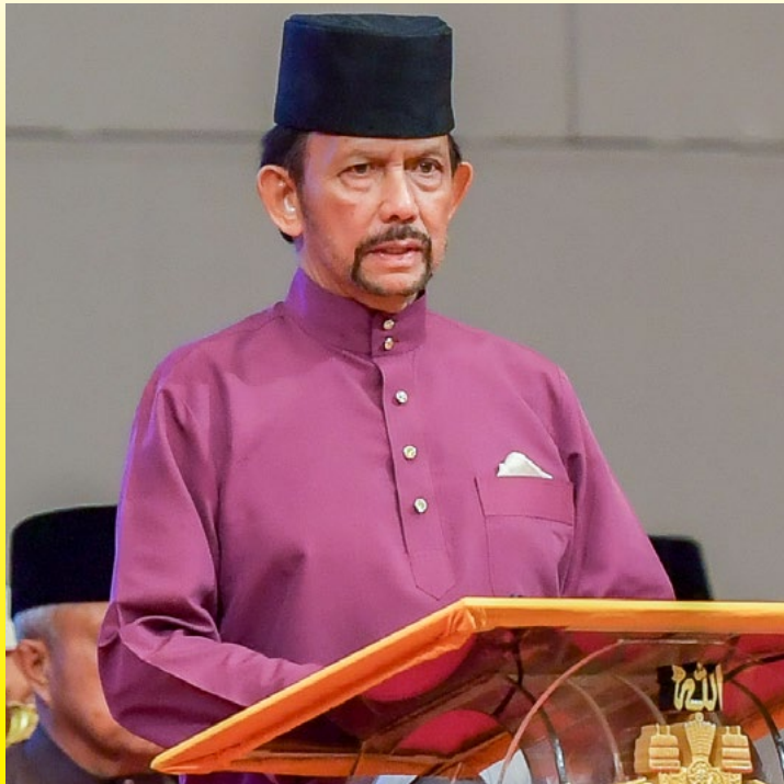
His Majesty Sultan Haji Hassanal Bolkiah Mu'izzaddin Waddaulah ibni Al-Marhum Sultan Haji Omar 'Ali Saifuddien Sa'adul Khairi Waddien, Sultan and Yang Di-Pertuan of Brunei Darussalam delivering a titah (royal speech) during the National Level Nuzul Al-Quran Celebration for 1440 Hijrah/2019 Masihi held at the International Convention Centre in Berakas.

BANDAR SERI BEGAWAN, May 22 – The Al-Quran is a source of guidance for us to gain happiness in the world and the hereafter.