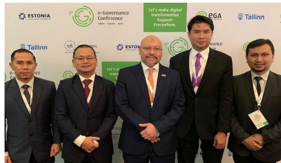
Yang Berhormat Dato Seri Setia Awang Abdul Mutalib bin Pehin Orang Kaya Seri Setia Dato Paduka Haji Mohd Yusof, Minister of Transport and Infocommunications in a group photo during the 5 th e-Governance Conference 2019 in Tallinn, Estonia.

TALLIN, ESTONIA, May 23 – Yang Berhormat Dato Seri Setia Awang Abdul Mutalib bin Pehin Orang Kaya Seri Setia Dato Paduka Haji Mohd Yusof, the Minister of Transport and Infocommunications led a delegation of senior officers from the Ministry of Transport and Infocommunications (MTIC) and IT Protective Security Services (ITPSS) to the 5 th e-Governance Conference 2019 at Tallinn, Estonia, from the 20 th until the 22 nd of May.