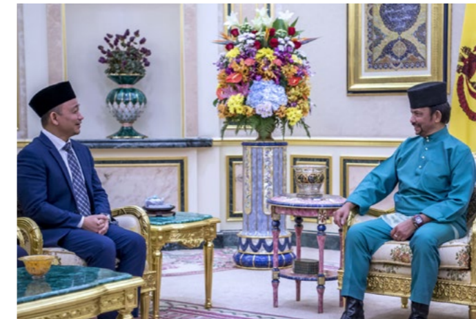
Yang Berhormat Dr. Maszlee bin Malik, Minister of Education of Malaysia on May 4.

His Majesty Sultan Haji Hassanal Bolkiah Mu'izzaddin Waddaulah ibni Al-Marhum Sultan Haji Omar 'Ali Saifuddien Sa'adul Khairi Waddien, Sultan and Yang Di-Pertuan of Brunei Darussalam received in audience at the Istana Nurul Iman from: