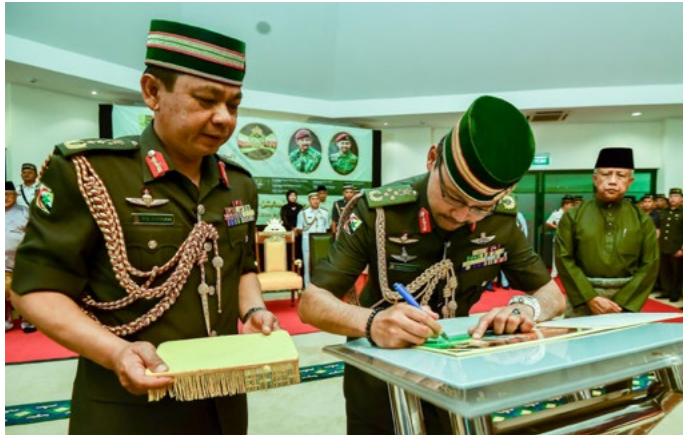
His Royal Highness Prince Haji Al-Muhtadee Billah signing the commemorative parchment.