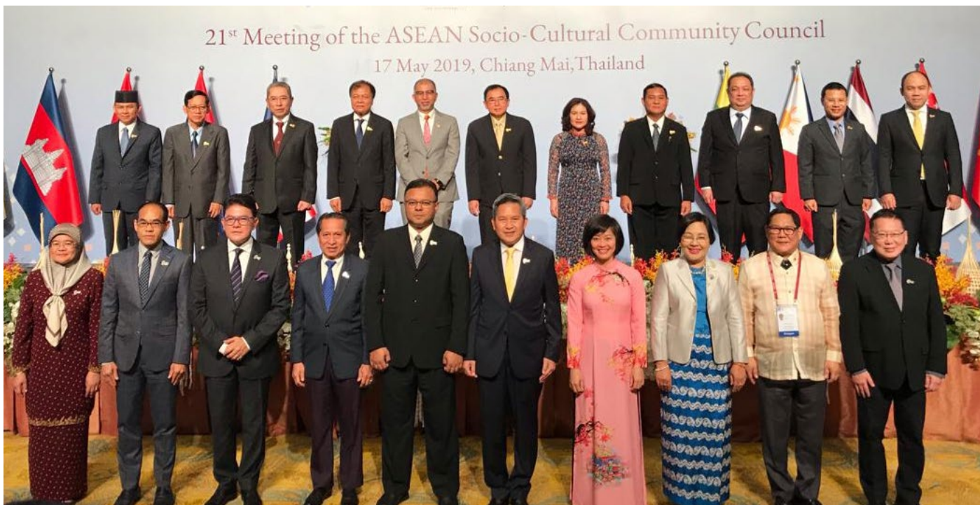
Yang Berhormat Major General (Rtd) Dato Paduka Seri Haji Aminuddin Ihsan bin Pehin Orang Kaya Saiful Mulok Dato Seri Paduka Haji Abidin, Minister of Culture, Youth and Sports of Brunei Darussalam in a group photo during the 21 st ASEAN Socio-Cultural Community Council Meeting.