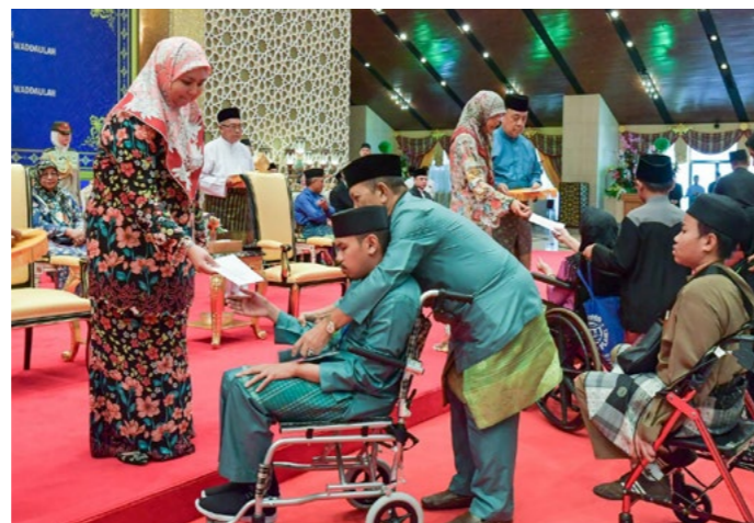
Her Royal Highness Princess Rashidah Sa'adatol Bolkiah binti His Majesty Sultan Haji Hassanal Bolkiah Mu'izzaddin Waddaulah and Her Royal Highness Princess Hajah Majeedah Nuurul Bolkiah binti His Majesty Sultan Haji Hassanal Bolkiah Mu'izzaddin Waddaulah presenting His Majesty's personal gifts at the Reception Hall of Istana Nurul Iman.