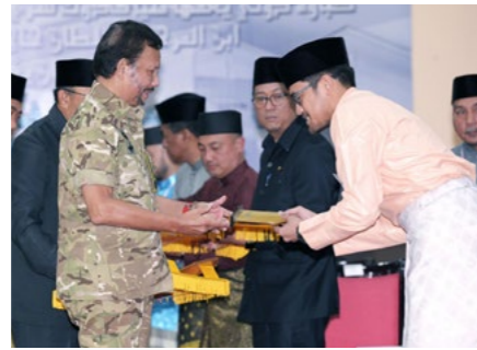
6. His Majesty presents house key plaques