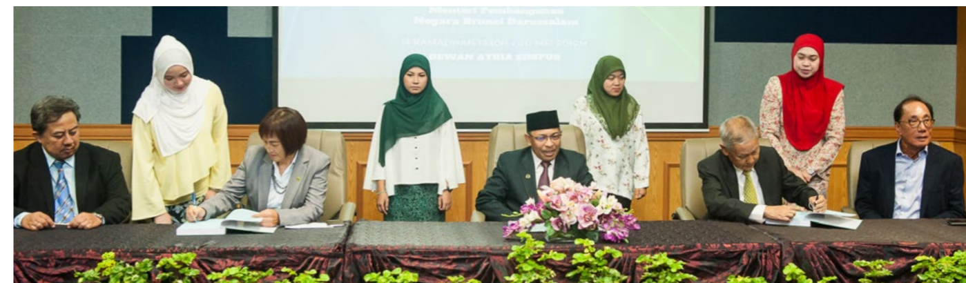
The contract-signing ceremony between the Public Works Department represented by the Director of Drainage and Sewerage and Ocean Quarry and Construction Sendirian Berhad for the Coastal Control project contract along Kampung Danau beach in the Tutong District.