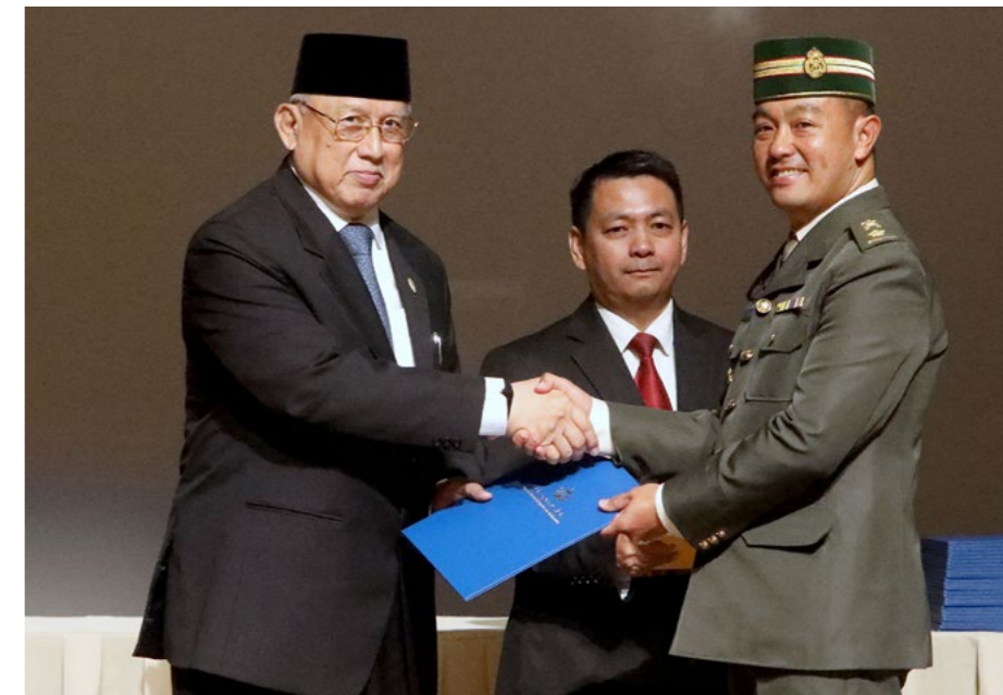
The Minister at the Prime Minister's Office presenting a certificate to one of the participants of the Executive Development Programme for Senior Government Officer (26 th EDPSGO).

is not an easy and light duty. This fact may be considered as frivolous, but this is the reality. Not all officers are capable in leading, although they possess high knowledge and have performed well," said the Minister.