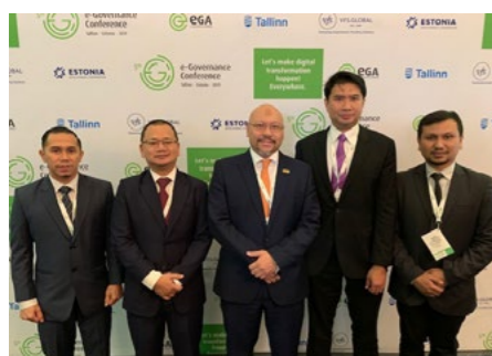
22. Minister attends 5 th e-Governance Conference in Estonia