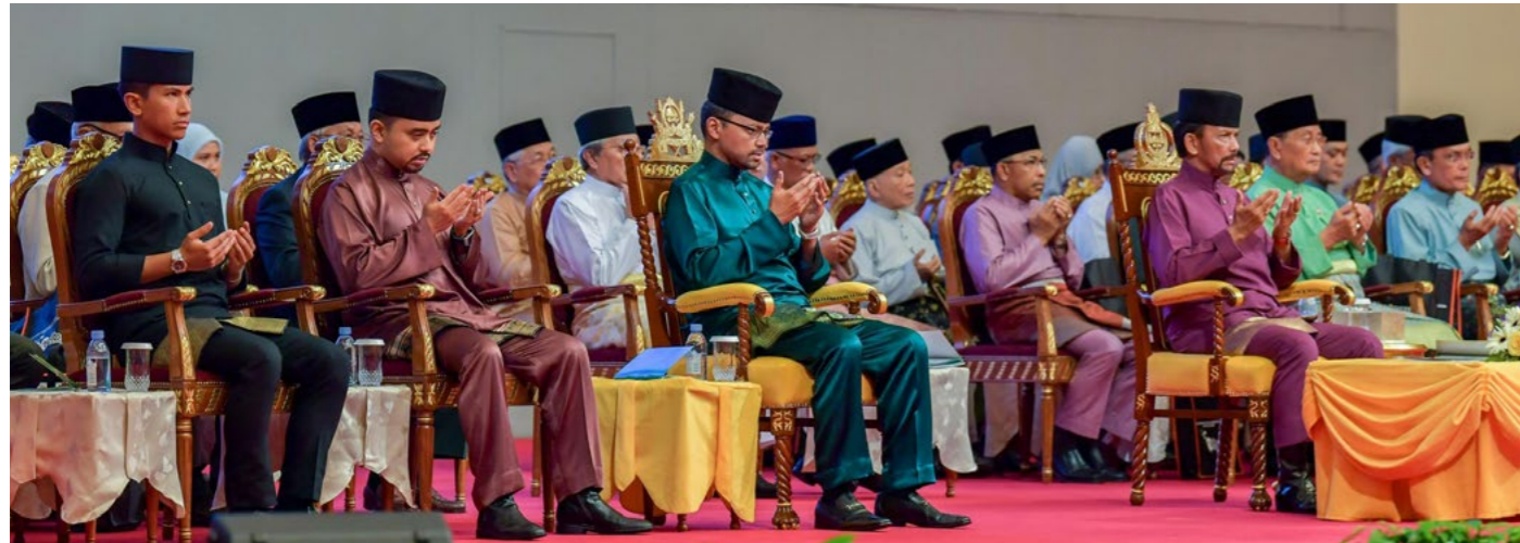
His Majesty Sultan Haji Hassanal Bolkiah Mu'izzaddin Waddaulah ibni Al-Marhum Sultan Haji Omar 'Ali Saifuddien Sa'adul Khairi Waddien, Sultan and Yang Di-Pertuan of Brunei Darussalam; His Royal Highness Prince Haji Al-Muhtadee Billah, the Crown Prince and Senior Minister at the Prime Minister's Office; His Royal Highness Prince 'Abdul Malik; and His Royal Highness Prince 'Abdul Mateen consented to attend the National Level Nuzul Al-Quran Celebration 1440 Hijrah/2019 Masihi held at the International Convention Centre in Berakas.