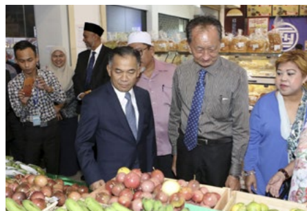
17. Support and buy local produce