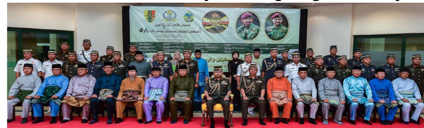
His Royal Highness Prince Haji Al-Muhtadee Billah ibni His Majesty Sultan Haji Hassanal Bolkiah Mu'izzaddin Waddaulah in a group photo.

BANDAR SERI BEGAWAN, May 31 - The Royal Brunei Armed Forces (RBAF) this year celebrates its 58 th year and as the year before, its celebration falls within the holy month of Ramadhan.