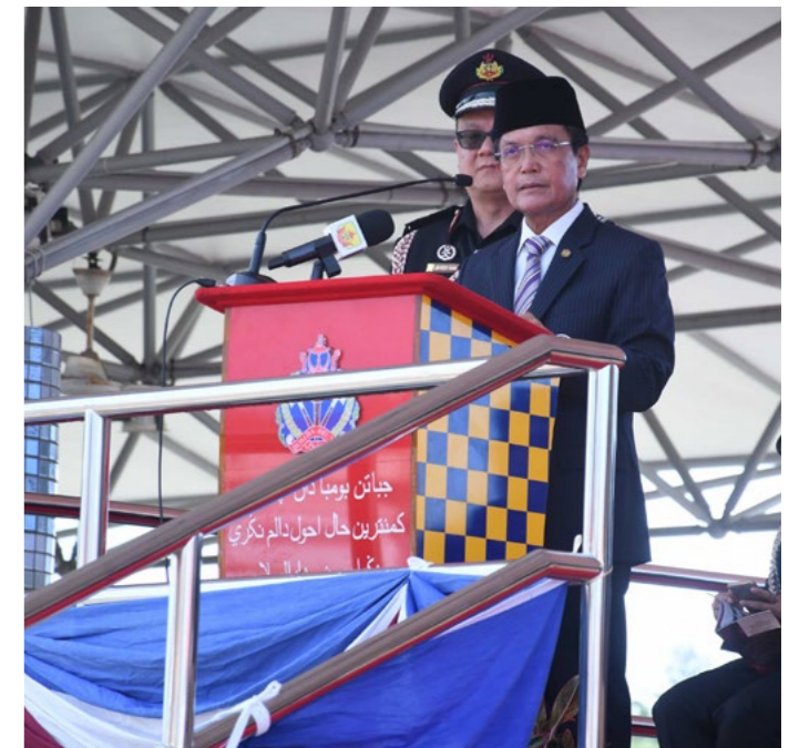
Yang Berhormat Pehin Orang Kaya Seri Kerna Dato Seri Setia (Dr.) Haji Awang Abu Bakar bin Haji Apong, Minister of Home Affairs delivering his speech at the parade in conjunction with the 59 th Anniversary of the Fire and Rescue Department.

Although the FRD managed to extinguish the fire, the fire incidents can still be mitigated, one of which is to create awareness among the public about the dangers of fire which is a very effective early prevention to reduce the rate of fire.