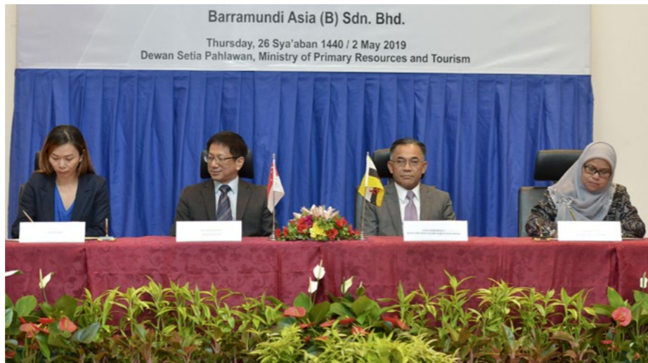
The signing of agreement between the Department of Fisheries, Ministry of Primary Resources and Tourism and Barramundi Asia (B) Sendirian Berhad from the Republic of Singapore witnessed by Yang Berhormat Dato Seri Setia Awang Haji Ali bin Haji Apong, Minister of Primary Resources and Tourism.

At the end of the first phase, the project is expected to produce 4,000 metric tonnes of seabass by 2024.