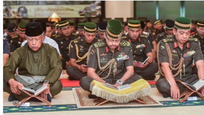
His Royal Highness Prince Haji Al-Muhtadee Billah ibni His Majesty Sultan Haji Hassanal Bolkiah Mu'izzaddin Waddaulah, the Crown Prince and Senior Minister at the Prime Minister's Office, during the thanksgiving ceremony to mark the 58 th Anniversary of the Royal Brunei Armed Forces (RBAF) held at Surau Ad-Difa', Ministry of Defence, Bolkiah Garrison.

Also present was Yang Berhormat Major General (Rtd) Dato Paduka Seri Haji Aminuddin Ihsan bin Pehin Orang Kaya Saiful Mulok Dato Seri Paduka Haji Abidin, Minister of Culture, Youth and Sports; Service Commanders and Joint Force Commander; Deputy Permanent Secretaries; Directors; Commandants; and senior officers of the Ministry of Defence and RBAF; as well as other invited guests which comprising former Deputy Ministers of