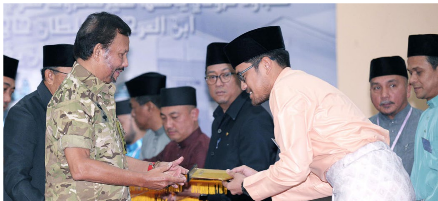
His Majesty Sultan Haji Hassanal Bolkih Mu'izzaddin Waddaulah ibni Al-Marhum Sultan Haji Omar 'Ali Saifuddien Sa'adul Khairi Waddien, Sultan and Yang Di-Pertuan of Brunei Darussalam awarding a house key plaque to one of the recipients under the Bukit Beruang National Housing Scheme of Bukit Beruang, Tutong District.

TUTONG, May 2 – No expressive words can describe the gratitude that was carved in the hearts of every recipient of the keys to the house when now they already have a more comfortable shelter, where it certainly gives a deep meaning to them.