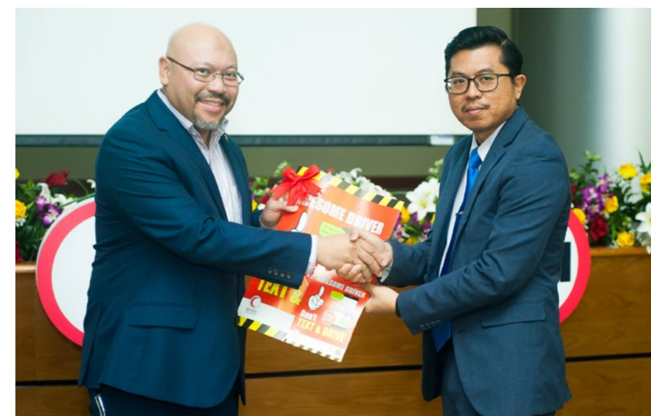
Yang Berhormat Dato Seri Setia Awang Abdul Mutalib bin Pehin Orang Kaya Seri Setia Dato Paduka Haji Mohammad Yusof, Minister of Transport and Infocommunications presenting posters and postcards of the Brunei Darussalam Red Crescent Society Road Safety Campaign 2019 to a representative.