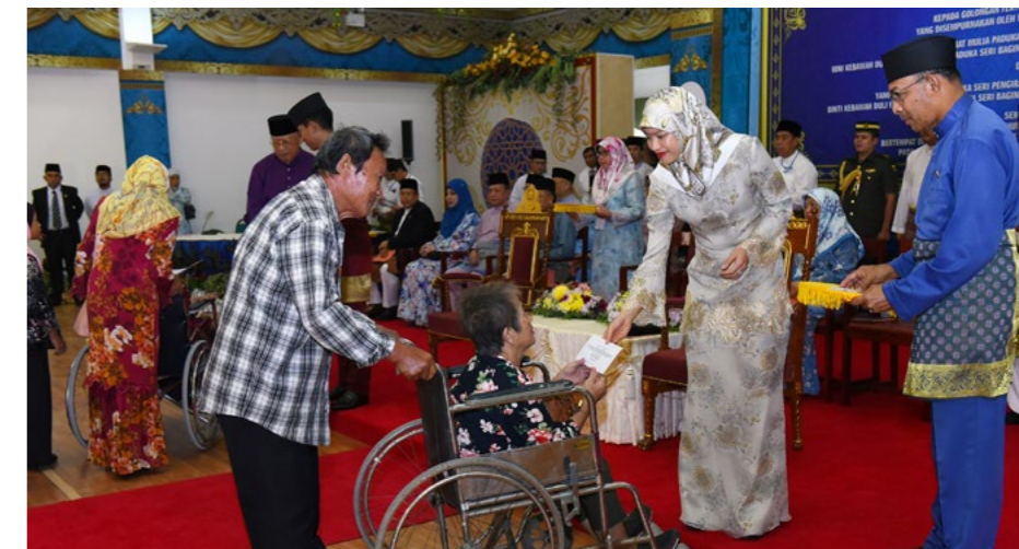
Her Royal Highness Princess Fadzilah Lubabul Bolkiah binti His Majesty Sultan Haji Hassanal Bolkiah Mu'izzaddin Waddaulah presenting His Majesty's personal gifts in the Tutong District.

In another part of Istana Nurul Iman, at Baitur Rahmah, gracing the ceremony as personal representatives of His Majesty the Sultan and Yang Di-Pertuan of Brunei Darussalam were Her Royal Highness Princess Hajah Hafizah Sururul Bolkiah binti His Majesty Sultan Haji Hassanal Bolkiah Mu'izzaddin Waddaulah and