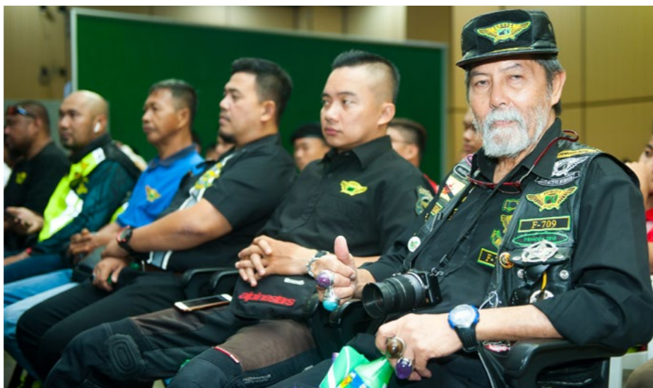
Some of the guests present at the launching of the First Aid Application and Brunei Darussalam Red Crescent Society Road Safety Campaign 2019.

Also present at the event were Permanent Secretaries and Deputy Permanent Secretaries at the Prime Minister's Office, Ministry of Development, Ministry of Home Affairs, MTIC, as well as the Head of Secretariat and members of MKKJR; Head of Departments and Senior Officers of the Ministry of Transport and Infocommunications and other relevant agencies.