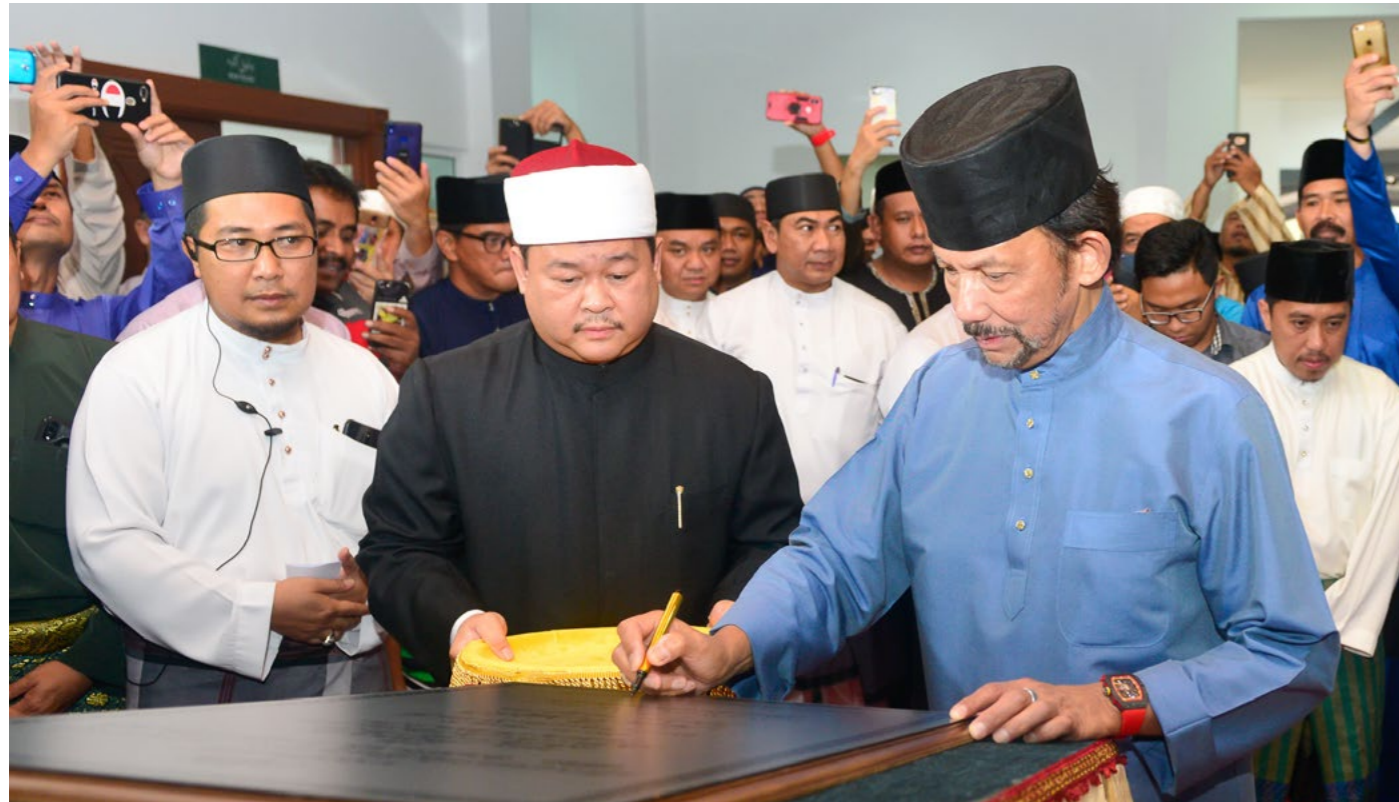
His Majesty Sultan Haji Hassanal Bolkiah Mu'izzaddin Waddaulah ibni Al-Marhum Sultan Haji Omar 'Ali Saifuddien Sa'adul Khairi Waddien, Sultan and Yang Di-Pertuan of Brunei Darussalam signing a plaque marking the opening ceremony of the Ar-Rahim Mosque in Kampung Bukit Panggal.

TUTONG, May 17 - His Majesty Sultan Haji Hassanal Bolkiah Mu'izzaddin Waddaulah ibni Al-Marhum Sultan Haji Omar 'Ali Saifuddien Sa'adul Khairi Waddien, Sultan and Yang Di-Pertuan of Brunei Darussalam consented to perform the first Friday prayer at the newly built Ar-Rahim mosque.