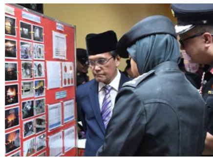
13. Fire and Rescue Department intends to create awareness of fire hazards