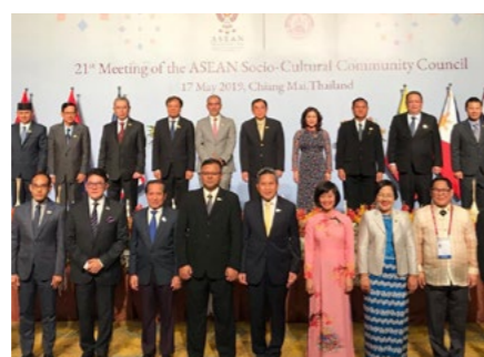
23. 21 st ASEAN Socio-Cultural Community Council Meeting