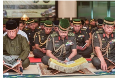
11. The 58 th RBAF Anniversary Thanksgiving Ceremony