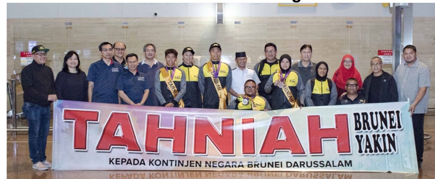
Yang Berhormat Major General (Rtd) Dato Paduka Seri Haji Aminuddin Ihsan bin Pehin Orang Kaya Saiful Mulok Dato Seri Paduka Haji Abidin, Minister of Culture, Youth and Sports in a group photo with the Brunei Darussalam contingent.

BERAKAS, May 1 - The 7-member Brunei Darussalam contingent returned home after competing in the Arafura Games 2019 in Darwin, Australia.