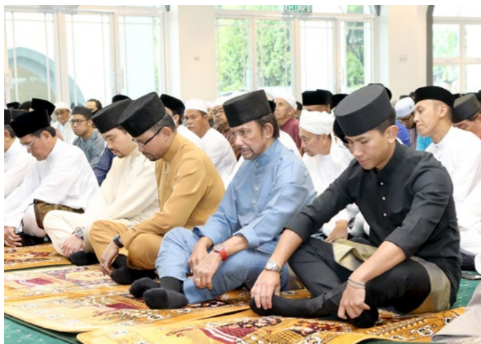
His Majesty, His Royal Highness Prince Haji Al-Muhtadee Billah, the Crown Prince and Senior Minister at the Prime Minister's Office, His Royal Highness Prince 'Abdul Malik and His Royal Highness Prince 'Abdul Mateen at the first Friday prayer performed at Ar-Rahim Mosque, Kampung Bukit Panggal.

Among the facilities provided at Ar-Rahim Mosque are prayer halls for men and women, a lecture hall, a library and info-technology room, an administrative office, a guest room, the Imam and Bilal's office, an ablution area for those with special needs as well as a funeral management room.