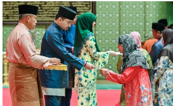
His Royal Highness Prince 'Abdul Malik ibni His Majesty Sultan Haji Hassanal Bolkiah Mu'izzaddin Waddaulah and Yang Amat Mulia Pengiran Anak Isteri Pengiran Raabi'atul 'Adawiyah binti Pengiran Haji Bolkiah presenting His Majesty's personal gifts at Baitur Rahmah, Istana Nurul Iman.