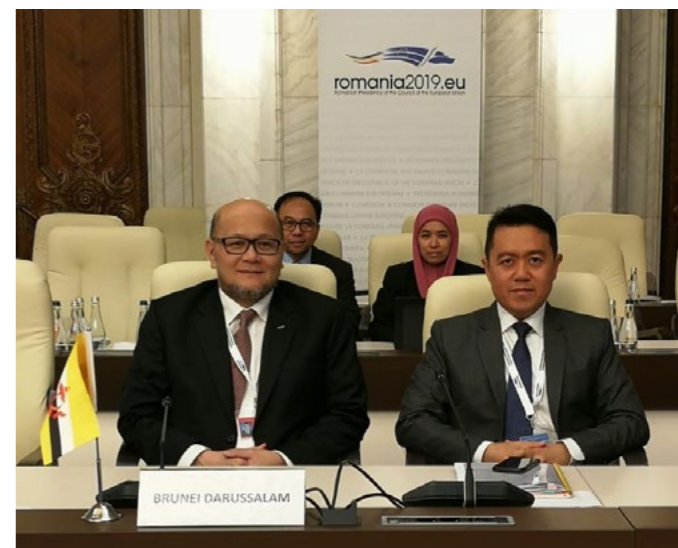
Yang Berhormat Dato Seri Setia Awang Haji Hamzah bin Haji Sulaiman, Minister of Education and delegates at the 7 th Asia-Europe Education Ministers' Meeting (ASEMME7) in Bucharest, Romania.

The two-day meeting began with Plenary Session I on 'Mobility for Everyone: Balanced and Inclusive Mobility in the Digital Era', followed by Plenary Session II with the sub-theme 'Towards