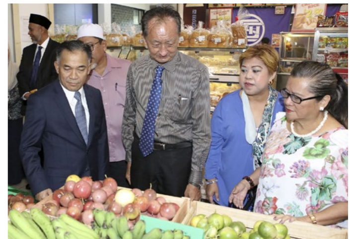
The Minister of Primary Resources and Tourism taking a closer look at the vegetables and fruits sold at Sim Kim Huat Supermarket.

jointly participate in the project to ensure that crop yields can be supplied continuously.