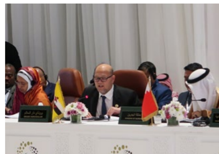
20. Address developmental needs of the Islamic World