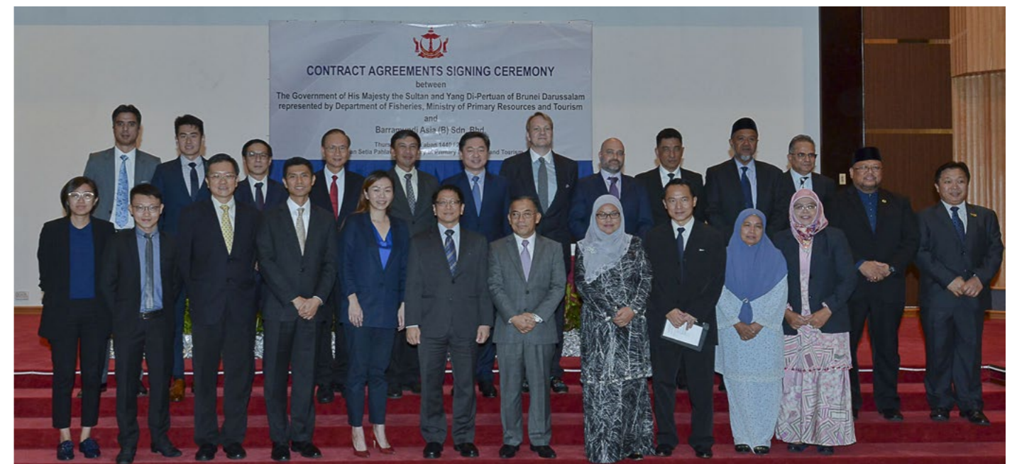
Yang Berhormat Dato Seri Setia Awang Haji Ali bin Apong, Minister of Primary Resources and Tourism in a group photo with officials Republic of Singapore as well as Barramundi Asia (B) Sendirian Berhad.