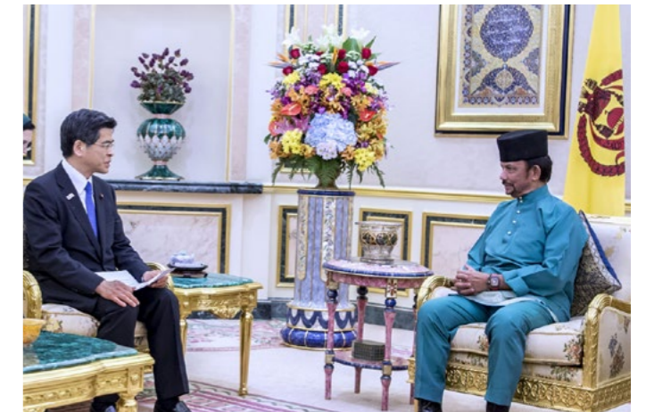
His Excellency Keiichi Ishi, Minister of Land, Infrastructure, Transport and Tourism of Japan on May 4.