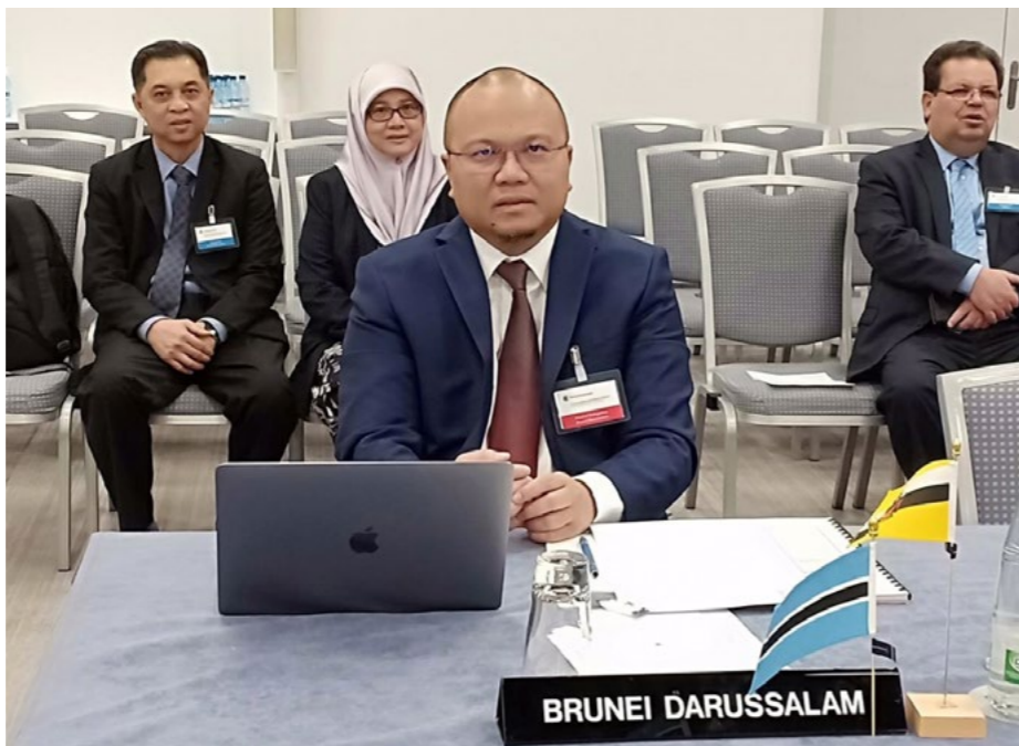
Yang Berhormat Dato Seri Setia Dr. Awang Haji Md. Isham bin Haji Jaafar, Minister of Health during the Commonwealth Health Ministers Meeting 2019 in Geneva, Switzerland.

On the issue of 'harnessing the power of innovation and creativity' on climate change (resilience to communicable diseases and climate change, in the face of Noncommunicable Diseases), the Minister also shared Brunei Darussalam's role in realising the Paris Agreement in addressing climate change where initiatives such as the 'Bandarku Ceria' programme can help reduce carbon emissions by reducing vehicle use, apart from encouraging the increase of physical activities among the society in addressing the problem of non-communicable diseases. These initiatives showed the importance of multi-sectoral collaboration in achieving various targets including addressing the risks of climate change and public health