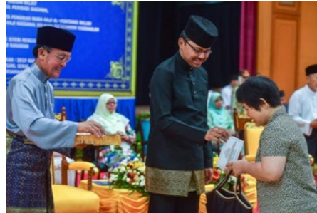
9. His Majesty's personal gifts to lessen the burden of the community in need