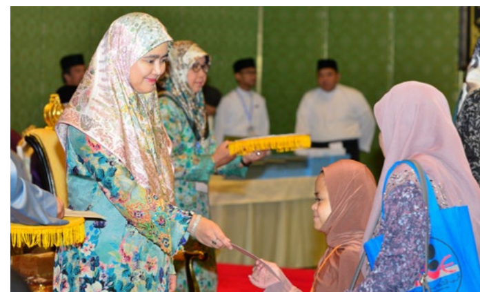
Her Royal Highness Princess Hajah Hafizah Sururul Bolkiah binti His Majesty Sultan Haji Hassanal Bolkiah Mu'izzaddin Waddaulah and Her Royal Highness Princess 'Azemah Ni'matul Bolkiah binti His Majesty Sultan Haji Hassanal Bolkiah Mu'izzaddin Waddaulah presenting His Majesty's personal gifts at Baitur Rahmah, Istana Nurul Iman.

Upon arrival at the Dewan Belalong, Civic Centre Complex in