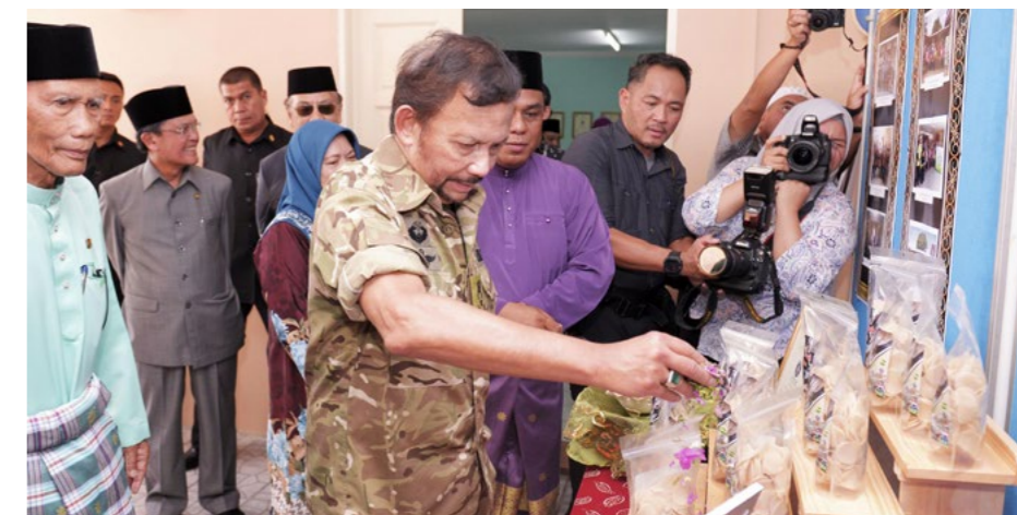
His Majesty taking a closer look at the crackers processed by Syarikat Hairol Aminah in Kampung Penabai, Kuala Tutong.