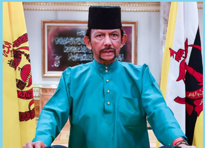
His Majesty Sultan Haji Hassanal Bolkiah Mu'izzaddin Waddaulah ibni Al-Marhum Sultan Haji Omar 'Ali Saifuddien Sa'adul Khairi Waddien, Sultan and Yang Di-Pertuan of Brunei Darussalam delivering a titah (royal speech) in conjunction with the arrival of the month of Ramadhan 1440 Hijrah/2019 Masihi.