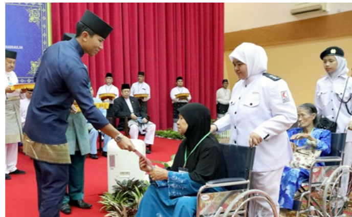
His Royal Highness Prince 'Abdul Mateen ibni His Majesty Sultan Haji Hassanal Bolkiah Mu'izzaddin Waddaulah presenting His Majesty's personal gifts at Dewan Belalong, Civic Centre Complex in the Temburong District.