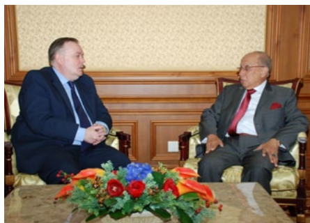
12. LegCo Speaker receives Farewell Visit and Courtesy Visit